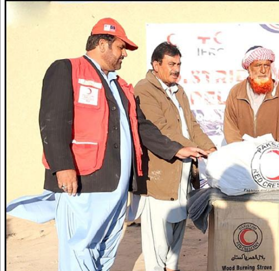
ISLAMABAD: Red Crescent worker busy in distributing winter package among flood victims and needy persons during increasing winter temperature.