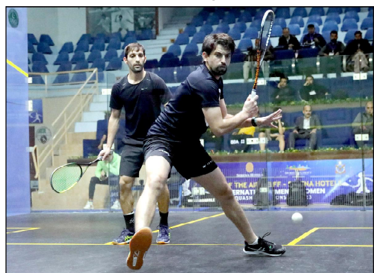
ISLAMABAD: Players in action during CAS-Serena Hotels International Squash Championship for Men & Women organized by Pakistan Squash Federation in collaboration with PAF & Serena Hotels at Mushaf Squash Complex.

Highlighting the importance of his party, Bilawal Bhutto asserted, "It is important for the PPP to form the government in a bid to address all the challenges the country is facing."