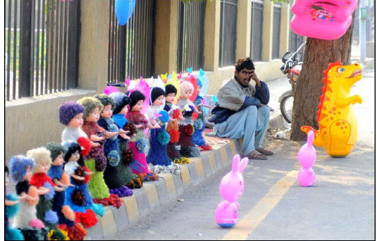
MULIAN: A vendor waiting for customers to sell beautiful dolls at his roadside setup.

Having been doing business with China for almost two decades and visiting the expo eight times, he came over this year to develop new items related to agricultural or auto parts such as filters and bushings. He also met with several Chinese auto companies to discuss potential collaboration, focusing on areas such as parts supply and technology transfer. As an influential global service platform for the automotive industry showcasing automotive parts, repair, testing and diagnostic equipment and service supplies.