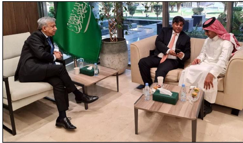
ISLAMABAD: Federal Minister for Commerce and Industries, Dr. Gohar Ejaz, meeting with GCC's Chief Negotiator to finalize the investment-related part of the GCC Free Trade Agreement (FTA).

The investment chapter is an important part of the agreement, and we are confident that we can reach an agreement soon. The GCC FTA is expected to boost trade and investment between Pakistan and the GCC.