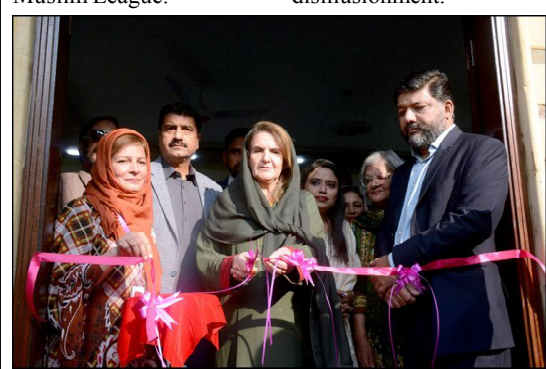
KARACHI: First Lady Samina Arif Alvi cutting ribbon to inaugurate Prof Shahida Kazi Women Complex at Karachi Press Club.

He highlighted that Mian Nawaz Sharif's return is poised to bring about a positive shift in the political landscape, particularly in an environment overshadowed by political disillusionment.