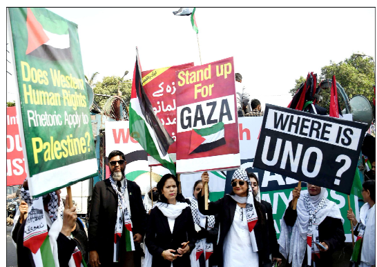
KARACHI: Lawyers hold a protest rally to show solidarity with Palestinians in the Gaza Strip and condemn recent actions by the government of Israel

for students, faculty, and staff that will encourage mutual engagement at all institutional levels. The important areas of collaboration between two educational institutions are diversity and inclusion workshops, collaborative research on minority issues, student exchange programmes, joint community outreach programs, and networking events for minority academic professionals, according to the press release.