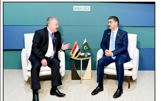
DUBAI: Caretaker Prime Minister Anwaar-ul-Haq Kakar meets with the Prime Minister of Syria Mr. Hussein Arnous on sidelines of high level segment.

A security official told APP on Saturday that the terrorist has made important revelations and on his confessions, a huge cache of explosives used in detonators, explosive materials and arms was recovered from Khyber. The TTP terrorists were planning terrorist attacks in Peshawar that was foiled after the successful operation.