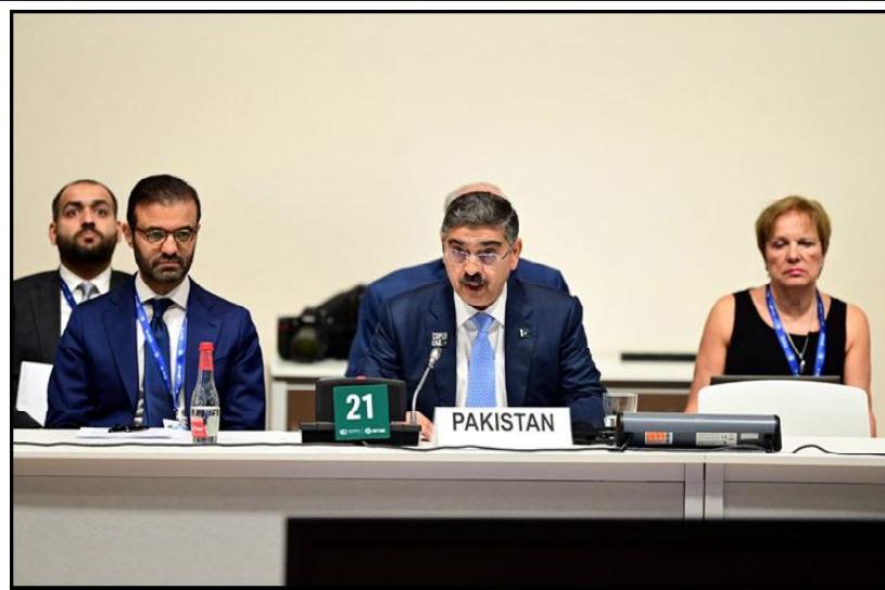
DUBAI: Caretaker Prime Minister Anwaar-ul-Haq Kakar participates in the Global Stock Take Event on Means of Implementation.

The Governor was speaking to the participants of public peace Jirga in Huramzai Syedan, Pishin district on Saturday.