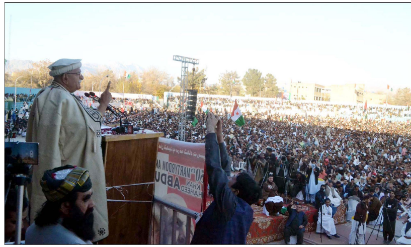
QUETTA: Pakhtunkhwa Milli Awami Party (PkMAP) Chief, Mehmood Khan Achakzai addresses a public gathering on the occasion of 50th death anniversary of the Shaheed Abdul Samad Khan Achakzai at Ayub Stadium