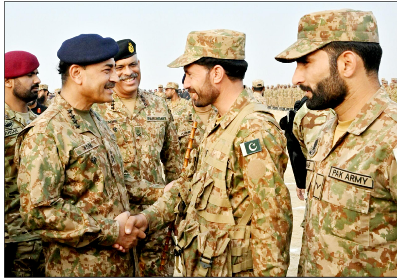
Chief of the Army Staff General Syed Asim Munir interacting with troops during his visit to Khairpur Tamewali (KPT) to witness Field Exercise of Bahawalpur Corps