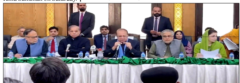
LAHORE: PML (N) Quaid Muhammad Nawaz Sharif addressing meeting of Parliamentary Board. Shahbaz Sharif, Maryam Nawaz, Ishaq Dar and Ahsan Iqbal are also present