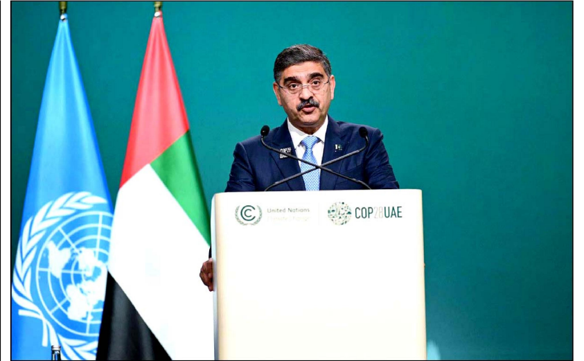
DUBAI: Caretaker Prime Minister Anwaar-ul-Haq Kakar makes a National Statement at the World Climate Action Summit/COP28.