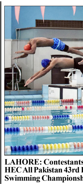
LAHORE: Contestants are in action in Swimming Championships during HEC All Pakistan 43rd Boys and 12th Girls Quad-e-Azam Trophy Inter City Swimming Championship at Nishtar Park in Provincial Capital

He said "We have all come here with one aim ensuring that the planet remains liveable for our children and children's children". "Our assembly here recognizes the acuteness of challenges faced in the realm of climate extremes.