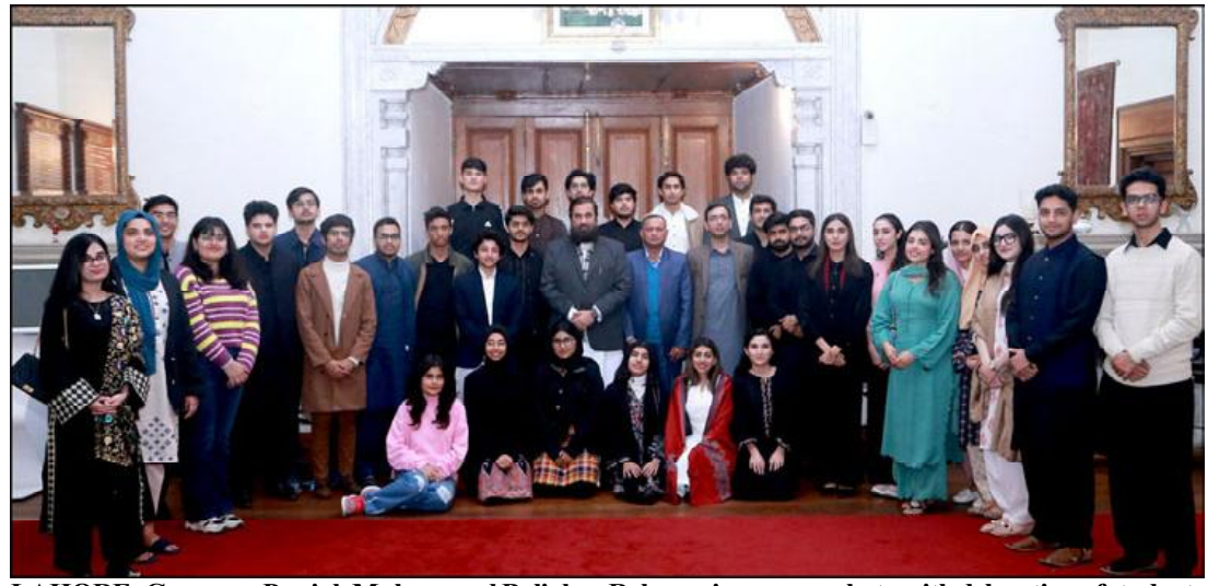
LAHORE: Governor Punjab Muhammad Balighur Rehman in a group photo with delegation of students from LUMS at Governor House.