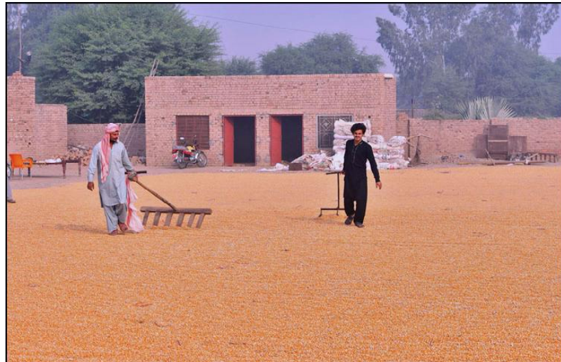
MULTAN: Laborers are busy in spreading corn seeds for drying purposes at their Workplace.

Corporation or its registered dealers. Seeds should undergo anti-fungus treatment before sowing. Farmers should also sow at least two lines of canola per acre as it will save their wheat crop from Aphid and would also improve edible oil production. Two bags of Urea, two bags of DAP, a bag of SOP/MOP per acre be applied in weak fertile land. The combination of fertilizers should be 1.5 bags of DAP, 1.75 bags of Urea and one bag of SOP/MOP in medium fertile land while fertile land should get 1.25 bags of DAP, 1.5 bags of Urea and a bag of SOP/MOP.