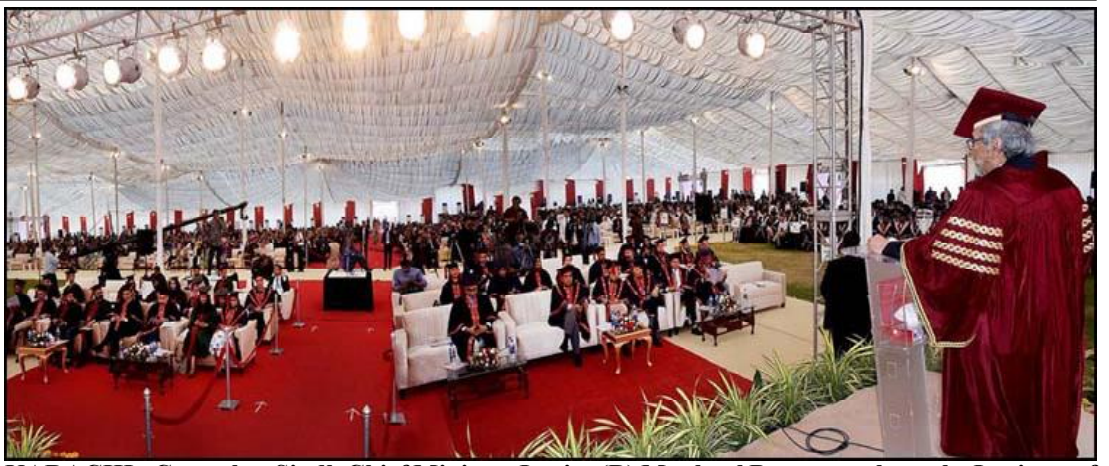
KARACHI: Caretaker Sindh Chief Minister Justice (R) Maqbool Baqar speaks at the Institute of Business Administration (IBA) Convocation.