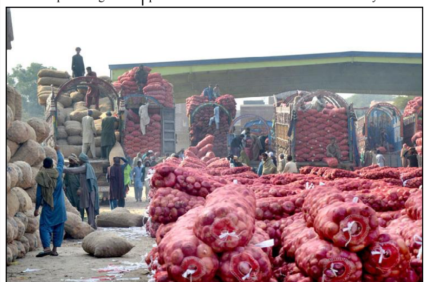
MULTAN: A large number of laborers are busy unloading onions on the delivery truck at the vegetable Market.

He said that the government is determined to eradicate fake medicines from the country.