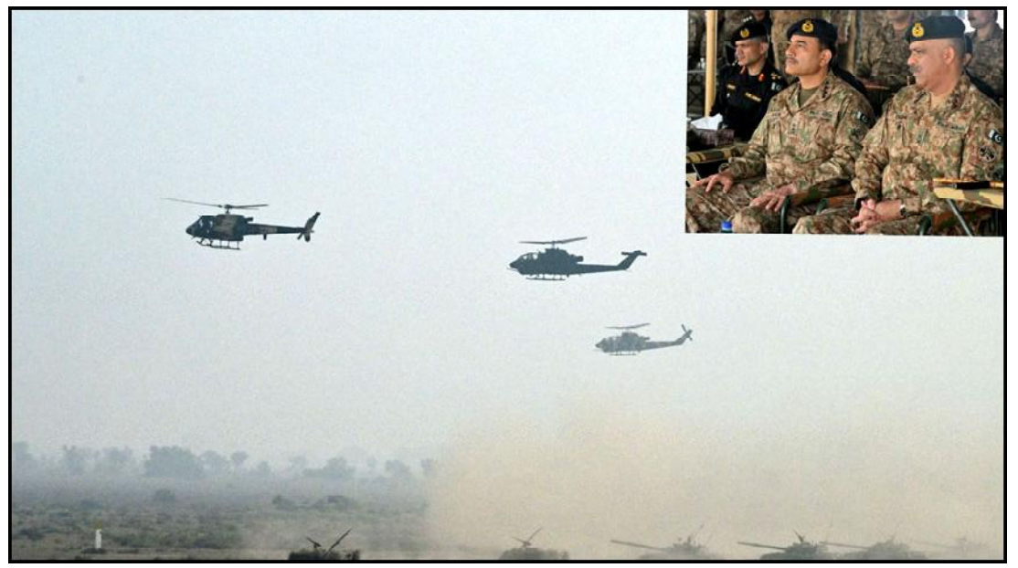
Chief of the Army Staff General Syed Asim Munir witnessing integrated fire and battle manoeuvres of various elements at Khairpur Tamewali during field exercise of Bahawalpur Corps

"There were cases wherein people left their homes after a domestic dispute, and it transpired weeks later that they had left home themselves." He also noted instances where individuals lost their lives in "encounters" with security forces. Minister added, "Then there are cases in which suspects are absconders required by a court, and their families submit pleas claiming their family member as missing to avoid court [action]." He remarked that such cases had been reported and documented.