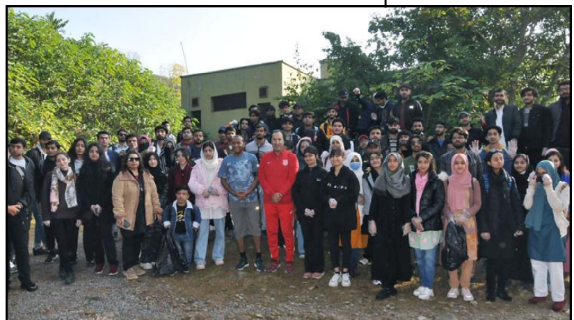
ISLAMABAD: Participants in a group photo during Biodiversity walk at Margalla Hills Trail-5 organized by the Devcom-Pakistan in connection with the 13th Pakistan Mountain Festival, over 100 university students and citizens take part in the activity.

ISLAMABAD (APP): International Day for the Abolition of Slavery is being observed today. This year's theme for the day is 'Fighting slavery's legacy of racism through transformative education'. The focus of this day is on eradicating contemporary forms of slavery, such as trafficking in persons, sexual exploitation, the worst forms of child labour, forced marriage, and the forced recruitment of children for use in armed conflict. The International Day for the Abolition of Slavery, observed annually on December 2nd, marks a significant moment in global history. It is a day dedicated to remembering and acknowledging the brutal history of slavery and the ongoing impacts of its legacy.