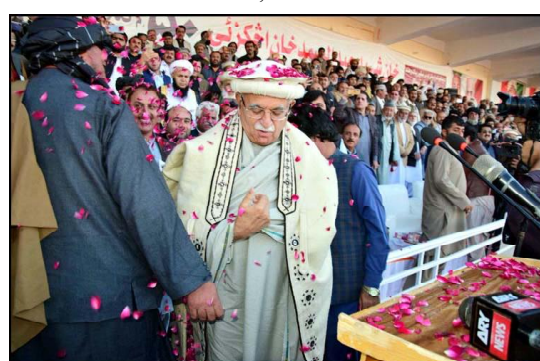
QUETTA: PMAP Chief, Mehmood Khan Achakzai warmly welcome by his supporters upon his arrival for attend public gathering meeting on the occasion of 50th death anniversary of the Shaheed Abdul Samad Khan Achakzai.