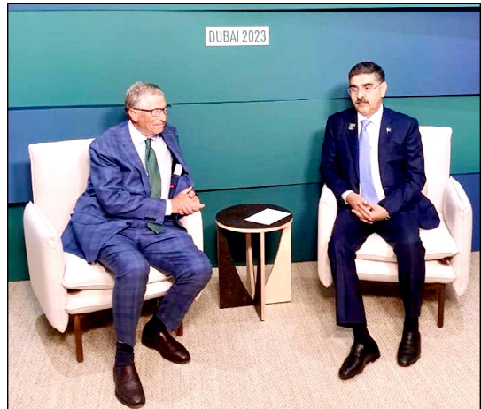
DUBAI: Caretaker Prime Minister Anwaar-ul-Haq Kakar meets with the Co-Chair of Bill and Melinda Gates Foundation Bill Gates on the sidelines of the high level segment of COP 28

sights on durable peace in the Middle East, the press release said. The Pakistani envoy also briefed Congressman Schneider on the phased repatriation of illegal foreigners from Pakistan. "Ways to address climate change and the issue of unregulated migration also came under discussion," it was pointed out. Meanwhile, a senior US State Department official will leave for Islamabad next week to discuss with Pakistani officials migration issues