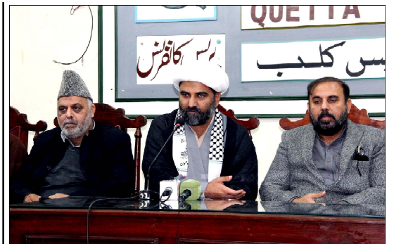
QUETTA: Majlis Wahdat-ul-Muslimeen (MWM) Leader, Allama Maqsood Domki addresses to media persons during press conference, at Quetta press club