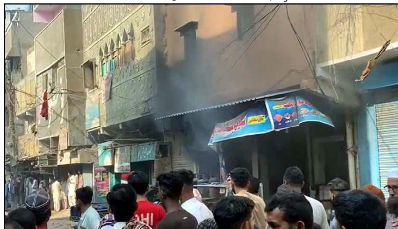
KARACHI: View of damages after gas cylinder blast occurred at gas cylinder filling shop while rescue operation and investigation is underway, at Keamari KPT Gate No 15 nearby Khushboo Center in Karachi.