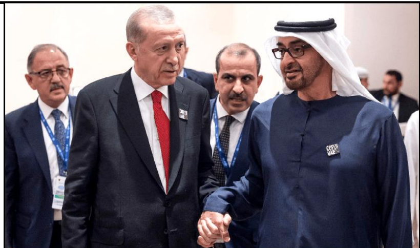
President of the United Arab Emirates Sheikh Mohamed bin Zayed Al Nahyan meeting with President of Turkey Recep Tayyip Erdogan on the sidelines of the COP28 Summit at Dubai's Expo City

Monitoring Desk DUBAI: Two Iranian Revolutionary Guards members who served as military advisers in Syria have been killed in an Israeli attack, Iranian state media reported on Saturday, in the first reported Iranian casualties during the ongoing war in Gaza. A Revolutionary Guards statement did not give details of the attack. Syria earlier said its air defenses repelled an Israeli rocket attack against targets in the vicinity of Damascus early on Saturday.