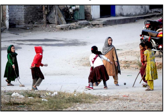
ISLAMABAD: Children enjoying play in a street at the slum area of F-7.