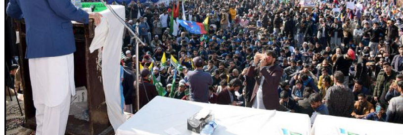
MUZAFFRABAD: Chief of Jamaat e Islami Sirajul Haq addressing to protesters during a march to express their solidarity with Palestinians, in the city.

The First Youth Festival started off on November under the auspices of the Sports and Culture Department in order to engage the youth in different sports and other healthy activities to enable them to play role in the development of the country. The purpose of the Youth Festival is to improve the skills of the youth of Balochistan and to engage the young folk in positive activities.