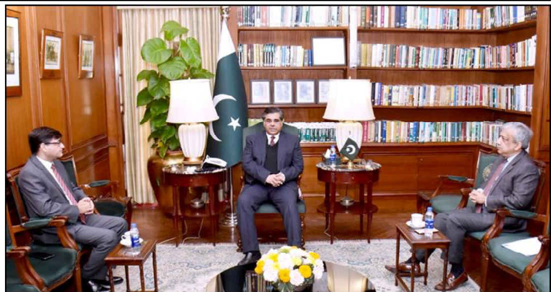
KARACHI: Deputy Governor SBP calls on Caretaker Federal Minister for Commerce and Industries & Production Dr. Gohar Ejaz at Governor House.

Pakistan Act, 1956 which requires the governor to submit to the Parliament an annual report regarding the Bank's objectives, the conduct of monetary policy, the state of the economy and the financial system. The GAR stated that fiscal year 2023 was extraordinarily challenging, with a host of external and domestic shocks, amplified by lingering structural weaknesses.