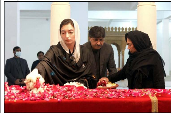
GARHI KHUDBUX: Peoples Party (PPP) Leader, Aseefa Bhutto Zardari is laying floral wreaths and offers Fateha for the peace of departed soul of the PPP Founder, Zulfiqar Ali Bhutto and Benazir Bhutto, at Bhutto Mausoleums in Garhi Khuda Bux.