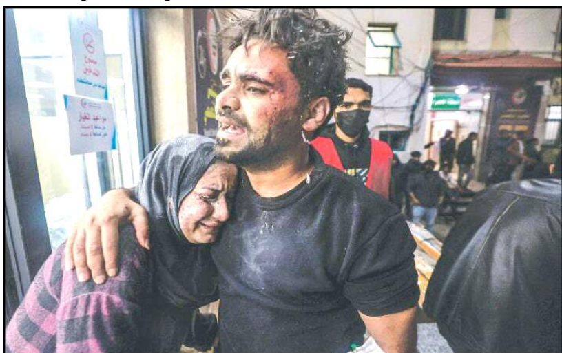
RAFAH: An injured Palestinian man comforts a relative outside the Kuwait hospital, in the southern Gaza Strip, following an Israeli army strike that left at least 20 dead and 55 wounded