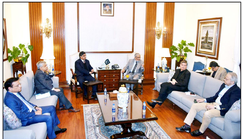
KARACHI: Caretaker Sindh Chief Minister Justice (Retd) Maqbool Bqar meets with Federal Minister for Commerce, Production & Board of Investment Mr Gohar Ejaz Khan at the CM House.

The minister said our younger generation must follow the thoughts of Quaid-e-Azam, in which he has addressed poverty, hunger, education, health and social issues. He maintained that whatsoever our youth play their role in society, that must be co-related to the thoughts of Quaid-e-Azam Mohammad Ali Jinnah because he guided us in every sphere of life.