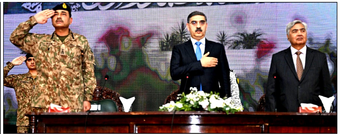
ISLAMABAD: Caretaker Prime Minister Anwaar-ul-Haq Kakar and Chief of the Army Staff, Syed Asim Munir participating in the National Farmer's Convention

The Army Chief added that the aim of the Green Pakistan Initiative was to work on agriculture first on a priority basis. Agriculture would be organized in all districts where all kinds of agricultural facilities would be available to the farmers, the COAS said.