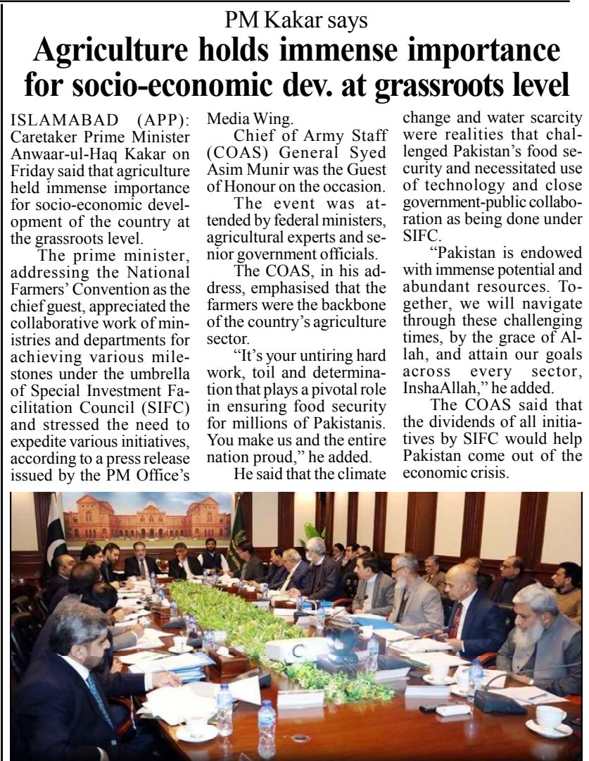
RAWALPINDI: Inter Ministerial Committee on AJ&K being chaired by Minister for Defence, Lt. Gen (Retd) Anwar Ali Hyder co-chaired by Prime Minister Azad Jammu and Kashmir (AJK), Chaudhary Anwar-ul-Haq held at Ministry of Defence in Rawalpindi.

The COAS said that the dividends of all initiatives by SIFC would help Pakistan come out of the economic crisis.