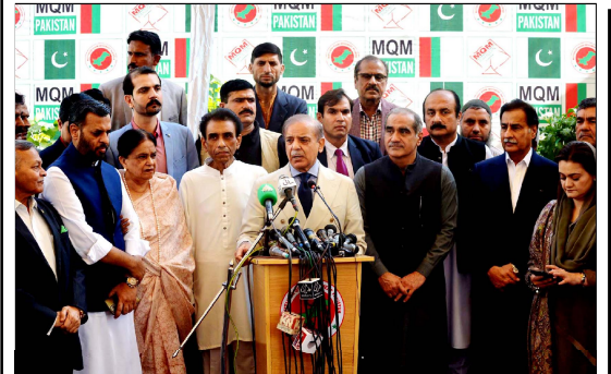
KARACHI: Former Prime Minister and Muslim League (PML-N) President, Shehbaz Sharif along with Khalid Maqbool Siddiqui, Convener Muttahida Quami Movement (MQM-P) talking to media persons at MQM-P Bahadurabad Head Office

The CM was told that the Industrial Park at Steel Mill would create more than one million direct and indirect job opportunities apart from giving a boost to the export of finished goods.