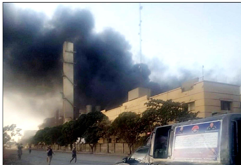
KARACHI: Huge smoke and fire flames rising from burning Agha Steel Mills after fire eruption incident, as rescue operation is underway, at Bin Qasim Town in Karachi