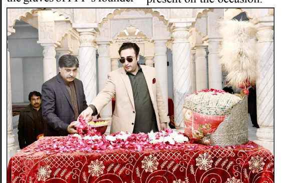
LARKANA: Chairman PPP Bilawal Bhutto Zardari showering flowers at the grave of Shaheed Zulfiqar Ali Bhutto at Garhi Khuda Bakhsh.

He also laid wreaths at the graves of PPP's founder