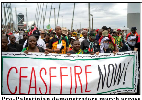
Pro-Palestinian demonstrators march across the Mandela Bridge downtown Johannesburg, South Africa.