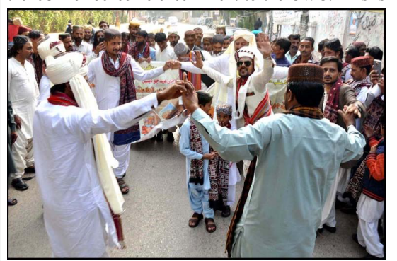
HYDERABAD: Members of All Thar Labors Workers Ittehad Sindh are holding rally in connection of Sindhi Cultural Day, at Hyderabad press club.