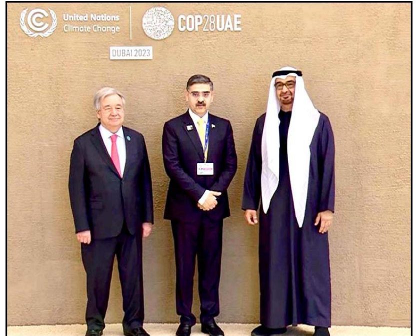
DUBAI: Caretaker Prime Minister Anwaar-ul-Haq Kakar is being received by the President of the United Arab Emirates His Highness Sheikh Mohamed bin Zayed Al Nahyan and the Secretary General of the United Nations, Antonio Guterres on his arrival at Dubai Expo City to attend the High Level Segment of United Nations' 28th Conference of Parties.

"We are being told that the one who became the prime minister for three times, now he will become the prime minister for the fourth time and after that he will get the country out of trouble. (And) the other person is the one who was the prime minister a few years ago, who had said that the protesting Hazara community in Balochistan were blackmailers, and who, being prime minister, considered the issue of missing persons unimportant, and liked to call himself a youth leader despite being 70 years old."