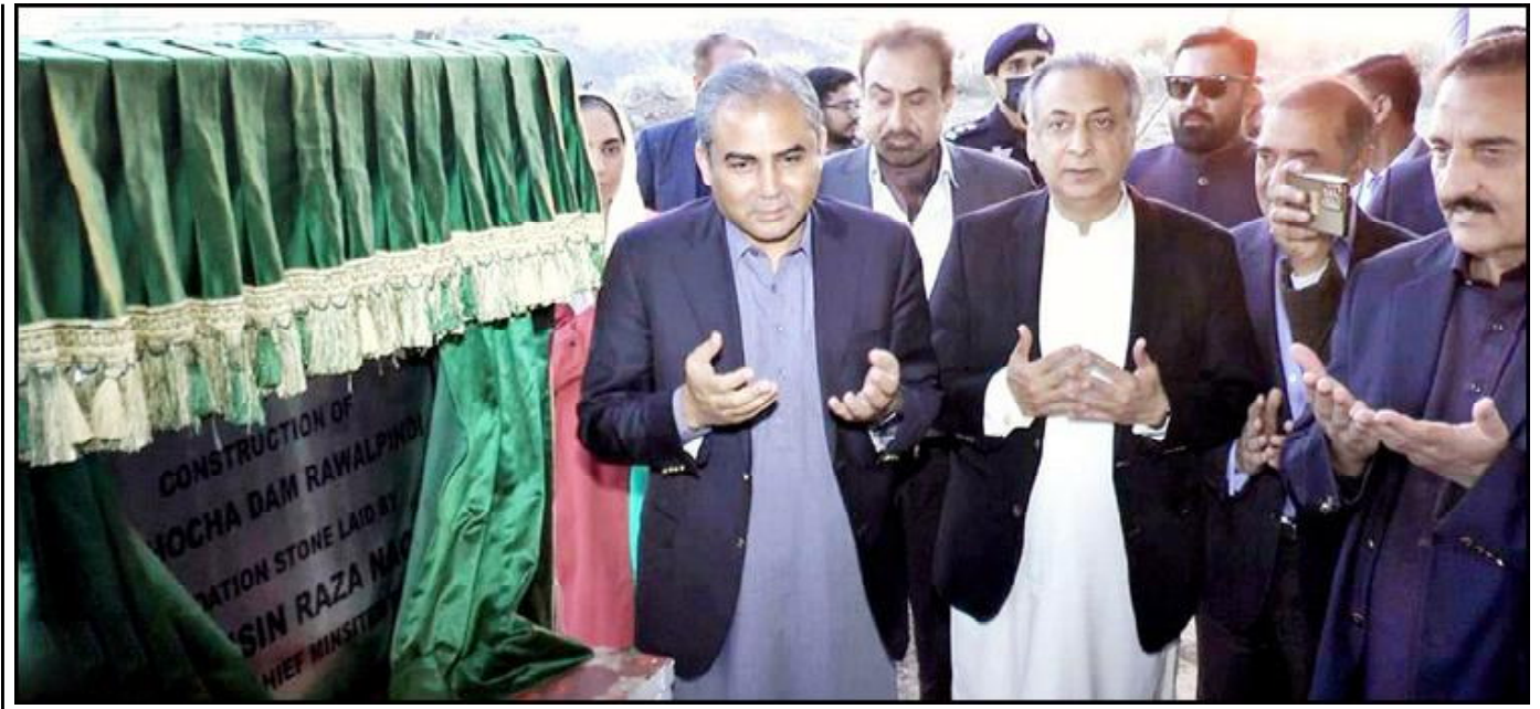
RAWALPINDI: Caretaker Chief Minister Punjab Mohsin Naqvi offering Dua after inaugurating Dadocha Dam.

project would also complete the dam swiftly, the CM informed. The dam project was pending for a long time, the CM said and informed that the preparations were being made in Murree for the winter season. Solid steps would be taken to increase tourism, said Mohsin Naqvi. Special operation against illegal housing societies had been launched, he informed. The CM said, "Upgradation work of the hospitals would continue and we will not allow anyone to obstruct this project." During a briefing, the CM was informed that work on the dam site was progressing rapidly, with 26% financial progress and 12% physical progress.