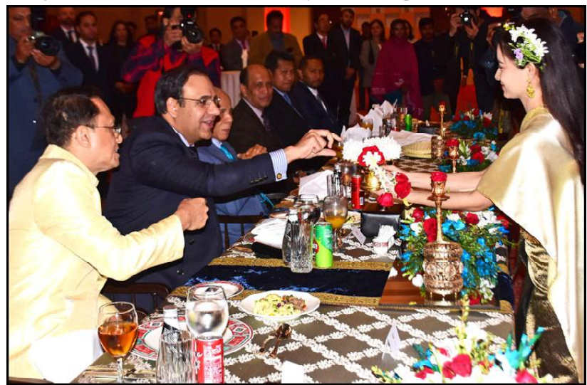
ISLAMABAD: A Thai girl presenting flowers to Caretaker Federal Minister for Information Technology and Telecommunication Dr. Umar Saif during National Day of Thailand ceremony at a local hotel in Federal Capital.