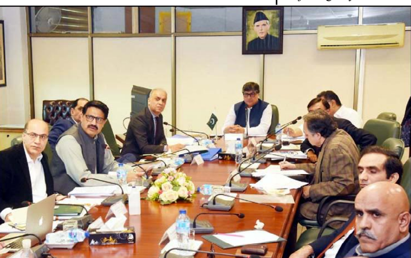
ISLAMABAD: Federal Minister for Privatisation, Fawad Hasan Fawad chairing a meeting of Privatisation Commission Board, in Islamabad.

In a tweet, the Minister of Science and Technology, Dr. Umar Saif said, "At the final stages of establishing Pakistan Advanced Research Project Agency.