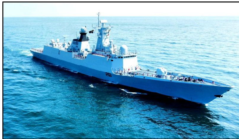
ISLAMABAD: Amidst the prevailing maritime situation in the Middle East, Pakistan Navy has deployed PNS TUGHRIL to ensure safety and security of merchant ships carrying shipments to and from Pakistani ports passing through one of the world's busiest choke points.