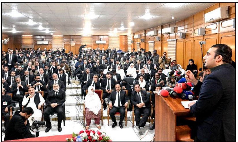
QUETTA: Chairman Pakistan People's Party Bilawal Bhutto Zardari addressing to Baluchistan High Court Bar Association.