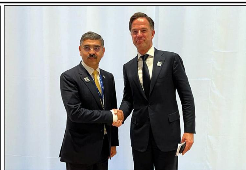
DUBAI: Caretaker Prime Minister Anwaar-ul-Haq Kakar meets the Prime Minister of Netherlands Mr. Mark Rutte on the sidelines of the high level segment of the UN's 28th Conference of Parties.

The prime minister highlighted the importance of concrete outcome on climate action and referred to Pakistan's climate vulnerabilities despite being one of the lowest carbons emitters.