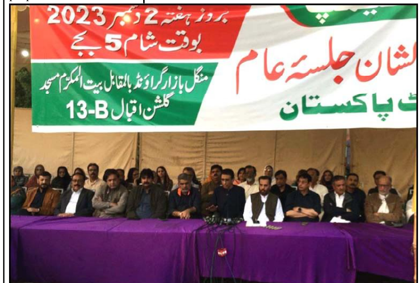
KARACHI: Muttahida Qaumi Movement (MQM-P) Convener, Khalid Maqbool Siddiqui addresses to media persons during press conference regarding public gathering meeting, at Gulshan-e-Iqbal in Karachi.

of Sindh Government to showcase the work of rural artisans with 308 Business Development Groups representing 6005 artisans of 12 districts and over 5729 products displaying and marketing their hand-made crafts including Plazo, Shalwar, Garara, Trouser, Shawl, Dupatta, Stoles, Waistcoat, date Leaf, Wheat Straw, Khussa, Moora, Straw and Rillis. bed sheets and cushions. The first day of the exhibition received an overwhelming response from local and international visitors. It's mentioned over here that the Sartyoon Sang Craft Exhibition has been organized by SRSO for the last thirteen years with the motive to support ethical fashion and promote the crafts of some of the most marginalized women in the province. The event also attracted large numbers of women residents of Clifton and nearby areas. The exhibition showcases a wide array of Sindh's handicrafts made by rural women including home textiles, basketry, jewellery, dresses, dupattas and shawls, embellished with traditional embroidery and cutwork.