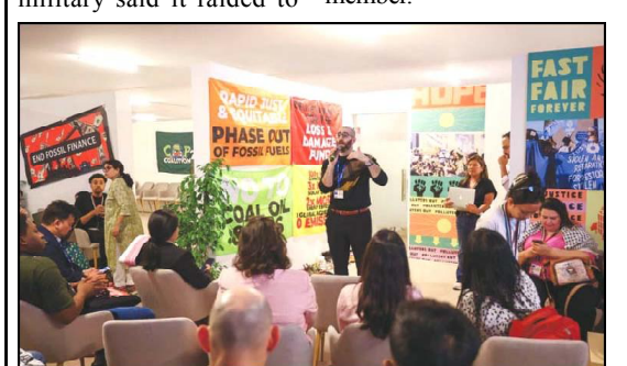
Pro-Palestinian environmental activists participate in a sit-in demonstration at the Expo City in Dubai in support of a ceasefire in Gaza.

detain a Palestinian wanted for alleged involvement in a lethal West Bank ambush in August as well as 20 other suspects. During the raid, Israeli forces "engaged with armed terrorists and killed five of them", the military said in a statement. The Jenin Brigades, a local armed group, said its fighters battled the Israeli troops. It did not immediately provide details on any casualties, but local witnesses said at least one of the Palestinians killed in Jenin was a known Brigades member.