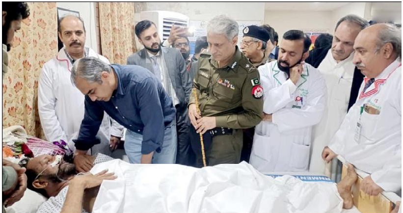
RAHIM YAR KHAN: Punjab Chief Minister Mohsin Naqvi enquiring about health injured Constable at Sheikh Sheikh Zayed Hospital.