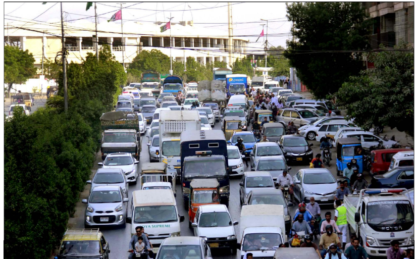
KARACHI: A large number of vehicles stuck in traffic jam due to negligence of traffic police staffs and illegal parking, at Stadium road in Karachi