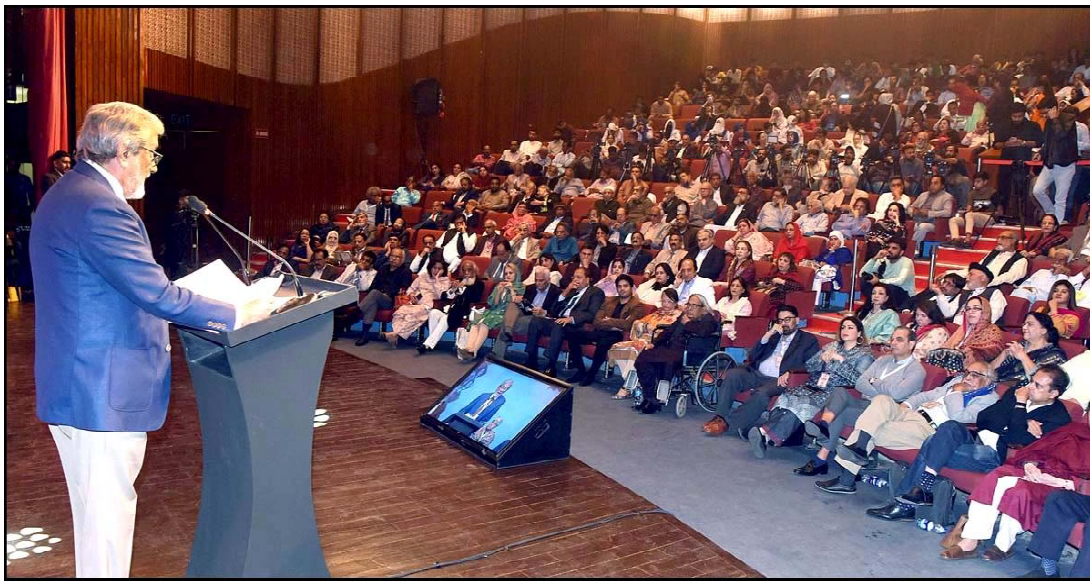
KARACHI: Caretaker Sindh Chief Minister Justice (R) Maqbool Baqar speaks at the International Urdu Conference at the Arts Council of Pakistan