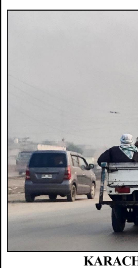
KARACHI: A view of smog in provincial capital