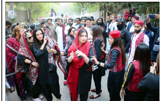
HYDERABAD: People are wearing traditional clothes as they are holding celebration rally on the eve of Sindhi Cultural Day, at Qasimabad in Hyderabad