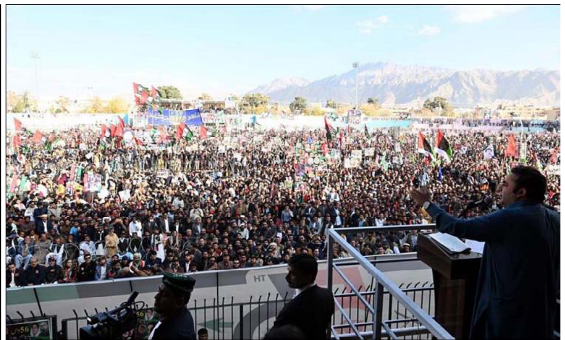
QUETTA: Peoples Party (PPP) Chairman, Bilawal Bhutto Zardari addresses to his supporters during the public gathering meeting on the occasion of PPP 56th Foundation Day, at Ayub Stadium in Quetta.

They reached the jalsa gah in form of big caravans and groups mostly carrying the party flags and portraits of their leaders.