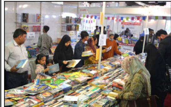
KARACHI: Students take keen interest in books during the 18th Karachi International Book Fair organized by the Publishers and Book Sellers Association (PPBA) held at Expo Centre in Karachi.