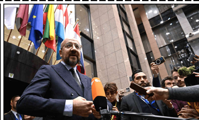
European Council President Charles Michel delivers remarks to journalists in the European Council atrium ahead of an EU leaders' dinner at the European headquarters in Brussels.

Unrelenting Israeli bombardment has laid much of the narrow coastal strip to waste over the past two months, with nearly 19,000 people confirmed dead, according to Palestinian health officials.