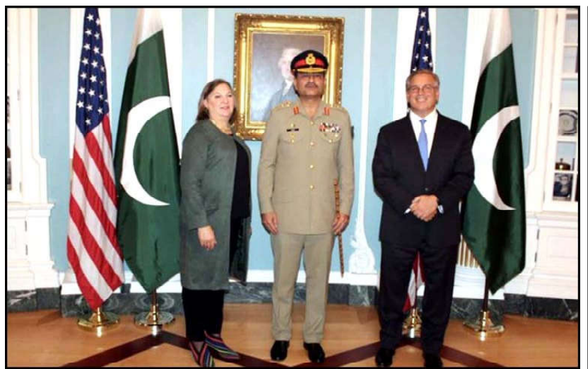
RAWALPINDI: Chief of Army Staff (COAS), General Asim Munir called on Antony J. Blinken, Secretary of State during his ongoing visit to US.

think of such a stupid act. Nobody can dare." He said that the rumours were spread by the enemies to create misunderstandings and that Pakistan had a principled journey with the Kashmiris for decades, backed by the sacrifices of 90,000 people. He said Pakistan had fought three wars with India on Kashmir and was ready to face any kind of aggression. "Are we fighting the wars to make Kashmir (part of) KP (Khyber Pakhtunkhwa)? This is out of question," he commented and reiterated Pakistan's resolve of not budging an inch from its principled position.