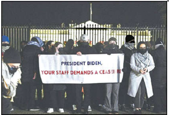
Current and former members of President Biden's staff call for a ceasefire in Gaza, outside the White House.

Monitoring Desk BRUSSELS: Hungarian Prime Minister Viktor Orban on Friday blocked $55 billion (€50 billion) in EU aid for Ukraine, after leaders side-stepped his opposition to agree to open talks with Kyiv on joining the bloc. A crunch summit in Brussels broke up after a day of wrangling as the Hungarian authoritarian leader refused to greenlight funding to help prop up Ukraine's government over the next four years. Orban called for unblocking all of the still-frozen funds from the European Union for his country, before considering lifting his veto on further aid to Ukraine. "This is a great opportunity for Hungary to make it clear that it should get what it deserves. Not half, then a quarter, but it must get the whole thing," Orban said in an interview with Hungarian state radio. "So we want to be treated fairly, and now there is a good chance that we can assert this," he added. The wrangling injected a bitter note over the summit, a day after the leaders minus Hungary made the historic decision to open talks with Ukraine on one day joining the bloc. The second day of the summit was expected to turn to the Israeli-Hamas war in Gaza, and the search for a common EU position on it.