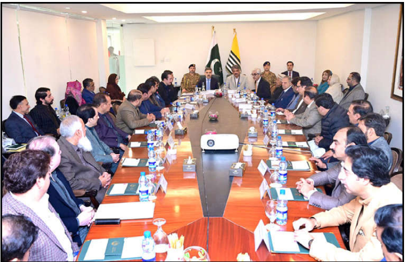
MUZAFFARABAD: Caretaker Prime Minister Anwaar-ul-Haq Kakar chairs a special meeting of the Cabinet of Azad Jammu and Kashmir.