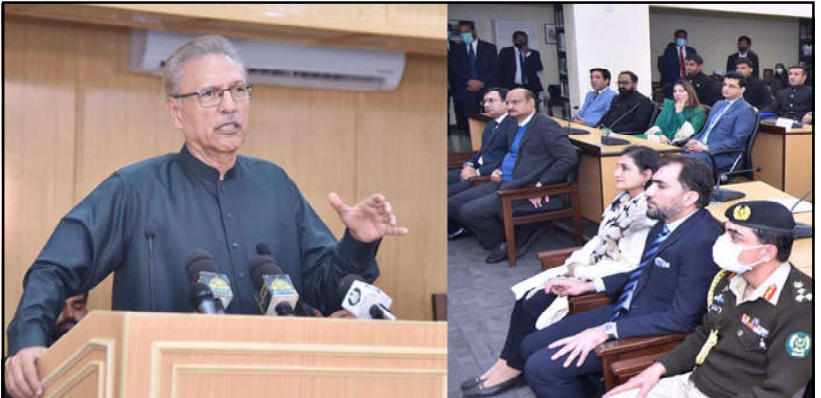
LAHORE: President Dr Arif Alvi addressing the passing out ceremony of 46th Specialized Training Program of Pakistan Administrative Service.

which served as the tomb of pharaoh Khufu], the president said it was an outcome of skills and focused goals. "Learning skills also keeps you motivated in the right direction," he added. Arif Alvi said that balance should be maintained between needs and wants, adding that the world was confused about happiness. "Some relate happiness with wealth, but happiness is more about identifying what gives you fresh breath," he explained. He declared that serving humanity provides one with real and long-term happiness. He said looking at the downtrodden people also creates compassion. Efforts should be made to strengthen and practise morality in more appropriate manner, he advised.