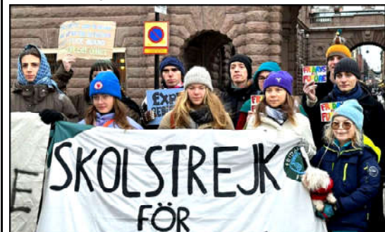
Swedish climate activist Greta Thunberg attends the Future protest outside the Parliament in Stockholm, Sweden.

Monitoring Desk BRUSSELS: European Union leaders granted Ukraine a major political win on Thursday by agreeing to start membership negotiations at a time when its counter-offensive against Russia's invasion has failed to make major gains and US military aid has become more uncertain. Diplomats and officials in Brussels said the unexpected green light for talks took place as Hungarian Prime Minister Viktor Orban, who had for weeks said he would block such a deal, agreed to leave the room, knowing the other leaders would go ahead and vote. Orban confirmed that he had abstained from the vote at the EU summit on what he called a "bad decision". It was unclear at this stage what exactly he could be getting in return. Such an unusual way to approve a decision, especially such a major one, is unheard of in Brussels, even for a place where diplomats have long been very creative about how to strike deals. Ukrainian President Volodymyr Zelensky welcomed the decision.