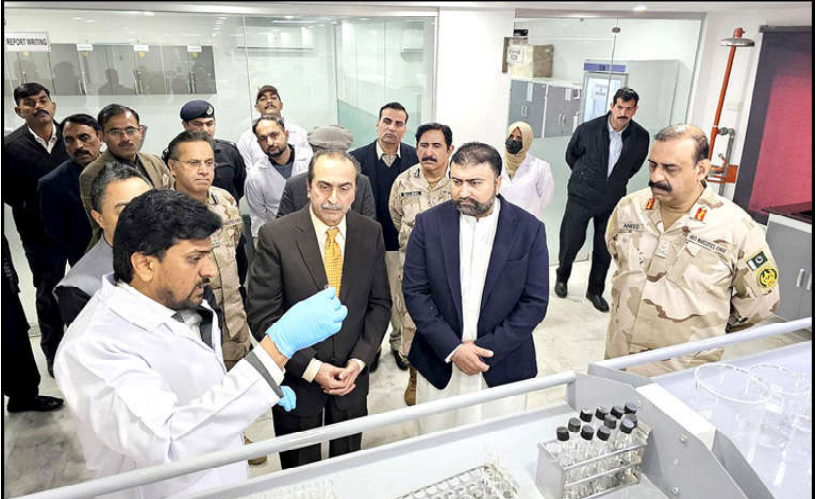
ISLAMABAD: Caretaker Federal Minister for Interior and Narcotics Control, Sarfraz Ahmed Bugti visiting the Anti-Narcotics Force Forensic Lab at ANF Academy.

ing prosecutions, easing the burden on other forensic facilities, and improving drug detection efficiency through advanced equipment. The minister stressed the importance of maintaining the highest standards of credibility in forensic processes. Recognizing ANF's international acclaim, Minister Bugti praised its pivotal role in combating drug trafficking at national, regional, and global levels. He assured the force of complete support in addressing any inadequacies to more effectively combat the menace of drug trafficking. The establishment of this lab will facilitate the issuance of various tests and reports regarding anti-narcotics, said the minister adding that this will help bring the criminals to the conclusion, and along with this, valuable time will be saved and data will be collected.