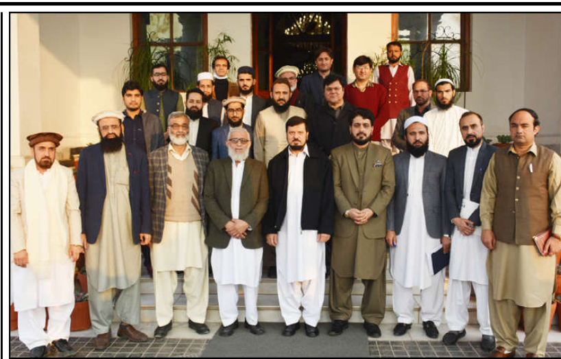
PESHAWAR: Khyber Pakhtunkhawa Governor, Haji Ghulam Ali in a group photo with delegation of Islamic Doctors Forum District Organization Khyber Pakhtunkhawa.

the noble nature of the medical profession and commended the dedication of doctors, nurses, and paramedical staff, acknowledging their sacrifices and the risks they face daily. He recounted instances of doctors sacrificing their lives, citing the example of those who succumbed to the Congo virus in Balochistan while treating patients. Naqvi outlined ongoing hospital upgrades, targeting completion by January 31. Notable hospitals like General, Services, Victoria, and Holy Family are undergoing improvements mirroring the model set by Mayo Hospital. The comprehensive upgrade spans an area of 6 lakh square feet across various hospitals.