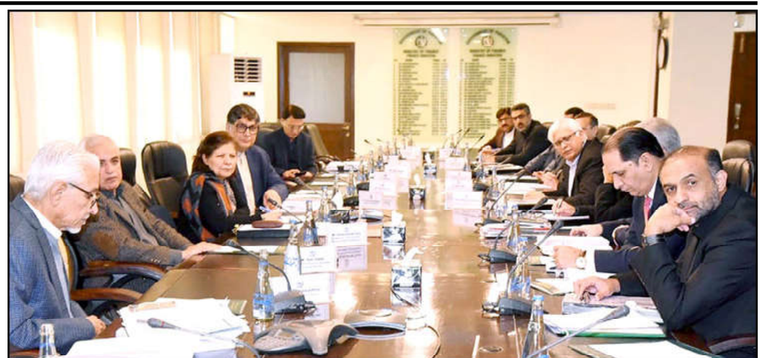
ISLAMABAD: The Federal Minister for Finance, Revenue and Economic Affairs, Dr. Shamshad Akhtar presided over a meeting of the Economic Coordination Committee (ECC) of the Cabinet.

not only meet but also surpass the target. The disbursement target for FY24 was accordingly set at Rs2,250 billion, which was 26.7% higher than the disbursement made last year, he said adding that the stellar growth of 30% during July-Oct 23 gives optimism that we are on track to comfortably achieve the disbursement target. Acknowledging the challenges, particularly attrition of borrowers,