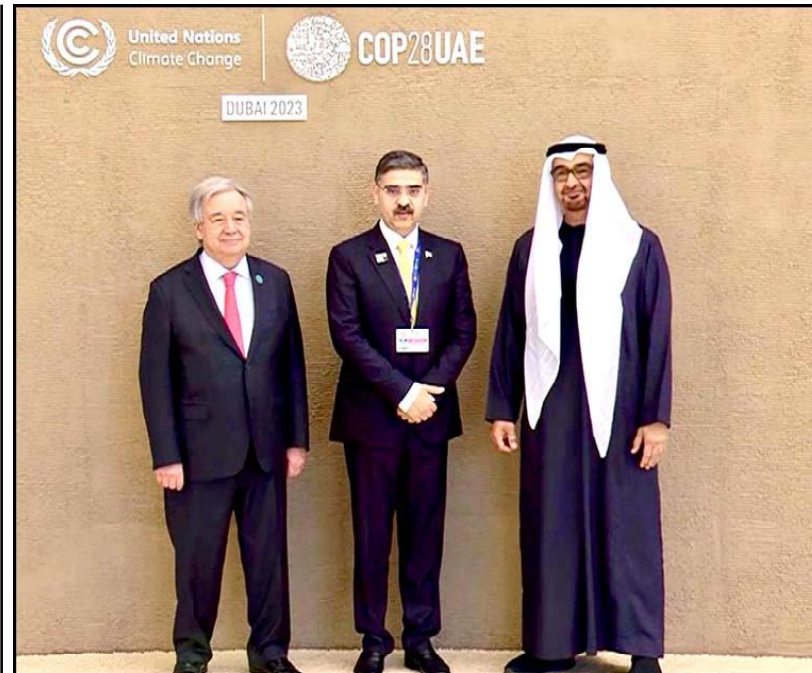
DUBAI: Caretaker Prime Minister Anwaar-ul-Haq Kakar being received by the President of the United Arab Emirates His Highness Sheikh Mohamed bin Zayed Al Nahyan and the Secretary General of the United Nations, Antonio Guterres on his arrival at Dubai Expo City to attend the High Level Segment of United Nations' 28th Conference of Parties.

The spokesperson reiterated Pakistan's call for a durable and sustained ceasefire in Gaza to enable supply of extensive and robust humanitarian assistance, urgently needed medical aid to the injured and shelter to those displaced by the indiscriminate and in-humane bombing by Israeli occupation forces.