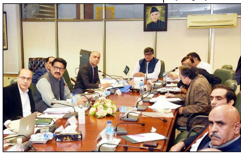
ISLAMABAD: Federal Minister for Privatisation, Fawad Hasan Fawad chairing a meeting of Privatisation Commission Board, in Islamabad.

increased by 1.93 percent to $12.172 billion compared to the exports of $11.942 billion during the corresponding period of last year, according to the latest PBS data.