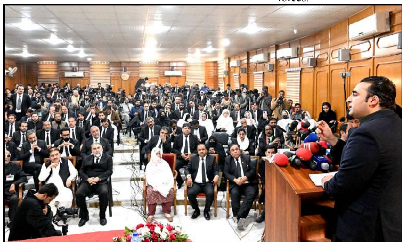
QUETTA: Chairman Pakistan People's Party Bilawal Bhutto Zardari addressing to Balochistan High Court Bar Association.

tioned. Bullet proof land cruiser provided by Punjab government will also be put to auction. Importing luxury vehicles for those holding constitutional slots is not proper. The Chief Justice of Pakistan (CJP) Qazi Faez Isa has not used both the vehicles. The amount to be acquired from the auction of the vehicles will be spent on public transport.