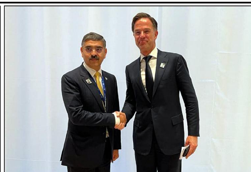
DUBAI: Caretaker Prime Minister Anwaar-ul-Haq Kakar meets the Prime Minister of Netherlands Mr. Mark Rutte on the sidelines of the high level segment of the UN's 28th Conference of Parties.

In a tweet, the Minister of Science and Technology, Dr. Umar Saif said, "At the final stages of establishing Pakistan Advanced Research Project Agency.