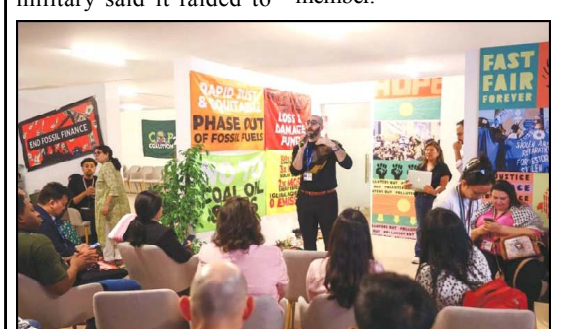
Pro-Palestinian environmental activists participate in a sit-in demonstration at the Expo City in Dubai in support of a ceasefire in Gaza.

detain a Palestinian wanted for alleged involvement in a lethal West Bank ambush in August as well as 20 other suspects. During the raid, Israeli forces "engaged with armed terrorists and killed five of them", the military said in a statement. The Jenin Brigades, a local armed group, said its fighters battled the Israeli troops. It did not immediately provide details on any casualties, but local witnesses said at least one of the Palestinians killed in Jenin was a known Brigades member.