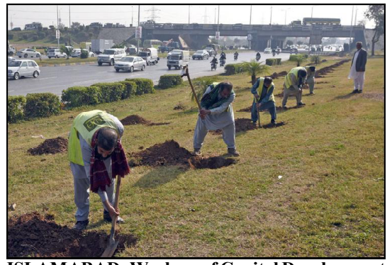
ISLAMABAD: Workers of Capital Development Authority (CDA) are digging for plantation on a green alongside Islamabad Highway.

permissible limits, and the air quality was moderate. The Agency is responsible for ensuring the protection of the environment under the Pakistan Environmental Protection Act 1997. The hazardous air pollutant particulate matter of 2.5 microns (PM2.5), which was a hazardous atmospheric contaminant, remained 14.4 micro grammes per cubic meter on average which was lower than the national environmental quality standards (NEQS) of 35 mic-grammes per cubic meter and denoted the air quality unhealthy for sensitive people.