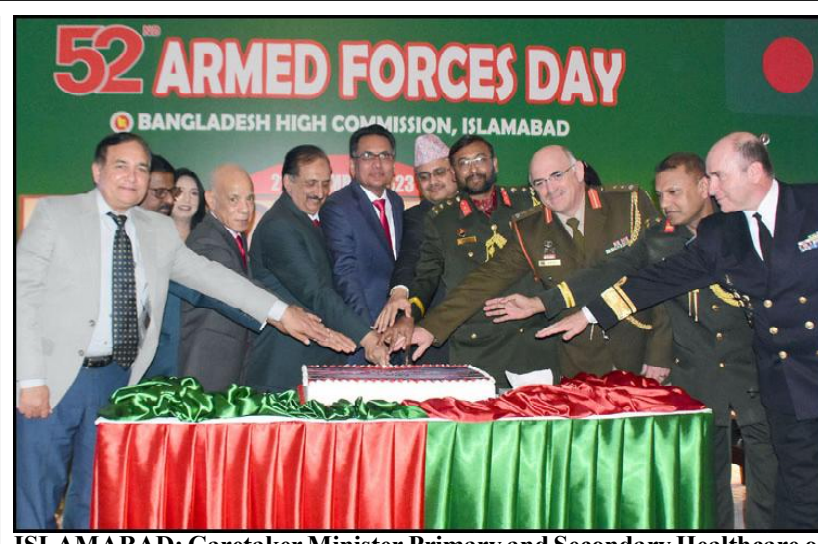
ISLAMABAD: Caretaker Minister Primary and Secondary Healthcare of Punjab Dr Jamal Nasir, Bangladesh High Commissioner to Pakistan Ruhul Alam Siddique and others cutting the cake during 52nd Bangladesh Armed Forces Day ceremony, at a local in Federal Capital.

miral (Retd) Ahmed Saeed, DG NIMA in his welcome remarks stated that Kashmir is the core issue between India and Pakistan. Post 2019 annulment of Article-370 & 35-A, Indian Government is systematically destroying Kashmiri identity and culture. During the discussions, prominent speakers shed light on the current situation of Kashmir.