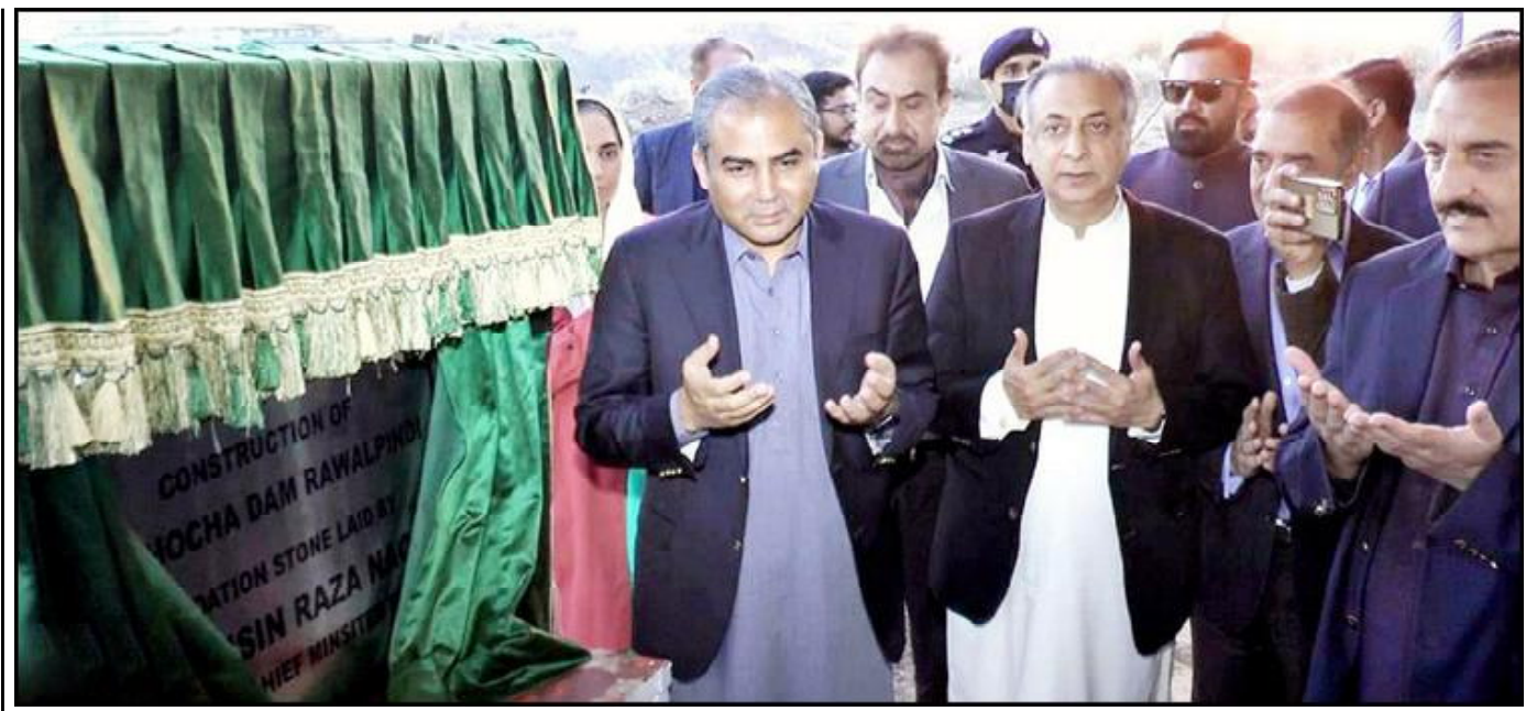
RAWALPINDI: Caretaker Chief Minister Punjab Mohsin Naqvi offering Dua after inaugurating Dadocha Dam.

project would also complete the dam swiftly, the CM informed. The dam project was pending for a long time, the CM said and informed that the preparations were being made in Murree for the winter season. Solid steps would be taken to increase tourism, said Mohsin Naqvi. Special operation against illegal housing societies had been launched, he informed. The CM said, "Upgradation work of the hospitals would continue and we will not allow anyone to obstruct this project." During a briefing, the CM was informed that work on the dam site was progressing rapidly, with 26% financial progress and 12% physical progress.