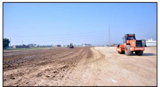
ISLAMABAD: Heavy machinery being used to build Chak Beli Link Road in the outskirts of the city.