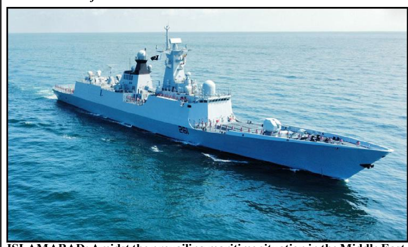
ISLAMABAD: Amidst the prevailing maritime situation in the Middle East, Pakistan Navy has deployed PNS TUGHRIL to ensure safety and security of merchant ships carrying shipments to and from Pakistani ports passing through one of the worlds busiest choke points.

In the same spirit, Pakistan Navy regularly deploys its ships on Regional Maritime Security Patrols and also contributes to collaborative maritime security efforts under the ambit of Combined Maritime Forces.