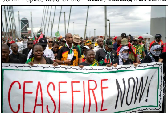
Pro-Palestinian demonstrators march across the Mandela Bridge downtown Johannesburg, South Africa.