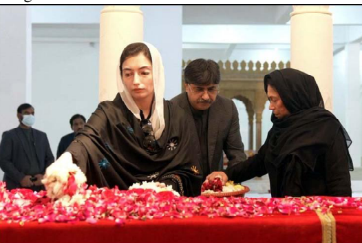
GARHI KHUDA BUX: Peoples Party (PPP) Leader, Aseefa Bhutto Zardari is laying floral wreaths and offers Fateha for the peace of departed soul of the PPP Founder, Zulfiqar Ali Bhutto and Benazir Bhutto, at Bhutto Mausoleums in Garhi Khuda Bux.

head of private educational institutions deliberated on schools in the merged districts and also discussed the matters of public partnership private for some proposal government educational institutions in the same districts. In the meeting, the minister said that the provincial government was considering several useful proposals to maintain the high quality of 10 governor schools. improvement of the established in the merged education systems in the districts and to run them in a better manner.