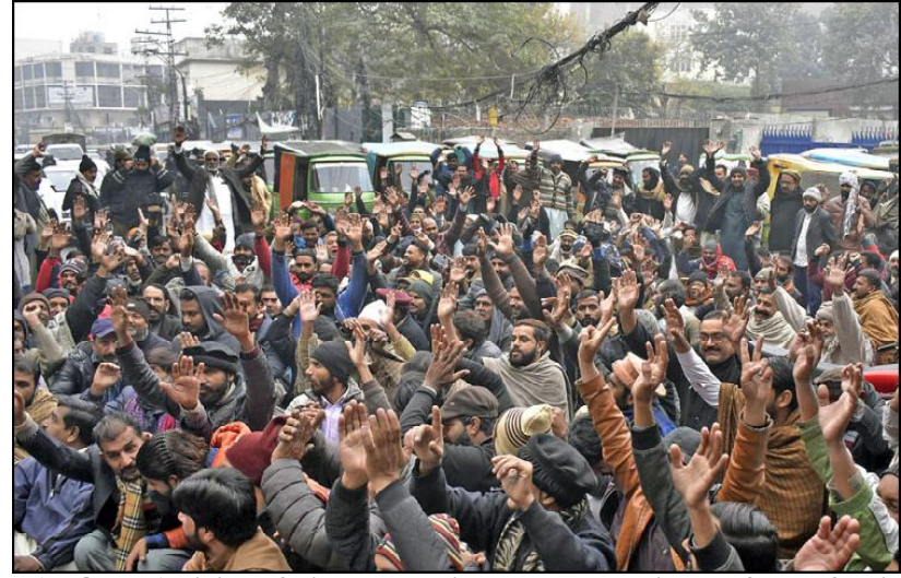
LAHORE: Activists of Rickshaw Union holds protest ion the favor of their demands outside press club in Provincial Capital.

The items, which recorded a decrease in their average prices on a week-on-week (WoW) included potatoes (8.66 percent), tomatoes (1.01 percent), vegetable ghee 2.5 kg (0.61 percent), cooking oil 5 liter (0.44 percent), eggs (0.40 percent), mustard oil (0.24 percent), gurr (0.19 percent) and garlic (0.15 percent).