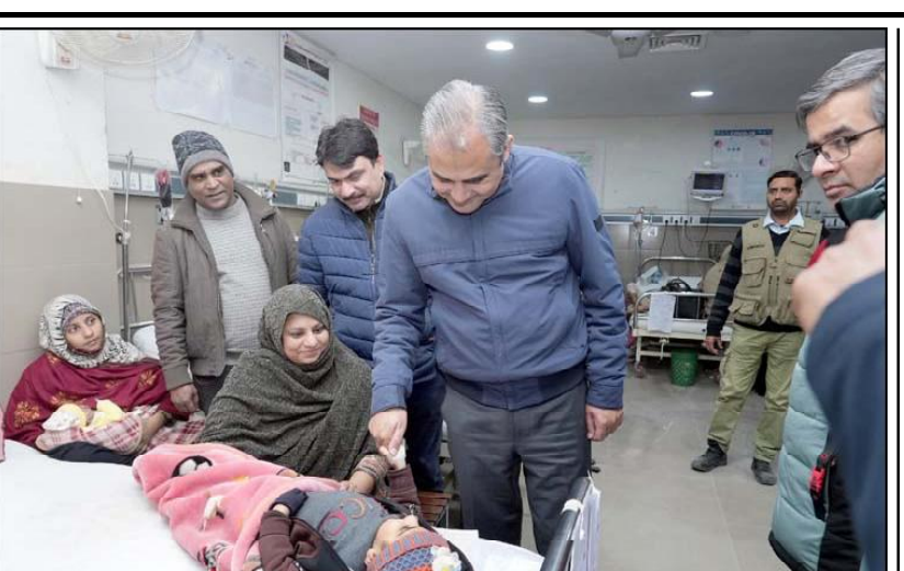
LAHORE: Caretaker Chief Minister Punjab Mohsin Naqvi holding hand of child in a pleasant mood after reviewing upgradation project during his visit to Children Hospital.