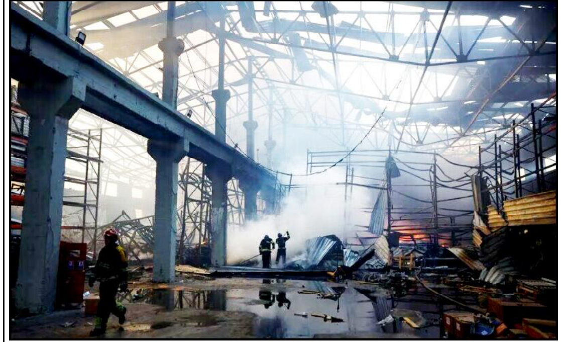
Rescuers work at the site where a residential building was damaged during a Russian missile and drone strike, amid Russia's attack on Ukraine, in Odesa, Ukraine

One person was confirmed dead at a warehouse in Kyiv, Mayor Vitali Klitschko said, revising down an earlier toll of two. Residential buildings and an uninhabited building were also hit, a senior military official said.