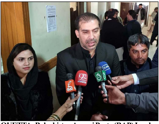
QUETTA: Balochistan Awami Party (BAP) Leader, Mubin Khan talking to media persons after submitting his nomination papers to participate in upcoming General Election 2024, in Quetta.

In the filed petition, PTI asserts that the Peshawar High Court has already suspended the Eleccomes a parental responsition Commission's decision to nullify the intra-party election