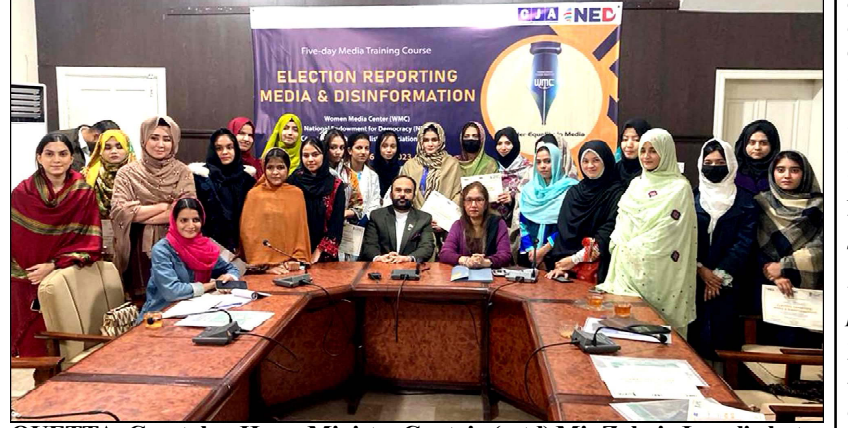
QUETTA: Caretaker Home Minister Captain (retd) Mir Zubair Jamali photographed with participants of a workshop organized by Women Media Center

Minister for Home and Tribal Affairs Mir Zubair Jamali on Friday said that our main goal and first priority of the caretaker government was to conduct clean and transparent elections in the province. However, giving guide-lines for the election and de-termining the framework is