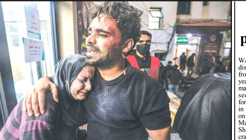
RAFAH: An injured Palestinian man comforts a relative outside the Kuwait hospital, in the southern Gaza Strip, following an Israeli army strike that left at least 20 dead and 55 wounded