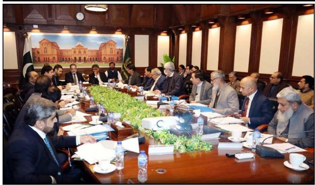
RAWALPINDI: Inter Ministerial Committee on AJ&K being chaired by Minister for Defence, Lt. Gen (Retd) Anwar Ali Hyder co-chaired by Prime Minister Azad Jammu and Kashmir (AJK), Chaudhary Anwar-ul-Haq held at Ministry of Defence in Rawalpindi.