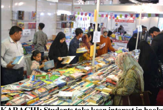
KARACHI: Students take keen interest in books during the 18th Karachi International Book Fair organized by the Publishers and Book Sellers Association (PPBA) held at Expo Centre in Karachi.

delegation members apprised Governor KP about the problems they face daily in trade with Afghanistan including import, export and transit trade. After discussion over the issues creating hurdles in the smooth sailing of trade, it was agreed that a steering committee be constituted under the chairmanship of private sector stakeholders with representation from Frontier Corps.