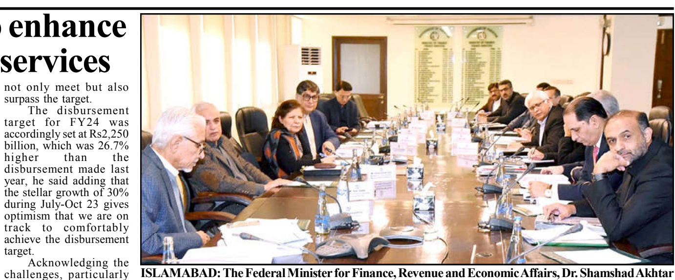
presided over a meeting of the Economic Coordination Committee (ECC) of the Cabinet.