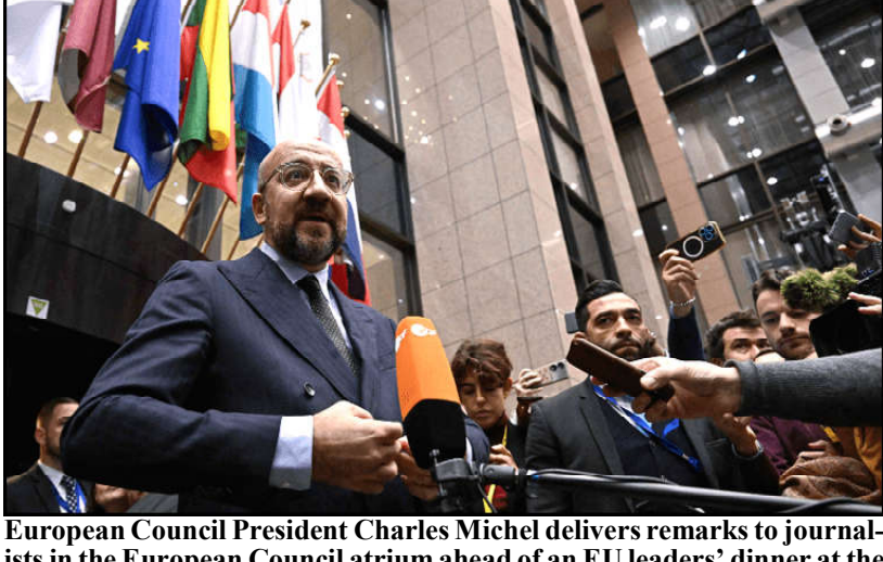
ists in the European Council atrium ahead of an EU leaders' dinner at the European headquarters in Brussels.

Tzipi Hotovely told Sky News that she did not believe in the long-standing position of the UK