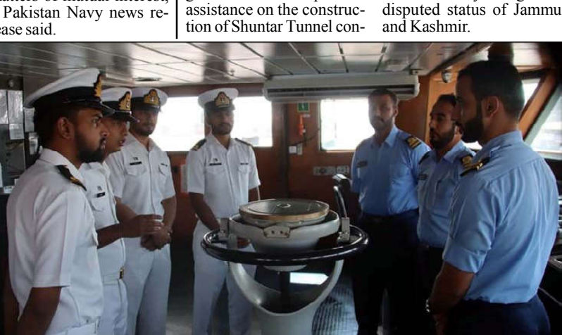
OMAN: Officials of Oman navy visit Pakistan Navy Ship TUGHRIL at Salalah Port of Oman.