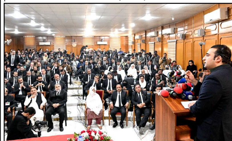
QUETTA: Chairman Pakistan People's Party Bilawal Bhutto Zardari addressing to Baluchistan High Court Bar Association.

He said that my grandfather Zulfikar Ali Bhutto was hanged to death while his mother and uncles were martyred too. Today, when I see a mother in Balochistan sad because of her son's target killing or disappearance, I understand her pain," said Chairman Bilawal Bhutto Zardari.