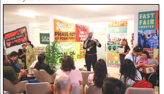
Pro-Palestinian environmental activists participate in a sit-in demonstration at the Expo City in Dubai in support of a ceasefire in Gaza.

detain a Palestinian wanted for alleged involvement in a lethal West Bank ambush in August as well as 20 other suspects. During the raid, Israeli forces "engaged with armed terrorists and killed five of them", the military said in a statement. The Jenin Brigades, a local armed group, said its fighters battled the Israeli troops. It did not immediately provide details on any casualties, but local witnesses said at least one of the Palestinians killed in Jenin was a known Brigades member.