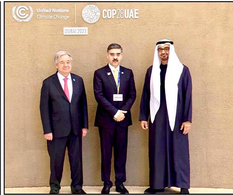
DUBAI: Caretaker Prime Minister Anwaar-ul-Haq Kakar being received by the President of the United Arab Emirates His Highness Sheikh Mohamed bin Zayed Al Nahyan and the Secretary General of the United Nations, Antonio Guterres on his arrival at Dubai Expo City to attend the High Level Segment of United Nations' 28th Conference of Parties.

eral seats in the National Assembly and 130 in the Provincial Assembly. Khyber Pakhtunkhwa is allotted 45 general seats in the National Assembly and 115 in the Provincial Assembly. Meanwhile, Balochistan holds 16 general seats in the National Assembly and 51 in the Provincial Assembly. As outlined by the Election Commission, the National Assembly will include 60 seats for women and 10 reserved seats for minorities.