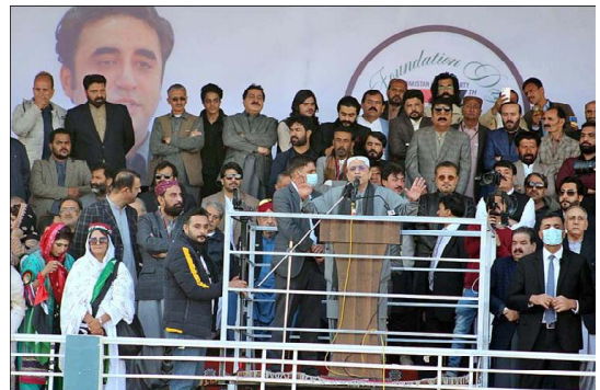
QUETTA: President of Pakistan Peoples Party Parliamentarians, Asif Ali Zardari addressing to a public rally to marks the 56th Foundation Day (Youm-e-Tasees).

President PPPP said that individuals sitting in Islamabad do not see that Balochistan is the heart of the country, but PPP sees (without doubt) that Balochistan is the heart of the country. "Today I want to tell everyone that there is a great sadness and sorrow spread inside the land of Balochistan, and we have to put ointment on it. We put some ointment during our time, but it is not enough," he said.