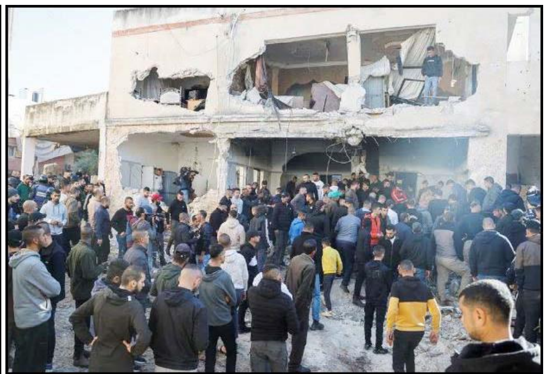
Palestinians check damage following a raid in Jenin in the Israeli-occupied West Bank

Fears of a conflict of interest were given fresh life on the eve of COP28 when Jaber was accused of using the presidency to pursue fossil fuel deals in meetings with governments—accusations he strenuously denied.