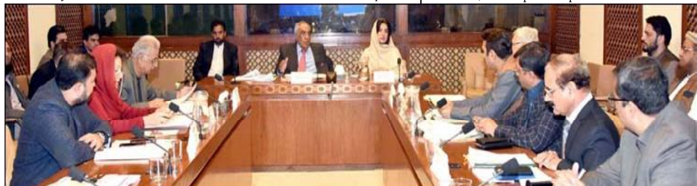
Senator Syed Muzafar Hussain Shah, Chairman Senate Standing Committee on National Food Security and Research presiding over a meeting of the Committee at Parliament House Islamabad.

In spite of business fluctuations, an increase of 11 billion 24 thousand 24 lakh 91 thousand 189 rupees was recorded in the market capital, as a result of which the total volume of capital increased from 87 trillion 18 billion 28 billion 7 lakh 75 thousand 42 rupees to 87 trillion 29 billion 52 billion 32 lakh 66 thousand 231 rupees. 46 crore 71 lakh 59 thousand shares worth 18 billion rupees were traded in Pakistan Stock Market on Thursday while 69 crore 22 lakh 20 thousand shares worth 27 billion rupees.