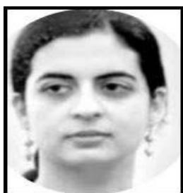
By Kamila Hyat

Inequality has always existed in Pakistan for at least one-third of the population which lives below the poverty line. There is no evidence of a drastic change over the decades since the country came into existence. But there is speculation from top economists in the country that after 2018, things have taken a turn for the worse and inequality has grown with the poor falling lower down the ladder as they struggle with inflation, unemployment, and many other perils that come along with these.