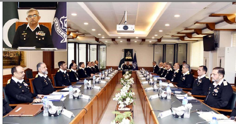
ISLAMABAD: Chief of the Naval Staff, Admiral Naveed Ashraf chairs the Command and Staff Conference held at Naval Headquarters in Islamabad.