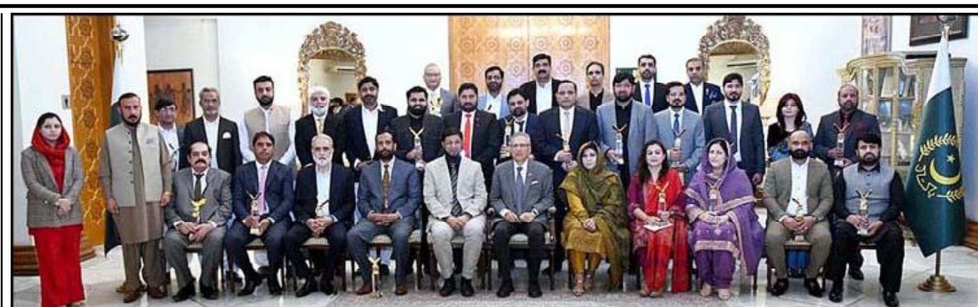
ISLAMABAD: President Dr. Arif Alvi in a group photo with the winners of the 2nd Islamabad Chamber of Small Traders and Small Industries achievement trophies at Aiwan-e-Sadr.

"There is no dearth of talent and skills in the country, however, the situation needs provision of better opportunities to people," he said.