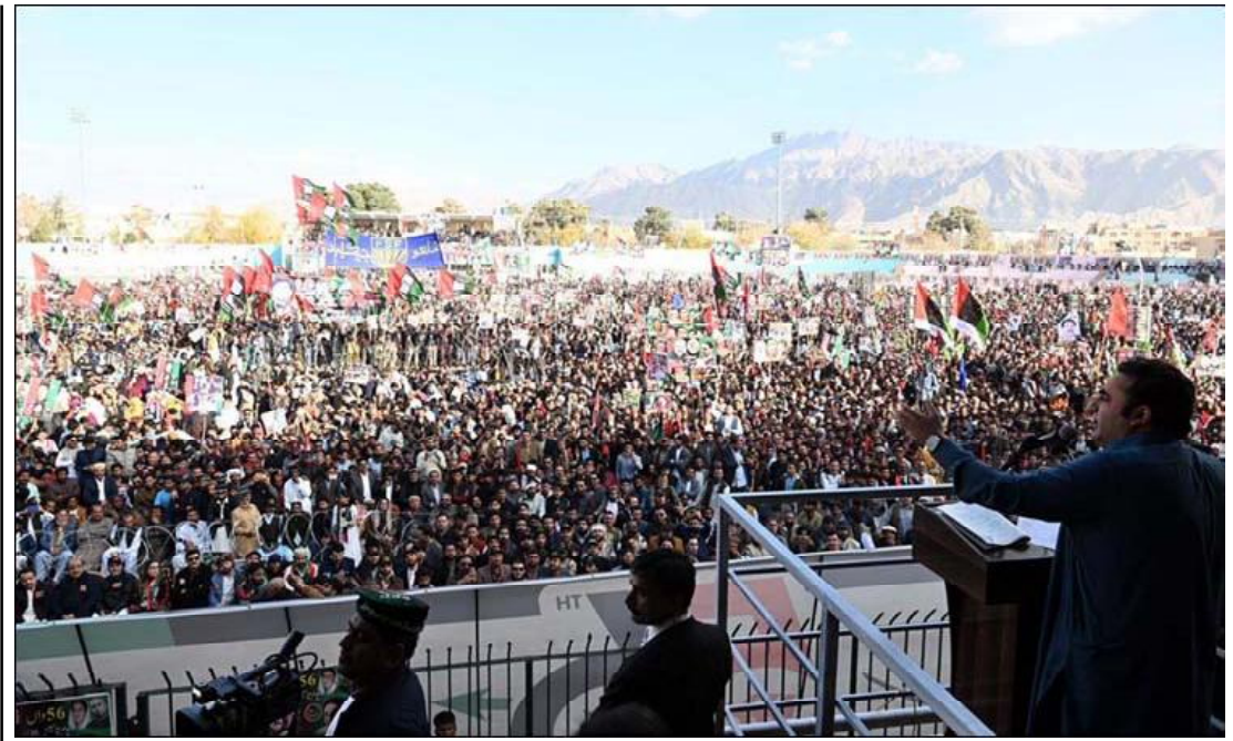
QUETTA: Peoples Party (PPP) Chairman, Bilawal Bhutto Zardari addresses to his supporters during the public gathering meeting on the occasion of PPP 56th Foundation Day, at Ayub Stadium in Quetta.

They reached the jalsa gah in form of big caravans and groups mostly carrying the party flags and portraits of their leaders.