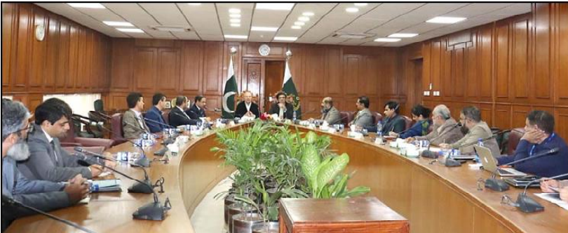
ISLAMABAD: Justice Mansoor Ali Shah Judge Supreme Court of Pakistan/Chairman National Judicial Automation Committee (NJAC) convened a meeting at Supreme Court.