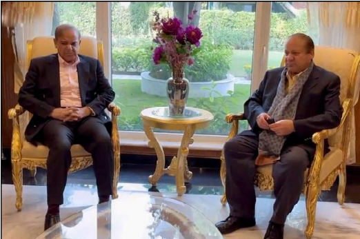
LAHORE: Quaid PML (N) Nawaz Sharif exchanging views with President (PML-N) Shahbaz Sharif.