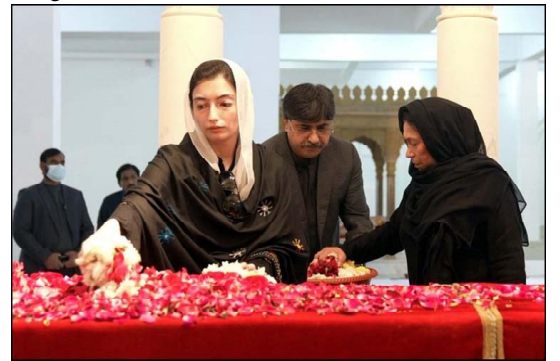
GARHI KHUDBUX: Peoples Party (PPP) Leader, Aseefa Bhutto Zardari is laying floral wreaths and offers Fateha for the peace of departed soul of the PPP Founder, Zulfiqar Ali Bhutto and Benazir Bhutto, at Bhutto Mausoleums in Garhi Khuda Bux.