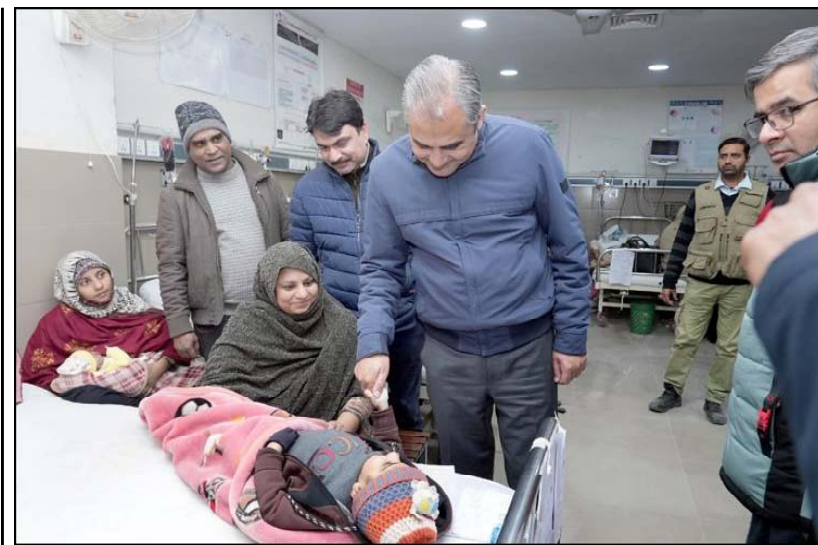
LAHORE: Caretaker Chief Minister Punjab Mohsin Naqvi holding hand of child in a pleasant mood after reviewing upgradation project during his visit to Children Hospital.

upgradation work on all four floors of the Emergency Block. He emphasized the importance of safe and standard wiring for biogas and AC pipes, as well as infection-free operation theatres. Noting some sluggishness in construction activities, he ordered to accelerate the pace of work. CM Naqvi's visit to Shalimar Garden involved a detailed review of its overall condition. Riding a rickshaw, he affirmed his commitment to restoring the garden to its original historical state. The CM ordered the removal of illegal constructions around the garden, tasking the deputy commissioner Lahore with the responsibility.