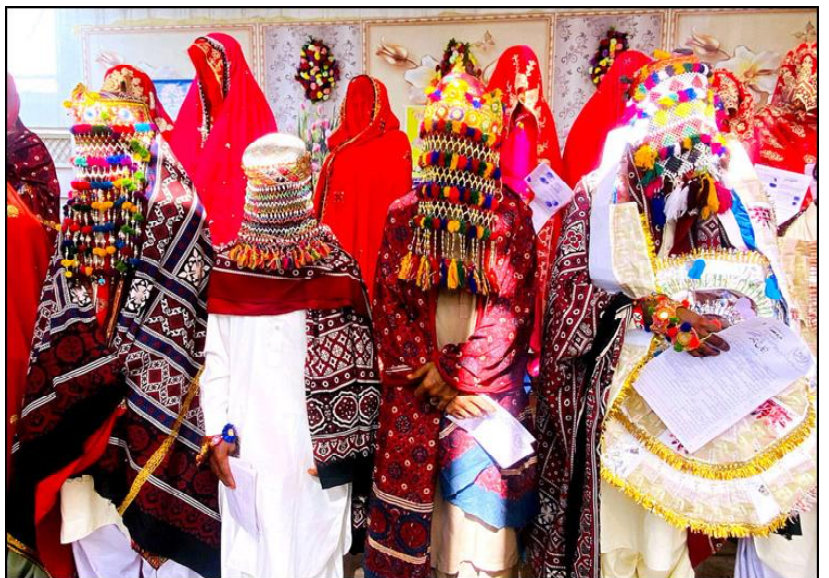
TANDO ADAM: Grooms and brides during a mass marriage ceremony held in a local garden, organized by the Odera Lal Welfare Association. A total of 250 couples participated, including 125 Muslims and 125 Non-Muslims.