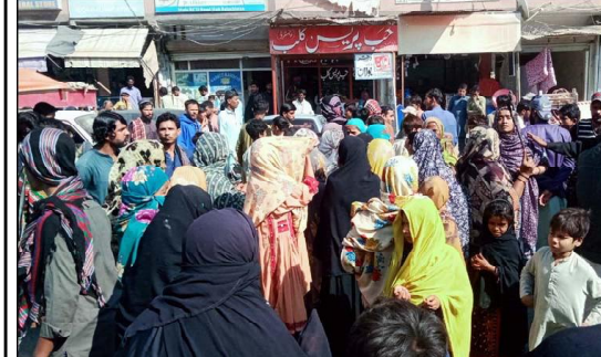
HUB: Members of Civil Society are holding protest demonstration against prolong sui gas load shedding in city, at Hub press club.

LAHORE (INP): The Pakistan Tehreek-e-Insaf (PTI) has formally challenged the Election Commission's decision to withhold the list of reserved seats for women in the Lahore High Court. On Friday, PTI applied to the Lahore High Court, challenging the Election Commission's stance on not disclosing the specific seat allocations. In the filed petition, PTI asserts that the Peshawar High Court has already suspended the Election Commission's decision to nullify the intra-party election.