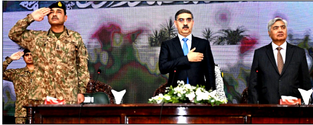
ISLAMABAD: Caretaker Prime Minister Anwaar-ul-Haq Kakar and Chief of the Army Staff, Syed Asim Munir participating in the National Farmer's Convention