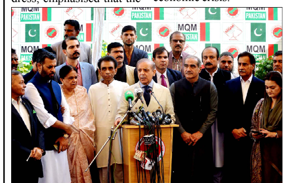
KARACHI: Former Prime Minister and Muslim League (PML-N) President, Shehbaz Sharif along with Khalid Maqbool Siddiqui, Convener Mutahida Qaumi Movement (MQM-P) talking to media persons at MQM-P Bahadurabad Head Office

He said that the climate change and water scarcity were realities that challenged Pakistan's food security and necessitated use of technology and close government-public collaboration as being done under SIFC. "Pakistan is endowed with immense potential and abundant resources. Together, we will navigate through these challenging times, by the grace of Allah, and attain our goals across every sector, InshaAllah," he added. The COAS said that the dividends of all initiatives by SIFC would help Pakistan come out of the economic crisis.