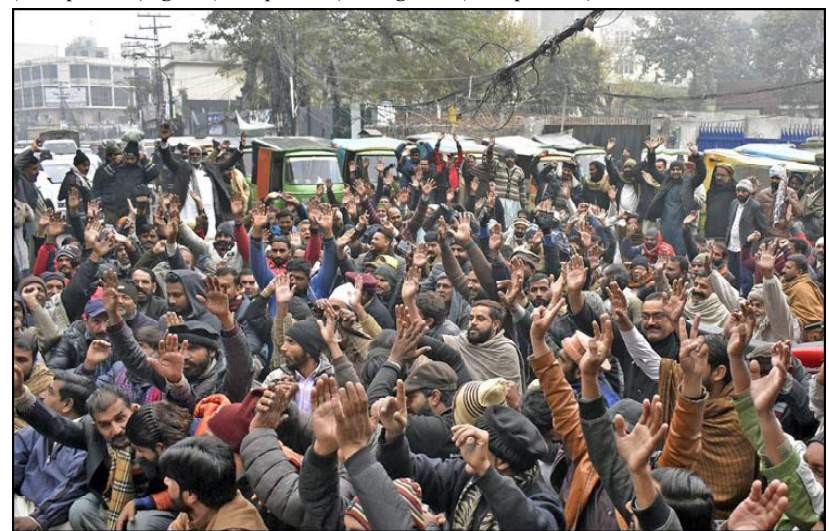
LAHORE: Activists of Rickshaw Union holds protest in the favor of their demands outside press club in Provincial Capital.