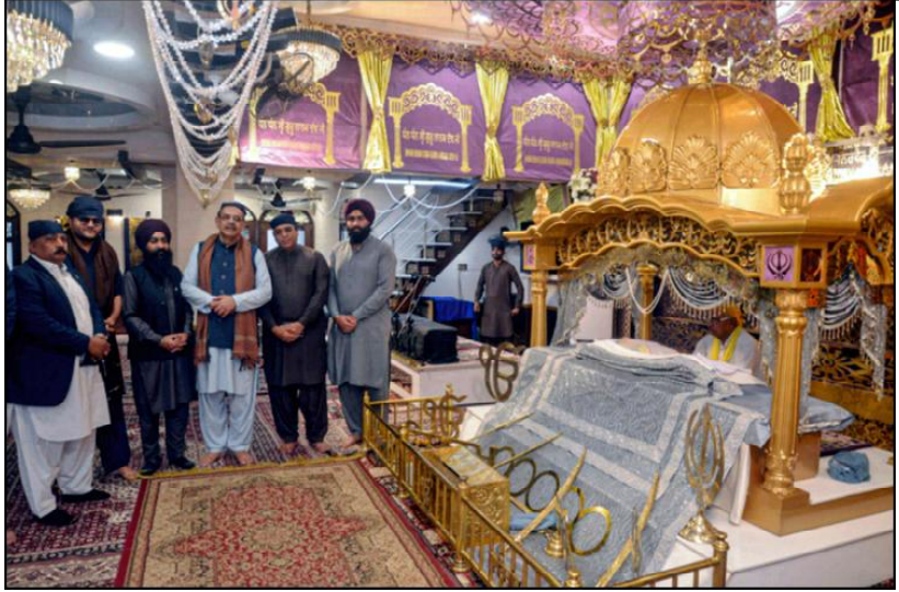
KARACHI: Caretaker Federal Minister for Religious Affairs and Interfaith Harmony Aneeq Ahmed visiting Gurdwara Guru Nanak Darbar Swami Narain Mandir Light House.