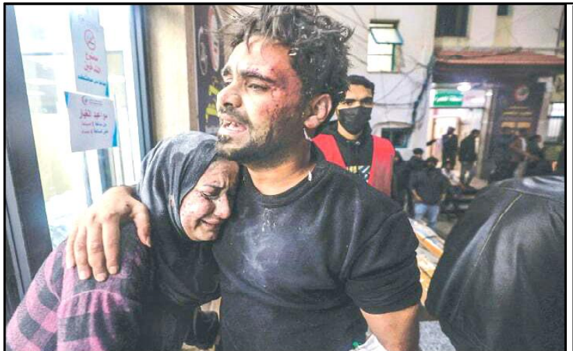
RAFAH: An injured Palestinian man comforts a relative outside the Kuwait hospital, in the southern Gaza Strip, following an Israeli army strike that left at least 20 dead and 55 wounded