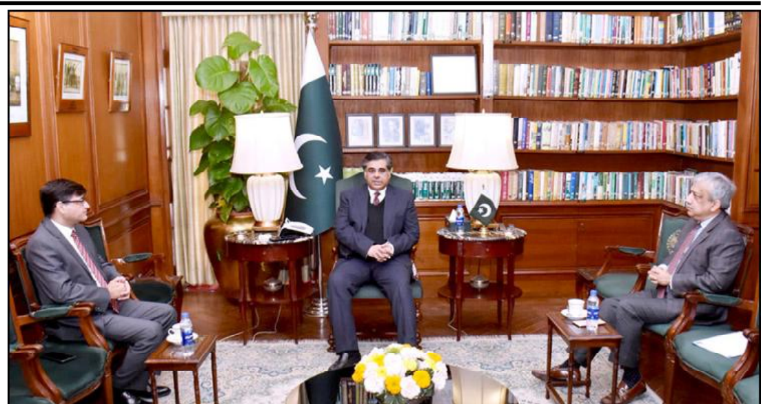
KARACHI: Deputy Governor SBP calls on Caretaker Federal Minister for Commerce and Industries & Production Dr. Gohar Ejaz at Governor House.

Pakistan Act, 1956 which requires the governor to submit to the Parliament an annual report regarding the Bank's objectives, the conduct of monetary policy, the state of the economy and the financial system. The GAR stated that fiscal year 2023 was extraordinarily challenging, with a host of external and domestic shocks, amplified by lingering structural weaknesses.