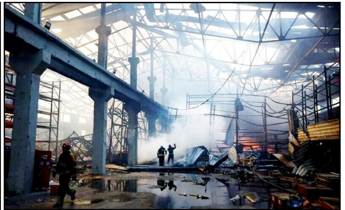
Rescuers work at the site where a residential building was damaged during a Russian missile and drone strike, amid Russia's attack on Ukraine, in Odesa, Ukraine

Air Force Commander Mykola Oleshchuk suggested the strike was Russia's largest aerial barrage since the February 2022 invasion, describing it on Telegram messenger as "the most massive attack from the air". Army chief General Valeriy Zaluzhnyi said the attack targeted critical infrastructure and industrial and military facilities. There was no immediate comment from Russia. The energy ministry reported power outages in the regions of southern Odesa, northeastern Kharkiv, central Dnipropetrovsk and central Kyiv. Ukraine has been warning for weeks that Russia could be stockpiling missiles to launch a major air attack on the energy system. Last year millions of people were plunged into darkness when Russian strikes pounded the power grid. Five people were killed in the central region of Dnipropetrovsk where missiles hit a shopping centre, a privately-held home and a six-storey residential building. One person was confirmed dead at a warehouse in Kyiv, Mayor Vitali Klitschko said, revising down an earlier toll of two. Residential buildings and an uninhabited building were also hit, a senior military official said.