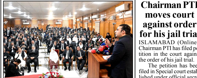
QUETTA: Chairman Pakistan Peoples Party Bilawal Bhutto Zardari addressing to Balochistan High Court Bar Association.

Referring the 8th August 2016 tragedy of civil hospital Quetta, Bilawal Bhutto Zardari said that he knew Balochistan and well aware of the agony the people have gone through. He said that he has gone through the agony and grief, which the people of Balochistan have passed. He said that my grandfather Zulfikar Ali Bhutto was hanged to death while his mother and uncles were martyred too. Today, when I see a mother in Balochistan sad because of her son's target killing or disappearance, I understand her pain," said Chairman Bilawal Bhutto Zardari.