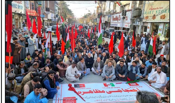
QUETTA: Activists of National Democratic Movement (NDM), Pashtunkhwa Milli Awami Party (PKMAP) and Awami National Party (ANP) are holding protest demonstration against forced deportation of Afghans, at Mannan Chowk in Quetta.

ISLAMABAD (Online): Pakistan while calling for permanent ceasefire in Gaza has said investigation into attacks by Israel on medical facilities centers be got conducted. "Indian forces brutalities are continuing in Occupied Kashmir. India should stop terrorism in Kashmir valley. The terrorists attacks from Afghanistan and terrorists safe havens therein are matter of grave concern, this was said by Foreign Office (FO) spokesperson Mumtaz Zahra Baloch during weekly press briefing here Friday. She said care taker Prime Minister (PM) Anwar ul Haq Kakar is on his visit to Dubai to represent Pakistan in opening session of World Climate Action summit Cop-28 conference. He has visited UAE and Kuwait as well. He met UAE president and held talks on bilateral relations and regional issues. She said Pakistan has once again asked Afghan authorities to take immediate and effective steps against terrorist entities operating from their soil.