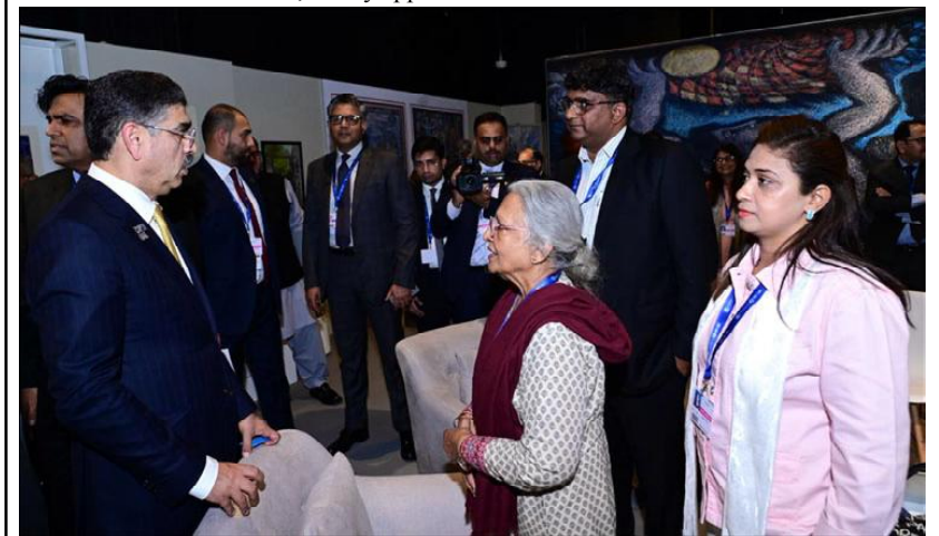
DUBAI: Caretaker Prime Minister Anwaar-ul-Haq Kakar visits Pakistan Pavilion at COP-28.

In his decision, the president stated that the Bank's denial of the claims of the Complainants on the ground that the deposit slip neither had the required "Cash Received" stamp nor was validated with any system entry was not tenable as the receipt was a bona fide document and admittedly issued under the signature of the bank's authorized Teller Services Officers (TSO) who had been penalized in terms of dismissal from Bank's service.