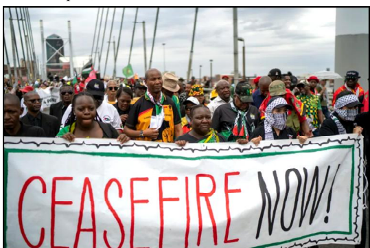
Pro-Palestinian demonstrators march across the Mandela Bridge downtown Johannesburg, South Africa.

Erdogan's government has delayed Sweden's ratification over accusations that Stockholm is too soft on Kurdish militants and other groups Turkey considers to be security threats. But Hungary has expressed no such concrete concerns.