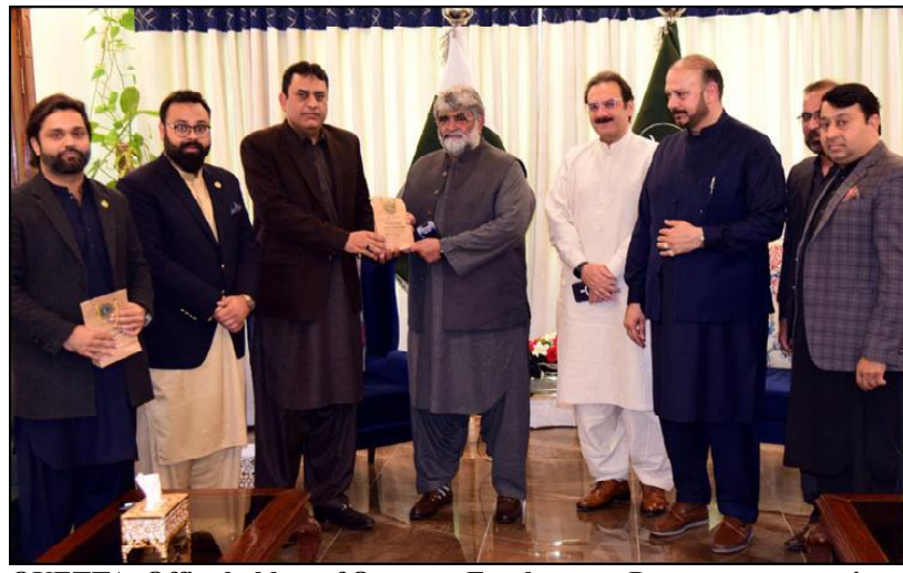
QUETTA: Office holders of Overseas Employment Promoters presenting a shield to Caretaker Chief Minister Balochistan Mir Ali Mardan Khan Domki.

Dr. Khalid-ur-Rahman Qambrani said that AIDS was affecting more people with each passing day, worryingly, the number of AIDS patients was decreasing globally and here in Pakistan the situation was different. The main reason for the spread of the disease is lack of awareness and lack of medical examination, he said. He said that it was a misconception that only sexual intercourse was the main cause of this disease, transfusion of infected blood and use of used syringes also play an important role in the spread of the disease. He said that the provincial AIDS control program had provided free test facilities in the hospitals of all the districts of the province and screening kits were available in all these districts.