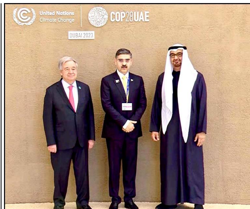
DUBAI: Caretaker Prime Minister Anwaar-ul-Haq Kakar being received by the President of the United Arab Emirates His Highness Sheikh Mohamed bin Zayed Al Nahyan and the Secretary General of the United Nations, Antonio Guterres on his arrival at Dubai Expo City to attend the High Level Segment of United Nations' 28th Conference of Parties.

DUBAI (APP): Caretaker Prime Minister Anwaar-ul-Haq Kakar on Friday joined the world leaders at the high-level segment of the 28th Conference of the Parties (COP 28) of the United Nations to discuss actions on climate change. The prime minister was received by President of the United Arab Emirates Sheikh Mohamed bin Zayed Al Nahyan and the Secretary General of the United Nations Antonio Guterres on his arrival at the venue, Dubai Expo City. Besides attending the opening session of the World Climate Action Summit, PM Kakar is expected to meet the prime ministers of the Netherlands and Estonia, on the sidelines of the conference.