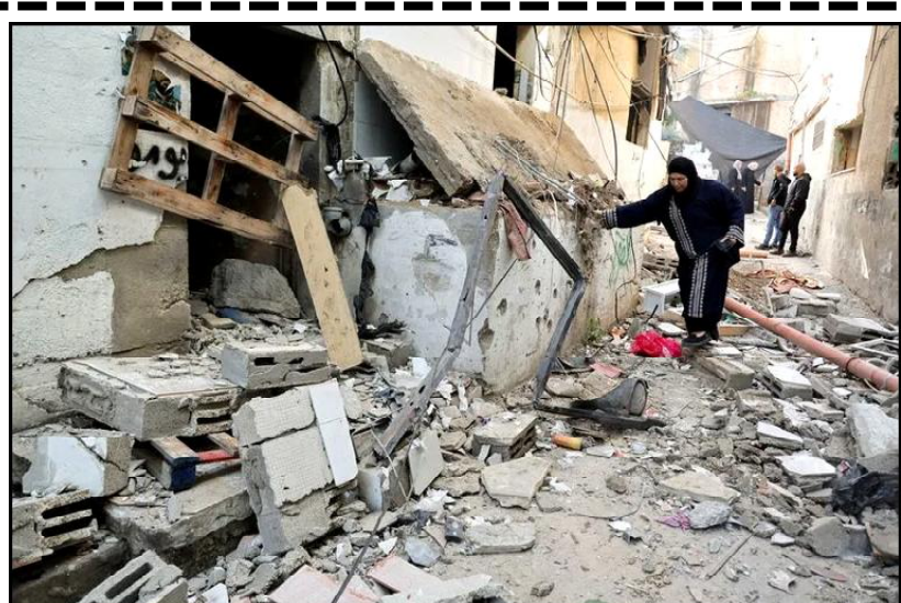
Palestinians check the damage in a street in the aftermath of an Israeli raid in Jenin.

The assault on Kyiv began at 4 a.m., local time, continuing in waves for more than six hours, and caused power outages in 77 residential buildings and 120 institutions, according to Popko. Ukraine's Energy Ministry said 17,000 people were without power in the Kyiv region as a result of the attack, noting that four power lines were damaged.