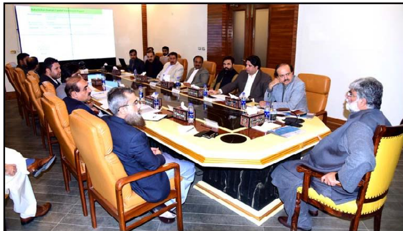
QUETTA: Caretaker Chief Minister Balochistan Mir Ali Mardan Khan Domki presiding over a meeting regarding progress on ongoing projects with cooperation of World Bank