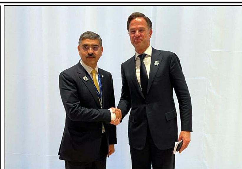
DUBAI: Caretaker Prime Minister Anwaar-ul-Haq Kakar meets the Prime Minister of Netherlands Mr. Mark Rutte on the sidelines of the high level segment of the UN's 28th Conference of Parties.

In a tweet, the Minister of Science and Technology, Dr. Umar Saif said, "At the final stages of establishing Pakistan Advanced Research Project Agency.