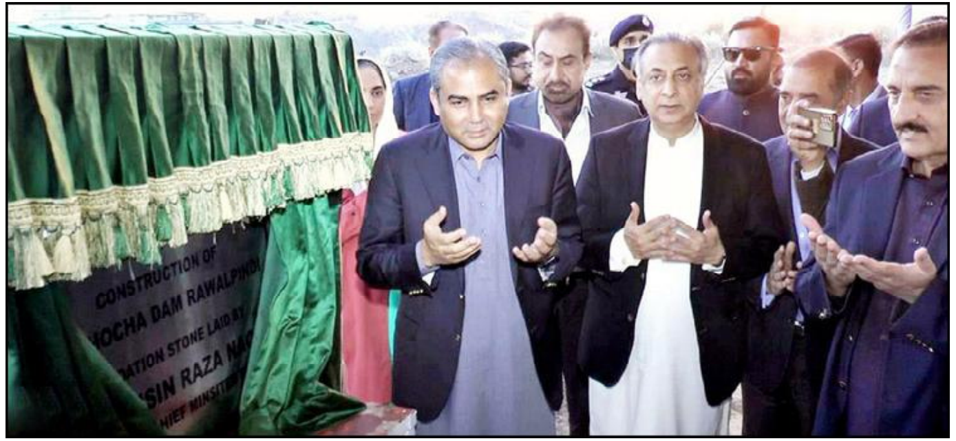
RAWALPINDI: Caretaker Chief Minister Punjab Mohsin Naqvi offering Dua after inaugurating Dadocha Dam.

During a briefing, the CM was informed that work on the dam site was progressing rapidly, with 26% financial progress and 12% physical progress.