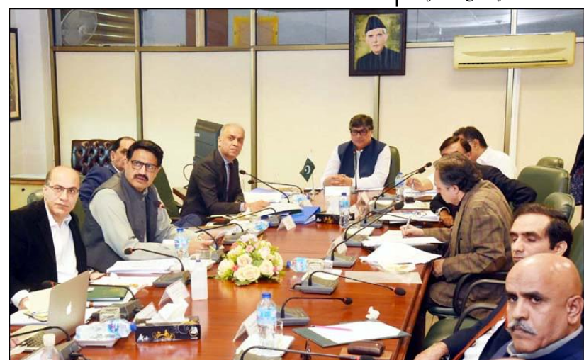
ISLAMABAD: Federal Minister for Privatisation, Fawad Hasan Fawad chairing a meeting of Privatisation Commission Board, in Islamabad.

The Trade deficit from July-November (2023-24) was recorded at $9.378 billion as against the deficit of $14.122 billion in July-November (2022-23), showing negative growth of 33.59 percent. During the period under review, the exports