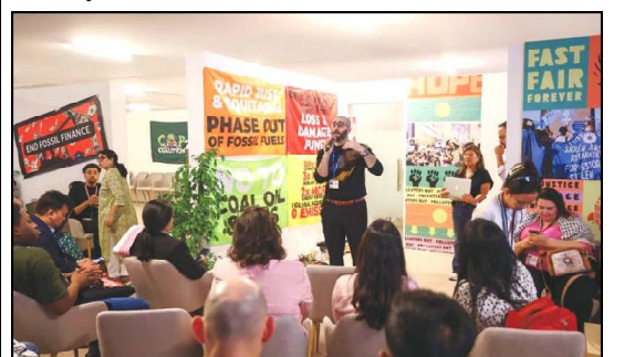
Pro-Palestinian environmental activists participate in a sit-in demonstration at the Expo City in Dubai in support of a ceasefire in Gaza.

detain a Palestinian wanted for alleged involvement in a lethal West Bank ambush in August as well as 20 other suspects. During the raid, Israeli forces "engaged with armed terrorists and killed five of them", the military said in a statement. The Jenin Brigades, a local armed group, said its fighters battled the Israeli troops. It did not immediately provide details on any casualties, but local witnesses said at least one of the Palestinians killed in Jenin was a known Brigades member.