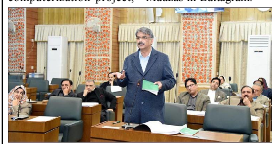
MUZAFFARABAD: Prime Minister Azad Kashmir Chaudhry Anwar Haq is speaking in the session of the Legislative Assembly.

ATTOCK (APP): A woman was killed and 11 passengers were injured in a traffic accident in Jand Tehsil of Attock on Thursday. According to Rescue Sources, the incident occurred near Namal village in Jundtehsil when a high school truck carrying female students collided with a stationary Ford loader vehicle.