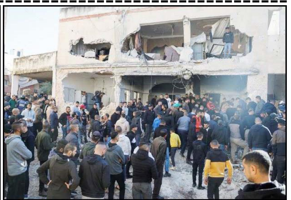
Palestinians check damage following a raid in Jenin in the Israeli-occupied West Bank

Fears of a conflict of interest were given fresh life on the eve of COP28 when Jaber was accused of using the presidency to pursue fossil fuel deals in meetings with governments—accusations he strenuously denied.