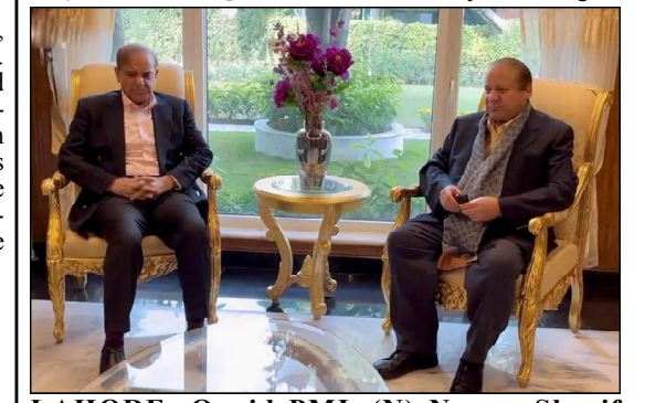
LAHORE: Quaid PML (N) Nawaz Sharif exchanging views with President (PML-N) Shahbaz Sharif.