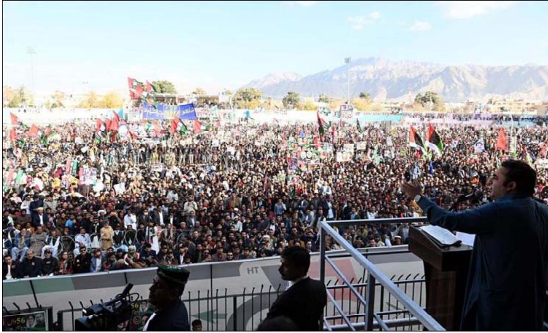
QUETTA: Peoples Party (PPP) Chairman, Bilawal Bhutto Zardari addresses to his supporters during the public gathering meeting on the occasion of PPP 56th Foundation Day, at Ayub Stadium in Quetta.

Ph: 2841470/2841473 Vol: XVI No. 182, Jamadi-ul-Awwal 16, 1445 AH Friday December 01, 2023, Pages 08, Price Rs. 15