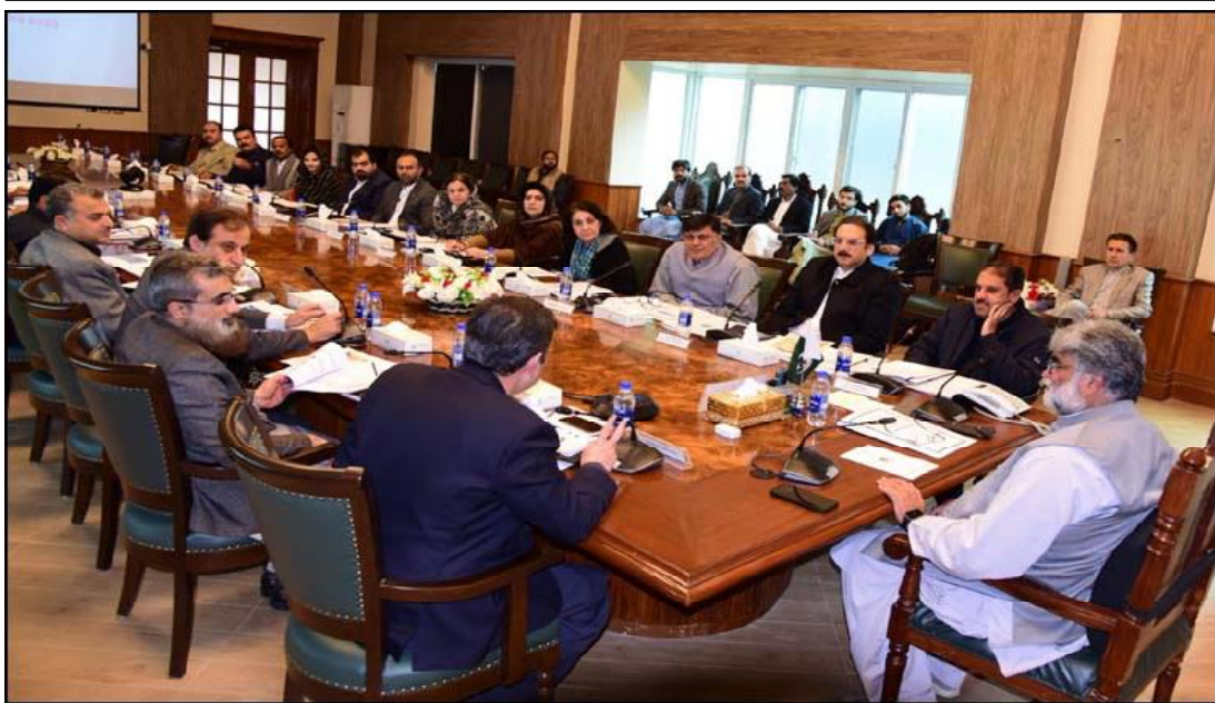
QUETTA: Caretaker Chief Minister Balochistan and Chairman Provincial Task Force on Population Mir Ali Mardan Khan Domki presiding over 2 nd meeting of Provincial Task Force on Population.