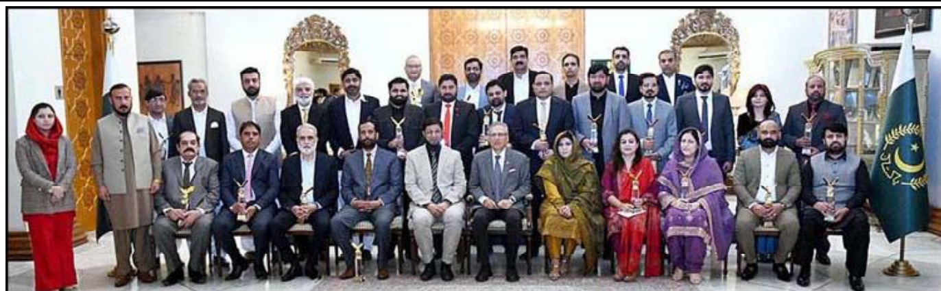
ISLAMABAD: President Dr. Arif Alvi in a group photo with the winners of the 2nd Islamabad Chamber of Small Traders and Small Industries achievement trophies at Aiwan-e-Sadr.

In spite of business fluctuations, an increase of 11 billion 24 thousand 24 lakh 91 thousand 189 rupees was recorded in the market capital, as a result of which the total volume of capital increased from 87 trillion 18 billion 28 billion 7 lakh 75 thousand 42 rupees to 87 trillion 29 billion 52 billion 32 lakh 66 thousand 231 rupees. 46 crore 71 lakh 59 thousand shares worth 18 billion rupees were traded in Pakistan Stock Market on Thursday while 69 crore 22 lakh 20 thousand shares worth 27 billion rupees.