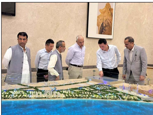
GWADAR: Caretaker Federal Minister for Maritime Affairs, Communication and Railway, Capt. (Retd) Shahid Ashraf Tarar undertook a comprehensive two-day visit to the port city of Gwadar to closely monitor and evaluate the progress of development initiatives.