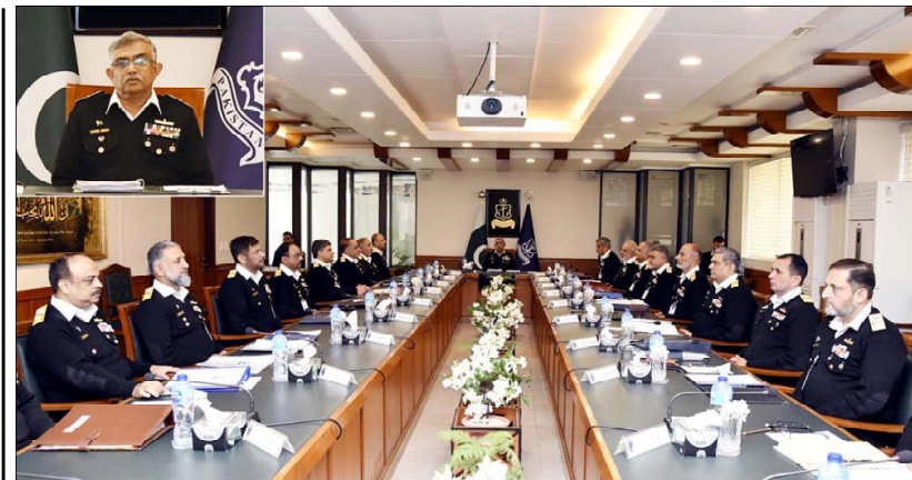
ISLAMABAD: Chief of the Naval Staff, Admiral Naveed Ashraf chairs the Command and Staff Conference held at Naval Headquarters in Islamabad.

ISLAMABAD (APP): Middle East, deployment of Pakistan Navy Ship for the protection of Pakistan's merchant ships was discussed. Progress on Pakistan Navy projects including future plans was also reviewed and way forward was deliberated. The Naval Chief emphasized on maintaining perpetual combat readiness to effectively thwart any aggression against Pakistan. He lauded the initiatives undertaken towards capability development through acquisition of state of the art platforms and emerging technologies.