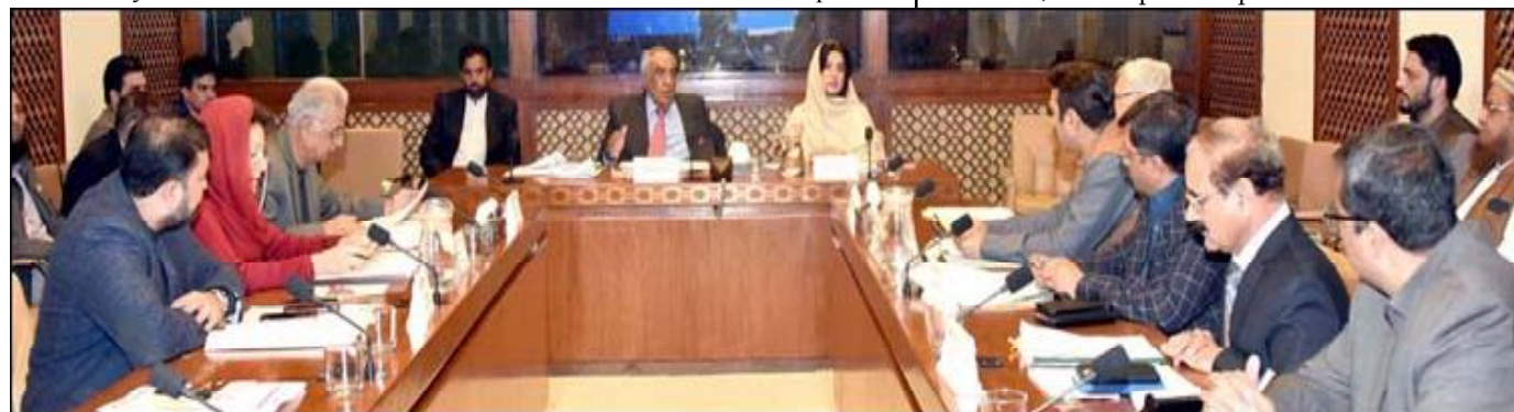
Senator Syed Muzafar Hussain Shah, Chairman Senate Standing Committee on National Food Security and Research presiding over a meeting of the Committee at Parliament House Islamabad.

Meanwhile, the production of passenger cars also declined to 19,861 units against the production of 42,114 units during July-October, the data revealed.