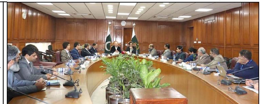
ISLAMABAD: Justice Mansoor Ali Shah Judge Supreme Court of Pakistan/Chairman National Judicial Automation Committee (NJAC) convened a meeting at Supreme Court.

The prime minister called upon all the partners engaged in the HIV response to join forces with the Ministry of National Health Services, Regulations, and Coordination to take timely action in safeguarding the well-being of our future generations.