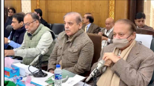
LAHORE: PML-N Quaid Muhammad Nawaz Sharif and President Muhammad Shahbaz Sharif presiding over 16th meeting of Parliamentary Board.

According to the ECP advisory, federal government employees up to grade 19 can have their leave sanctioned by DROs.