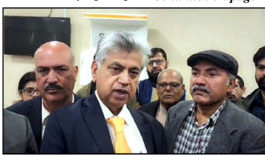
ISLAMABAD: Caretaker Federal Minister for Information Murtaza Solangi talking with media men.

It mentioned that the Cyber Crime Wing of the Federal Investigation Agency (FIA) was the competent authority to obtain information from the social media platforms under the Prevention of Electronic Crimes Act (PECA) 2016.