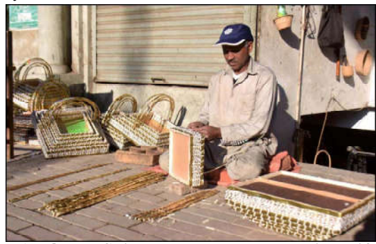
LAHORE: Skilled worker busy making gift baskets at his roadside setup.

The minister stressed that the use of electric rickshaws and bikes in Punjab will substantially decrease both air and noise pollution. With the provision of additional insights, these electric rickshaws boast an impressive range, capable of travelling up to 150 km on a single charge, he said. The adoption of electric vehicles, including cars and bikes, has gained prominence worldwide due to their efficiency, fuel-saving benefits, and zero emissions, contributing to a healthier and more sustainable environment, he explained. Many charging stations have already been established, with commitments to construct even more. It is a clear indication that the industry is committed to enabling widespread EV adoption, he added.