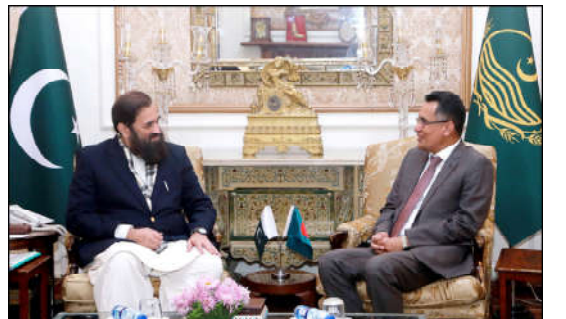
LAHORE: Bangladesh High Commissioner in Pakistan Ruhul Alam Siddique meeting with Punjab Governor Muhammad Baligh-ur-Rehman.

LAHORE: The Lahore Ring Road Southern Loop 3 project marks a significant stride towards completion, reaching the 60 percent milestone. Punjab Caretaker Chief Minister Mohsin Naqvi on Tuesday conducted a comprehensive review of the ongoing progress at Adda Plot Raiwind, personally inspecting the Lahore Ring Road Southern Loop 3 project. The chief minister examined the ongoing construction activities spanning 8 km from Adda Plot Raiwind to Maraka Multan Road. He closely observed the works on the entire route, including the construction of bridges. In response, the CM issued directives for the expeditious completion of the project. During a meeting at the FWO (Frontier Works Organisation) camp office chaired by Chief Minister Mohsin Naqvi, Colonel Jamal and Colonel Ahmed provided a detailed briefing on the project's progress. The meeting addressed various issues related to the project. Chief Minister Mohsin Naqvi emphasized that the completion of Ring Road Southern Loop 3 would enhance transportation facilities for the public. He highlighted the adherence to high standards in executing the project and expressed confidence in achieving its timely completion. Speaking to the media after the visit, he underscored the significance of SL 3, Gujranwala Expressway, and Band Road projects. He assured relentless efforts to complete these projects with the highest quality, overcoming challenges and working around the clock.