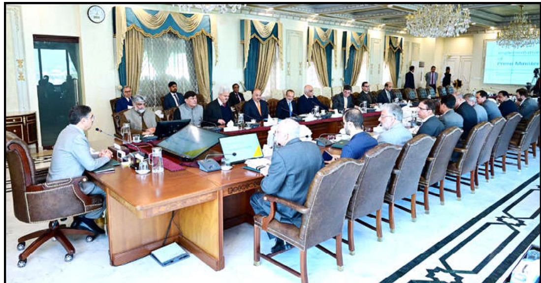
ISLAMABAD: Caretaker Prime Minister Anwaar-ul-Haq Kakar chairs a meeting on matters related to Balochistan.

Ph: 2841470/2841473 REG: No. EC-116 B/ID-445 Vt XXV No. 127, Jamadi-us-Sani 13, 1445 AH Wednesday December 27, 2023 Pages 08, Price Rs.15