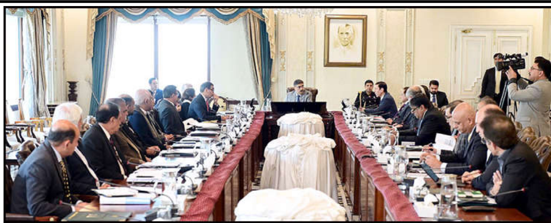
ISLAMABAD: Caretaker Prime Minister Anwaar-ul-Haq Kakar chairs a meeting on matters related to Khyber Pakhtunkhwa.