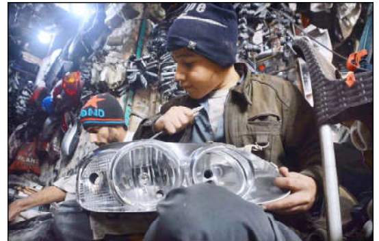
PESHAWAR: Youngster busy in repairing vehicle headlight at Shoba Bazar.

KARACHI (APP): Five ships namely, Msc Singapore, Al-Jalaa, Leena, Saehan Kostar and Lila Fortrier scheduled to load/offload Container, Fuel oil, Cement, Palm oil and Chemicals, berthed at Container Terminal, Oil Terminal, General Cargo Terminal, Liquid Terminal and Engro Terminal respectively on Monday. Meanwhile three more ships, MSC Jemima, Pacific Victory and Simaisma also arrived at outer-anchorage of the Port Qasim during last 24 hours to load/unload Containers, Coal and LNG respectively. A total of seven ships were engaged at PQA berths during the last 24 hours, out of them a containers ship ‘MSC Singapore’ left the Port on today morning on Tuesday. Cargo volume of 51,350 tonnes, comprising 27,049 tonnes imports cargo and 24,301 tonnes export cargo carried in 1,293 Containers (420 TEUs Imports and 873 TEUs export) was handled at the port during last 24 hours. There are 05 ships at Outer Anchorage of Port Qasim, out of them three ships, MSC Jemima,