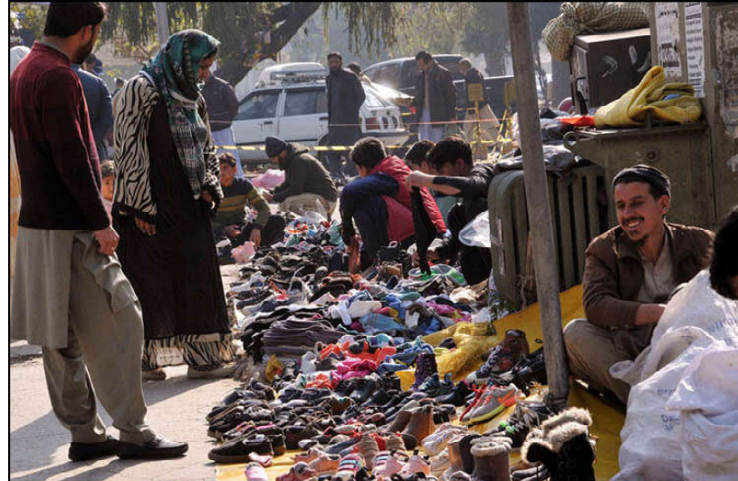
ISLAMABAD: Customers selecting and purchasing second hand shoes from the roadside vendors.

FAISALABAD (APP): Agriculture experts have advised growers to water their wheat crops on time to get healthy and bumper production. A spokesman for the Agriculture (Extension) Department said here on Tuesday that in most of wheat areas, growers did not care about timely watering wheat crops, which affected the quality as well as quantity of the production. He advised the growers to water their crop first time after 20-25 days of its cultivation whereas the second watering should be made after 70-80 days. The third watering should be made after 110-115 days of sowing, so that the grains could become fully developed, he added.