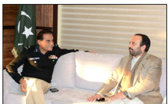
QUETTA: Caretaker Home Minister Captain (ret) Mir Muhammad Zubair Jamali in a meeting with Inspector General of Police Balochistan Abdul Khaliq Sheikh

He also stressed upon greater collaboration between Indian Ocean countries to exploit potentials of blue economy.