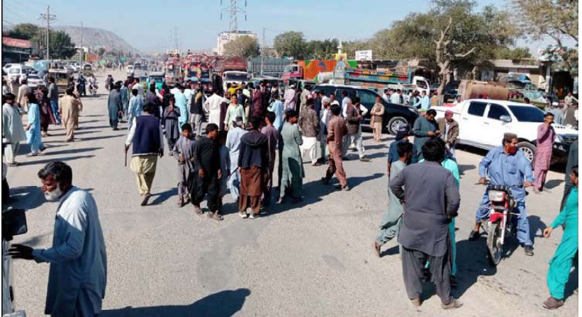
HUB: Members of Civil Society are holding protest demonstration for the establishment of local committee, outside Civic Center building.

from the country was the mission of Shaheed Mohtarma Benazir Bhutto and the completion of this mission was top priority of the Pakistan Peoples Party (PPP). Asif Zardari said that the martyred party chairperson was neither afraid of dictators nor did she fear the extremists. Her bravery was the legacy of the leadership and workers of Pakistan Peoples Party, he added. He said that the time was not far away when Shaheed Mohtarma Benazir Bhutto's Pakistan will be the realization of a Pakistan free of political, social and economic exploitation.