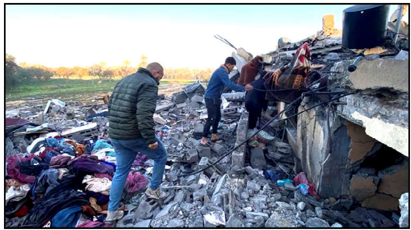
Palestinians inspect the site of an Israeli strike on a house, amid the ongoing conflict between Israel and Hamas, in Khan Younis in the southern Gaza Strip.

The government condemned the US strikes as "an unacceptable violation of Iraqi sovereignty."