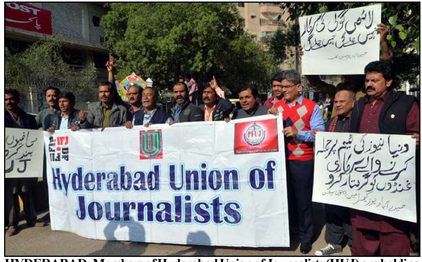
HYDERABAD: Members of Hyderabad Union of Journalists (HUJ) are holding protest demonstration against attack on private news channel, at Hyderabad press club.