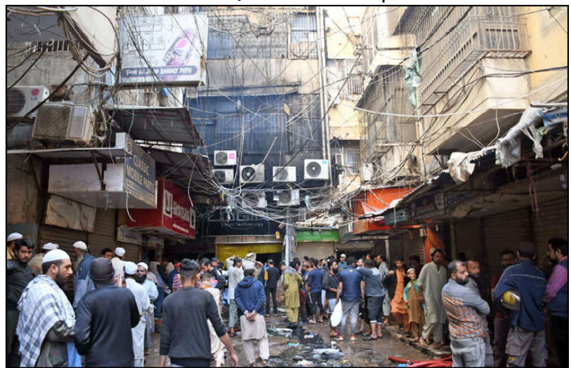
KARACHI: Volunteers conducted Search and rescue works after a fire broke out in Saddar's mobile market as more than 100 shops in the market were damaged and the trades suffered the loss of millions of rupees.

BALAKOT (Online): A jeep is reported to have plunged into deep ravine in the area of Ghanol Thanwan in Balakot leaving two persons including a local councilor dead. According to Rescue authorities the accident was so fatal that two persons including local councilor who were on board the jeep died on the spot. Rescue is shifting the bodies to hospital.