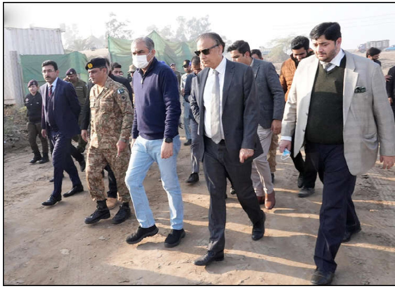
LAHORE: Caretaker Chief Minister Punjab Mohsin Naqvi inspecting the under construction work of Lahore Ring Road Southern Loop-III Project.