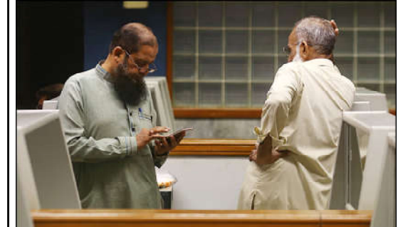
KARACHI: Stockbrokers monitor the share prices during a trading session at the Pakistan Stock Exchange (PSX) in Karachi, Pakistan, 26 December 2023. The Pakistani benchmark 100 index 59,170.97 was down 2534.12 with points during the trading session.

according to latest PBS data. The food products that contributed in the positive growth in of food trade included rice, the exports of which increased by 49.37 percent, from $749.407 million last year to $1,119.406 million during the ongoing fiscal year. Likewise, the exports of fruits increased by 15.27 percent, from $111.160 million to $128.139 million, leguminous vegetables by 79.01 percent.