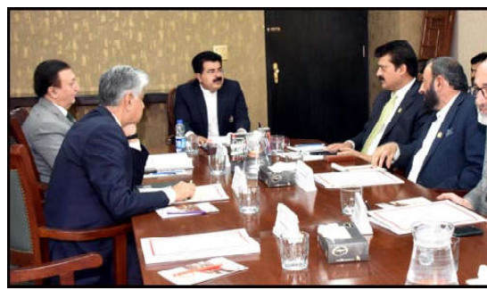
Chairman Senate, Muhammad Sadiq Sanjrani presiding over a Senate House Business Advisory Committee meeting at Parliament House, Islamabad.

ISLAMABAD (Online): Supreme Court (SC) has returned with objections against defence secretary. Civil society had filed contempt of court petition against defence secretary for not sending cases of those accused in May 9 and 10 incidents to criminal courts following the SC decision regarding nullification of civilian trial in military courts. SC returned the petition remarking the decision of nullification of civilian trial in military courts has been suspended on December 13. Therefore, the petition is not maintainable.