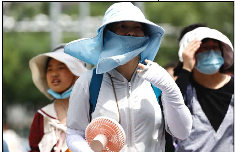
A woman uses a fan as she walks at a park amid an alert for heatwave in Shanghai, China.

Airlines like India's SpiceJet also took to social media to warn passengers that departures and arrivals from New Delhi may get affected "due to bad weather".