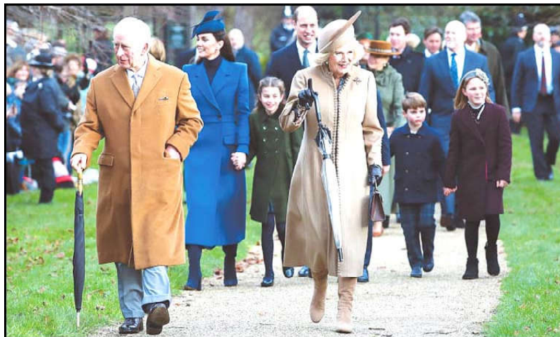
King Charles, Queen Camilla, Prince William, Princess Catherine, Princes George and Louis, and Princess Charlotte, arrive at St Mary Magdalene's church to attend the royal family's Christmas service.

higher priority than the protection of American personnel serving in harm's way. The United States will act at a time and in a manner of our choosing should these attacks continue," the statement added. The drone attack was claimed by the Islamic Resistance in Iraq, a loose formation of armed groups affiliated with the Hashed al-Shaabi coalition of former paramilitaries that are now integrated into Iraq's regular armed forces. A tally by US military officials has counted 103 attacks against its troops in Iraq and Syria since October 17, most of which have been claimed by the Islamic Resistance in Iraq, which opposes US support for Israel in its war against Hamas in the Gaza Strip.