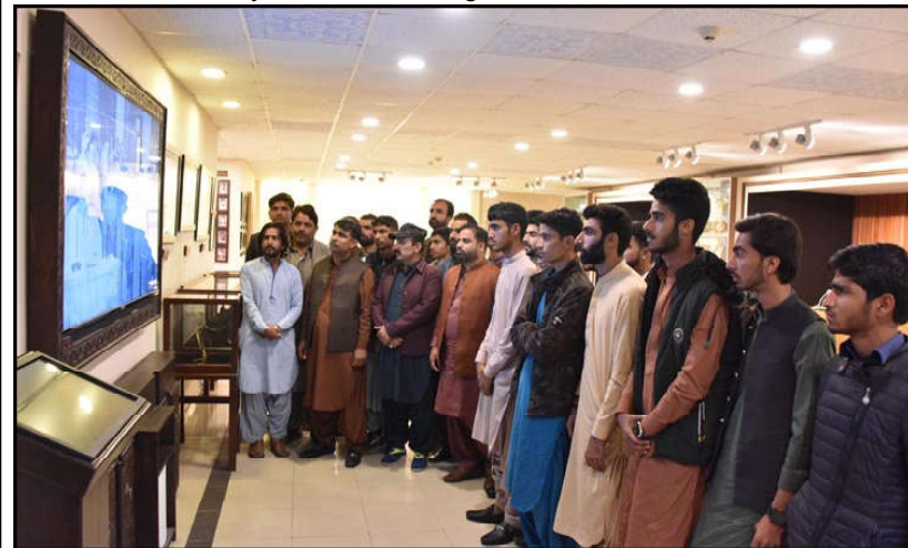
A group of students of the Government High School Shafi Muhammad Umrani, Naseerabad, Balochistan visiting Senate Museum at Parliament House, Islamabad.