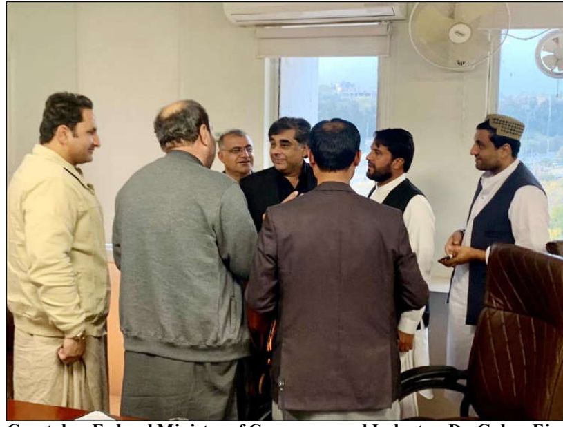
Caretaker Federal Minister of Commerce and Industry, Dr. Gohar Ejaz interacting with the members of the Chairman Chamber of Commerce and Industry at the Commerce Ministry in Islamabad.