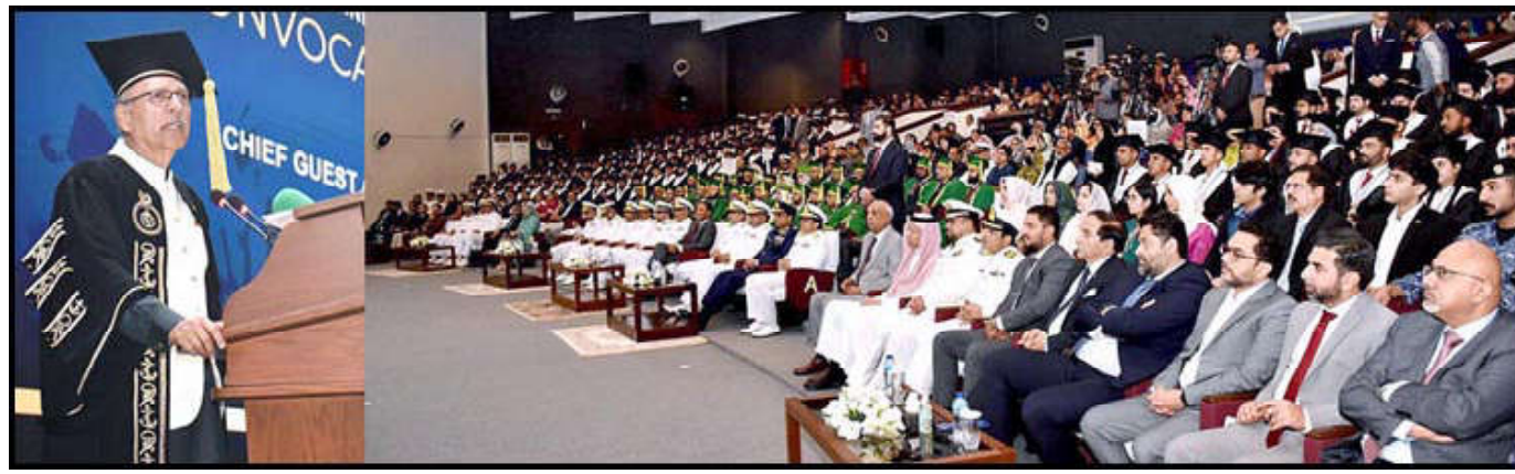
KARACHI: President of Pakistan, Dr. Arif Alvi addressing the Pakistan Navy Engineering College (PNEC) Convocation 2023.