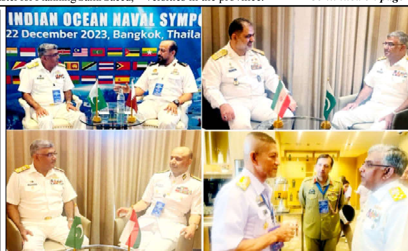
Chief of the Naval Staff Admiral Naveed Ashraf interacting with Heads of various Navies during 8th Indian Ocean Naval Symposium (IONS) in Bangkok, Thailand

He said he had an earlier discussion with the Chairman of Pakistan Electronic Media Regulatory Authority (PEMRA) regarding the forced dismissal Continued on page 2