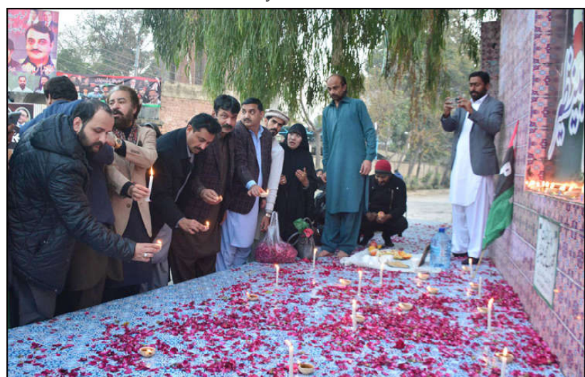
RAWALPINDI: Workers of Pakistan Peoples Party light up the candles in memorandum of Former Prime Minister Benazir Bhutto (Shaheed), at her targeting place, Liaquat Bagh in City.