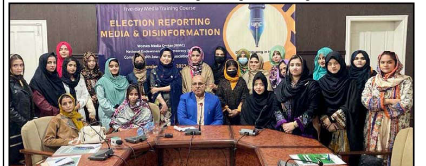
QUETTA: Caretaker Information Minister Jan Achakzai photographed with participants of a workshop organized by Women Media Center.

sources as an ex-officio member. She said since the Parliament only comprised of the Senate as the National Assembly did not exist so nominations for the Caucus should be made from the Senate. "The honourable Chairman Senate may also be authorized to make nominations from the Senate to the Caucus and make changes in its composition as and when required.