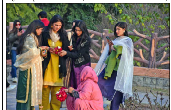
ISLAMABAD: Younger Girls from christen Community are buying traditional "Gajray" from woman vendor at Lake View Park during the celebrations of Christmas in Federal Capital.