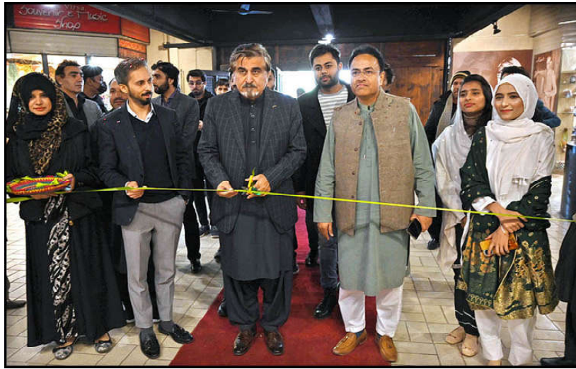
ISLAMABAD: Caretaker Federal Minister for National Heritage and Culture, Jamal Shah cutting ribbon to inaugurate Exhibition of Books and Photographs in connection with upcoming Quaid-i-Azam Day at Heritage Museum, Lok Virsa.

The exhibition will remain on display at the Heritage Museum, Lok Virsa till 25 December.