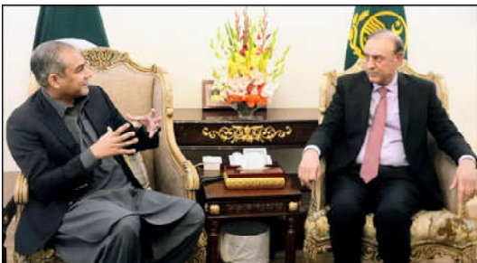
LAHORE: Governor of the State Bank of Pakistan (SBP) Jameel Ahmad called on Punjab Caretaker Chief Minister Mohsin Naqvi.

Recognizing that enhanced production of cotton, rice and other crops will contribute positively to the national economy, the SBP Governor expressed optimism about the future economic landscape and commended the CM for his valuable initiatives to improve different sectors including agriculture.