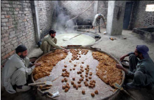
PESHAWAR: Laborers busy in extracting sugarcane juice and boiling it to prepare treacle (Gur) using old traditional methods, which is also known as Indian Jaggery in South Asian markets.

The main contributors towards overall negative growth of 0.44% are Food (0.61), Tobacco (-0.71), Textile (-3.12) Garments (3.98), Petroleum Products (0.49), Chemicals (0.22), Pharmaceuticals (1.66), Cement (0.42), Iron & Steel Products (-0.10), Electrical Equipment (-0.50) and Automobiles (-1.51).