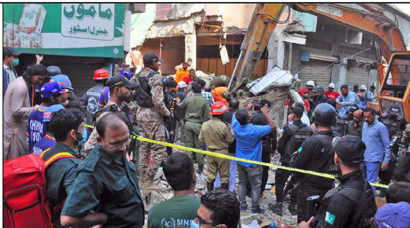
KARACHI: Volunteers and Security personnel are busy in assistance in cemented debris of buildings after gas cylinder blast at Machar Colony in Provincial Capital.

Upon inspection of the toolbox section's spare wheel, officials uncovered 57 packets of hashish weighing 70 kilograms.