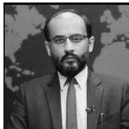
Dr Khalid Waleed

As the gavel struck, finalizing the 21-page deal at the COP28 summit in Dubai, a wave of mixed emotions swept across the faces of delegates. It was a moment of historical significance, and yet one marred by the realization that the path to combat climate change remains steep and treacherous.