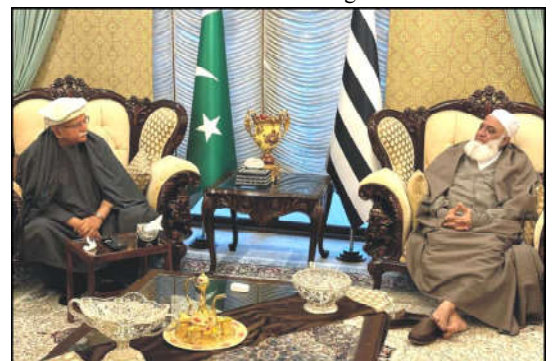
ISLAMABAD: Chairman Pakhtoonkhw Milli Awami Party Mahmood Khan Achakzai meeting with Amir Jamiat Ulama-e-Islam Maulana Fazlur Rehman.

The Governor said that planning and experts opinion has very key role and importance in the development process, but there is a need to review the needs of common men before start of the projects and any policy. Moreover, the public requirements and modern needs should also be made part of the development projects and policies, adding he stressed.