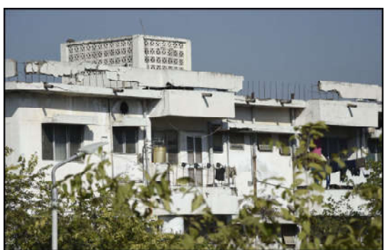
ISLAMABAD: A view of weary condition residential building at sector G-11 in Federal Capital, which may cause any incident any time as needs to attention for concern authority.

He said that the sanctions critically target infrastructure, and are meant to deprive Iran from developing as a vibrant nation-state.