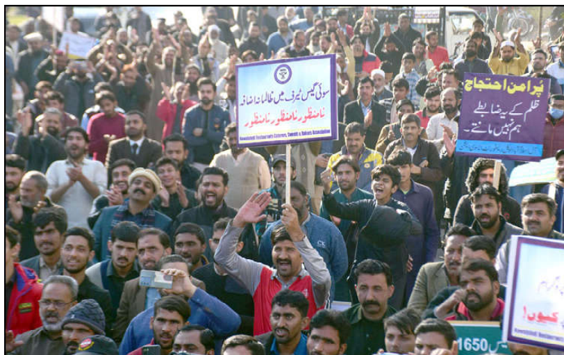
ISLAMABAD: Traders associated with hotel industry holding banners are shouting slogans during protest outside OGRA Office against the unjust price hike of gas, in Country.

KARACHI (APP): Shipping activity reported at the Port where three ships namely, MSC Prelude V, Stamina SW and Serengeti scheduled to load/offload Container, Rice and Gas oil, berthed at Container Terminal, Multi-Purpose Terminal and Oil Terminal respectively on Sunday. Meanwhile two more ships, Clean Sanctuary and Kamome Victoria also arrived at outer anchorage of the Port Qasim on same day to unload Petroleum Products respectively. A total of five ships were engaged at PQA berths during the last 24 hours, out of them a containership 'MSC Prelude V' left the port on today morning and another ship.