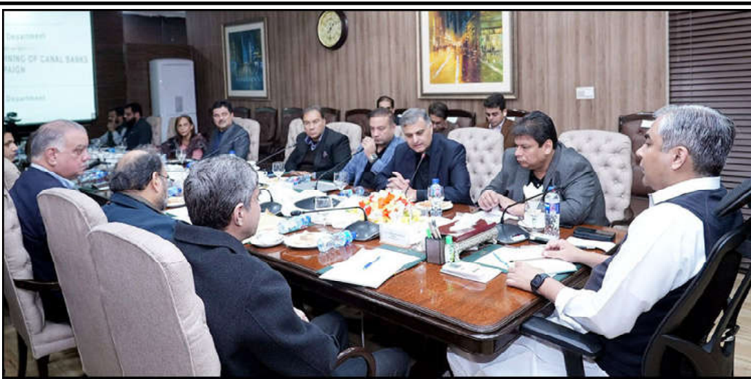
LAHORE: Caretaker Chief Minister Punjab Mohsin Naqvi chaired a special meeting in which approval for desilting 15300 miles long canals accorded.