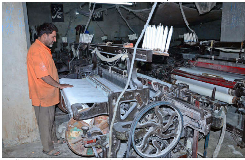
FAISALABAD: A worker is busy in his work on power loom at textile factory in city.

The price of gold in the international market increased by $3 to $2,043 from $2,040, the Association reported.