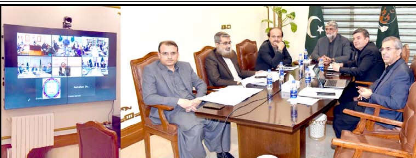
QUETTA: Caretaker Chief Minister Balochistan Mir Ali Mardan Khan Domki speaking through video link at the meeting held under chair of caretaker Federal Minister Finance, Shamshad Akhtar on the provincial financial matters in Islamabad

He emphasized the urgency of a ceasefire, lifting of the siege, provision of uninterrupted humanitarian assistance, including medical supplies to the people of Gaza, and the resumption of diplomatic efforts for lasting peace in the Middle East based on a just solution to the Palestinian question.