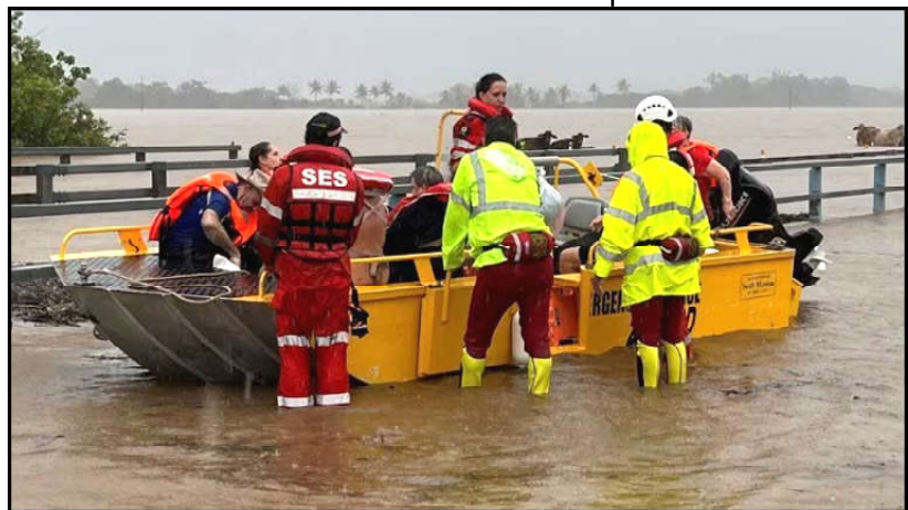
State Emergency Service personnel evacuating people from flood waters in far north Queensland, Australia following heavy rain and flooding from tropical cyclone Jasper.

That day, militants used a rocket-propelled grenade to break past the portion of wall close to the Erez crossing and stormed the base, killing at least three soldiers and kidnapping some back to Gaza, the army said.