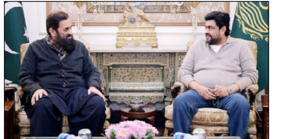
LAHORE: Governor Sindh Kamran Khan Tessori meeting with Punjab Governor Muhammad Balighur Rehman at Governor House.

He informed his counterpart from Sindh about the steps taken to improve the quality of universities in the province. He said that educated youth are the asset of the country. He emphasized that along with education, there is a need to focus on their character building. On this occasion, Governor Sindh Kamran Khan Tessori appreciated the initiative of opening the Governor House Lahore to the public in an organised manner.