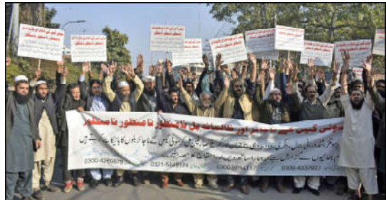
LAHORE: Activists of Hotel Association holds protest in the favor of their demands outside Press Club in Provincial Capital.