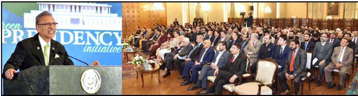
ISLAMABAD: President Dr Arif Alvi addressing the event to celebrate Award Winning Project Green Presidency, at Aiwan-e-Sadr.