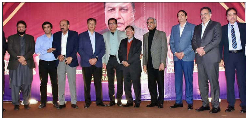
SIALKOT: A group Photo of Provincial Minister Industries Commerce, Investment and Skills Development/Energy and Agriculture Punjab SM Tanveer with exporters during a reception by SCCI.

He said, "Changshu and Pakistan are becoming increasingly close. We have mutually invested in high-quality projects and maintained interactions in textiles, agriculture, and other fields. I hope both sides can further explore new areas of cooperation in renewable energy."