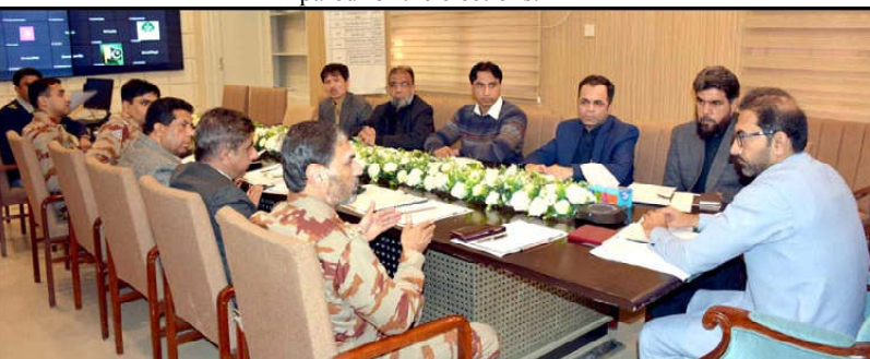
QUETTA: Additional Chief Secretary Home Zahid Saleem presiding over a meeting regarding Security Plan during general elections