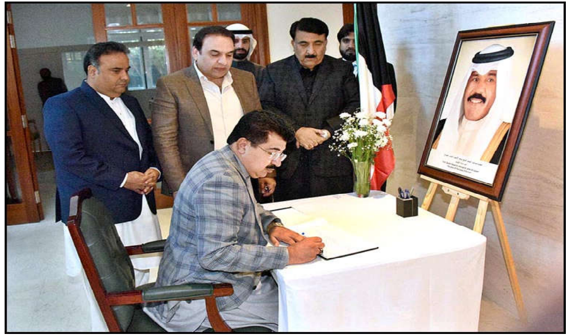
ISLAMABAD: Chairman Senate, Muhammad Sadiq Sanjrani recording his condolence on the demise of AMIR of Kuwait Sheikh Nawaf Al-Ahmad Al-Jaber Al-Sabah in the visitor's book at Embassy of Kuwait.

Tahir Mahmood Ashrafi said that Pakistan wanted cordial and brotherly relations with all its neighbors and peace in Afghanistan was in the interest of Pakistan. He said anti-Pakistan and Afghanistans elements wanted to create a rift among both the countries but they would never succeed in their nefarious designs. He said Pakistan's stance on the Palestine issue was very clear. He said atrocities in Gaza should be immediately stopped. He said the sacrifices of the people of Palestine would not go to waste. He said an independent and sovereign Palestine state with Al-Qudus Al-Sharif as its capital would help in enduring lasting peace in the Middle East.