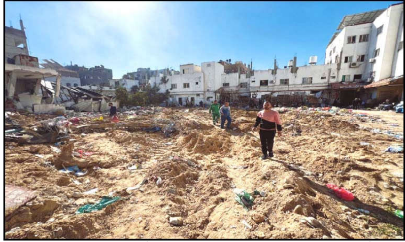
Bulldozer tracks are seen in the area where tents were erected outside the Kamal Adwan Hospital by displaced people. Palestinian authorities have accused Israel of razing the area as people slept.

At the Kamal Adwan hospital, the Gaza health ministry said Israeli troops made hundreds of internally displaced persons leave, and evacuated wounded patients and medical staff to the hospital grounds.