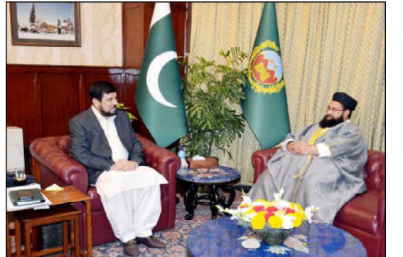
PESHAWAR: SAPM for Inter-Religious Harmony Maulana Tahir Ashrafi meeting with Khyber Pakhtunkhwa Governor Haji Ghulam Ali.