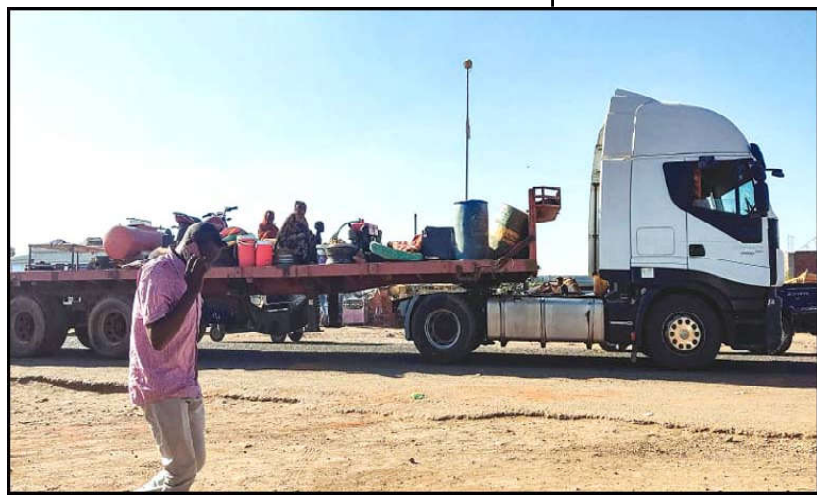
Displaced people fleeing from Wad Madani in Jazira state arrive in Gedaref in the country's east.

Earlier, the health ministry in Gaza said that Israeli troops had expelled hundreds of people taking refuge inside the hospital, and ordered the wounded patients and medical staff to relocate to the hospital grounds.