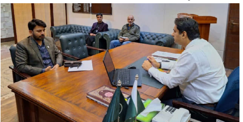
QUETTA: Commissioner Quetta Division Hamza Shafqaat in a meeting with representatives of Health Department and anti-polio team

The Chairman's visit stands as a testament to the enduring bond between Pakistan and Kuwait, showcasing solidarity and sympathy during this period of mourning.