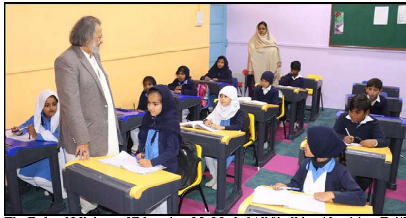
The Federal Minister of Education, Mr. Madad Ali Sindh paid a visit to F-6/3 School to witness firsthand the remarkable efforts undertaken by the local community to enhance the school's facilities and educational standards in Islamabad.