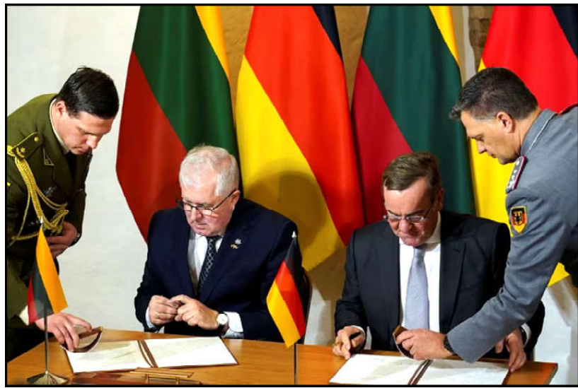
German Defence Minister Boris Pistorius and Lithuanian Defence Minister Arvydas Anusauskas sign an agreement for further deployment of thousands of German troops to the Baltic country in Vilnius, Lithuania.

On Monday in Guangdong, where snow is generally limited to the northernmost areas, snowfall blanketed the top of a mountain in a city just 80 km (50 miles) north of the provincial capital Guangzhou by the coast. A low of 8 degrees Celsius (46.4 Fahrenheit) was forecast for Guangzhou, compared to the province's typical early winter temperatures that hover in the double digits, while January averages around 14 Celsius (57 Fahrenheit). Guangzhou officials urged precautions, especially for the old and young who may be vulnerable to "cold wave illnesses".