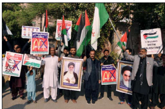
HYDERABAD: Members of Asgharia Ilim-o-Amal Tehreek Pakistan are holding protest demonstration against Israeli aggression and atrocities on the Gaza Strip and solidarity with the Palestinians, at Hyderabad press club.

The official of the Home and Tribals Affairs said that 265,256 people have been sent to Afghanistan from the three borders of Peshawar, Khyber Pakhtunkhwa and according to the latest survey by Deputy Commissioners, Peshawar.