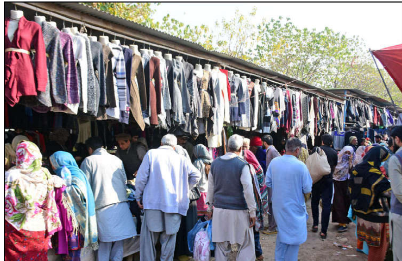
ISLAMABAD: People are busy in buying warm clothes in Landa bazaar at G-10 Sunday weekly bazaar in Federal Capital.

The LCCI office-bearers said that Special Investment Facilitation