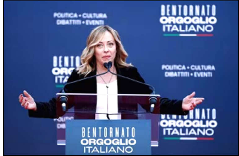
Italian Prime Minister Giorgia Meloni attends political festival Atreju organised by Brothers of Italy (Fratelli d'Italia) right-wing party, in Rome, Italy.

Monitoring Desk MOSCOW: Russian rocket forces have loaded a new Yars intercontinental ballistic missile into a silo at the Kozelsk base in the Kaluga region, southwest of Moscow, the defence ministry said. The 23-metre long RS-24 (Yars) missile is designed to carry multiple independently targetable re-entry vehicles (MIRVs), which allow the missile to deliver multiple nuclear warheads at different targets. "In the Kozelsky compound, Strategic Mis-