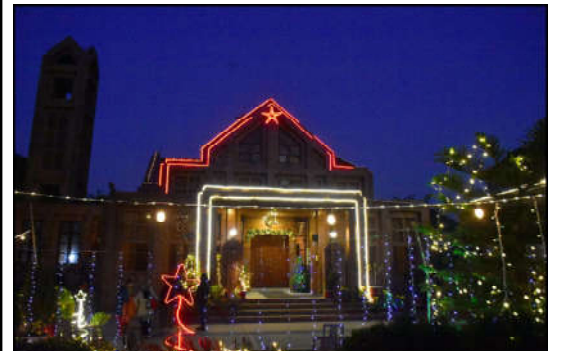
ISLAMABAD: A view of illuminated with colorful lights of S.T Thomas Church in connection with to celebrate Christmas ceremony on 25th December in Federal Capital.

As the extensive work on the laying of new road lanes has been completed up to PWD interchange with smooth and rapid vehicular traffic, the route of Blue Bus service should be extended to PWD interchange to facilitate a large number of commuters, students, and office-going people, Raziq Ali Shah, a senior journalist and resident of Jinnah Garden, asserted. Shaheena Jabeen and Humaira, two working women and residents of Korang town, opined that they conveniently moved to their workplaces located in the Blue Area regularly by boarding the Blue buses.