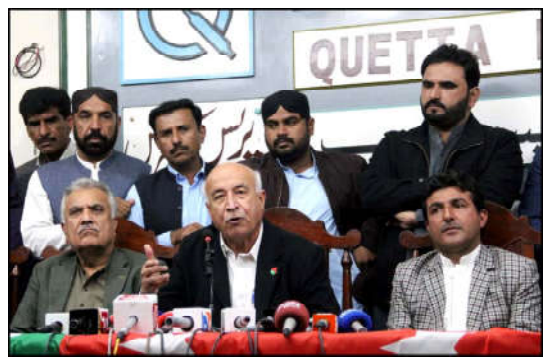
QUETTA: National Party (NP) Central President, Dr. Abdul Malik Baloch along with others addresses to media persons during press conference, at Quetta press club.

It may be mentioned here that some nine persons had lost lives while over 50 injured in the suicide blast hit the Methodist Church.