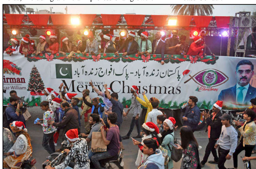
KARACHI: Christian's community wearing Santa Claus costume, participate in a Christmas peace rally ahead of the celebration of Christmas.