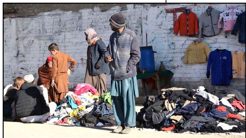
QUETTA: People buy warm clothes from a roadside vendor in the freezing weather in the Provincial Capital.

During the training session, the ROs and DROs would also be administered oath about their responsibilities.