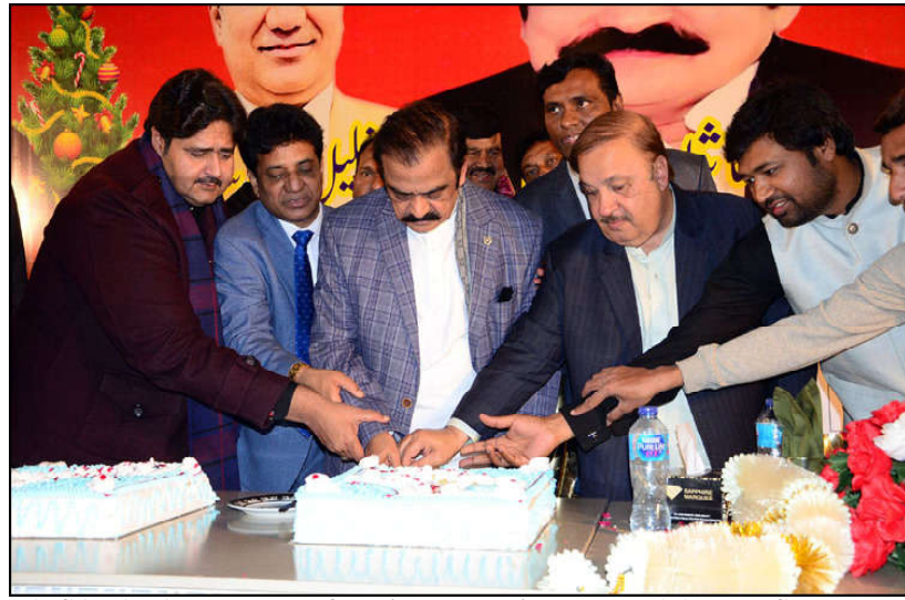
FAISALABAD: Leader of Pakistan Muslim League (N) Rana Sana Ullah Khan, President of Muslim League-N Minority Wing Punjab Khalil Tahir Sandhu and others cutting the Christmas cake during a Christmas Milan Party ceremony in the city.

The CM said that in a world that constantly presented us with new challenges, a hospital was not merely a structure of bricks and mortar but a symbol of hope, compassion, and healing. He added that the UMC hospital would stand tall as a testament to our unwavering commitment to providing world-class healthcare services to our people, embracing the latest advancements in medical science and technology.