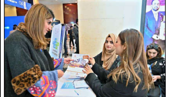
ISLAMABAD: People visiting stalls during 3rd Pakistan International Property Housing and Construction EXPO 2023 organized by Pakistan Association of Exhibition Industry (PAEL) at Pak China Friendship Centre.