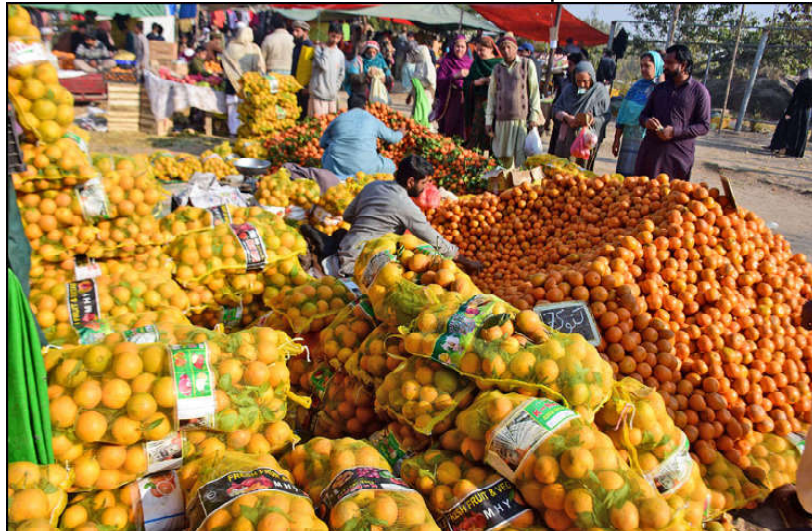
ISLAMABAD: People are busy in buying Fruit Kinow at G-10 Sunday weekly bazaar in Federal Capital.