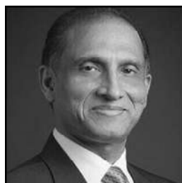
Aizaz Ahmad Chaudhry

At the outset, it is important to recognise that the US has already chosen its strategic partner in South Asia: India. The US requires India's cooperation in pursuit of its priority national security objective: strategic competition with China and containing the latter's economic rise. The US might perceive Pakistan to be a hurdle in two respects: its close friendship with China and its mutually hostile ties with India. This bigger picture is not likely to change soon.