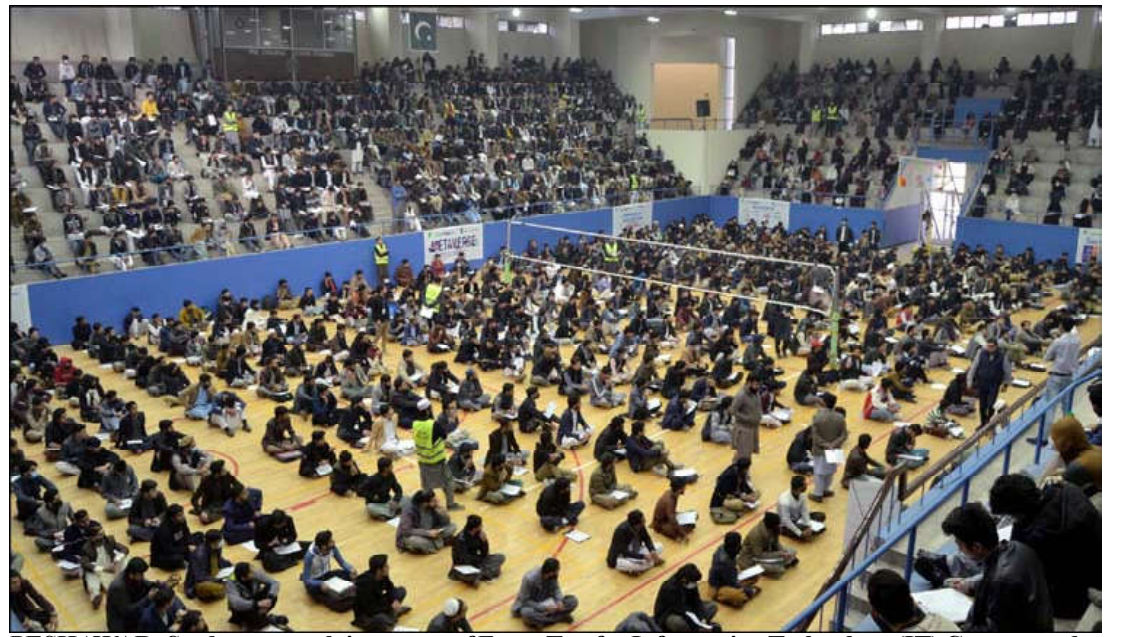
PESHAWAR: Students are solving paper of Entry Test for Information Technology (IT) Courses under the supervision of Saylani Welfare International Trust and arranged by Aziz Jan Trust.

try, emphasized the robust foundation of the China-Pakistan relationship, attributing it to the profound political trust, particularly exemplified by the China-Pakistan Economic Corridor (CPEC). She expressed the confidence in ongoing collaboration with the Pakistani government and encouraged media and citizens to contribute valuable insights for the continued success of China-Pakistan relations. She highlighted the warm reception of Pakistani visitors in China, underscoring the reciprocal treatment she and her family receive in Pakistan.