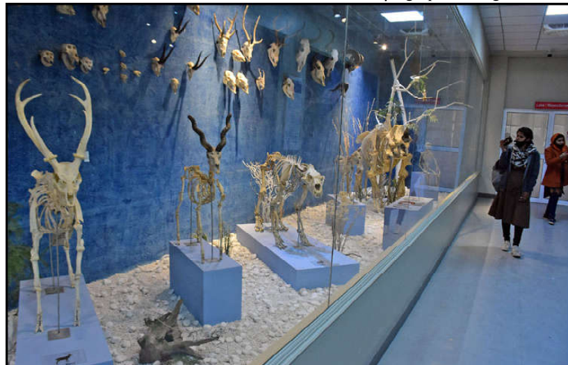
ISLAMABAD: Visitors are looks animals Skeleton in Pakistan Museum of Natural History, in Federal Capital. Pakistan museum of natural history, established in 1976, is a public natural history museum situated in Islamabad, the federal capital of Pakistan.

Sixteen individuals were apprehended and whisked away to Kohsar Police Station, leaving the swanky streets temporarily beggar-free, ICT spokesman Dr Abdullah Tabasum said. He said that this action wasn't just about cleaning up the cityscape from professional beggars. While adult beggars faced legal proceedings,