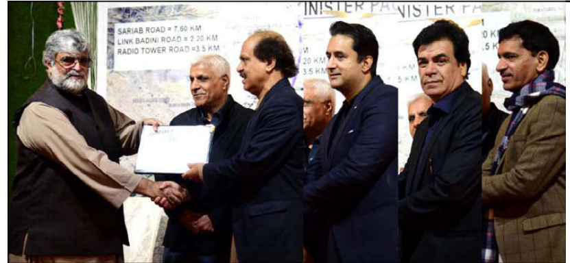
QUETTA: Caretaker Chief Minister Balochistan Mir Ali Mardan Khan Domki distributing appreciation certificates among officers on completion of Quetta Development Package project