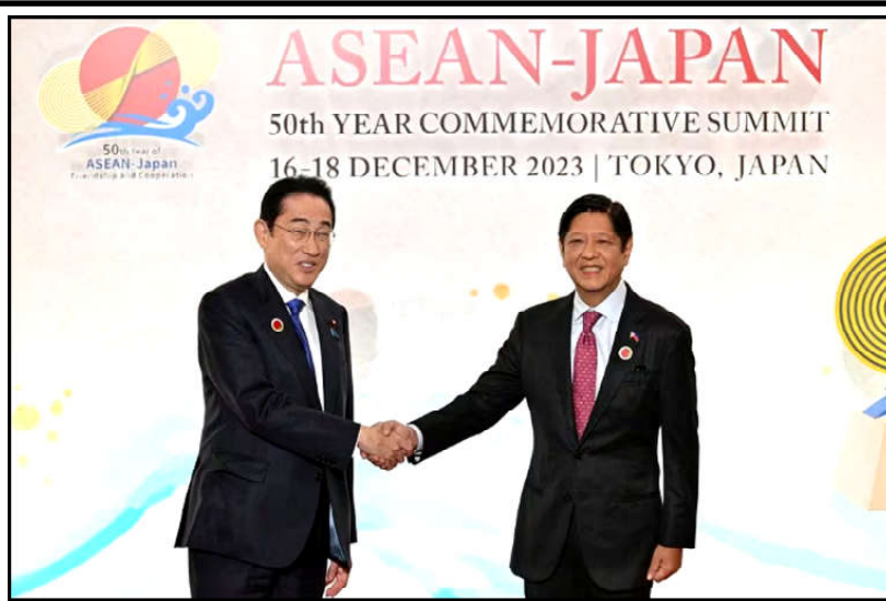
Japan's Prime Minister Fumio Kishida greets Philippines' President Ferdinand Marcos Jr. upon arrival for the opening session of the ASEAN-Japan Commemorative Summit Meeting at the Hotel Okura Tokyo in Tokyo, Japan.

Deadly incidents this year included one in June, when a fishing boat packed with hundreds of migrants sank off Greece after departing from Tobruk, Libya. The voyage, which was supposed to end in Italy, resulted in 78 recorded deaths with the fate of 518 others unknown, according to an IOM report. Drowning was the main cause of death on migration routes globally in the first half of 2023, with 2,200 recorded fatalities in the period, according to the IOM report.