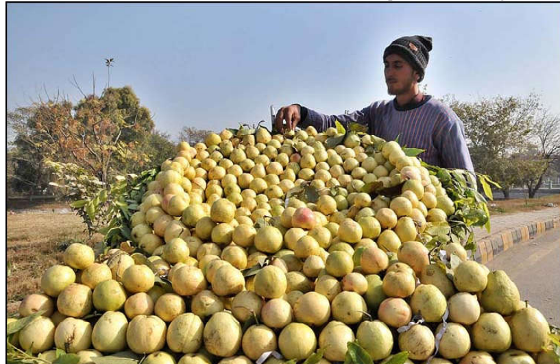
ISLAMABAD: A vendor arranging and displaying guava to attract the customers at G-9/4 in Federal Capital.

"The import and export of billing units had started from 18,310 net metering connections with a total capacity of 201.09 MW," he informed. "Total exports and imports from these connections stood at 254,454,591 units and 411,934,674 units respectively." Asim said the company had paid an amount of Rs 2,995,823 to connections' holders till March 2023.