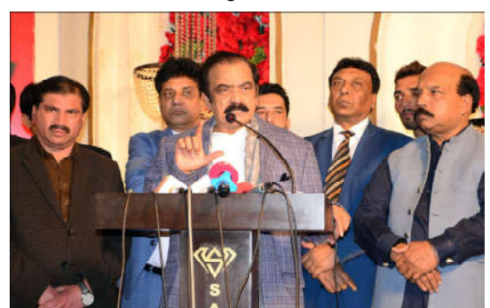
FAISALABAD: Leader of Pakistan Muslim League (N) Rana Sana Ullah Khan addressing during the Christmas Milan Party ceremony in the city.