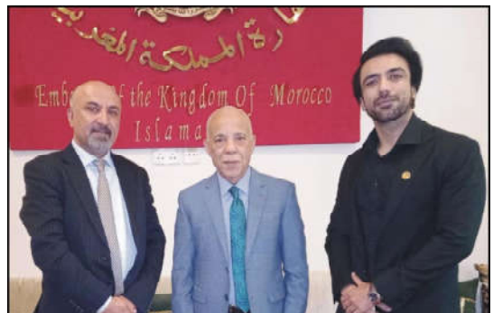
rocco. During the meeting, several areas of multilateral interests, economic and business engagement, investment, promotion of bilateral trade, economic cooperation, investment, and exchange of trade delegations and trade development were discussed in detail. Both sides also addressed the various prospects and dimensions of strengthening relations in the future.