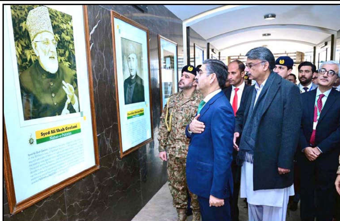
MUZAFFARABAD: Caretaker Prime Minister Anwaar-ul-Haq Kakar visits the Yaadgaar-e-Shuhada to pay tribute to the martyrs.

The Group of Four, which is campaigning for permanent seats on the Council, has shown no flexibility in their campaign for expanding the Council by 10 seats, with six additional permanent and four non-permanent members.