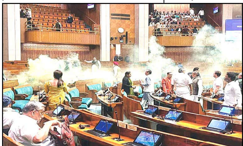
Indian parliament building shows yellow smoke billowing out of a canister.