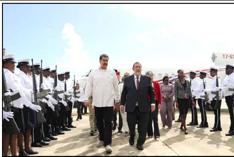
Venezuela's President Nicolas Maduro is received by the St. Vincent and the Grenadines' Prime Minister Ralph Gonsalves before a meeting with his Guyanese counterpart Irfaan Ali amid tensions over a border dispute, in Kingstown, St. Vincent and the Grenadines.