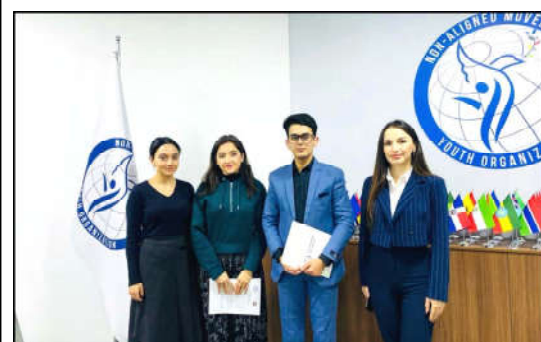
QUETTA (PR): A momentous Memorandum of Understanding (MoU) has been signed between the Organisation of Islamic Youth and the Non-Aligned Movement Youth Organization.

The signing ceremony took place at the Headquarters of the Non-Aligned Movement Youth Organization in Baku, Azerbaijan.