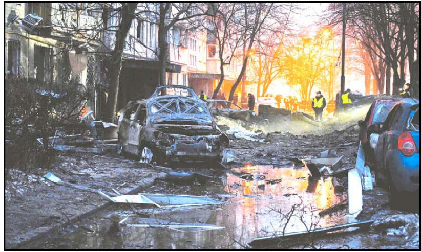
A view of destroyed cars next to a damaged residential building following a Russian missile strike.

"There is no need," for mobilization now, Putin said, because 1,500 men are being recruited into the Russian army every day across the country.