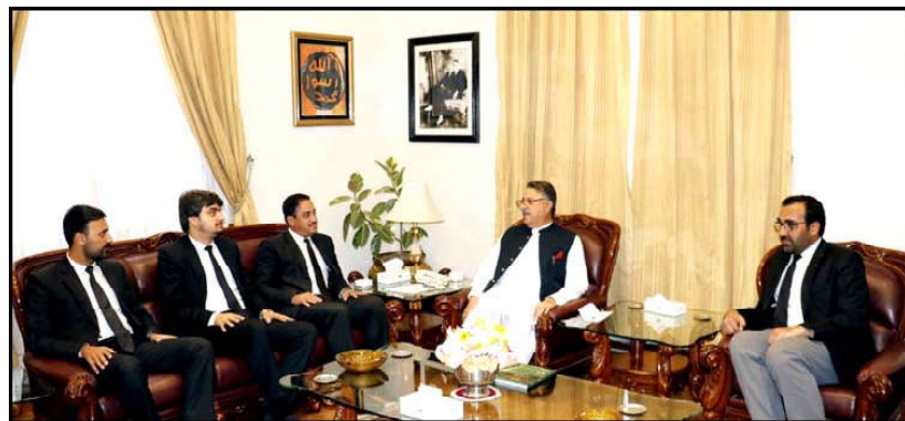
QUETTA: A delegation of lawyers led by Advocate Asif Tareen meeting with Governor Balochistan Malik Abdul Wali Khan Kakar