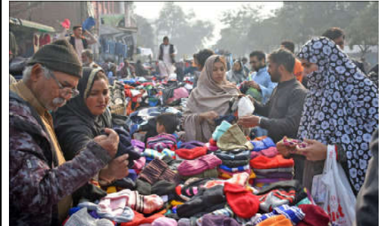
LAHORE: People are buying woollen clothes from vendors at road side flea market to counter the winters spell in Provincial Capital.