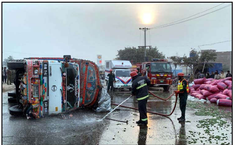
MULTAN: View an overturned truck that was fells down due to over speeding after traffic accident while rescue operation is underway, in Multan.

He welcomed public-private partnerships, citing the establishment of four integrated tourism zones, with a special focus on Chitral, as a testament to the region's dedication to enhancing tourist attractions. Expressing gratitude to the Pakistan Army for their support in organizing the successful Chitral Symposium, Minister Kakakhel praised the Department of Tourism and Culture and Tourism