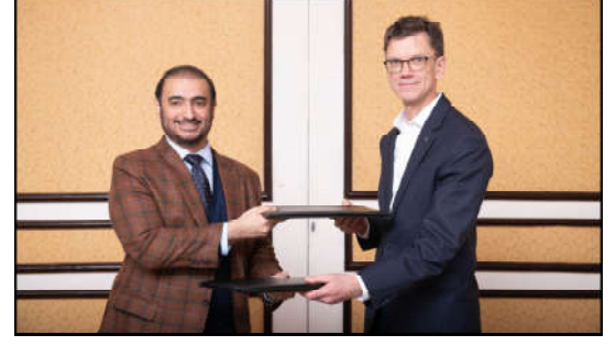
the digital transformation journey.

a historic telecommunications system that fosters connectivity and supports the digital transformation journey. He said that the completion of the acquisition was subject to regulatory approvals and customary closing conditions. PTCL is actively working towards a smooth transition process to ensure minimal disruption for employees, customers, and other stakeholders.