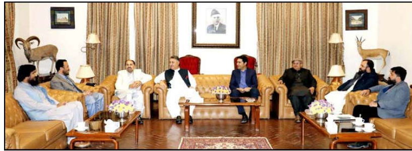
QUETTA: Governor Balochistan Malik Abdul Wali Khan Kakar presiding over a meeting held to review different aspects of implementation of IT initiative programme.

(CEC) and apprised him about the reservations and need to provide level playing field in the upcoming polls. The CEC has assured them that there will be no delay in the elections, he added. He said that the masses should decide to vote for any political party in general elections as it was the right of the people to vote and elect the party to rule in the country. The PPP leader said, "The masses will not accept any government unless free and fair elections are ensured. The credibility of the Parliament will be nothing if free, fair and transparent elections were not conducted in the country."