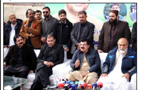
QUETTA: Chairman Senate, Muhammad Sadiq Sanjrani addresses to media persons during press conference, in Quetta.