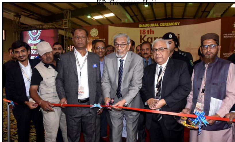
KARACHI: Caretaker Chief Minister Sindh Justice (ret'd) Maqbool Baqar inaugurates 18th International Book Fair at Expo Centre.

The minister stressed the importance of ensuring that development initiatives were inclusive and considerate of the needs of all communities.