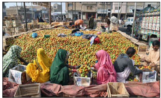
HYDERABAD: Labourer women busy in packing the tomatoes in the wooden boxes at Vegetable Market.