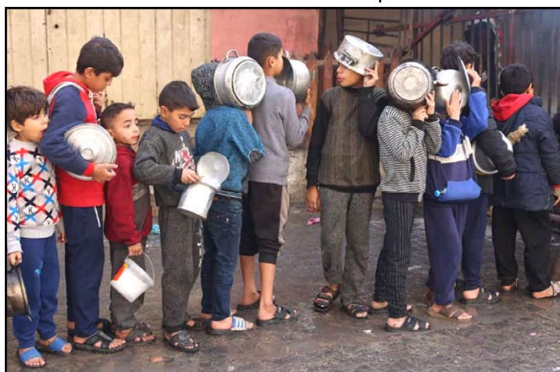
Palestinian children hold pots as they queue to receive food cooked by a charity kitchen, amid shortages in food supplies, as the conflict between Israel and Hamas continues, in Rafah in the southern Gaza Strip.