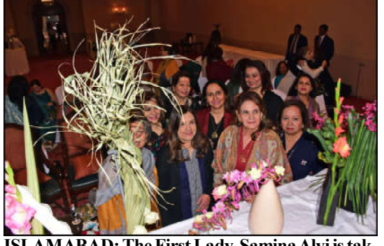
ISLAMABAD: The First Lady, Samina Alvi is taking keen interest in different kinds of flowers on stall during a workshop on the topic of "New Trends and Techniques in Floral Art" by Aisha Zahid at local hotel in Federal Capital.

of sustained efforts within the specific challenges faced in Pakistan. "A holistic and long-term approach is essential to counter the nuanced threat posed by new nicotine products within our unique cultural and social landscape. CTFK is committed that, with the support of its partners, it will keep countering the efforts of the tobacco industry to derail Pakistan's health and economy." Dr. Ziauddin Islam, former technical head, Tobacco Control Cell, Ministry of Health, offered an in-depth exploration of traditional and new types of nicotine products. He said, "The myth of 'less harm' has been meticulously dispelled, exposing the specific health threats these products pose for both adults and children in the Pakistani context. The so-called 'less harm' is enough to cause serious risks to the physical and mental health of consumers." Malik Imran Ahmad, Country Head, CTFK Media and New Nicotine Products shared the insights from the field, stating, "Our scrutiny uncovered the target audience of these products.