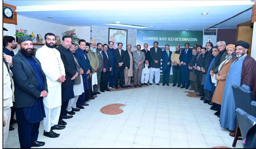
MUZAFFARABAD: A delegation of Hurriyat leaders calls on the Caretaker Prime Minister Anwaar-ul-Haq Kakar.