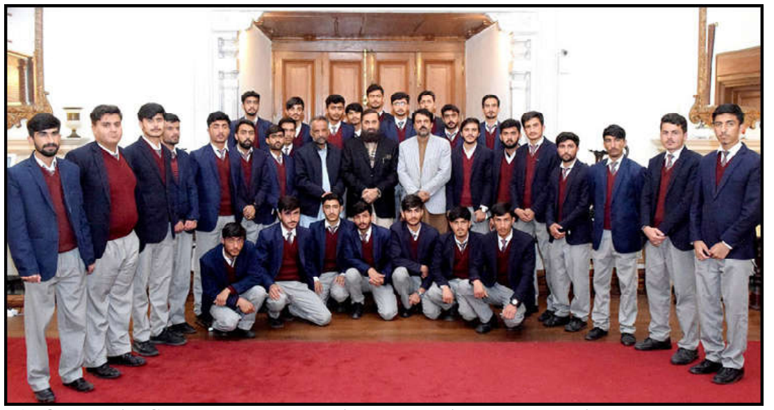
LAHORE: Punjab Governor Muhammad Balighur-Rehman in a group photo with teachers and students of Balochistan Residential College Loralai.

2013 and 2018, special measures were taken to bring Balochistan into the stream of development. He said that a special quota has been fixed for the students of Balochistan in the universities and medical colleges of Punjab. Governor Punjab said that the continuation of public welfare policies is very important for the development of the country.