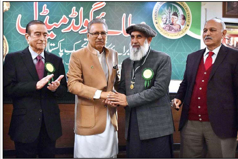
LAHORE: President Dr Arif Alvi distributing the Gold Medals to the Honour the workers of Pakistan Movement during the 29th Annual Gold Medal ceremony of Tehreek-e-Pakistan Trust organized by Nazriya-e-Pakistan Trust and Pakistan Worker Trust.