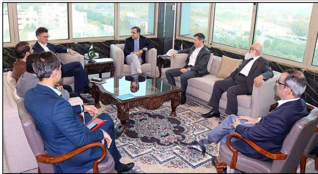
ISLAMABAD: Caretaker Federal Minister for IT and Telecommunication Dr. Umar Saif in a meeting with Telenor and Etisalat delegation.