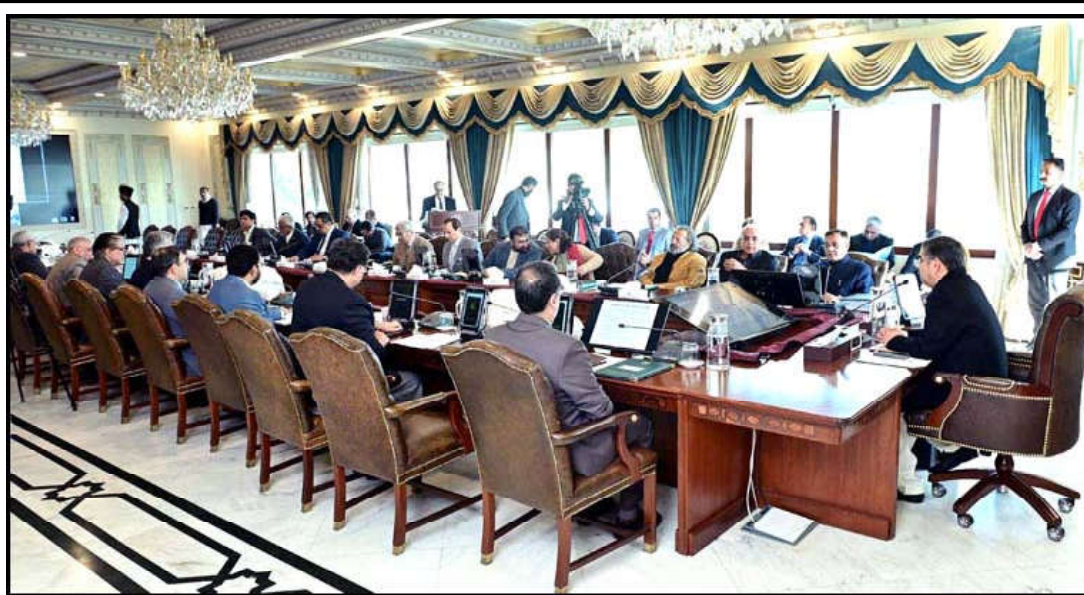
ISLAMABAD: Caretaker Prime Minister Anwaar-ul-Haq Kakar chairs meeting of the federal cabinet.

PESHAWAR (APP): Caretaker Chief Minister Khyber Pakhtunkhwa Justice @ Syed Arshad Hussain Shah and Governor Haji Ghulam Ali, on Wednesday, paid a visit to district D.I Khan where they reviewed law and order situation.