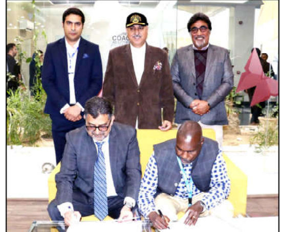
QUETTA: A MoU is being signed between UNHCR and BUTEMS in presence of Governor Balochistan Malik Abdul Wali Khan Kakar

The Chief of the Naval Staff expressed his satisfaction over the law enforcement functions being undertaken by PMSA and commended the collective efforts of all in fulfilling the National and International obligations in the maritime domain.