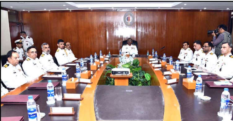
KARACHI: Chief of the Naval Staff, Admiral Naveed Ashraf being briefed during his visit to Headquarters of Pakistan Maritime Security Agency.

During the visit, he inspected various departments of the hospital including the emergency ward, OPD, X-ray room, laboratory and reviewed cleanliness, staff attendance, and stock of medicines and also inquired from the patients about the facilities provided to them.