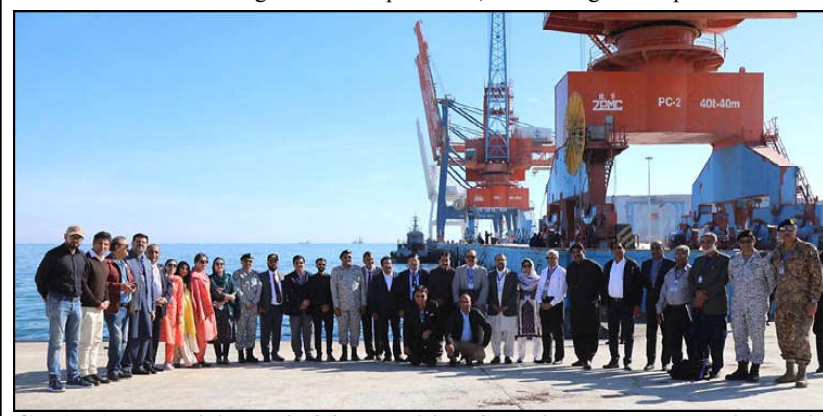
GWADAR: Participants of 6th Maritime Security workshop during their visit to Gwadar port.