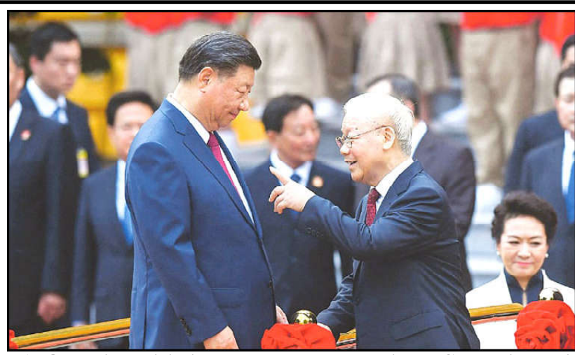
HANOI: President Xi Jinping and Nguyen Phu Trong, Vietnam Communist Party's General Secretary, attend a welcome ceremony at the Presidential Palace.