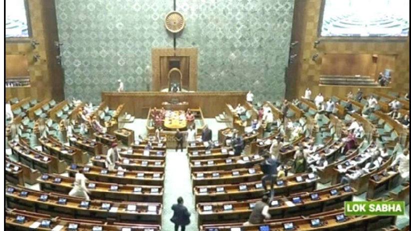
A man jumps into the lawmakers' area in the lower house of the Indian Parliament, in New Delhi, India

major renewable energy developer, told Reuters. Renewable energy is key to meeting the 2015 Paris climate agreement to limit global warming. And while renewables are already expanding fast, this latest goal would require solar and wind power deployments to speed up a lot. The tripling target would bring global renewable energy capacity to at least 11,000 gigawatts (GW) in just six years - more than 20% higher than current projections from BloombergNEF of around 9,000 GW by that time.