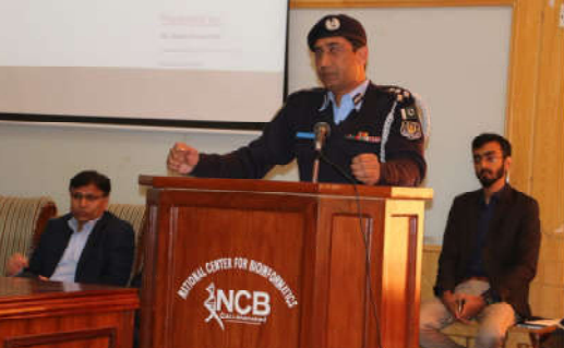
Police Officer addressing students on drugs awareness at Quaid-e-Azam University.