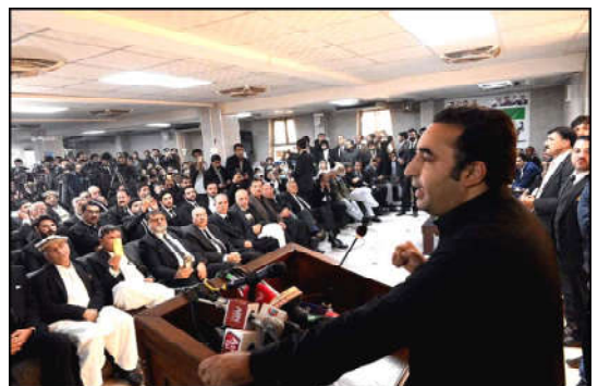
PESHAWAR: Peoples Party (PPP) Chairman, Bilawal Bhutto Zardari addressing to Peshawar High Court Bar Association, in Peshawar.

representatives of the respective organizations. He said that it's not possible for the government to tackle the issue of unemployment alone, rather the government should provide maximum facilities to the people associated with the trade and commerce so that they may play their role in ending unemployment. Earlier, the Governor inaugurated the job fair. Also present on the occasion were the Vice Chancellor of BUTEMS and other concerned high ups.