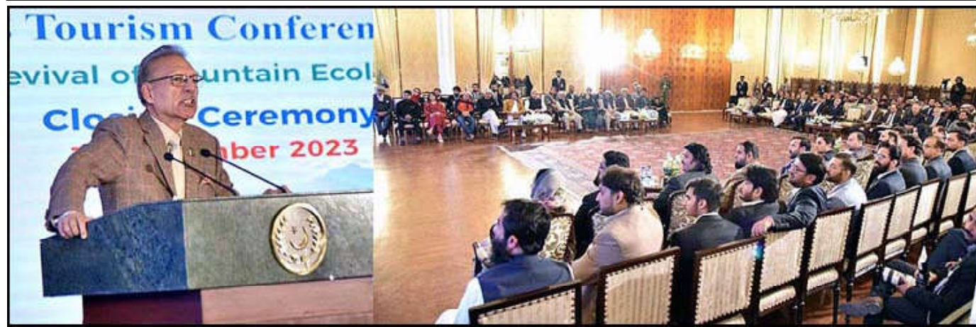
ISLAMABAD: President Dr Arif Alvi addressing the concluding ceremony of the Conference on Sustainable Mountain Sports Tourism, at Aiwan-e-Sadr.