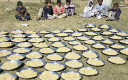
ISLAMABAD: Deserving children waiting to receive free food from charitable people in a ground at sector G-11 in Federal Capital.

ISLAMABAD (APP): WaterAid Pakistan on Wednesday unveiled its ambitious Country Programme Strategy for the period 2023-2028, with a focus on accelerating progress in Water, Sanitation, and Hygiene (WASH) initiatives across the country. The strategy aims to prioritize the integration of WASH within the health sector, intending to make substantial contributions to public health outcomes said a news release.