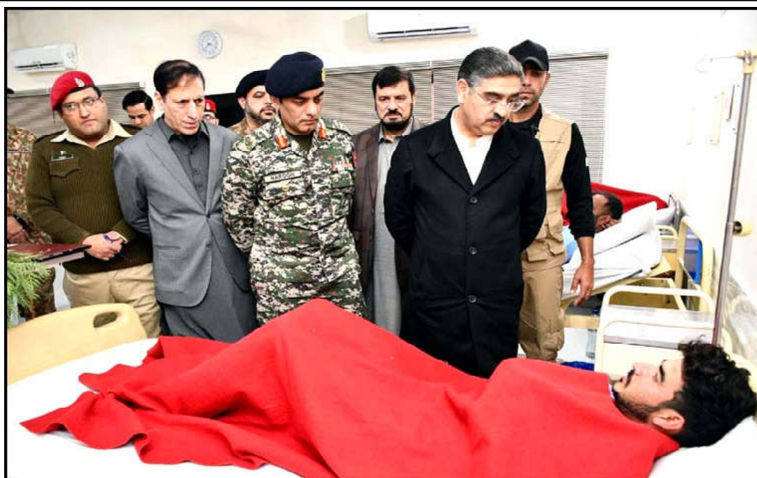
DERA ISMAIL KHAN: Caretaker Prime Minister, Anwaar-ul-Haq Kakar inquiring about the health of those injured in the Dera Ismail Khan blast during his visit of CMH Dera Ismail Khan.