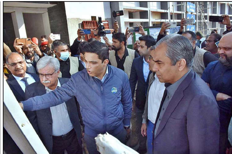
SIALKOT: Caretaker Chief Minister Punjab, Mohsin Naqvi is visiting Allama Iqbal Teaching Hospital.