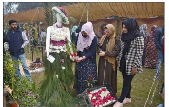
FAISALABAD: Visitors keenly viewing flowers during Chrysanthemum, Marigold & Autumn Flowers Show-2023 arranged by the Institute of Horticulture Sciences, University of Agriculture Faisalabad (UAF).