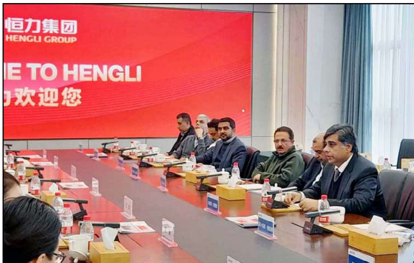
SOZHOU: Commerce Minister Dr. Gohar Ejaz visiting the Hengli Group headquarters during his visit to China.