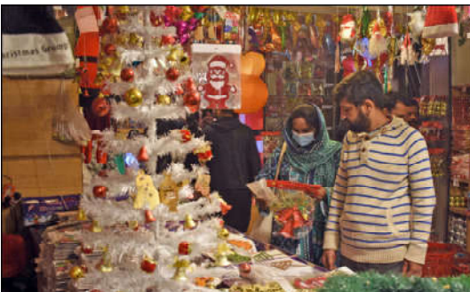
LAHORE: People of Christen Community are buying different decorating stuff from shop during the celebrations of Christmas.

The region's inflation outlook for this year has been lowered to 3.5% from an earlier projection of 3.6%, according to ADO December 2023. For next year, inflation is expected to edge up to 3.6%, compared with a previous forecast of 3.5%. The growth outlook for Southeast Asia this year has been lowered to 4.3% from 4.6%, amid weak demand for manufacturing exports. The outlook for economies in the Caucasus and Central Asia has been raised slightly, while projections for Pacific economies are unchanged. Risks to the outlook include persistently elevated interest rates in the United States and other advanced economies.