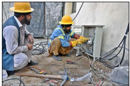
ISLAMABAD: IESCO workers busy installing new electricity meters in residential flats at G-7 in Federal Capital.