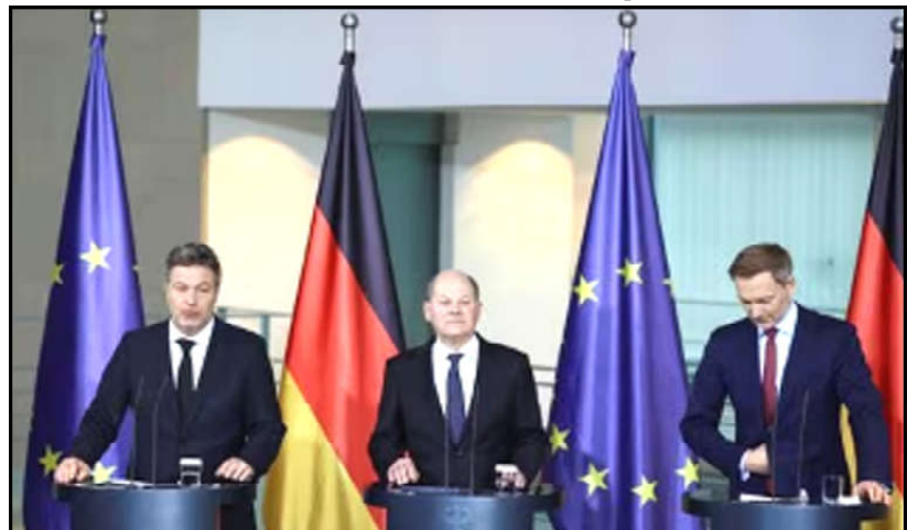
German Chancellor Olaf Scholz, Finance Minister Christian Lindner, and Economy and Climate Minister Robert Habeck present the 2024 budget in Berlin, Germany.

producer group OPEC, which argued that the world can slash emissions without shunning specific fuels. That battle pushed the summit a full day into overtime on Wednesday, and had some observers worried the negotiations would end at an impasse. Members of the Organization of the Petroleum Exporting Countries control nearly 80% of the world's proven oil reserves along with about a third of global oil output, and their governments rely heavily on those revenues. Small climate-vulnerable island states, meanwhile, were among the most vocal supporters of language to phase out fossil fuels and had the backing of huge oil and gas producers.