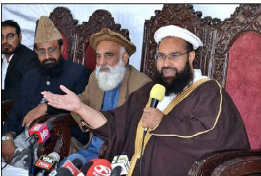
LAHORE: Special Assistant to Prime Minister Allama Tahir Ashraf and Chairman Pakistan Ulema-e-Islam Council addressing a press conference at Directorate of Hajj.

He pleaded with the court to issue directions for action against the doctors involved in the strike, besides direction to end it.