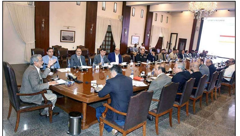
KARACHI: Caretaker Sindh Chief Minister Justice (R) Maqbool Baqar presides over a meeting for beautification of Shahrah-e-Faisal and development of Chaukundi Graveyard at CM House.

deputy commissioner to solve them. The chief minister also visited Allama Iqbal Medical Teaching Hospital and reviewed progress on upgradation project of the hospital. He inspected the ongoing construction activities in the hospital and said that the upgradation project of Allama Iqbal Teaching Hospital will cost Rs. 700 million. He said that the 65 per cent of upgradation work at Allama Iqbal Teaching Hospital had been completed. Naqvi said that 100,000 square feet area of Allama Iqbal Teaching Hospital would be revamped while the remaining 50,000 square feet area of the hospital would be upgraded in the second phase.