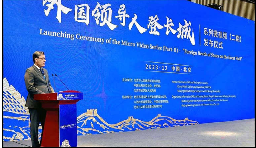
BEIJING: Ambassador of Pakistan to China H.E. Khalil Hashmi speaking at launch of Micro Video Series II on Great Wall of China.