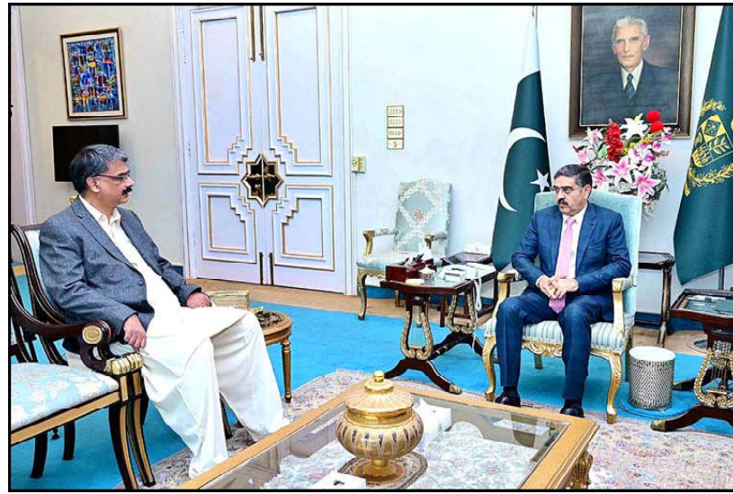
ISLAMABAD: Prime Minister of Azad Jammu and Kashmir Ch. Anwaar-ul-Haq calls on the caretaker Prime Minister Anwaar-ul-Kakar.