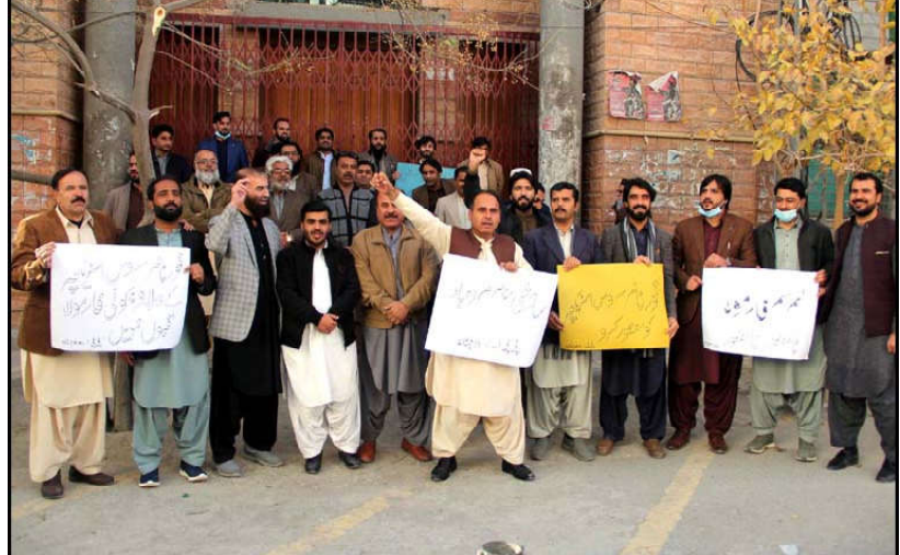
QUETTA: Members of Pakistan Pharmacists Association Balochistan are holding protest demonstration for acceptance of their demands, at Quetta press club.