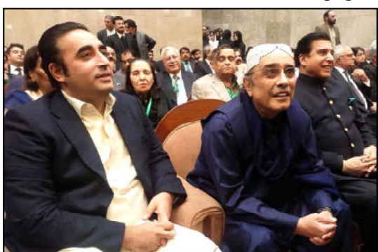
ISLAMABAD: Peoples Party Parliamentarians (PPP) President, Asif Ali Zardari and PPP Chairman, Bilawal Bhutto Zardari attend live streaming of proceedings on a presidential reference seeking to revisit the controversial death sentence awarded to former Prime Minister Zulfikar Ali Bhutto, at the Supreme Court building in Islamabad.