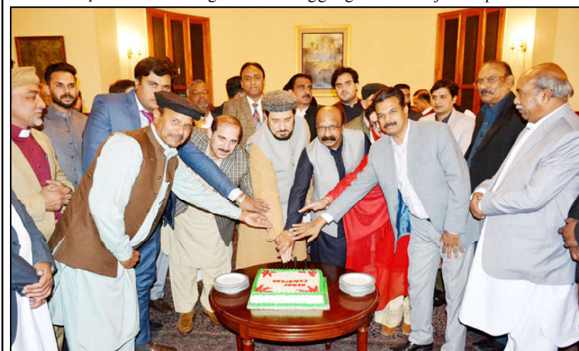
PESHAWAR: Khyber Pakhtunkhwa Governor Haji Ghulam Ali cutting Christmas cake along with Christians Community at Governor House.

LAHORE (APP): The Punjab Women Development Department has launched the "Punjab Gender Parity Report 2022," a comprehensive annual publication aimed at fostering gender equality and women empowerment here on Tuesday. Compiled by the Punjab Commission on the Status of Women, a dedicated institute under the Women Development Department, with collaboration of UNFPA (United Nations Population Fund), the report provides a detailed analysis of gender-disaggregated data across seven thematic areas, including demographics, governance, education, health, economic participation and opportunities, justice, and special initiatives. The unveiling ceremony was attended by Javed Akram, Provincial Caretaker Minister for Specialized Healthcare and Medical Education, Social Welfare, and Baitul-Mal, who served as the chief guest. This annual report serves as a vital information document for policymakers, researchers, and justice providers.