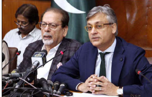
KARACHI: Caretaker Sindh Information Minister Ahmed Shah, Caretaker Law Minister Umar Soomro addressing a press conference at Sindh Assembly Committee Room.

KARACHI (APP): Caretaker Minister for Information, Minority Affairs, and Social Protection, Muhammad Ahmad Shah, underscored the necessity of investing in the health sector, urging all stakeholders to collaborate and commit to prioritizing investments for the establishment of robust and resilient health systems. In his address on Universal Health Coverage (UHC) Day, observed annually on December 12, he emphasized the imperative components required to fortify health systems: equity, trust, conducive environments, financial investments, and accountability. Highlighting the persistent issues plaguing the health system, he pointed out the lack of accountability, inadequate management of health resources, and imbalanced decision-making powers in healthcare.