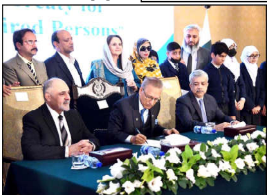
ISLAMABAD: President Dr Arif Alvi signing the Instrument of Accession to the Marrakesh Treaty for the Visually Impaired Persons in a ceremony, at Aiwan-e-Sadr.