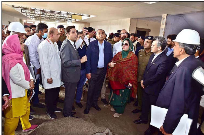
FAISALABAD: Chief Minister Punjab, Syed Mohsin Raza Naqvi is visiting the Allied Hospital Faisalabad to inspect ongoing upgradation projects of Surgical Emergency and OPD Wards.

DERA ISMAIL KHAN (APP): The district administration has sealed four butchers' shops and imposed fine on them for overcharging during ongoing crackdown against profiteers. According to the administration, the action was taken by Assistant Commissioner Muhammad Faseeh Abbasi-led team in line with the directives of deputy commissioner to ensure implementation of the officially prescribed rates of daily-use commodities in the market for extending relief to citizens. The assistant commissioner along with field staff paid a surprise visit to markets on Multan Road and its adjoining areas and checked prices of various commodities at grocery shops and the butchers'. During inspection, four butchers were found involved in charging citizens for more than the officially notified rates and imposed fines on them while sealing their shops. He also issued a warning to several other shopkeepers and directed them to ensure compliance with relevant rules, otherwise action would be taken against them as per the law.