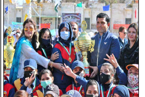
QUETTA: Pakistan Cricket Team's renowned player Kamran Akmal presenting trophy to winner team at Government Girls Postgraduate College Quetta cantt.