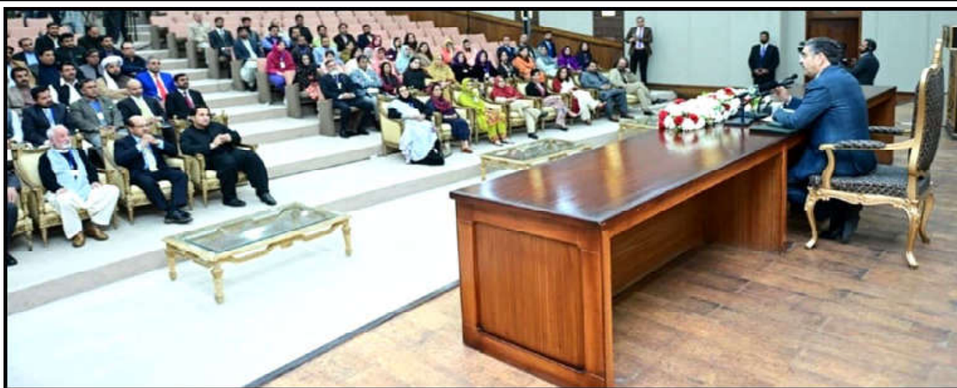
ISLAMABAD: The Caretaker Prime Minister Anwaar-ul-Haq Kakar addresses the 12th National Balochistan Workshop.

Strict security measures were adopted on occasion of production of Khadija Shah.