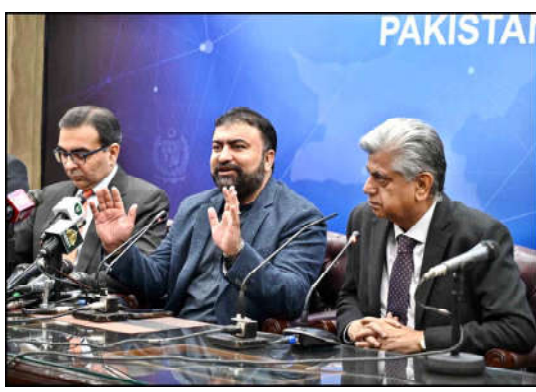
ISLAMABAD: Caretaker Federal Minister for Information and Broadcasting Murtaza Solangi, Caretaker Interior Minister Sarfraz Ahmed Bugti and Caretaker Federal Minister for Petroleum Muhammad Ali addressing a press conference at PID Media Center.