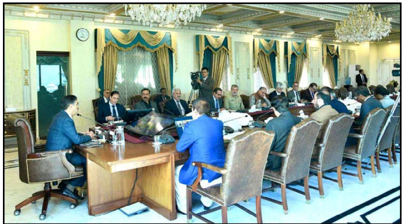
ISLAMABAD: Caretaker Prime Minister Anwaar-ul-Haq Kakar chairs a meeting on Task Force of Polio Eradication.

ISLAMABAD (APP): Caretaker Prime Minister Anwaar-ul-Haq Kakar on Wednesday directed formulation of an emergency polio eradication plan and launch of integrated programmes in high-risk urban councils. Chairing a meeting on Task Force on Polio Eradication, he emphasized monitoring of polio vaccination campaigns by using modern technology. Expressing the recent report of police cases, the prime minister regretted that the crippling disease, which was eradicated from the globe, still existed in Pakistan and Afghanistan. PM Kakar said regarding the use of Inactivated Polio Virus (IPV) vaccine, best international practices and research needed to be taken into consideration. He directed resumption of the regular polio immunization campaign across the country.