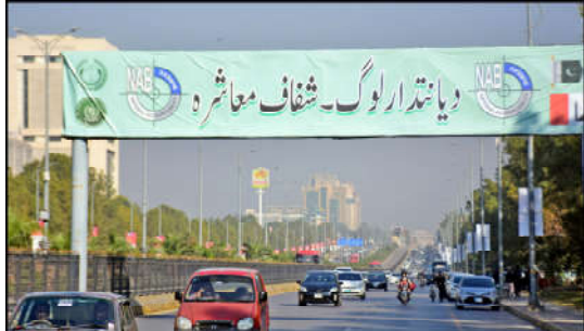
ISLAMABAD: A view of the awareness placards on Pole at Jinnah Avenue regarding the "Corruption Free Pakistan" by National Accountability Court in Federal Capital.