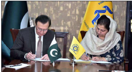
Secretary of the Senate Mohammad Qasim Samad Khan and Secretary General of IPC Sitara Ayaz signed the MoU, marking a pivotal step towards increased cooperation in areas of mutual interest and recognizing the need for closer collaboration, said a news release issued here.

closer collaboration, said a news release issued here. The signing ceremony, preceded by detailed discussions, reflects the commitment of both entities to forge a deeper partnership for addressing global challenges and promoting collaborative initiatives. The MoU outlines a range of joint initiatives, including the enhancement of international representation, collective advocacy for global human rights, exchange of research-based materials to bolster legislative support, addressing the impacts of climate change on food security, and collaboration on health-related initiatives to tackle global health challenges. This collaborative effort between the Secretariat of the Senate of the Islamic