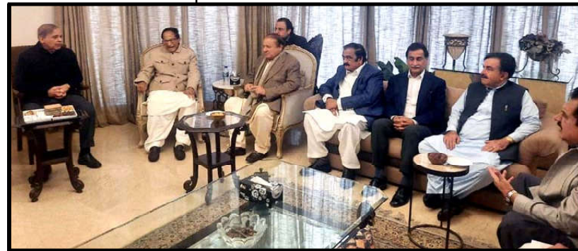
LAHORE: Muslim League (PML-N) President, Nawaz Sharif along with Muslim League-Nawaz (PML-N) President, Chaudhry Shujaat during meeting to discuss electoral alliance and seat adjustments on Gujrat seats, in Lahore.

LAHORE (INP): Pakistan Muslim League-Nawaz (PML-N) supreme, Muhammad Nawaz Sharif on Wednesday visited the residence of Pakistan Muslim League-Quaid (PML-Q) President Chaudhry Shujaat Hussain after 15 long years. PML-N President Shehbaz Sharif, Maryam Nawaz, Rana Sanaullah, Ayaz Sadiq and Azam Nazeer Tarar accompanied the party supreme. The two parties have discussed electoral alliance and seat adjustments on Gujrat seats. PML-N has decided to support PML-Q candidates on two National Assembly and three provincial assembly seats. Chaudhry Salik and Tariq Bashir Cheema will contest election on National Assembly seats from Gujrat.