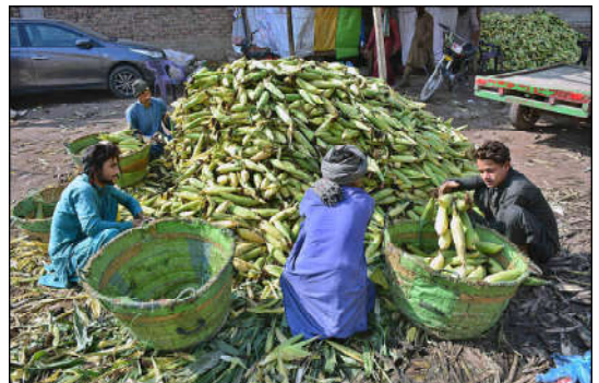
HYDERABAD: Labourers busy in sorting good quality corns at Vegetable Market.

zero point inscribed with wording of 'Goodbye Pakistan'. He also informed that pedestrian crossing is open, but trucks are not allowed to cross border from both the sides. Coordinator PAJCCI said it is very concerning for business community because closure of border inflicts heavy losses on business community of both the countries. He said a lot of trucks are carrying perishable goods which can be rotten if delayed for a couple of days, burdening businessmen with huge losses.