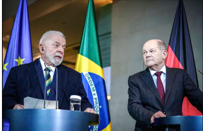
German Chancellor Olaf Scholz and Luiz Inacio Lula da Silva, President of Brazil, hold a press conference at the Federal Chancellery on the occasion of the 2nd German-Brazilian intergovernmental consultations, in Berlin.