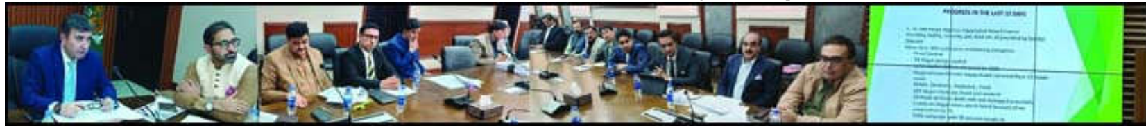
QUETTA: Chief Secretary Balochistan Shakeel Qadir Khan addressing Divisional Commissioners and Deputy Commissioners Conference.

estinian people. Haniyeh stated that Israel's actions, including the arrest of approximately 16,000 Palestinians and desecration of holy sites, were a violation of international norms. He expressed disappointment over the non-implementation of the Oslo Accords, citing an increase in the occupation of Palestinian territories. Haniyeh warned against the establishment of diplomatic relations between Islamic countries.