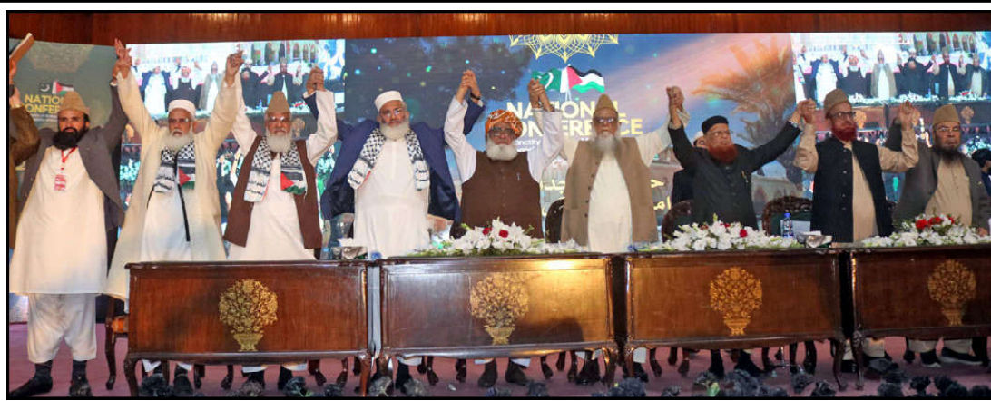
ISLAMABAD: President of Jamiat Ulema-e-Islam Fazal-ur-Rehman, Chief of Jamat-e-Islami Siraj-ul-Haq, Moulana Taqi Usmani and others rises hand together to show solidarity with the oppressed Muslims of Palestine during "Hurmat-e-Al-Aqsa Conference" at Convention Center.

The important highlights of the summit included discussions on entrepreneurship, education, healthcare, and technology, showcasing the multifaceted nature of women's contributions to society. Attendees were inspired by success stories.