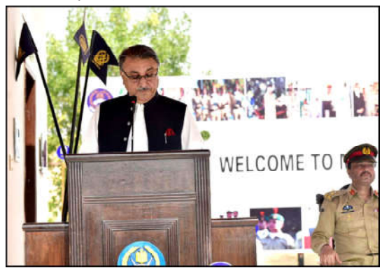
Governor Balochistan Malik Abdul Wali Khan Kakar addressing participants of a ceremony at Military College Sui