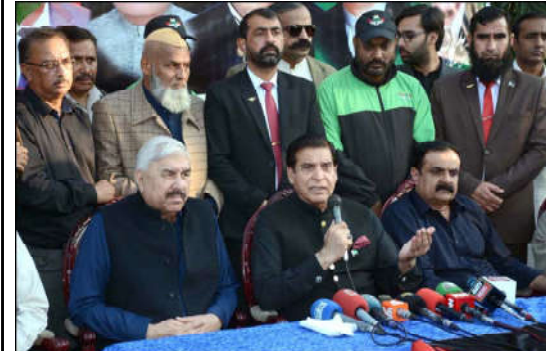
FAISALABAD: Speaker National Assembly Raja Pervaiz Ashraf is addressing a press conference at Samundri Road.

other people at the main entrance of the hospital. He directed the Director General Peshawar Development Authority, high-ups of the police, and Peshawar University to address these problems at the earliest. The Governor praised the long services of the hospital regarding the treatment of cancer patients. The hospital is working under the aegis of the Pakistan Atomic Commission providing various kinds of healthcare services to oncology patients of Khyber Pakhtunkhwa.