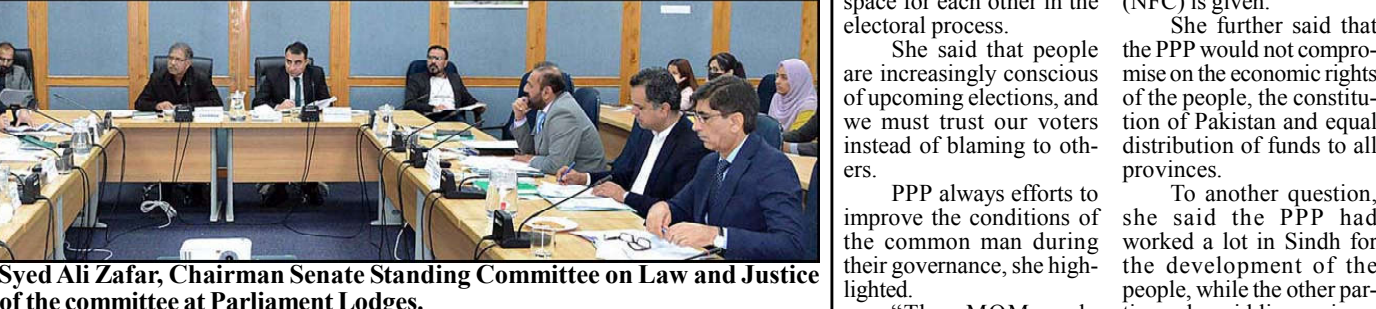
ISLAMABAD: Senator Syed Ali Zafar, Chairman Senate Standing Committee on Law and Justice presiding over a meeting of the committee at Parliament Lodges.

want delimitation in line with their desires, which is not possible, she said, adding, that only PPP standing with the people and would form the next government. Shehla also expressed confidence that the People's Party would sweep Sindh, adding, that national action plan implementation is also need of hour with letter and spirit. Replying to a query, she said every budget will be unconstitutional and discriminatory until the National Finance Commission (NFC) is given. She further said that the PPP would not compromise on the economic rights of the people, the constitution of Pakistan and equal distribution of funds to all provinces. To another question, she said the PPP had worked a lot in Sindh for the development of the people, while the other parties only paid lip service.