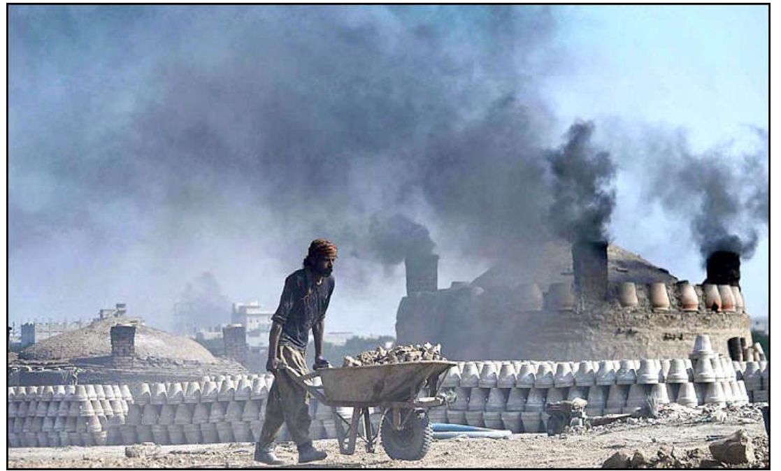
KARACHI: A man drive thru Dust in area of Karachi, according to reports the Karachi Ranked Most Polluted city in the world in term of air quality, The various forms of pollution have increased at Karachi which has caused widespread environmental and health problems.

He said that he is happy to see that international companies in electrical vehicles and artificial intelligence are bringing their expertise and technology to Pakistan, which will help us accelerate the adoption of these technologies in our country and create new opportunities for our citizens. Governor Punjab said that the expo is a testament to the power of innovation and collaboration and shows that when government.