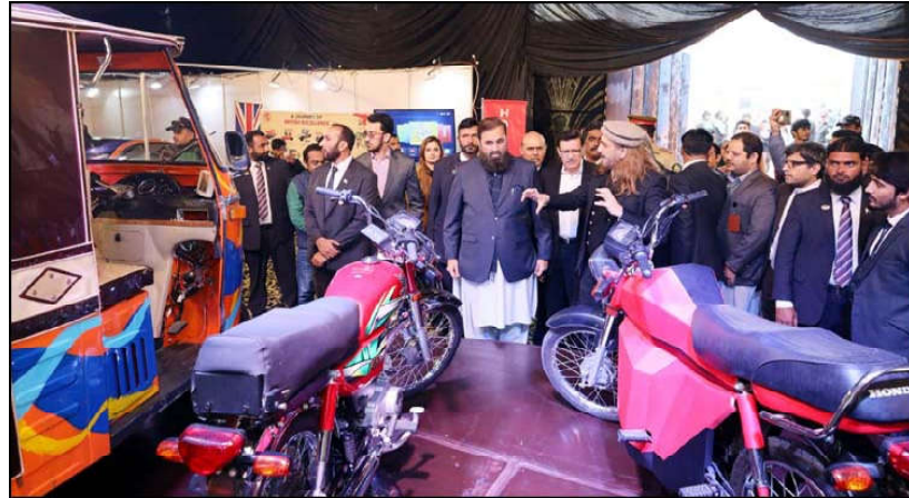
LAHORE: Governor Punjab Muhammad Balighur Rehman inspecting the stall after inauguration of first International Electrical Vehicle Expo 2023 at the University of Lahore.