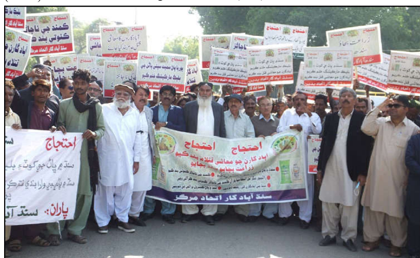
HYDERABAD: Growers hold banners and placards during a protest rally against rise in the rates of fertilizers and shortage in markets, under the banner of Sindh Abadgar Ittehad, in City.