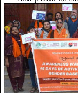
QUETTA: Ending violence Against Woman & Girls members hold awareness walk regarding "16 days of Activitism Against Gender Based Violence" outside QPC.