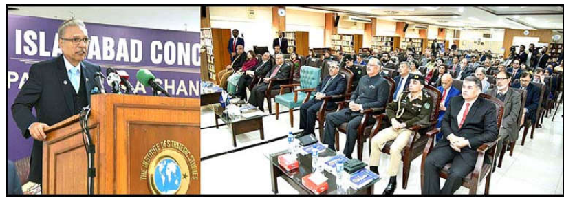
ISLAMABAD: President Dr Arif Alvi addressing the inaugural session of the Islamabad Conclave 2023 titled "Pakistan in a changing world", at the Institute of Strategic Studies.