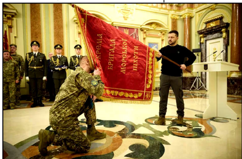
Ukraine's President Volodymyr Zelenskyy addresses to service members during award ceremony on Day of the Ukrainian Armed Forces, amid Russia's attack on Ukraine, in Kyiv, Ukraine.