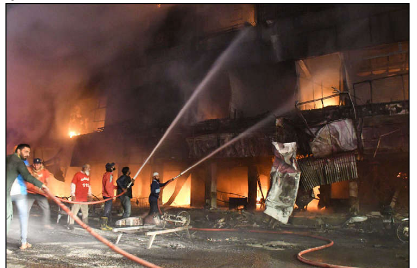
KARACHI: Pakistani fire fighters struggle to control a fire which broke out at furniture shops, apartment building at Aysha Manzil in Karachi.