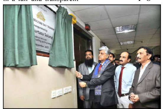
MULTAN: Caretaker Federal Minister for Information, Broadcasting and Parliamentary Affairs Murtaza Solangi unveiling plaque to inaugurate the PTV National Multan 24/7 transmission at PTV Centre.

Says PTV Multan transmission through satellite to open new avenues of opportunities for poets, artists. MULTAN (APP): Caretaker Federal Minister for Information, Broadcasting and Parliamentary Affairs Murtaza Solangi said on Wednesday that general elections would be held on February 8, 2024 and full preparations were underway to accomplish the task in a fair and transparent manner. Talking to media persons at the inaugural ceremony of the 24-hour regional transmission of Pakistan Television Multan, he said that the people would ultimately decide the next government of the