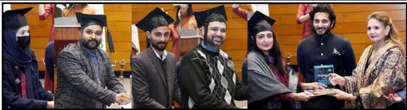
First Lady Begum Samina Alvi giving certificates to students with disabilities at the graduation ceremony of the Network of Organizations Working with Persons with Disabilities Pakistan (NOWPDP) students, in Islamabad

rehabilitation services. She recalled that a comprehensive awareness campaign was launched from the platform of the Presidency to raise awareness about mainstreaming persons with disabilities. She mentioned that the campaign was supported by non-governmental organizations, chambers of commerce, and the media. Also, the Pakistan Telecommunication Authority relayed 120 million short messaging services on sensitization about persons with disabilities. She urged the public and private sector departments including banks, chambers of commerce, and welfare foundations to adopt inclusive policies to accommodate persons with disabilities.