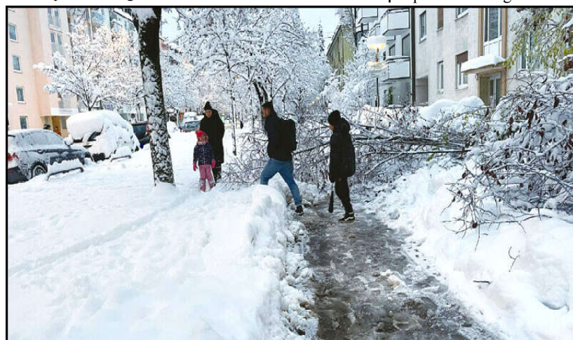
Pedestrians walk on a footpath buried under inches of snow in Munich.

man national. He was then chased by police and attacked two other people with a hammer before being arrested. The suspect had shouted out "Allahu akbar" (God is Greatest) and told police he was upset because "so many Muslims are dying in Afghanistan and in Palestine" and was also upset about the Gaza situation, Darmanin said. "I send all my condolences to the family and loved ones of the German national who died this evening during the terrorist attack in Paris and think with emotion of the people currently injured and in care," President Macron said on social network platform X. Prime Minister Elisabeth Borne expressed defiance in the face of such attacks. "We will not give in to terrorism," she wrote on X. French anti-terrorism prosecutors are leading the investigation into Saturday night's incident.