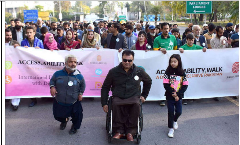
ISLAMABAD: A view of walk title "International Day of Persons with Disabilities" in front of Ministry of Foreign Affairs in Federal Capital.

Media leaders also hope that global media would pay more attention to the pressing demands of developing countries in areas such as poverty reduction, food security, financing for development, and industrialization and help resolve imbalances and inadequacies in development.