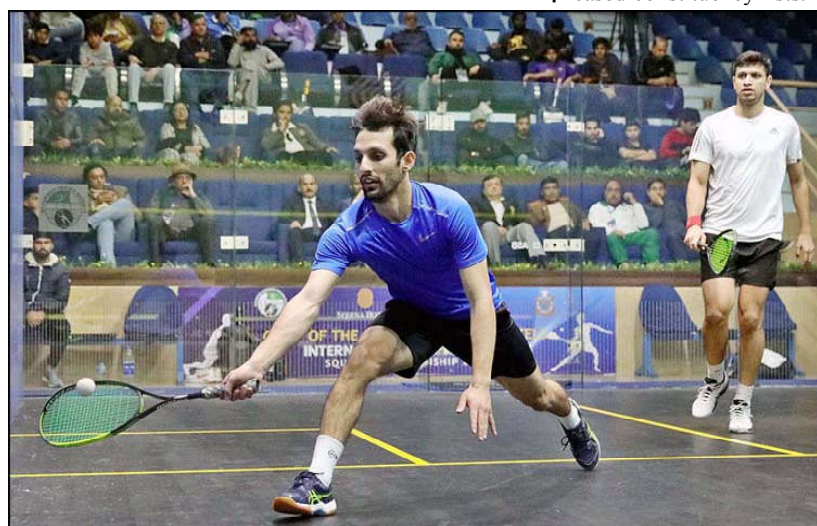
ISLAMABAD: Players in action during CAS-Serena Hotels International Squash Championship for Men & Women-2023 organized by Pakistan Squash Federation in collaboration with PAF & Serena Hotels at Mushaf Squash Complex.

He said the new generation was very talented and would make the future of the country; hence, they needed proper attention.