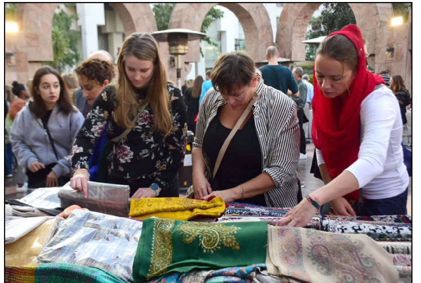
ISLAMABAD: Diplomat women are busy buying clothes in a stall during Annual Christmas Market organized by German Embassy at a local hotel in the Federal Capital.

As the conference unfolds, expectations are high for fruitful discussions and partnerships that will not only elevate Pakistan's IT industry but also contribute to the growth and development of the Qatari technology sector.