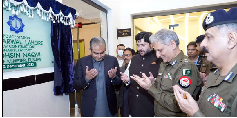
LAHORE: Punjab Chief Minister Mohsin Naqvi offering Dua after inaugurating newly constructed building of Hanjarwal Police Station.