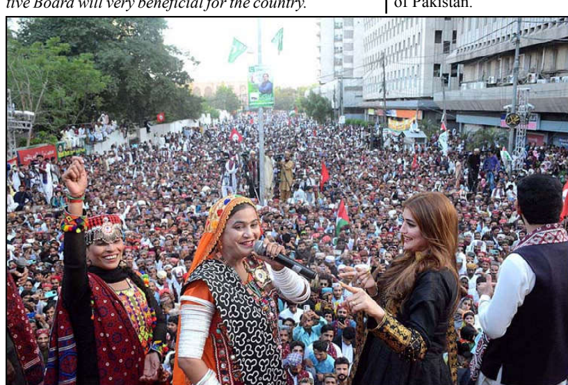
KARACHI: Folk singer performing Sindhi song during celebration of Sindhi Ajrak Topi Culture Day at Karachi Press Club.