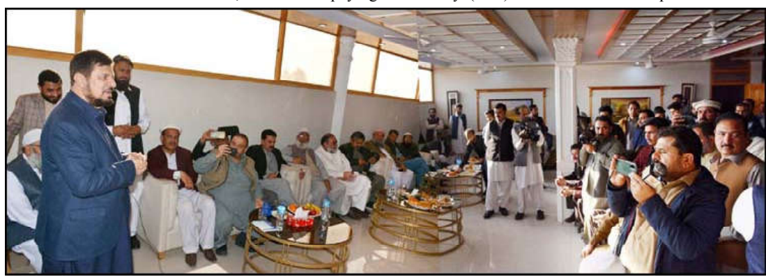
KOHAT: Governor Khyber Pakhtunkhwa Haji Ghulam Ali addressing the Chamber of Commerce Leaders and business Community during a ceremony organized by Kohat Chamber of Commerce and Industry.