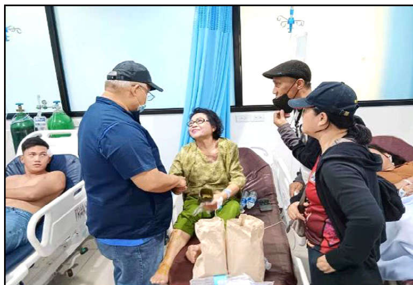
Lanao Del Sur Governor Mamintang Adiong Jr. visits the injured at a hospital following an explosion during a Catholic Mass in a gymnasium at Mindanao State University, in Marawi, Philippines.

of infectious disease in Gaza, where the internal displacement of the population has caused overcrowding in shelters and other temporary living facilities. The agency has noted a staggering increase in cases of diarrhoea, especially among infants and children, and detected "very serious signals around acute jaundice syndrome" in the enclave. "With severe overcrowding, the risks are increasing for epidemics of respiratory tract infections, acute watery diarrhoea, hepatitis, scabies, lice and other diseases."