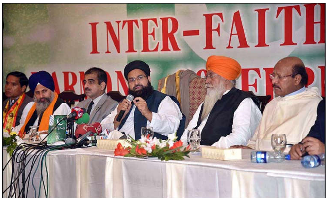
LAHORE: Special Assistant to Prime Minister on Interfaith Harmony Maulana Tahir Ashrafi addressing during Interfaith Harmony Conference at local hotel.

Kartarpur Corridor was made operational as a gesture of peace and the Sikh pilgrims were invited to visit their holy places in Pakistan. He mentioned that Muslim religious leaders were also playing their effective role for promotion of interfaith harmony in the country, adding that Islam always advocates peace as forced marriages and forced conversions of religion was prohibited in Islam. He said that Gaza was not an issue of Palestine or Arab nations, but of entire humanity. He asked the world what was fault of innocent children of Gaza as more than 3,500 children had been martyred in Israeli aggression since October 7.