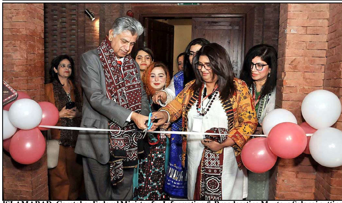
ISLAMABAD: Caretaker Federal Minister for Information & Broadcasting Murtaza Solangi cutting the ribbon to inaugurate the Sindhi Cultural Day organized by Soormiyun at PNCA.