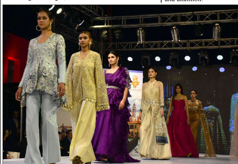
ISLAMABAD: Models walks on ramp during fashion show organized by Italy Embassy in Federal Capital.