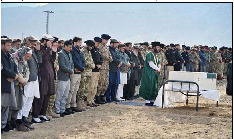
GILGIT: Chief Minister Gilgit-Baltistan Haji Gulber Khan with other people attending the funeral prayer of martyrs of Hudur incident by terrorist attack on passenger bus.

The chief outlined a policy of wisdom and fairness in dispute resolution, underscoring the historical sacrifices of Jamiat Ulema-e-Islam elders as a testament to the people's trust. JUI always rejected sectarianism, Fazal added. He promised to serve people if voted to power. He also expressed resolve to propel the party forward, uniting communities, and fostering a future marked by justice, compassion, and resilience.