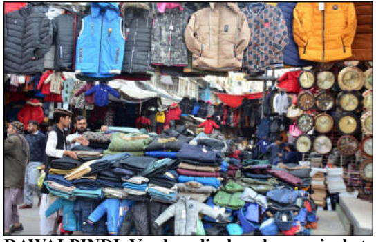
RAWALPINDI: Vendors displayed warm jackets attraction for customers outside their shops at Raja Bazaar in the city.