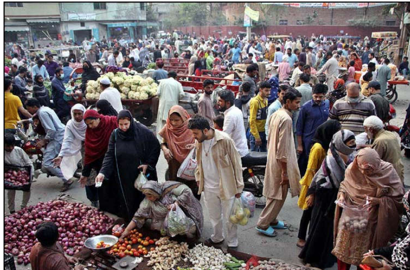
LAHORE: People buy vegetables at Small Vegetable Weekly Market located on Tajpura area in Lahore.

owned subsidiary of CNRP Rich Energy Co. Limited, located in Hong Kong. M/s. Super Success Investments Limited (SSIL) is based in Mauritius, according to a press release issued here on Sunday. SSIL owns a 100 percent shareholding in M/s. UEP Wind Power (Private) Limited is a private company operating and maintaining a 99 MW wind-powered electric generation facility.