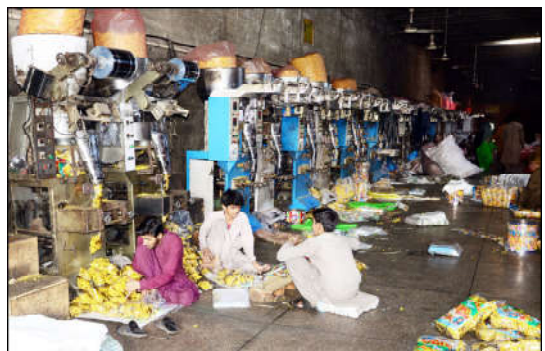
FAISALABAD: Labourers are busy in packing of snacks (Paparr) in a local factory in the city.

The Governor addressed the gathering, emphasizing the integral connection between the country's economic progress and industrial growth.