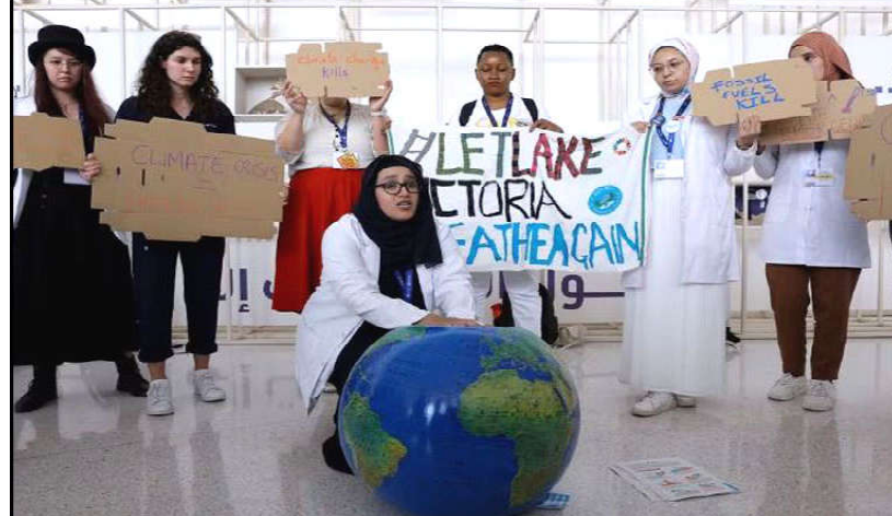
Members of the International Federation of Medical Students Associations hold placards during a protest demanding an end to fossil fuels at COP28 World Climate Summit, in Dubai, United Arab Emirates

Monitoring Desk NEW DELHI: India's government has agreed to withdraw its soldiers from the Maldives, the Indian Ocean archipelago's President Mohamed Muizzu said on Sunday. Muizzu won the presidential election in September, having campaigned to alter the Maldives' "India first" policy and promising removal of a small Indian military presence of some 75 personnel. "In the discussions we had, the Indian government has agreed to remove Indian soldiers," Muizzu told reporters. "We also agreed to set up a high level committee to solve issues related to development projects."