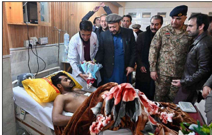
GILGIT: Chief Minister Gilgit-Baltistan Haji Gulber Khan visit the hospital to inquire the injured person health of Hudur incident by terrorist attack on passenger bus.