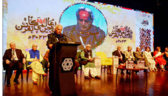
KARACHI: Renowned Writer Mustansar Hussain Tarar addressing during a closing ceremony of 16th Aalimi Urdu Conference at Arts Council.

During the visit, local peoples' welfare, establishment of durable peace, development projects and positive effects of the fore-sighted strategies were analyzed.