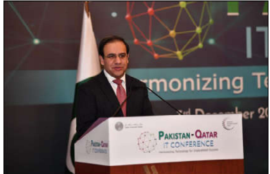
Caretaker Federal Minister for IT and Telecommunication Dr. Umar Saif addressing Pakistan-Qatar IT conference in Doha, Qatar.