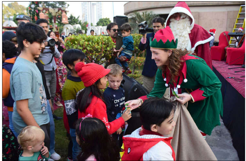
ISLAMABAD: A woman is distributing sweets among the children's during Annual Christmas Market organized by German Embassy at a local hotel in the Federal Capital.

The day is about to raise awareness of the situation of persons with disabilities in all aspects of political, social, economic, and cultural life. WHO joins the UN in observing this day each year, reinforcing the importance of securing the rights of people with disabilities so they can participate fully, equally, and effectively in society with others and face no barriers in all aspects of their lives.