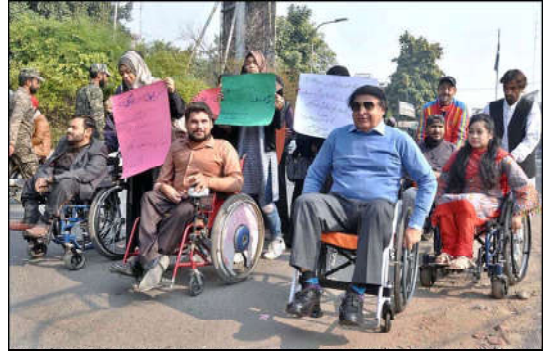
LAHORE: Special persons participate in a walk outside the Press Club on International Day of Persons with Disabilities.

Raising the voice of protest against the oppressors is the most favorable act. It has become clear that Israel has no future, the future only belongs to the Palestinians. With each passing day Israel is moving faster towards its logical end the narrative of resistance and resistance is winning.