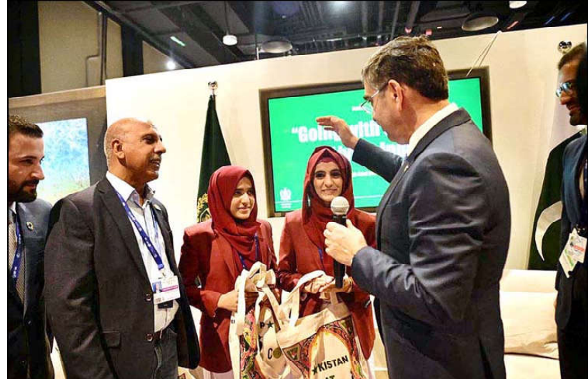
DUBAI: Caretaker Prime Minister Anwaar-ul-Haq Kakar meets the Pakistani students who won the award in one of the categories of Zayed Sustainability Awards 2023.