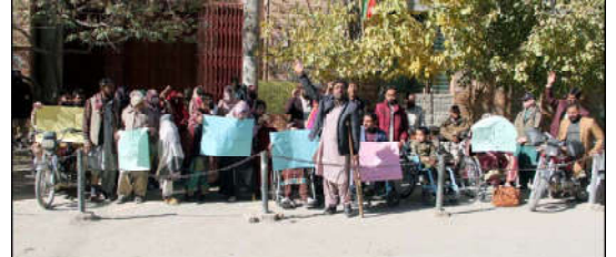
QUETTA: Members of Supreme Welfare Society and disable persons participate in awareness walk, in connection of the International Day of Persons with Disabilities, held at Quetta press club.