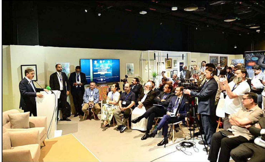
DUBAI: Caretaker Prime Minister Anwaar-ul-Haq Kakar addresses a ceremony on Living Indus Initiative at COP-28 Pakistan Pavilion.

Ph: 2841470/2841473 REG: No. BC-116 B/ID-445 V&amp; XXV No. 104, Jamadi-ul-Awwal 19, 1445 AH Monday December 04, 2023 Pages 12, Price Rs.15