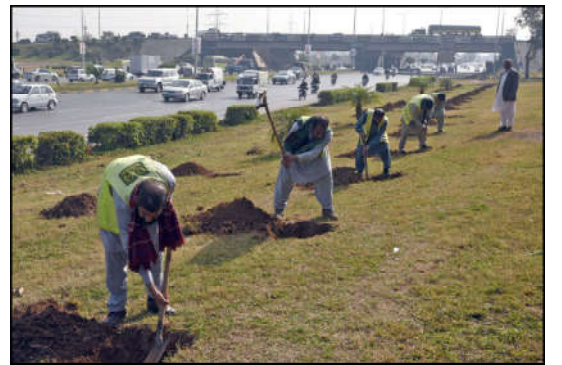
ISLAMABAD: Workers of Capital Development Authority (CDA) are digging for plantation on a green alongside Islamabad Highway.

The hazardous air pollutant particulate matter of 2.5 microns (PM2.5), which was hazardous atmospheric contaminant, remained 14.4 micro grammes per cubic meter on average which was lower than the national environmental quality standards (NEQS) of 35 mic-programmes per cubic meter and denoted the air quality unhealthy for sensitive people.