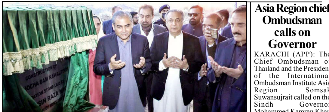
RAWALPINDI: Caretaker Chief Minister Punjab Mohsin Naqvi offering Dua after inaugurating Dadocha Dam.

The LG department will be authorized to send surplus employees to the department as per the need.