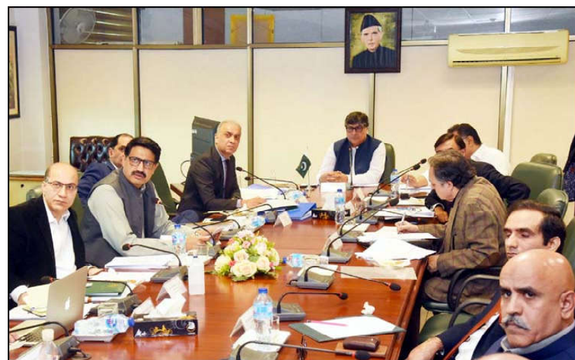
ISLAMABAD: Federal Minister for Privatisation, Fawad Hasan Fawad chairing a meeting of Privatisation Commission Board, in Islamabad.

adjustment, and operation and maintenance of converter station, in order to help them enhance techniques of HVDC operation at Matiari-Lahore project. This was Pakistan's first HVDC transmission project funded, constructed and operated by the State Grid Corporation of China (SGCC) under the CPEC framework. The project was officially put into commercial operation in September 2021. It has the maximum capacity to transmit electricity of 35 billion kilowatt-hours annually.