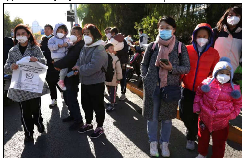
People wait for their rides outside a children's hospital in Beijing, China.

Police decided his actions could amount to a civil offence under a law which targets anyone deemed to have acted publicly to discredit Russia's armed forces, a crime which in his case was punishable by a fine. New laws cracking down on dissent were brought in soon after President Vladimir Putin sent tens of thousands of troops into Ukraine.