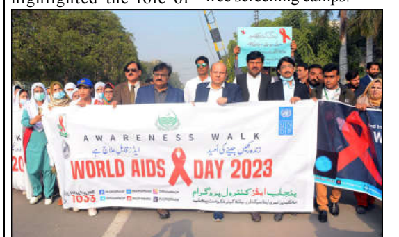
FAISALABAD: Participants hold a banner during walk on the eve of World AIDS Day, at Allied Trust Hospital in the city.

Expressing gratitude to organizations like the WHO and UNICEF, he acknowledged their ongoing support in combating AIDS in Pakistan. The Punjab AIDS Control Program boasts 21,690 active patients receiving free monthly medicine, achieving over 700 HIV-negative childbirths. The program collaborates with Community Based Organizations, utilizes various media for awareness, and conducts free screening camps.