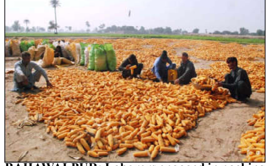
BAHAWALPUR: Laborers engaged in packing maize in suburb of Bahawalpur which is being loaded on tractor trolley and transport them to grain market and cooking oil factories.

ISLAMABAD (APP): The per tola price of 24 karat gold witnessed a decrease of Rs.500 on Friday and was sold at Rs.220,500 against its sale at Rs.221,000 the last trading day. The price of 10 grams of 24 karat also decreased by Rs.429 to Rs.189,043 from Rs.189,472 whereas that of 10 gram 22 Karat gold declined to Rs.173,290 from Rs.173,683. The price of per tola and ten-gram silver remained unchanged at Rs.2,620 and Rs.2,246.21 respectively. However, the price of gold in the international market decreased by $4 to $2,060 from $2,064, the Association reported.