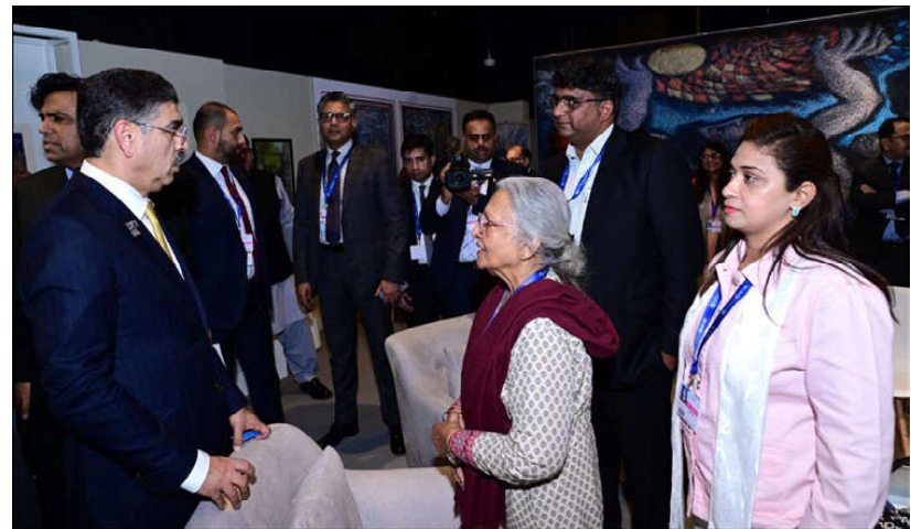
DUBAI: Caretaker Prime Minister Anwaar-ul-Haq Kakar visits Pakistan Pavilion at COP-28.

Sharif) had eliminated the problem of electricity load shedding in the country, and continued: "(on such claim) I wonder which Pakistan is this, where 18 hours of loadshedding is happening." He said that after winning the polls due on February 8, his government will implement the Green Energy Parks project under Public Private Partnership mode to solve the power crisis. "We will generate the electricity locally and supply it to the local population at subsidized rates," he added. Chairman PPP termed the local government representatives as truly grassroots representatives, and urged that both the federal and provincial governments must consult with the local government.