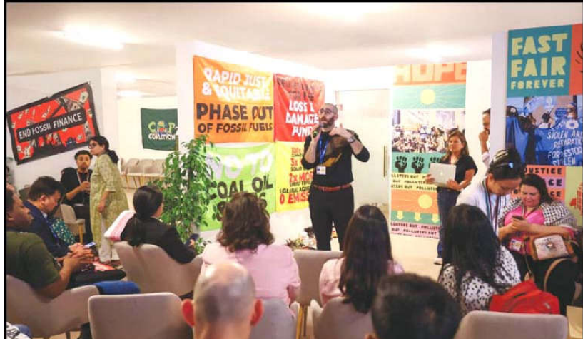
Pro-Palestinian environmental activists participate in a sit-in demonstration at the Expo City in Dubai in support of a ceasefire in Gaza.

"All over the world, millions and millions are coming out and saying no, no, no."