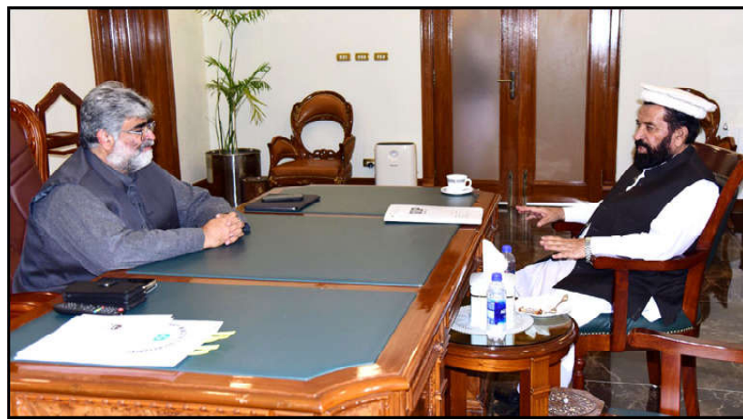
QUETTA: Former Speaker Provincial Assembly Malik Sikandar Advocate meeting with Caretaker Chief Minister Balochistan Mir Ali Mardan Khan Domki