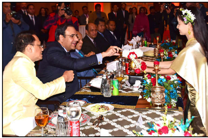
ISLAMABAD: A Thai girl presenting flowers to Caretaker Federal Minister for Information Technology and Telecommunication Dr. Umar Saif during National Day of Thailand ceremony at a local hotel in Federal Capital.