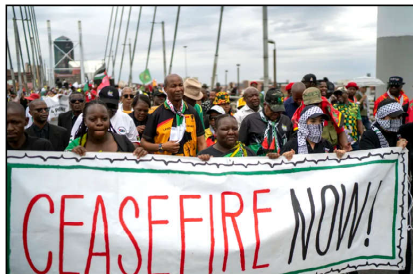
Pro-Palestinian demonstrators march across the Mandela Bridge downtown Johannesburg, South Africa.

The report also found that New York state prison staff failed to abide by protocols meant to prevent misidentifying contraband or cross-contaminating samples. The Sirchie NARK II contraband screening tests are used to detect synthetic cannabinoids and other types of drugs by putting substances into testing pouches. They sometimes cross-react with commonly