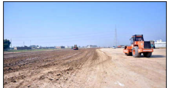
ISLAMABAD: Heavy machinery being used to build Chak Beli Link Road in the outskirts of the city.

ICCPO Dr Akbar Nasir Khan said that, the primary objective of the orderly room is not only to address the welfare, personal, and official issues of police personnel but also to elevate their morale by prioritizing resolutions based on their well-being.