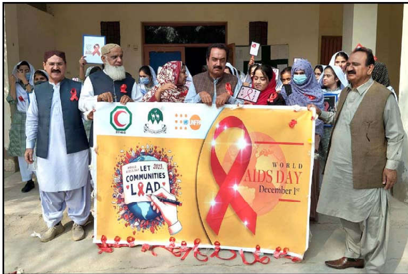
QUETTA: Participants are holding awareness walk on the occasion of World AIDS Day organized by Society of Collective Interests Orientation (SICIO) held in Quetta.

"Kamran Akmal, in a 15-year career from 2002 to 2017, played 53 Tests, 157 ODIs and 58 T20Is. The former wicketkeeper-batter amassed 6,871 runs across formats and bagged 453 dismissals behind the stumps.