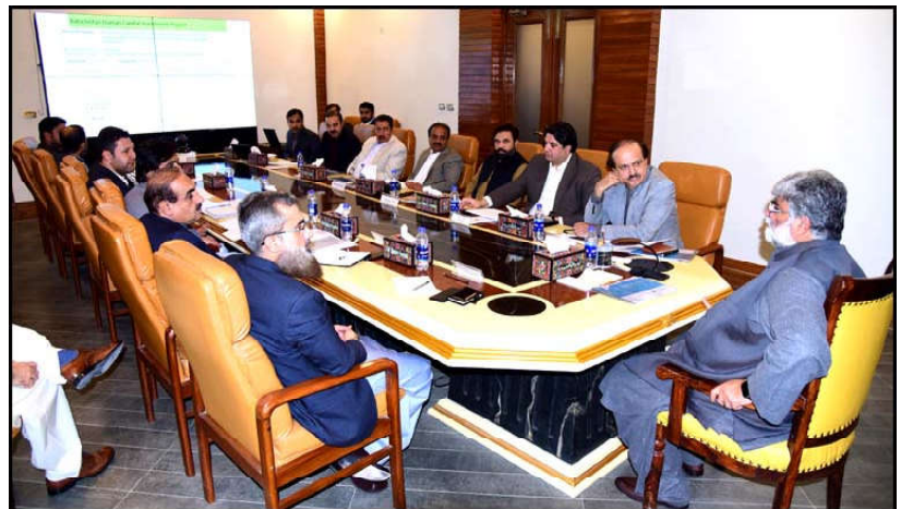
QUETTA: Caretaker Chief Minister Balochistan Mir Ali Mardan Khan Domki presiding over a meeting regarding progress on ongoing projects with cooperation of World Bank

The caretaker Minister Finance on the occasion informed that the quota of jawans of Balochistan has been increased to 10,000 from 4,000 in NEVTEC. The quota of youngsters would be increased to 20,000 further, he added.