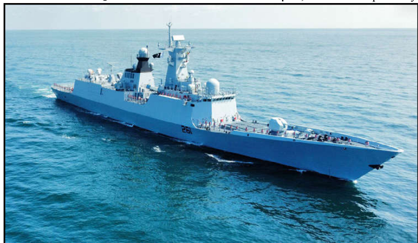
ISLAMABAD: Amidst the prevailing maritime situation in the Middle East, Pakistan Navy has deployed PNS TUGHRIL to ensure safety and security of merchant ships carrying shipments to and from Pakistani ports passing through one of the world's busiest choke points.

In the same spirit, Pakistan Navy regularly deploys its ships on Regional Maritime Security Patrols and also contributes to collaborative maritime security efforts under the ambit of Combined Maritime Forces.