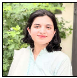
By Ayesha Rafiq

Today Pakistan stands as a nation with a rich tapestry of history, culture, and traditions. However, woven into this tapestry are threads of inequality and oppression that continue to stifle the growth and empowerment of its women. As we celebrate progress on various fronts, it is crucial to turn our gaze towards the desperate need for women's rights and empowerment in Pakistani society.