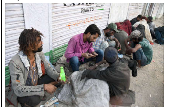
KARACHI: Drug addict's smokes heroin at a slum area in Provincial Capital, As World AIDS Day.

He said that the Netherlands is among the top ten (10) countries to invest in Pakistan, while more than 60 Dutch companies are currently operating in Pakistan. Governor Punjab said that Pakistan has taken various initiatives with a view to boost foreign investment, including the establishment of the Special Investment Facilitation Council.