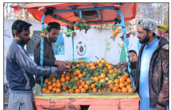
QUETTA: People purchasing orange from a push cart at Joint Road.