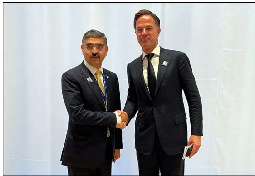
DUBAI: Caretaker Prime Minister Anwaar-ul-Haq Kakar meets the Prime Minister of Netherlands Mr. Mark Rutte on the sidelines of the high level segment of the UN's 28th Conference of Parties.

work together bilaterally as well as through the European Union on matters of mutual interest. Both the leaders expressed satisfaction on the upward trajectory in bilateral relations between Pakistan and the Netherlands. The prime minister highlighted the importance of concrete outcome on climate action and referred to Pakistan's climate vulnerabilities despite being one of the lowest carbon emitters. Prime Minister Kakar underscored that Pakistan and the Netherlands should