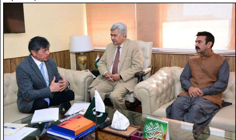
ISLAMABAD: Ambassador of Uzbekistan H.E. Obayek Arif Osmanaov called on the Caretaker Federal Minister for National Food Security & Research Dr. Kausar Abdullah Malik.

all expenditure groups. The SPI for the lowest consumption group up to Rs.17,732, decreased by 0.23 percent and went down to 307.11 points from last week's 307.81 points. The SPI for consumption groups from Rs.17,732-22,888; Rs.22,889-29,517; Rs.29,518-44,175 and above Rs.44,175 decreased by 0.26 percent, 0.25 percent, 0.24 percent and 0.21 percent respectively. During the week, out of 51 items, prices of 13 (25.49%) items increased, 14 (27.45%) items decreased and 24 (47.06%) items remained stable. The items, which recorded a decrease in their average prices on a week-on-week (WoW) included tomatoes (17.64%), potatoes (5.11%), chicken (3.58%), sugar (2.01%), tea lipton (1.29%).