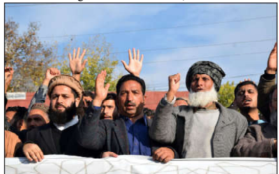
MUZAFFRABAD: Activists of Pasban-e-Hurriyat Jammu Kashmir shouting slogans during protest rally in favor of their demands at Azadi Chowk in the city.

Appreciating the exhibition, the Minister said arranging such activity to promote artisans, handicrafts and Sindh's culture was a great effort