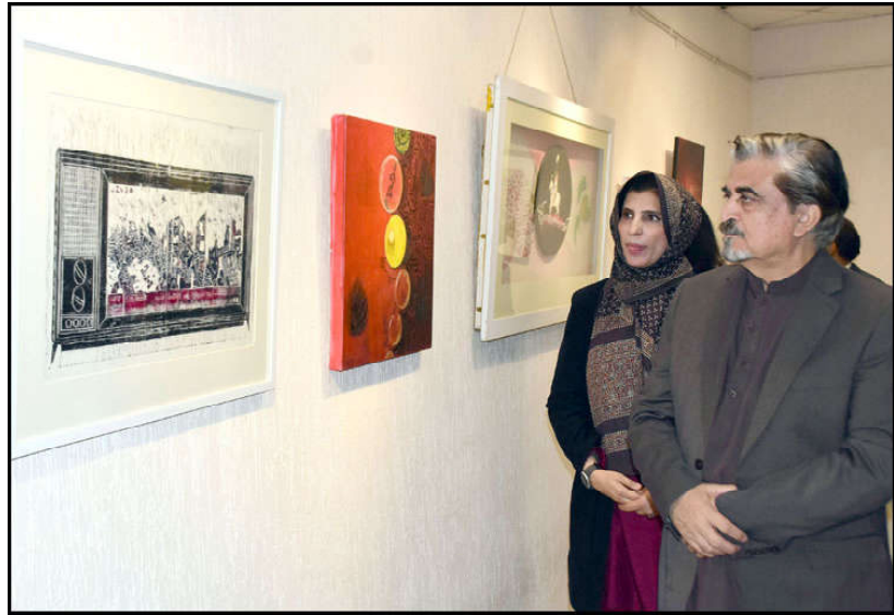
ISLAMABAD: Caretaker Federal Minister for National Heritage & Culture Syed Jamal Shah taking keen interest in a painting during painting exhibition titled "Quwat o Akhuwat" at COMSATS Art Gallery in Federal Capital.

"Our connectivity logically emanates from the closeness of cultures and religious traditions - caravan's roads of Central Asia with South Asia - Pakistan, China, Afghanistan, Sri Lanka, India, Nepal, Bhutan and Bangladesh."