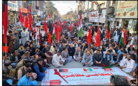
QUETTA: Activists of National Democratic Movement (NDM), Pashtunkhwa Milli Awami Party (PKMAP) and Awami National Party (ANP) are holding protest demonstration against forced deportation of Afghans, at Mannan Chowk in Quetta.

She said Pakistan has once again asked Afghan authorities to take immediate and effective steps against terrorist entities operating from their soil.