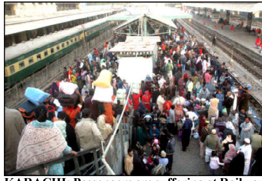
KARACHI: Passengers are suffering at Railway Station due to the delay of the trains because of fog in the different areas of the Country.

Minister Finance Ahmed Rasool Bangash, in his address during the e-Stamping launch, Stamping launch, emphasized that the primary objective behind this initiative is to provide instant access to genuine stamp papers without any hassle and to deter Khyber and the State Bank fraudulent activities.