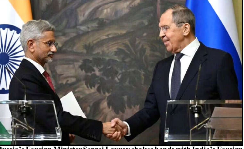
Russia's Foreign Minister Sergei Lavrov shakes hands with India's Foreign Minister Subrahmanyam Jaishankar during a joint press conference following their talks in Moscow, Russia.

Japan and South Korea both scrambled jets to monitor joint flights by Chinese and Russian bombers and fighters near their territories