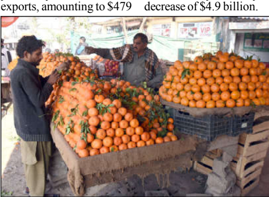
ISLAMABAD: A vendor is selling seasonal fruit Oranges at Khana Bridge to earn daily wages for the livelihood of his family.

This positive trend contributed to an $884 million improvement in the balance of trade for December 2023. According to the data, from July 1s 2023, to December 20 th, 2023, Pakistan's exports soared to $14 billion, showcasing a remarkable year-on-year increase of $709 million, translating to a substantial 5.3 percent improvement. figures during the same period (1 July 2023 to 20 December 2023) dropped to $24.3 billion from $29.2 billion in FY-2022, reflecting a notable year-on-year