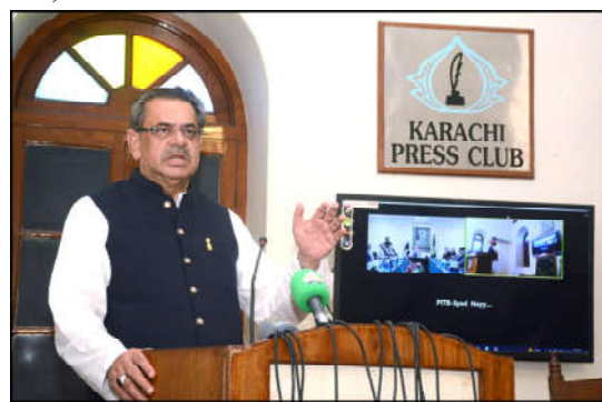
KARACHI: Caretaker Federal Minister for Religious Affairs and Interfaith Harmony Aneeq Ahmad addressing a Hajj Balloting 2024 at Karachi Press Club.

In reply to a question, he said that first time in the history of Pakistan, Hajj flights will also operate from Skardu.