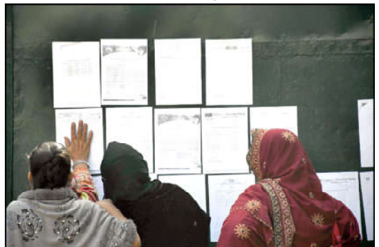
KARACHI: Candidates submitted their nomination paper to contest General Election gathers outside Provincial office of Election Commission after scrutiny, in Provincial Capital.

Today, Qureshi was brought to the court of Duty Magistrate Syed Jahangir Ali in an armoured police van. A video shared by the PTI on social media showed policemen escorting a hand-cuffed Qureshi.