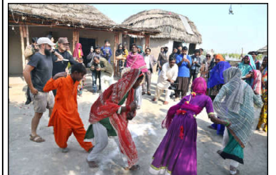
TANDO ALLAHYAR: Foreigners dancing with the villager at the model of the Climate Resilience Markaz of bamboo housing by the Intellectual Property Organization, Government of Pakistan, in Pono village.