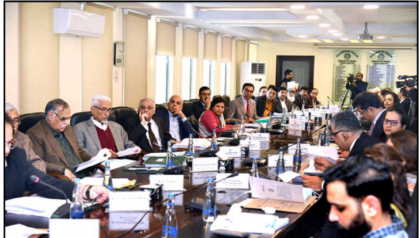
ISLAMABAD: Minister for Finance, Revenue and Economic Affairs, Dr. Shamsad Akhtar chairing a meeting of Economic Coordination Committee of the Cabinet.

The committee also approved the principles for settlement of capacity deduction issues of imported coal based projects and subsequent execution of side agreement with Port Qasim Electric Power Company.