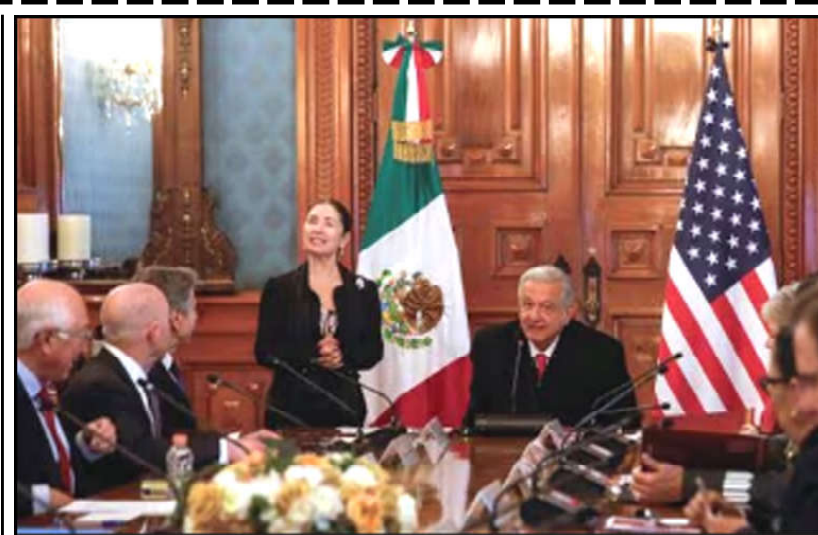
U.S. Secretary of State Antony Blinken attends a meeting with Mexico's President Andres Manuel Lopez Obrador and U.S. Secretary of Homeland Security Alejandro Mayorkas to discuss migration amid concern about increased crossing at the U.S.-Mexico border, in Mexico City, Mexico.

It also says the outbreak of conflict in the Middle East is a result of the longstanding failures of U.S. foreign policy and called for the establishment of a Palestinian state. In his comments to Tass, Lavrov called for de-escalation of the Middle East conflict, denouncing as "unacceptable" both acts of terror and "collective punishment". "It is vital to break the vicious cycle of violence and do away with the injustice from which several generations of Palestinians have suffered," he was quoted as saying. "Only by doing this can stability be achieved in the zone of confrontation in the Middle East as a whole."