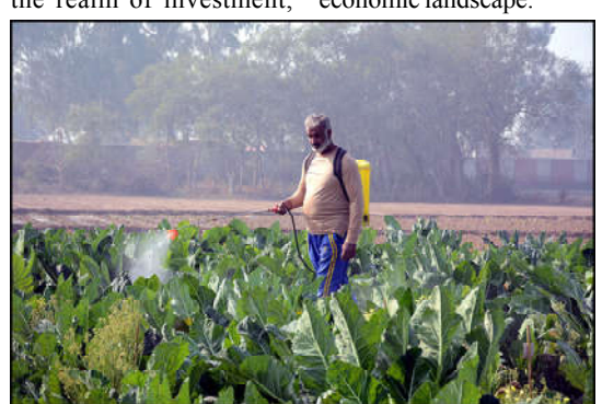
FAISALABAD: A farmer spraying pesticides on the crop to protect them from insects at his field.

The event, held at a local hotel, brought together key stakeholders to address pivotal aspects concerning the aquaculture industry. The symposium served as a platform for discussing crucial areas, emphasising advisory policy to offer strategic guidance for individuals and entities engaged in aqua-related enterprises. Additionally, it delved into the realm of investment, dissecting opportunities and strategies aimed at attracting investments into the aquaculture sector, fostering its growth and sustainability.