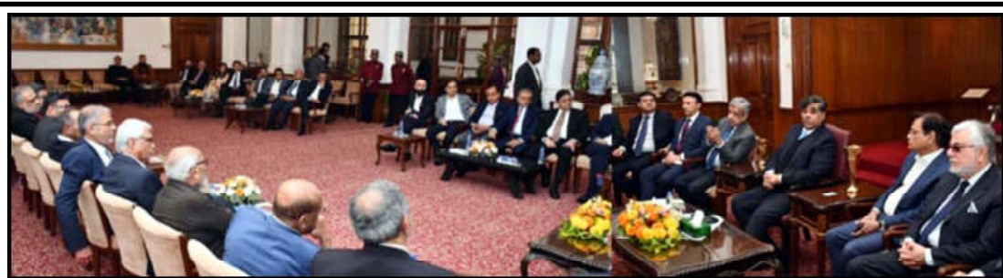
Federal Minister of Commerce, Industries and Production and Investment Dr. Gohar Ejaz is meeting with delegation of Business community at Governor House Karachi.

There was definitely a dire need for promoting the steel sector as the demand for steel was higher than its production and the demand and supply gap was met through imports.