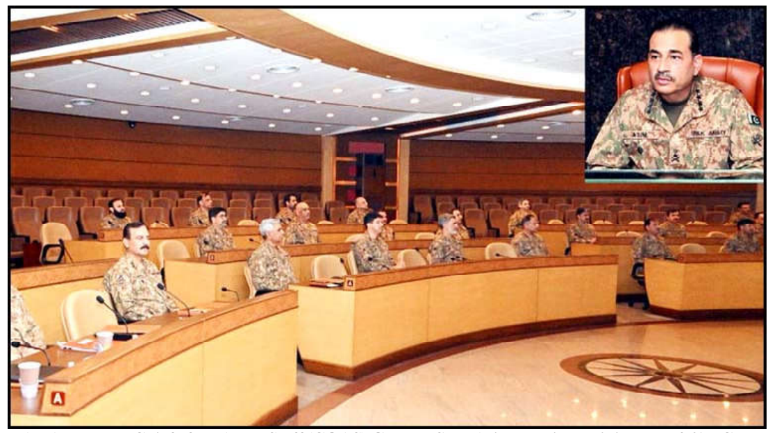
RAWALPINDI: Chief of the Army Staff (COAS) General Syed Asim Munir presiding over 261st Corps Commanders Conference held at General Headquarters (GHQ).

It paid rich tribute to the supreme sacrifices of, Shuhada, including officers and men of the Armed Forces, Law Enforcement Agencies (LEAs) and citizens who laid their lives for ensuring peace and stability in the country.