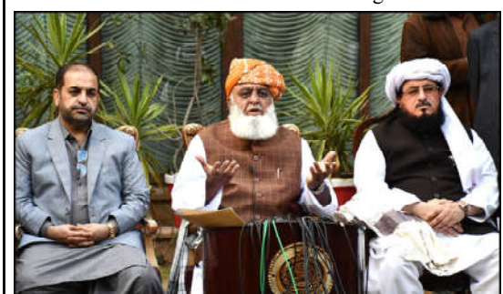
ISLAMABAD: Chief of Jamiat Ulema-e-Islam (F) Mulana fazul Rehman addressing a press conference at his residents in Federal Capital.

Pakistan was keen to promote cooperation with Iran in the fields of film and drama. He said a memorandum of understanding has already been signed between the Associated Press of Pakistan and the Islamic Republic News Agency (IRNA). Additionally, Pakistan Electronic Media Regulatory Authority (PEMRA) and Iran's Audio Visual Media Regulatory Authority (SATRA) and the Directorate of Electronic Media and Publications, Pakistan Television and Iran's audiovisual and cinema sector, had been working on the MoUs to promote bilateral cooperation, he added. They agreed to expedite the process of agreement between Pakistan Television Corporation and Islamic Republic of Iran Broadcasting.