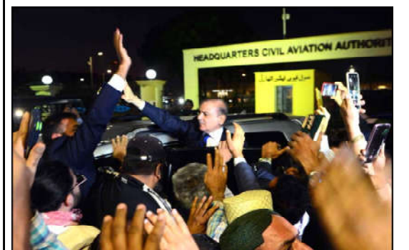
KARACHI: Muslim League (PML-N) President, Shehbaz Sharif waving hand to his supporters as he reached in Karachi.

lim Ummah were deeply saddened by the genocide of the oppressed Palestinians, especially the massacre of innocent children, in Gaza and the West Bank. "Since October 7, 2023, more than 21,000 innocent Palestinians have been martyred by the brutal Israeli forces, including a large number of innocent children - around 9,000," the prime minister remarked. He said to stop the Israeli bloodshed, Pakistan had raised its voice for the oppressed Palestinians at every world forum and it would always continue to do so in future as well.