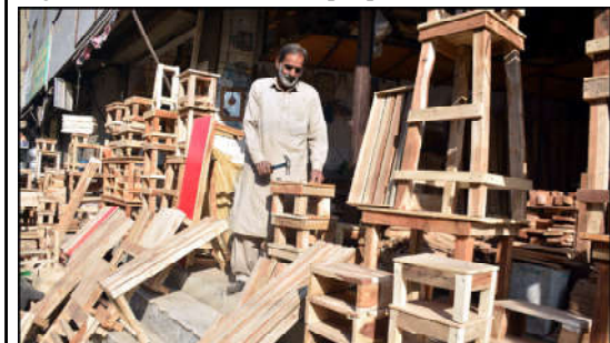
RAWALPINDI: A carpenter is busy in his work at Furniture shop along the Asghar Mall road in City.

Participants of the meeting held threadbare discussions on issues about Pak-Afghan trade and agreed on taking measures for the promotion of commerce in the region for the benefit of thousands of people on both sides.