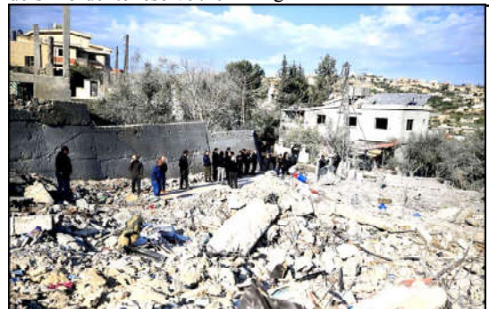
LEBANON: People gathered near debris of buildings damaged during Israeli attack on Bint Jbeil.