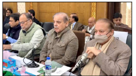
LAHORE: PML-N Quaid Muhammad Nawaz Sharif and President Muhammad Shahbaz Sharif presiding over 16th meeting of Parliamentary Board.

KARACHI (APP): Mayor Karachi Barrister Murtaza Wahab has said that the PPP-led Sindh government has worked on improving the National Institute of Cardiology (NIC) and Jinnah Sindh Medical University (JSMU) during the last 12 years and there was a need to focus on basic health issues in the province. He said this while speaking as chief guest on the signing of Memorandum of Understanding (MoU) between the NIC, JSMU and the Association of Pakistani Descent Cardiologists of North America and at the opening ceremony of the JSMU's Landhi campus for prevention and treatment of heart diseases, blood pressure and diabetes. The Mayor said that the establishment of a health center for the treatment of heart diseases and diabetes in Landhi area was a good omen for Karachi, which would help the citizens for free medical tests like blood pressure, ECG, laboratory tests, echocardiography.