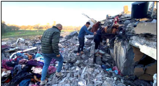
Palestinians inspect the site of an Israeli strike on a house, amid the ongoing conflict between Israel and Hamas, in Khan Younis in the southern Gaza Strip.

The drone attack was claimed by the Islamic Resistance in Iraq, a loose formation of armed groups affiliated with the Hashed al-Shaabi coalition of former paramilitaries that are now integrated into Iraq's regular armed forces.