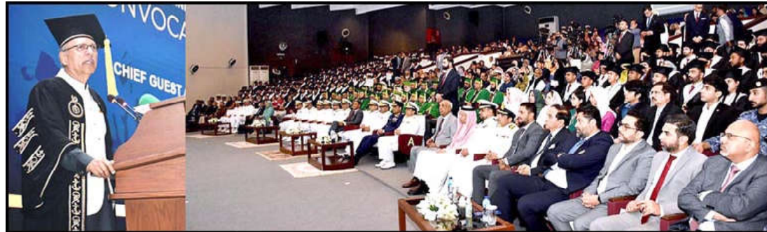
KARACHI: The President of Pakistan, Dr. Arif Alvi addressing the Pakistan Navy Engineering College (PNEC) Convocation 2023.