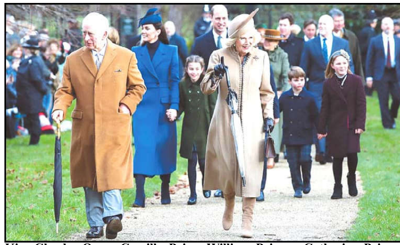
King Charles, Queen Camilla, Prince William, Princess Catherine, Princes George and Louis, and Princess Charlotte, arrive at St Mary Magdalene's church to attend the royal family's Christmas service.

“Further forensic and technical analysis will be required to establish the vector of attack, including type and amount of explosive used,” the statement added. A spokesperson for Iran's foreign ministry on Monday called a US claim that Iran had attacked the ship near India “baseless”.