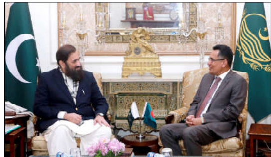
LAHORE: Bangladesh High Commissioner in Pakistan Ruhul Alam Siddique meeting with Punjab Governor Muhammad Baligh-ur-Rehman.

minister visited various wards of Mardan Medical Complex, including the OPD, Accident and Emergency Ward, Neurosurgery Ward, Orthopedic Ward, Medical Ward, and CCU (Cardiology Ward). The provincial minister said that the provincial government has launched the Khushal Khyber Pakhtunkhwa program to improve the provision of various services, under which the ministers are going to various districts to review the facilities provided to the people to improve them further.