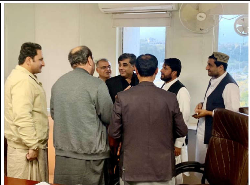
Caretaker Federal Minister of Commerce and Industry, Dr. Gohar Ejaz interacting with the members of the Chairman Chamber of Commerce and Industry at the Commerce Ministry in Islamabad.

The exchange rates of the Emirates Dirham and the Saudi Riyal decreased by 05 and 04 paise to close at Rs 76.88 and Rs75.27 respectively.