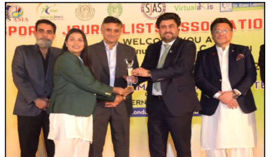
KARACHI: Governor Sindh Kamran Khan Tessori giving award to journalists during award distribution ceremony of Sports Journalist Association Sindh held at Governor House.

LARKANA (APP): Chairman Pakistan People's Party (PPP) Bilawal Bhutto Zardari on Tuesday said the nation eloquently commemorates the indelible legacy of Shaheed Mohtarma Benazir Bhutto, the first democratically elected woman prime minister of the Islamic world as well as esteemed leader of the world, saying that the "Daughter of the East" stands not only as a historical figure but as a living movement and a radiant torch. Her nationalistic spirit, enduring struggle and steadfast leadership destined to be ingrained in the hearts and minds of the Pakistani nation, he said while sharing a reflective message on the occasion of 16 th martyrdom anniversary of slain Chairperson of PPP Shaheed Mohtarma Benazir Bhutto to be celebrated on Wednesday. He said that her mother remained ardently dedicated he life to the noble cause of transforming the country into a genuine welfare state, guided by the visionary ideals of the nation's founding leaders.