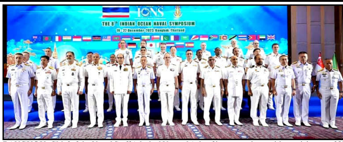
BANGKOK: Chief of the Naval Staff Admiral Naveed Ashraf in group photo with participants of 8th Indian Ocean Naval Symposium (IONS) Conclave in Thailand.

He said that health insurance will not only provide quality healthcare facilities to people, but it will also help improve the condition of hospitals and benefit medical staff.