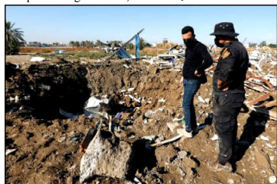
A fighter of the Iraqi Kataib Hezbollah militia group and a man inspect the site of a U.S. airstrike, in Hilla, Iraq.

This “extremely dangerous” behaviour seriously harmed regional peace and stability, it added.