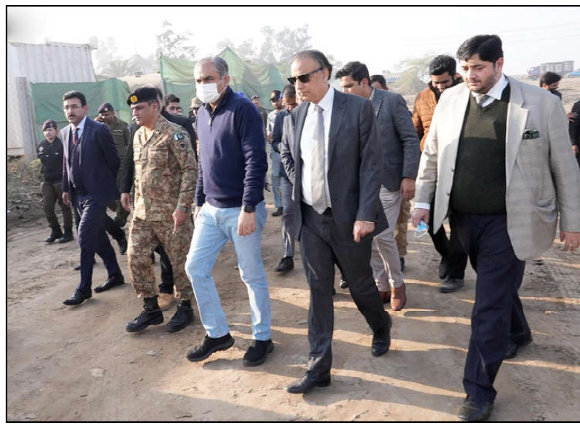
LAHORE: Caretaker Chief Minister Punjab Mohsin Naqvi inspecting the under construction work of Lahore Ring Road Southern Loop-III Project.

translated into even stronger economic, trade, investment, educational, and cultural linkages to the benefit of both nations. He said it is heartening to know that Pakistani medical and dental students are studying in Bangladesh on scholarships. He said that there should be maximum exchange of student delegations in the educational institutions of the two countries. He said that he would also talk to the Higher Education Commission for scholarships for Bangladeshi students in Pakistani educational institutions.