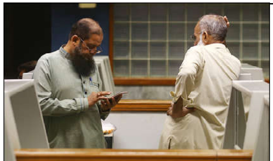
KARACHI: Stockbrokers monitor the share prices during a trading session at the Pakistan Stock Exchange (PSX) in Karachi, Pakistan, 26 December 2023. The Pakistani benchmark 100 index 59,170.97 was down 2534.12 with points during the trading session.