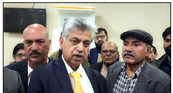
ISLAMABAD: Caretaker Federal Minister for Information Murtaza Solangi talking with media men.

ISLAMABAD (APP): Caretaker Federal Minister for Information and Broadcasting, Murtaza Solangi on Tuesday said the government would explore maximum options to redress the problems of journalist fraternity, and seek legal action, in accordance with the Constitution, to restrict forced job layoffs of media persons. Talking to the media after the walkout of journalist during the 334 th session of the Senate in the press gallery, he expressed full solidarity with the journalist community regarding the forced dismissal by some media houses. Solangi said the legal provisions would be explored to take punitive action and extend support to safeguard the rights of media workers. "I stand with journalists and media workers; the issue of forced dismissals of journalists is not acceptable," he said.