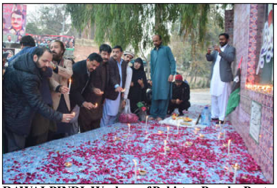
RAWALPINDI: Workers of Pakistan Peoples Party light up the candles in memorandum of Former Prime Minister Benazir Bhutto (Shaheed), at her targeting place, Liaquat Bagh in City.

Independent Report PESHAWAR (APP): The candidates of all mainstream politico-religious parties and independents have expedited election campaigns and corner meetings to inform the masses about their election manifestos after submitting nomination papers for different constituencies for general election 2024. The scrutiny of nomination papers continued in the respective offices of returning officers in all 37 districts of KP where the process would be completed by December 30, 2023. Eying on national and provincial assemblies, the stalwarts of Pakistan Peoples Party (PPP), Pakistan Muslim League-N (PML-N), Awami National Party (ANP), Jamiatul Ulama Islam-F (JUI-F), Jumate Islami Pakistan and Pakistan Tehreek e Insaf (PTI) have mostly fielded political heavyweights to clinch maximum seats from Khyber Pakhtunkhwa and form government for next five years. On NA-28 Peshawar-1, a total of 33 candidates filed papers including former member national assembly, Noor Alam Khan of JUI-F, former minister KP, Taimur Salim Jhagra of PTI and ex-speaker KP assembly.