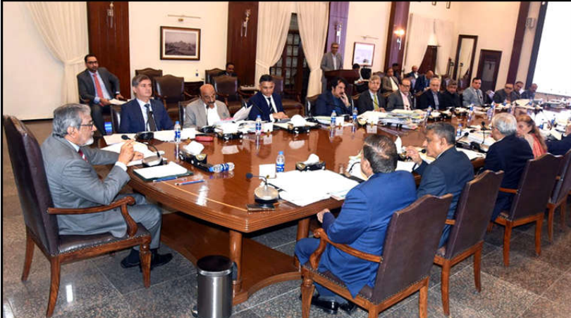
KARACHI: Caretaker Chief Minister Justice @ Maqbool Baqar chairing the cabinet meeting at CM House.

ISLAMABAD (APP): Caretaker Prime Minister Anwaar-ul-Haq Kakar on Tuesday said that despite the availability of limited resources, the government would extend all possible support to the provincial government for uplift and welfare of the merged districts of Khyber Pakhtunkhwa (KPK). The prime minister, chairing a meeting to discuss the matters about KPK, said that being cognizant of their problems, the federal government stood with the government and people of the province. He also instructed the authorities concerned to resolve the issues confronting the KPK province that had rendered immense sacrifices against terrorism. The prime minister instructed to form a secretarial committee to resolve the KPK's financial matters and formulate recommendations regarding the payment of net hydro profits and the royalty of oil and gas.