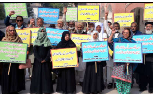
HYDERABAD: Members of Government Retired Teachers Association hold a protest rally in the favor of their charter of demands.

The senior politician said that he has been a minister 17 times and no corruption charge has ever been levelled against him.