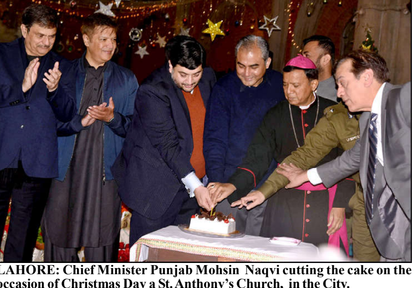
LAHORE: Chief Minister Punjab Mohsin Naqvi cutting the cake on the occasion of Christmas Day a St. Anthony's Church, in the City.