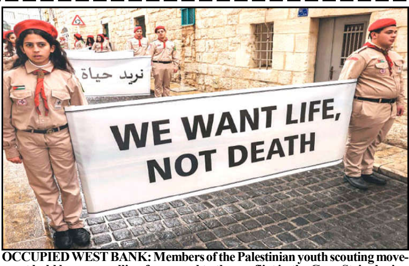
ment hold banners calling for an end to the conflict in the Gaza Strip during a procession to welcome the Latin Patriarch of Jerusalem. Eight police

Some former leaders of the West have spoken about a new Cold War between Russia and China on one side and the United States and its allies on the other. though Russia's $2 trillion economy would find it hard to counter the entire might of the West alone for long.