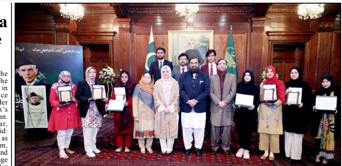
LAHORE: Governor Punjab Muhammad Balighur Rehman in a group photo with during function organized in connection with the Quaid Day at the Governor House.

"This assembly serves as a crucial platform, fostering collaboration and on the path to gender equality and empowerment of women in Pakistan Together, let's unite to construct a society where