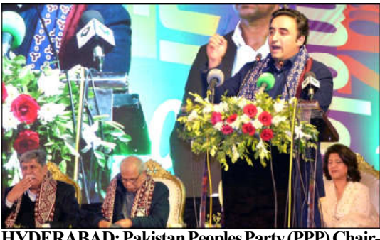
HYDERABAD: Pakistan Peoples Party (PPP) Chairman Bilawal Bhutto-Zardari speaking at 9th Ayaz Melo organised by Khanabadosh Writers Cafe in collaboration with Culture & Turism Department Sindh at Sindh Museum.

About the global challenge of climate change, Bilawal proposed a comprehensive awareness campaign to tackle environmental concerns