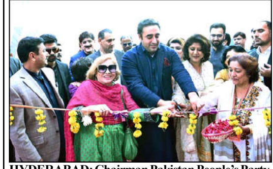
HYDERABAD: Chairman Pakistan People's Party, Bilawal Bhutto Zardari cutting the ribbon during opening ceremony of Ayaz Mela at Sindh Museum.

He said trainers of In- for the Hajj training pro-Islamic gram are commendable