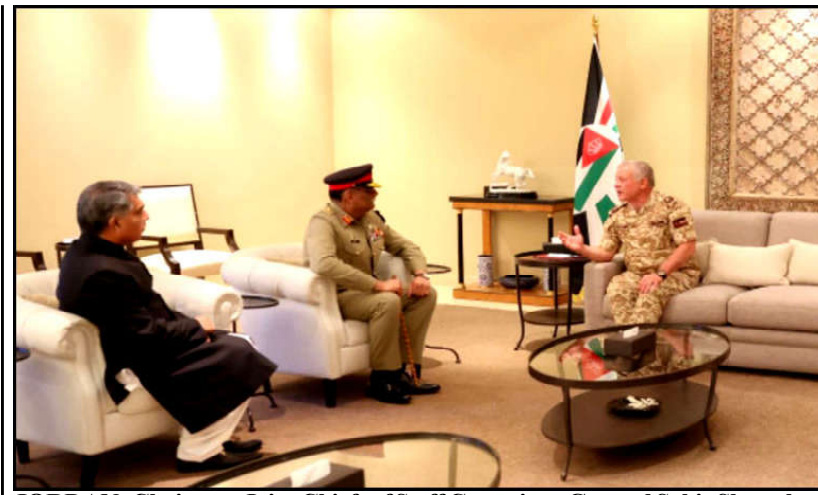
JORDAN: Chairman Joint Chiefs of Staff Committee General Sahir Shamshad Mirza called by King of Jordan King Abdullah II Ibn Al Hussain at Jordan.

"Pakistani doctors are the best in the world and graduates of KMC doctors were known internationally for their hard work, professionalism and devotion in healthcare services," he said.