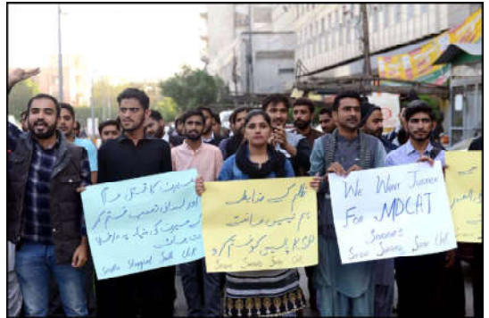
KARACHI: Students of Medical and Dental Colleges Admission Test (MDCAT) are holding protest demonstration for acceptance of their demands, held at Karachi press club.