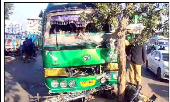
KARACHI: View of site after traffic accident due to over speeding and break failed, located near Bagh-e-Korangi area in Karachi.

The DG also highlighted various measures taken by Sindh Food Authority to deal with the issues and informed that such steps have yielded positive results.