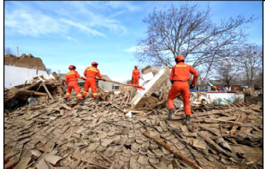
Rescuers work amid the rubble at Shiyuan village following the earthquake in Jishishan county, Gansu province, China.