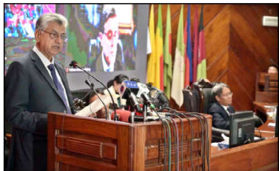
ISLAMABAD: Caretaker Minister for Information and Broadcasting, Murtaza Solangi addressing at 8th CPEC Media Forum on "Next Decade of CPEC Opportunities & Learning from Past Decade" at COMSTECH.

He said the CPEC eventually expedited Pakistan's economic development process and so far multiple projects had been completed in the energy sector alone. "CPEC significantly boosted Pakistan's economic growth," he noted.