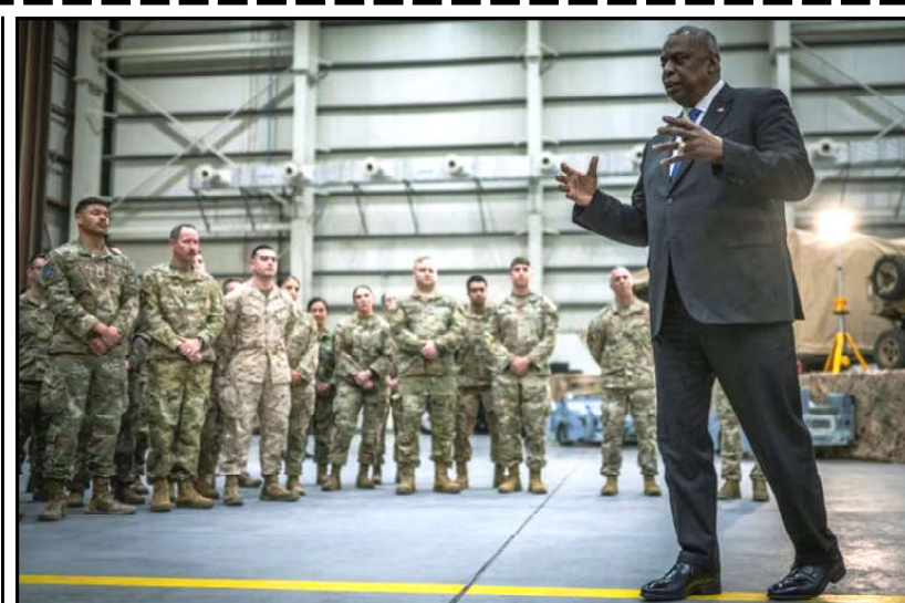
U.S. Secretary of Defense Lloyd Austin speaks with service members stationed at Al Udeid Air Base, Doha, Qatar.

Shoigu said that 650,000 Russian soldiers have received combat experience in Ukraine, turning the Russian army into "the best prepared and capable army in the world, armed with advanced weapons that have been tested in combat."