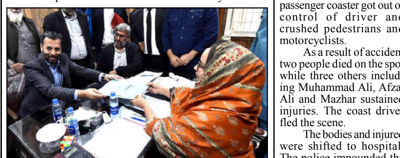
KARACHI: MQM Pakistan leader Mustafa Kamal submitting nomination paper at Office of the deputy Commissioner Kemari for upcoming General Election.

The ECC showed its displeasure on the PSM Board and recommended that the Industries Division might look into the issue for further necessary action.