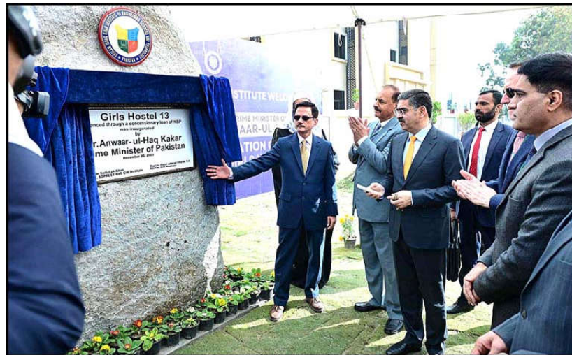
SWABI: Caretaker Prime Minister Anwaar-ul-Haq Kakar inaugurates new building of Girls Hostel at Ghulam Ishaq Khan Institute of Engineering Sciences and Technology.