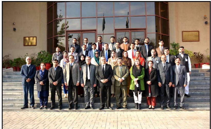
Judicial Assistants of the Supreme Court of Pakistan in a group photo with Mr. Justice Athar Minallah at the Federal Judicial Academy Islamabad.

The arrested suspect was immediately transferred to the hospital for medical treatment, while efforts were underway to arrest the fleeing accomplice.