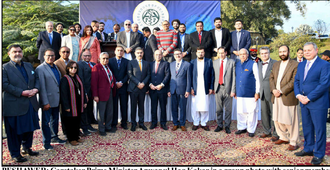
PESHAWAR: Caretaker Prime Minister Anwar ul Haq Kakar in a group photo with senior member doctors of the Association of Physicians of Pakistani Descent of North America (APPNA) at the 46th Winter Khyber Medical College Convention organized in collaboration with APPNA on 20 Dec 2023.

During the meeting, the ongoing progress on the complex under construction of the UCHS was also reviewed in detail.