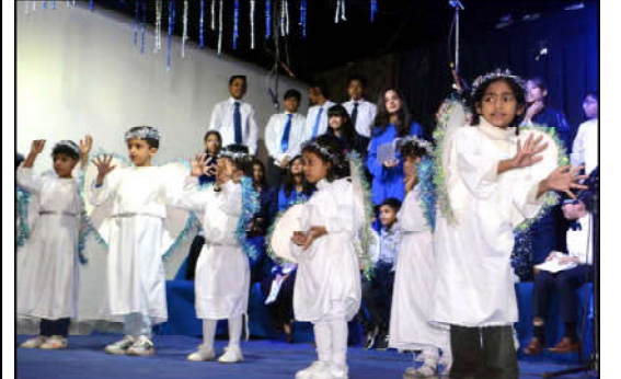
KARACHI: Members of Christian Community are performing tableau on stage during celebration ceremony in connection of Christmas Day Celebrations coming ahead, at St. Anthony's Church in Karachi.