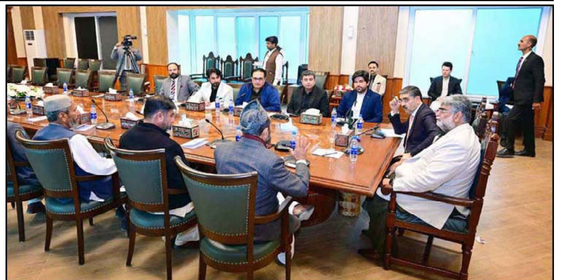
QUETTA: A delegation of the Zamindar Action Committee of Balochistan call on caretaker Prime Minister Anwaar-ul-Haq Kakar.

"Four companies can meet the standards set by the Chinese authorities, our exports can soar.