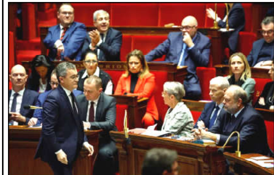
French Interior Minister Gerald Darmanin and members of the French government attend the questions to the government session at the National Assembly ahead of a vote by members of parliament on immigration bill in Paris, France.

"Positive developments we expect both on (procuring US) F-16s and Canada's promises (on lifting its arms embargo) would help our parliament to have a positive approach to Sweden... All of them are linked."