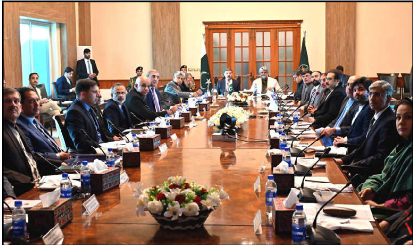
QUETTA: Caretaker Prime Minister Anwaar-ul-Haq Kakar presiding over a meeting regarding law & order and development projects in the province. Caretaker Provincial Chief Minister Mir Ali Mardan Khan Domki, Caretaker Federal and Provincial Ministers are also present.

After the oaths taking, the process is scheduled to commence, following the requirements of the Elections Act 2017.