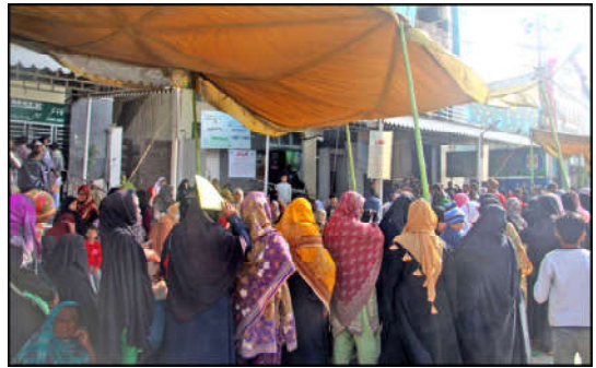
KARACHI: A large number of the people are waiting for their turn outside NADRA Mega Center in Provincial Capital.

pitals should be improved and the supply of food, treatment and medicines should be ensured to the patients. He further said that the presence of doctors, para-medics and other related staff should be ensured in the hospitals so that patients can get timely treatment and their food and drink should also be taken care of. No negligence is to be tolerated in this regard, he warned. He also said that all the sections of the RHC/BHU should be made functional and clean. Assistant Commissioner Ratodero, Incharge of the hospital, officials of the health department, doctors and others were present on the occasion.