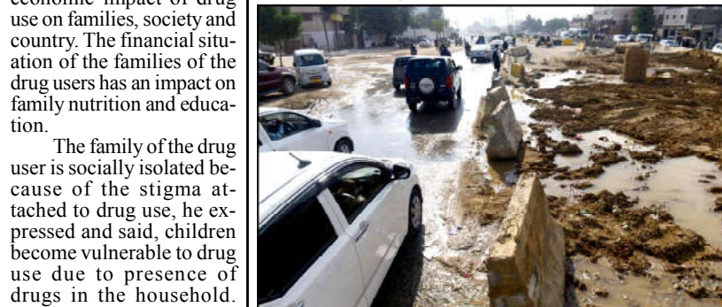
KARACHI: Commuters are passing through inundated road by overflowing drinking water after bursting drinking water lines, creating problems for commuters, showing negligence of concerned authorities, located on University road in Karachi.