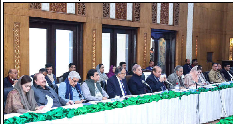
LAHORE: PML (N) Quaid Muhammad Nawaz Sharif and President Shabbaz Sharif presiding over a meeting of Parliamentary Board