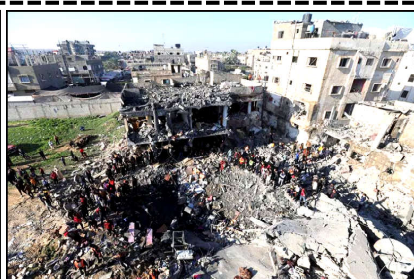
Palestinians gather at the site of an Israeli strike on a house, amid the ongoing conflict between Israel and the Palestinian Islamist group Hamas, in Rafah, in the southern Gaza Strip.

The quake was China's deadliest since 2014, when more than 600 people died in southwestern Yunnan province. China's western hinterland carries the scars of frequent seismic activity, and a huge quake in Sichuan province in 2008 left more than 87,000 people dead or missing, including 5,335 schoolchildren.