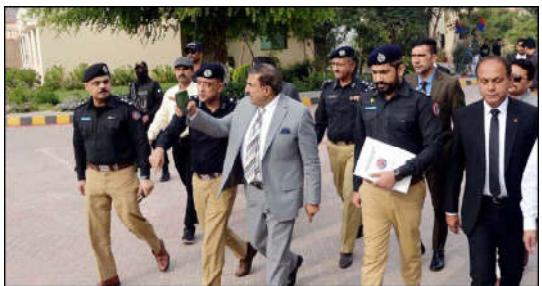
HYDERABAD: Caretaker Home Minister Sindh Brigadier (Rtd) Haris Nawaz visit staff Training Academy at Central Prison Hyderabad.

Both the sides discussed avenues of joint training and reiterated the need for enhancing training interactions between CENTCOM and the Pakistan Army. The COAS also visited the CENTCOM Joint Operations Center during the visit.