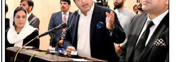
LAHORE: Chairman Pakistan Peoples Party Bilawal Bhutto Zardari addressing lawyers at Lahore High Court Bar Association.

"Until we make this decision," Bilawal declared, "it doesn't matter who becomes the prime minister. If we continue with the old politics, the country will not run, and we will not overcome our economic problems." His call for a shift in political culture emphasized the need for moving beyond personal attacks and focusing on issues of national concern.