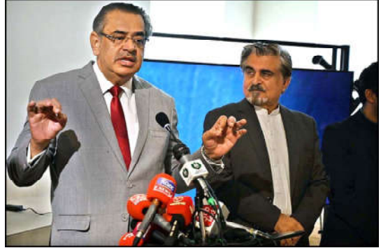
ISLAMABAD: Caretaker Federal Minister for Religious Affairs & Interfaith Harmony Aneeq Ahmed talking to media along with Caretaker Federal Minister for National Heritage and Culture Jamal Shah to inaugurate two-week long "Teaching of Calligraphy to Madrassa Students as a creative segment of Curriculum" at PNCA.

in a branch of a bank. "A candidate will submit his/her income tax returns of three years, annexed with nomination papers," the guidelines read. "The copies of full passport of the candidate would also require to be annexed with nomination papers." "The age of a candidate on last date of submitting the nomination papers must not be lesser than 25 years," ECP said. "A candidate of the National Assembly seat must be a voter of any place within Pakistan." "A candidate of a provincial assembly must be a native of the concerned province," ECP announced.