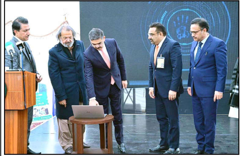
QUETTA: Caretaker Prime Minister Anwaar-ul-Haq Kakar launches the Prime Minister's Youth Skill Development Program.

The envoys presented their diplomatic credentials to the president and separately called on him, at the Aiwan-e-Sadr, a President House press release said. Welcoming Egyptian