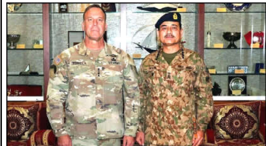
Chief of Army Staff (COAS) Asim Munir meeting with Gen Michael Erik Kurilla, the Commander of the US Central Command (CENTCOM).

According to the announcement issued by the ECP, Ahad Cheema can influence the elections, he has been instructed to immediately separate the post of advisor.