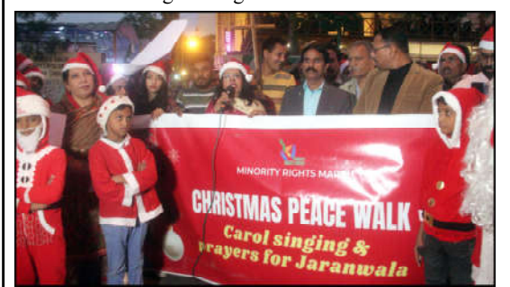
KARACHI: Members of Christen Community holds rally from Trinity Church to Press Club, during the celebrations of the Christmas in Provincial Capital.