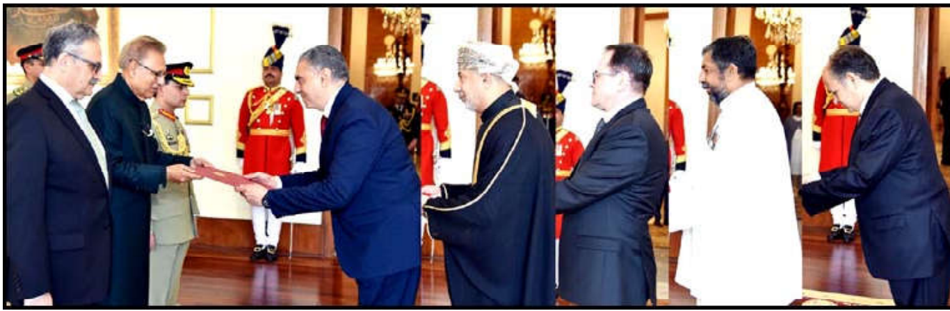
The Ambassadors-Designate of the Arab Republic of Egypt, Sultanate of Oman, Bosnia & Herzegovina, Republic of Cyprus and the High Commissioner-Designate of the Democratic Socialist Republic of Sri Lanka presenting their credentials to President Dr. Arif Alvi, at Aiwan-e-Sadr, Islamabad.