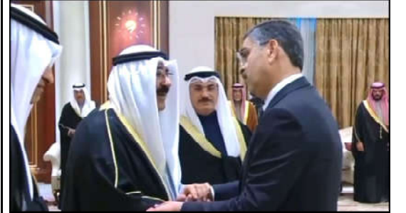
Sheikh Meshal al-Ahmad al-Sabah, the Prime Minister offered his heartfelt condolences on behalf of the leadership, government and people of Pakistan.

KUWAIT (APP): Caretaker Prime Minister Anwaar-ul-Haq Kakar visited Kuwait today to offer condolences over the sad demise of the Amir Nawaf Al-Ahmad Al-Jaber Al-Sabah. During his meeting with the new Amir