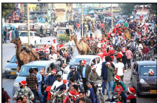
KARACHI: The participants of a 'Christmas Aman Rally' passing through Jackup line Road to culminate at Karachi Press Club (KPC).

ISLAMABAD (APP): The Securities and Exchange Commission of Pakistan (SECP) has issued a set of Frequently Asked Questions (FAQs) regarding the concept of category-wise voting for the election of directors. This concept was recently introduced through amendments in the Listed Companies (Code of Corporate Governance) 2019, said a press release issued here on Monday. The introduction of category-wise voting aims to address practical challenges faced by listed companies in election of independent directors and female directors, ultimately promoting diversity on the boards of listed companies. Following the regulatory amendments, SECP has issued FAQs to provide additional guidance to stakeholders and address common questions related to the implementation of this new concept. The FAQs explain important concepts such as the calculation of votes for each category, procedures for unopposed elections in a category etc. These FAQs are expected to simplify the understanding of the regulatory context, address practical concerns, and facilitate the implementation of the category voting concept. This initiative is anticipated to contribute to the promotion of best standards of corporate governance, ensuring diversity on the boards of listed companies, and encouraging greater inclusion of women. The aforementioned FAQs are available on the SECP website for easy access and reference.