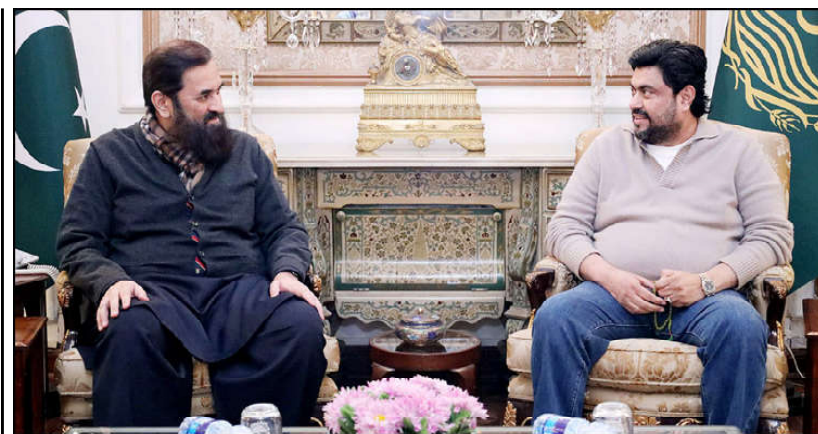
LAHORE: Governor Sindh Kamran Khan Tessori meeting with Punjab Governor Muhammad Balighur Rehman at Governor House.

KARACHI (APP): The Pakistan Customs authorities made a significant drug seizure in the vicinity of the Northern Bypass, leading to the arrest of two individuals. Acting on a tip-off, the Anti-Smuggling Organization (ASO) intercepted a trailer traveling through the Katcha area from Sunday night to Monday, according to a spokesman for Customs on Monday. Upon inspection of the toolbox section's spare wheel, officials uncovered 57 packets of hashish weighing 70 kilograms. The confiscated drugs, estimated at a value of around 10.5 million rupees, were swiftly seized by customs officials.