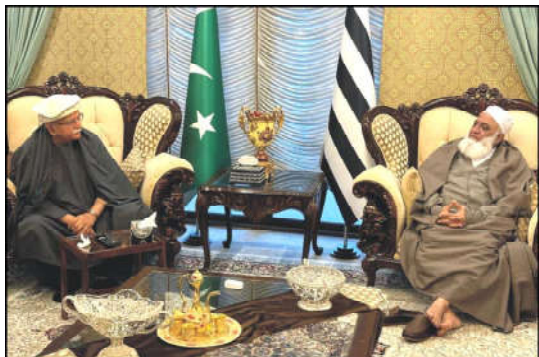
ISLAMABAD: Chairman Pakhtoonkhwa Milli Awami Party Mahmood Khan Achakzai meeting with Amir Jamali Ulema-e-Islam Maulana Fazlur Rehman.