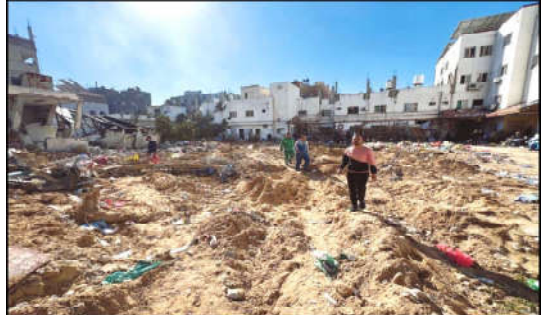
Bulldozer tracks are seen in the area where tents were erected outside the Kamal Adwan Hospital by displaced people. Palestinian authorities have accused Israel of razing the area as people slept.

work of stability in a volatile region - an argument that has also proved effective with Gulf and Western allies providing financial support to his government. Voting in Egypt was held over three days on Dec. 10-12, with the state and tightly controlled domestic media pushing hard to boost turnout, which the election authority said had reached 66.8% - above the 41% recorded at the last presidential election in 2018. The election featured three other candidates, none of them high profile. The most prominent potential challenger halted his run in October, saying officials and thugs had targeted his supporters.