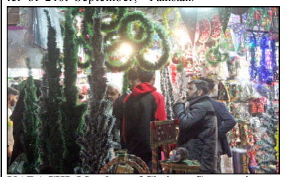
KARACHI: Members of Christen Community are busy in shopping at Boheri Bazaar during preparation following the celebrations of Christmas in Provincial Capital.

ISLAMABAD (INP): Chairman Senate of Pakistan, Muhammad Sadiq Sanjrani on Monday extended warm congratulations to the leadership and people of Qatar on the occasion of their National Day. Commending the visionary and astute leadership of His Highness Sheikh Tamim Bin Hamad Al Thani, the Amir of Qatar, and Prime Minister His Highness Sheikh Mohammed bin Abdulrahman Al Thani, he said that their unwavering commitment to progress and peace has garnered global admiration. Sadiq Sanjrani said, Qatar's leadership has played a pivotal role in resolving longstanding global conflicts, notably in mitigating the Afghanistan crisis. In the face of the current escalation and humanitarian crisis arising from the barbaric Israeli bombing of Gaza, Qatar's exemplary efforts to bring about peace are unparalleled. Emphasizing the strong bonds of friendship between Pakistan and Qatar, rooted in shared religious, cultural and people-to-people ties.