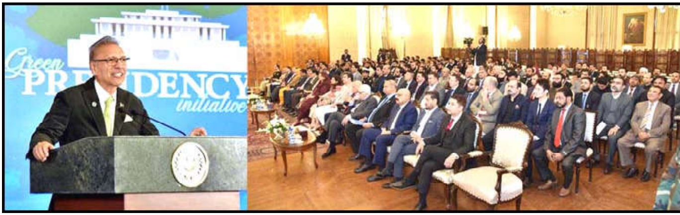
ISLAMABAD: President Dr Arif Alvi addressing the event to celebrate Award Winning Project Green Presidency, at Aiwan-e-Sadr.