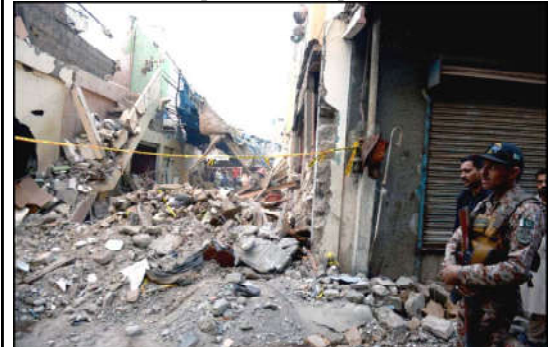
KARACHI: View of damages after building collapsed due to gas cylinder blast occurred at gas cylinder filling shop while rescue operation and investigation is underway, located on Machar Colony area in Karachi.

ISLAMABAD (APP): An earthquake of 5.8 magnitude on Richter Scale jolted Islamabad on Monday afternoon, with no reports of any damage or casualty so far. According to an official of the National Seismic Monitoring Centre (NSMC) Islamabad, the epicenter of the earthquake was Indian Illegally Occupied Jammu and Kashmir with the depth of 133 kilometres. The NSMC official said the tremors were felt in Islamabad and surrounding areas, however, no damages had been reported.