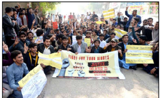
HYDERABAD: Medical students hold protest in favor of their demands outside of HPC.

LAHORE (APP): Pakistan Muslim League-Nawaz Supreme Mian Muhammad Nawaz Sharif said on Monday that the country would have been in a much better condition if the development process of his government had not been stopped. Addressing a PML-N parliamentary board meeting here, he said his government had built motorways, set up power generation plants, dams and many other projects of public welfare whereas in Karachi the drinking water project could not be completed unfortunately. He said that when the PML-N was in power the world acknowledged that Pakistan would soon become an economic power.