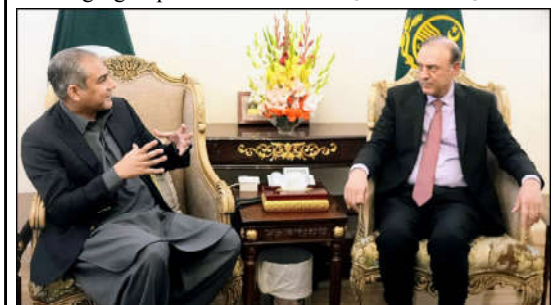
LAHORE: Governor of the State Bank of Pakistan (SBP) Jameel Ahmad called on Punjab Caretaker Chief Minister Mohsin Naqvi.

The CM also highlighted the significance of achieving record cotton production in Punjab, projecting substantial savings of two billion dollars in foreign exchange. The CM pointed out that the rice export from Punjab has exceeded two billion dollars as the provincial government is following a policy of providing comprehensive facilities to investors and industrialists, foreseeing positive ramifications in the form of a thriving stock exchange.