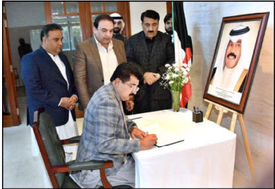
ISLAMABAD: Chairman Senate, Muhammad Sadiq Sanjrani recording his condolence on the demise of AMIR of Kuwait Sheikh Nawaf Al-Ahmad Al-Jaber Al-Sabah in the visitor's book at Embassy of Kuwait.

change of educational and business delegations will strengthen inter provincial coordination. He further stated that both the provinces can benefit from each other's experiences in various fields. He informed his counterpart from Sindh about the steps taken to improve the quality of universities in the province. He said that educated youth are the asset of the country. He emphasized that along with education, there is a need to focus on their character building. On this occasion, Governor Sindh Kamran Khan Tessori appreciated the initiative of opening the Governor House Lahore to the public in an organised manner.