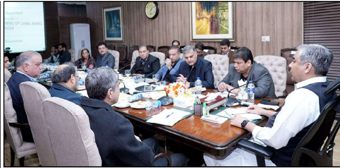
LAHORE: Caretaker Chief Minister Punjab Mohsin Naqvi chaired a special meeting in which approval for desilting 15300 miles long canals accorded.