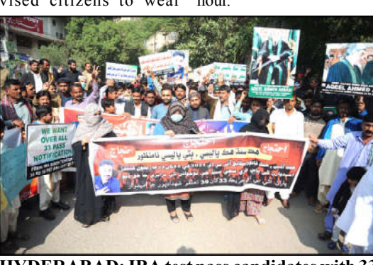
HYDERABAD: IBA test pass candidates with 33 to 39 numbers hold a protest rally for appoint-

LAHORE/KARACHI masks to avoid harmful air. partment said that the weather in Karachi is likely to remain cold and dry. Cold winds may increase the intensity of the cold. The temperature of the city was recorded at 14 degrees Celsius early in the morning. The maximum temperature today is It is likely to stay up to 28 degrees Cel-332, due to which the air sius, The humidity ratio in quality in Karachi is unthe air is 82%, the winds are blowing from the northeast at a speed of 6 km per