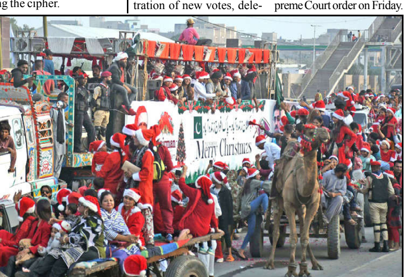
KARACHI: Christian's community wearing Santa Claus costume, participate in a Christmas peace rally ahead of the celebration of Christmas, in Provincial Capital.

terial. The ECP has also imposed ban on transfers and postings of provincial and federal government employees. It is to be mentioned here that the election commission had issued the election schedule for the February 8 general elections in compliance with the Supreme Court order on Friday