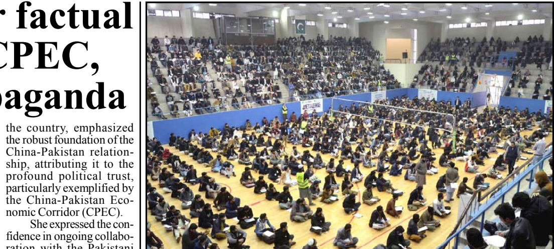
PESHAWAR: Students are solving paper of Entry Test for Information Technology (IT) Courses under the supervision of Saylani Welfare International Trust and arranged by Aziz Jan Trust, held in Peshawar.