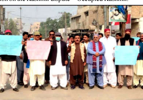
LARKANA: Members of Primary School Teachers (PST) are holding protest demonstration against non-payment of their salaries, at Jinnah Bagh in Larkana.