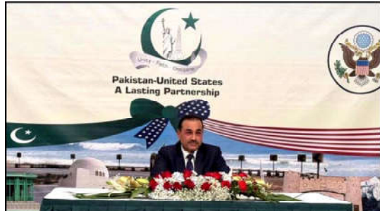
RAWALPINDI: Chief of Army Staff (COAS), General Asim Munir interacted with the Pakistani overseas community in a reception hosted by Embassy of Pakistan during his ongoing visit to US.

ISLAMABAD (APP): The All Parties Hurriyat Conference (APHC) has said that Pakistan's continued political, diplomatic and moral support has been a source of great encouragement for the people of occupied Jammu and Kashmir in their just struggle to secure their right to self-determination. The APHC spokesman, in a statement issued in Srinagar, hailed the Pakistan Caretaker Prime Minister, Anwaar-ul-Haq Kakar, for representing the aspirations of the Kashmiri people in his address to the Azad Jammu and Kashmir Legislative Assembly, yesterday, Kashmir Media Service reported on Friday. He maintained that Pakistan has always advocated the resolution of the Kashmir dispute in accordance with the Kashmiris' aspirations and the relevant UN resolutions but this objective could not be achieved due to India's intransigent attitude. The spokesman urged the international community to put pressure on India to reciprocate Pakistan's efforts to settle this lingering dispute to ensure permanent peace in the region. Meanwhile, the occupation authorities locked the Central Jamia Masjid and Bemina Imambargah in Srinagar for the 10th consecutive week and prevented people from offering Juma prayers.