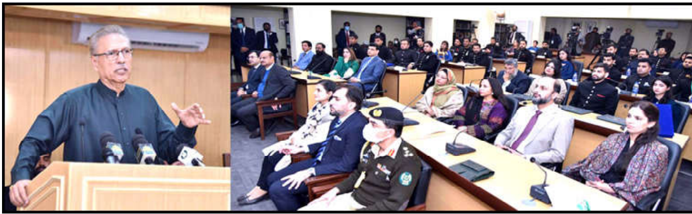
LAHORE: President Dr Arif Alvi addressing the passing out ceremony of 46th Specialized Training Program of Pakistan Administrative Service.