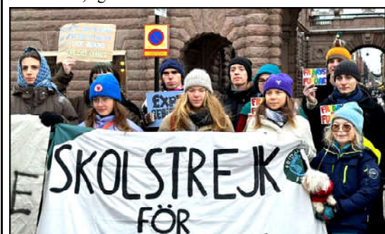
Swedish climate activist Greta Thunberg attends the Future protest outside the Parliament in Stockholm, Sweden.

Monitoring Desk BRUSSELS: European Union leaders granted Ukraine a major political win on Thursday by agreeing to start membership negotiations at a time when its counter-offensive against Russia's invasion has failed to make major gains and US military aid has become more uncertain. Diplomats and officials in Brussels said the unexpected green light for talks took place as Hungarian Prime Minister Viktor Orban, who had for weeks said he would block such a deal, agreed to leave the room, knowing the other leaders would go ahead and vote. Orban confirmed that he had abstained from the vote at the EU summit on what he called a "bad decision". It was unclear at this stage what exactly he could be getting in return. Such an unusual way to approve a decision, especially such a major one, is unheard of in Brussels, even for a place where diplomats have long been very creative about how to strike deals. Ukrainian President Volodymyr Zelensky welcomed the decision.