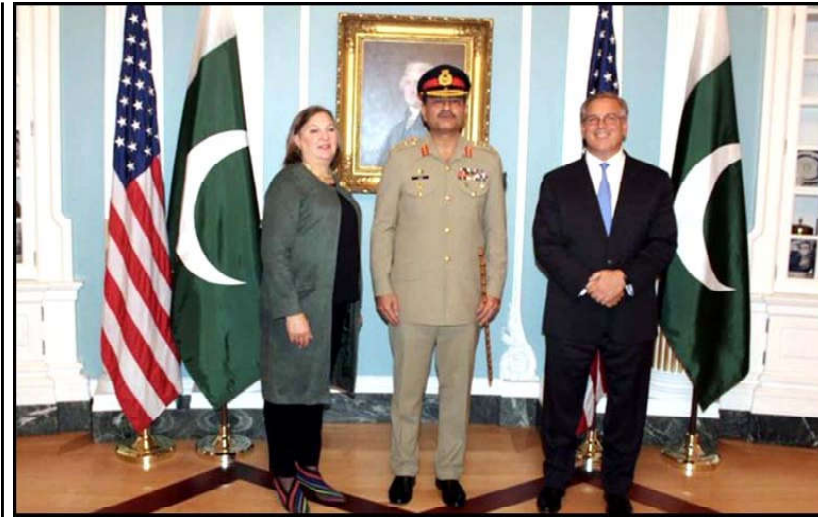
RAWALPINDI: Chief of Army Staff (COAS), General Asim Munir called on Antony J. Blinken, Secretary of State during his ongoing visit to US.

A day prior, the Election Commission of Pakistan (ECP) made the decision to approach the apex court in response to the Lahore High Court's suspension of its notification regarding the appointments of district returning officers (DROs) and returning officers (ROs) from the bureaucracy for the impending general elections.