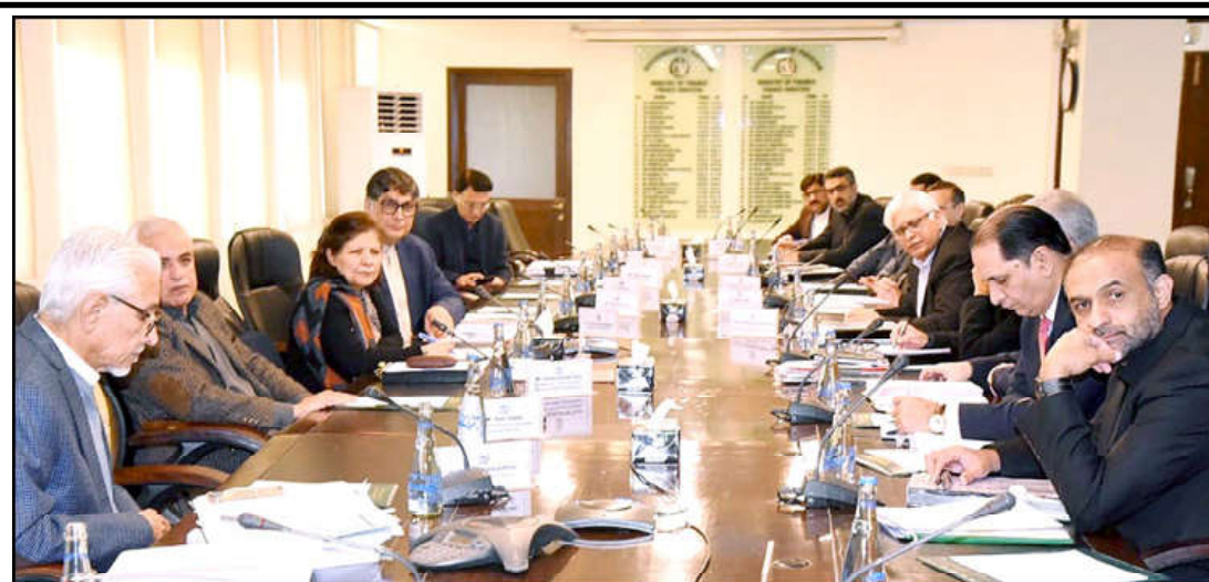
ISLAMABAD: The Federal Minister for Finance, Revenue and Economic Affairs, Dr. Shamshad Akhtar presided over a meeting of the Economic Coordination Committee (ECC) of the Cabinet.

Acknowledging the challenges, particularly attrition of borrowers,