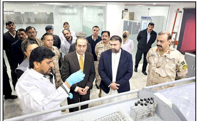
ISLAMABAD: Caretaker Federal Minister for Interior and Narcotics Control, Sarfraz Ahmed Bugti visiting the Anti-Narcotics Force Forensic Lab at ANF Academy.