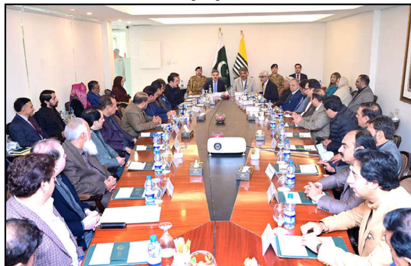
MUZAFFARABAD: Caretaker Prime Minister Anwaar-ul-Haq Kakar chairs a special meeting of the Cabinet of Azad Jammu and Kashmir.