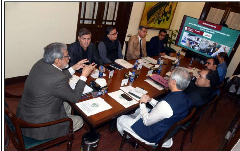
KARACHI: Caretaker Chief Minister Sindh Justice (retd) Maqbool Baqar presides over the meeting of Sindh Food Authority.

He expressed concerns about certain elements using delaying tactics that could hinder a fair and transparent electoral process, potentially undermining the people's trust.