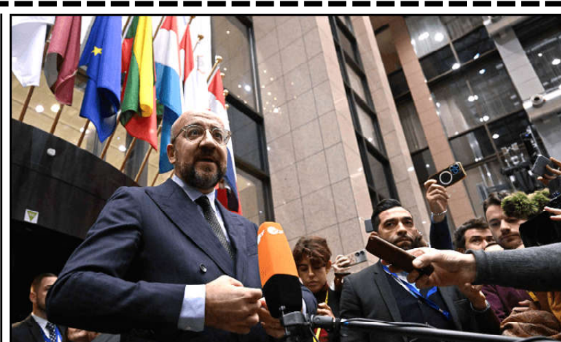
European Council President Charles Michel delivers remarks to journalists in the European Council atrium ahead of an EU leaders' dinner at the European headquarters in Brussels.

Unrelenting Israeli bombardment has laid much of the narrow coastal strip to waste over the past two months, with nearly 19,000 people confirmed dead, according to Palestinian health officials.