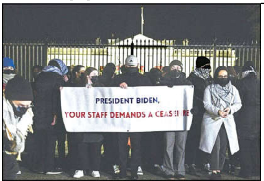
Current and former members of President Biden's staff call for a ceasefire in Gaza, outside the White House.

Monitoring Desk BRUSSELS: Hungarian Prime Minister Viktor Orban on Friday blocked $55 billion (€50 billion) in EU aid for Ukraine, after leaders side-stepped his opposition to agree to open talks with Kyiv on joining the bloc. A crunch summit in Brussels broke up after a day of wrangling as the Hungarian authoritarian leader refused to greenlight funding to help prop up Ukraine's government over the next four years. Orban called for unblocking all of the still-frozen funds from the Euro-pan Union for his country, before considering lifting his veto on further aid to Ukraine. "This is a great opportunity for Hungary to make it clear that it should get what it deserves. Not half, then a quarter, but it must get the whole thing," Orban said in an interview with Hungarian state radio. "So we want to be treated fairly, and now there is a good chance that we can assert this," he added. The wrangling injected a bitter note over the summit, a day after the leaders minus Hungary made the historic decision to open talks with Ukraine on one day joining the bloc. The second day of the summit was expected to turn to the Israeli-Hamas war in Gaza, and the search for a common EU position on it.