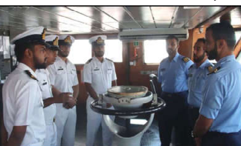
OMAN: Officials of Oman navy visit Pakistan Navy Ship TUGHRIL at Salalah Port of Oman.

MUZAFFARABAD (APP): Caretaker Prime Minister Anwaar-ul-Haq Kakar on Friday said the federal government would extend every possible financial assistance to Azad Jammu and Kashmir (AJK) for completion of development works in the area. Chairing a special meeting Azad Jammu and Kashmir cabinet, he stressed that the road network between AJK and Gilgit-Baltistan (GB) was crucial to ensure connectivity. PM Kakar said the government would provide assistance on the construction of Shuntar Tunnel connecting AJK and GB, the Murree-Muzaffarabad Expressway, and the Mansehra-Muzaffarabad-Mangla-Mirpur Expressway. He said the federal government would instruct its ministries to complete the projects relating to AJK on a priority basis. The prime minister also emphasized to benefit from the tourism potential of AJK. PM Kakar said his visit to AJK was aimed at reiterating the stance of the State of Pakistan about the internationally recognized disputed status of Jammu and Kashmir. He said India could not escape from its oppressive designs of altering the status of the Valley.