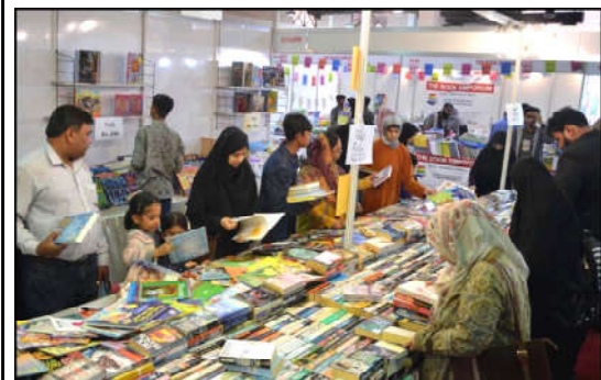
KARACHI: Students take keen interest in books during the 18th Karachi International Book Fair organized by the Publishers and Book Sellers Association (PPBA) held at Expo Centre in Karachi.