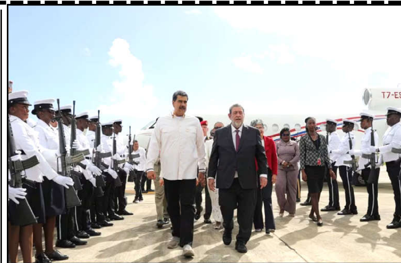
Venezuela's President Nicolas Maduro is received by the St. Vincent and the Grenadines' Prime Minister Ralph Gonsalves before a meeting with his Guyanese counterpart Irfaan Ali amid tensions over a border dispute, in Kingstown, St. Vincent and the Grenadines.

The press conference opened with questions about the conflict in Ukraine and highlighted concerns some Russians have about fears of another wave of mobilization, which has proved unpopular. In September 2022 Putin ordered a partial military call-up as he tried to boost his forces in Ukraine, sparking protests.