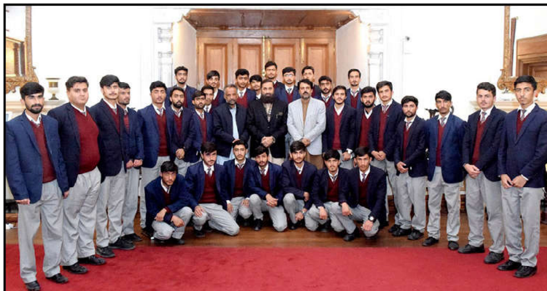
LAHORE: Punjab Governor Muhammad Balighur-Rehman in a group photo with teachers and students of Balochistan Residential College Loralai.

Governor Punjab said that the continuation of public welfare policies is very important for the development of the country.