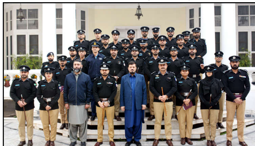
PESHAWAR: Khyber Pakhtunkhwa Governor Haji Ghulam Ali in a group photo with under training ASPs and Senior Officers of National Police Academy during their study tour to Governor House.