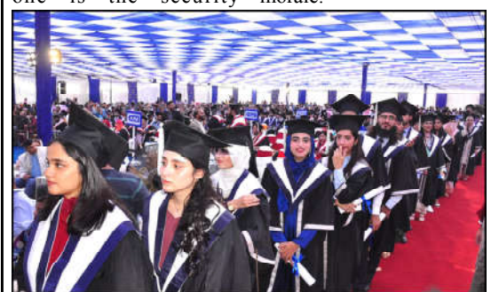
KARACHI: Newly Graduated students are celebrating their graduation during 13th Convocation at University in Federal Capital.

Referring to the Dera terror attack, he said that he met with the injured as well as the bereaved families and all of them were determined and in high morale.