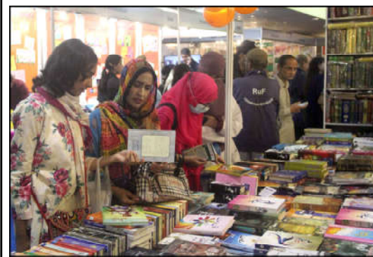
KARACHI: Youngsters are taking interest in books on stall during 18th Books Fair at Expo Center in Provincial Capital.