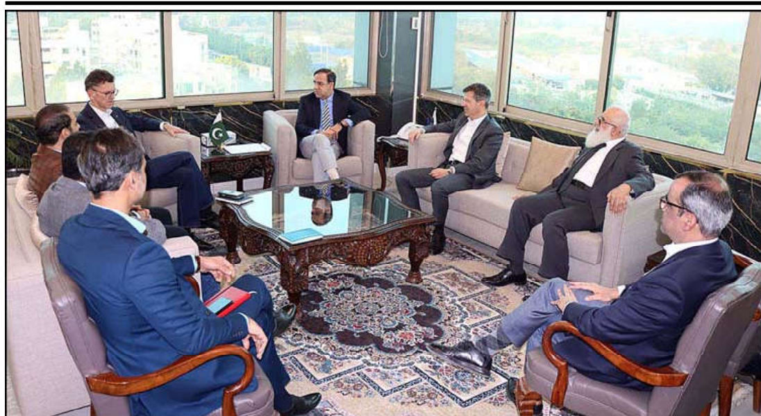
ISLAMABAD: Caretaker Federal Minister for IT and Telecommunication Dr. Umar Saif in a meeting with Telenor and Etisalat delegation.