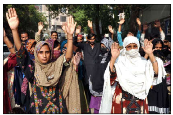
HYDERABAD: Residents of Latifabad No.10 are holding protest demonstration for acceptance of their demands, at Hyderabad press club.