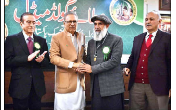
LAHORE: President Dr Arif Alvi distributing the Gold Medals to the Honour workers of Pakistan Movement during the 29th Annual Gold Medal ceremony of Tehreek-e-Pakistan Trust organized by Nazriya-e-Pakistan Trust and Pakistan Worker Trust.