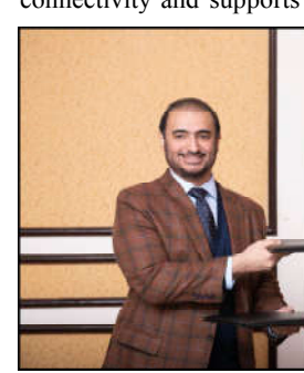
the digital transformation journey.

a historic telecommunications system that fosters connectivity and supports