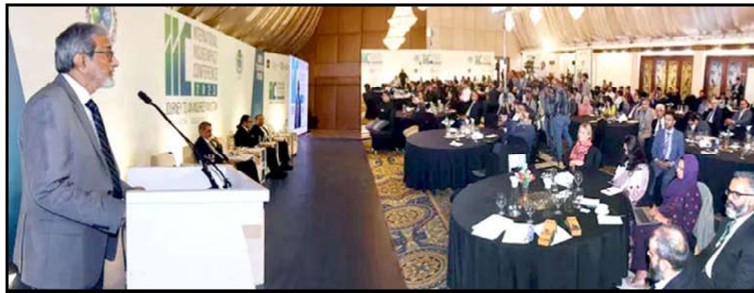
KARACHI: Caretaker Sindh Chief Minister, Justice (Retd) Maqbool Baqar addresses to participants during the closing ceremony of the International Insure Impact Conference (IIC) organized by SECP, held at local hotel in Karachi.

LAHORE (INP): Chief of the Naval Staff Admiral Naveed Ashraf has said that keeping in view that current state of the economy, it is imperative to realize Pakistan's maritime potential, since a robust national maritime sector can be a great enabler for transition to a sustainable economic future. He expressed these views on Thursday while addressing the concluding ceremony of 6 th Maritime Security Workshop at Pakistan Navy War College, Lahore. Maritime Security Workshop was Pakistan Navy's annual event which aims to generate understanding on the dynamics of maritime security, creating awareness about blue economy and exploring untapped maritime potential of Pakistan. The workshop participants included parliamentarians, policy makers, bureaucrats, academia, entrepreneurs as well as representatives from media. Addressing the participants, Admiral Naveed Ashraf emphasized Pakistan Navy's commitments to raise awareness on issues of National Maritime significance and underscored PN initiatives in generating informed debate on security issues, Blue-Economy, strategic developments in the Indian Ocean Region and intense geopolitical rivalry.