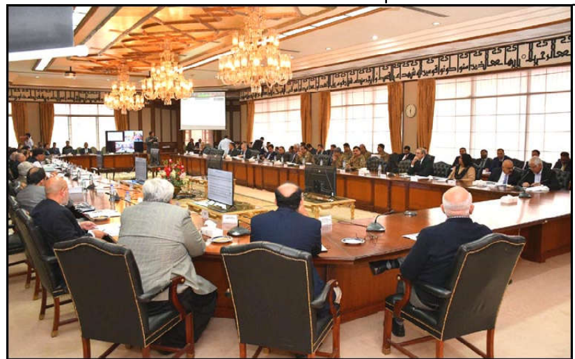
Minister for Planning, Development and Special Initiatives Muhammad Sami Saeed chairs the 7 th Executive Committee meeting of Special Investment Facilitation Council (SIFC) in Islamabad.

ISLAMABAD (APP): Executive Committee for Special Investment Facilitation Council (SIFC) on Thursday began its two-day meeting to review the progress of various policy-level initiatives and projects in the key sectors. The meeting, chaired by Minister for Planning, Development and Special Initiatives Muhammad Sami Saeed, was attended by Federal and Provincial Ministers concerned, besides high-level government officials, a news release said. On the inaugural day, the ministries concerned presented progress on various projects and related aspects, recommending various measures for further improving the business and investment climate. The committee appreciated the overall progress in various sectors and level of economic engagements with friendly countries, especially the signing of Memorandums of Understanding (MoUs) and Agreements with the United Arab Emirates and the State of Kuwait. The committee directed ministries concerned to expedite the work on bankable projects for translating these commitments into realities.