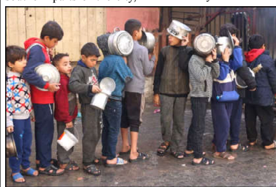
Palestinian children hold pots as they queue to receive food cooked by a charity kitchen, amid shortages in food supplies, as the conflict between Israel and Hamas continues, in Rafah in the southern Gaza Strip.