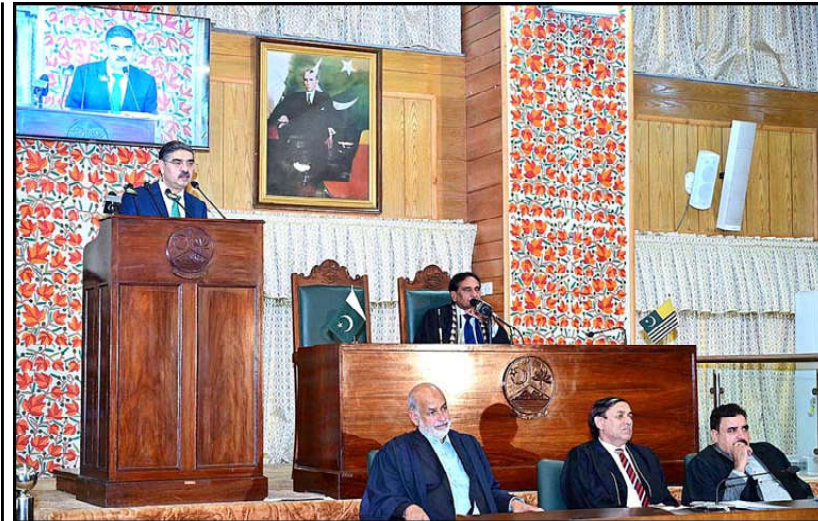
MUZAFFARABAD: Caretaker Prime Minister Anwaar-ul-Haq Kakar addresses the special session of Azad Jammu and Kashmir Legislative Assembly.

Giving a historical account, the prime minister said the Kashmiris had suffered enormously from conflicts in history.