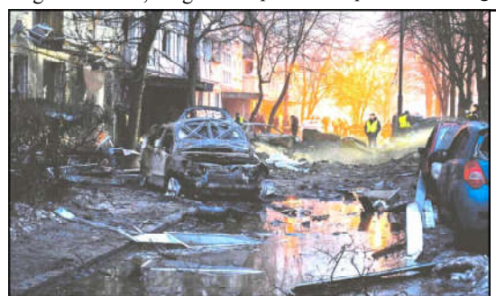
A view of destroyed cars next to a damaged residential building following a Russian missile strike.

There were also strikes in the southern port of Odesa, where officials said nine Iranian-made Shahed drones had been downed. On the edge of the port city of Odesa, a journalist saw a large hangar in which trucks and cars had been destroyed.