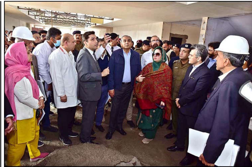
FAISALABAD: Chief Minister Punjab, Syed Mohsin Raza Naqvi is visiting the Allied Hospital Faisalabad to inspect ongoing upgradation projects of Surgical Emergency and OPD Wards.