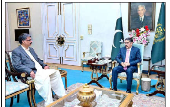
ISLAMABAD: Prime Minister of Azad Jammu and Kashmir Ch. Anwaar-ul-Haq calls on the Caretaker Prime Minister Anwaar-ul-Kakar.

Eradication of terrorism was essential for the prosperity and development of country, he said adding that 27 terrorists were sent to hell with the successful action of the forces in DI Khan. He said that Pakistani forces had full capacity to destroy the evil intentions of the enemy.