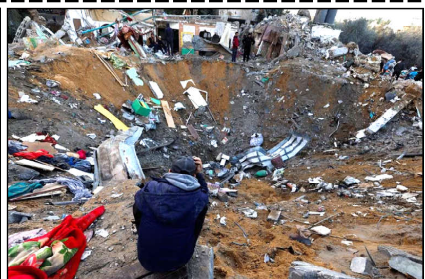
A Palestinian looks on at the site of Israeli strikes on houses amid the ongoing conflict between Israel and the Palestinian Islamist group Hamas, in Rafah in the southern Gaza Strip.