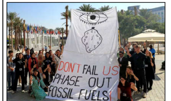
Climate activists attend a protest against fossil fuels at Dubai's Expo City during the United Nations Climate Change Conference COP28 in Dubai, United Arab Emirates.

Monitoring Desk HANOI: China's President Xi Jinping called Tuesday for a "new stage" in relations with Vietnam as he began his first visit in six years, seeking to counter the United States' growing influence with the communist nation. Xi will meet the leader of Vietnam's ruling Communist Party, Nguyen Phu Trong, later on Tuesday, after Hanoi upgraded diplomatic ties with Washington when US President Joe Biden visited in September. Biden's visit was part of US efforts around the world to contain China's rising economic power—and to secure supplies of crucial materials needed for high-tech manufacturing. Speaking after his arrival at Hanoi's airport, Xi said he would talk with Vietnamese leaders on "the overall, strategic, and directional issues of China-Vietnam relations, as well as international and regional issues of common concern, in order to push bilateral relations into a new stage", according to Chinese state media. Vietnam has long pursued a "bamboo diplomacy" approach, striving to stay on good terms with both China and the United States. It shares US concerns about Beijing's increasing assertiveness in the contested South China Sea, but it also has close economic ties with China.