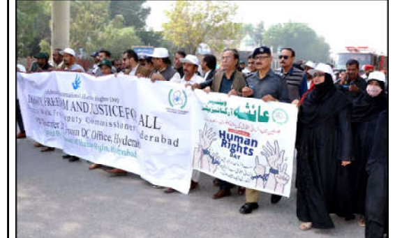
HYDERABAD: Participants are holding awareness walk on the eve of International Human Rights Day organized by Director of Human Rights Hyderabad, in Hyderabad.

PESHAWAR (APP): The Khyber Pakhtunkhwa government has provided facilities of mobile hospitals for the basic health facilities in the needed remote areas of the merged districts. Ten vehicles were provided to the health department officials in the merged districts for use as mobile hospitals in areas where basic health facilities are not available. As a result of this facility, minor operations, laboratory examinations, X-rays, dental treatment and maternity needs can be fulfilled. The said vehicles were donated by the German Development Bank KFW under the Mobile Hospital Centralized Programme for Tribal Areas in 2013 but were lying dysfunctional due to required repairs. Similarly, seventeen more vehicles will be repaired and provided to these districts for health facilities. In this regard, a ceremony was held at Civil Secretariat Peshawar on Tuesday wherein the Khyber Pakhtunkhwa Caretaker Minister for Newly Merged Districts Affairs, Industries Commerce and Technical Education Dr. Aamer Abdullah, Advisor to Caretaker Chief Minister on Health Dr. Riaz Anwar, Secretary Health Mahmood Aslam Wazir, Special Secretary Health Habibullah, Senior Planning Officer of the Department, District Health Officers of the merged districts and other relevant officials participated.