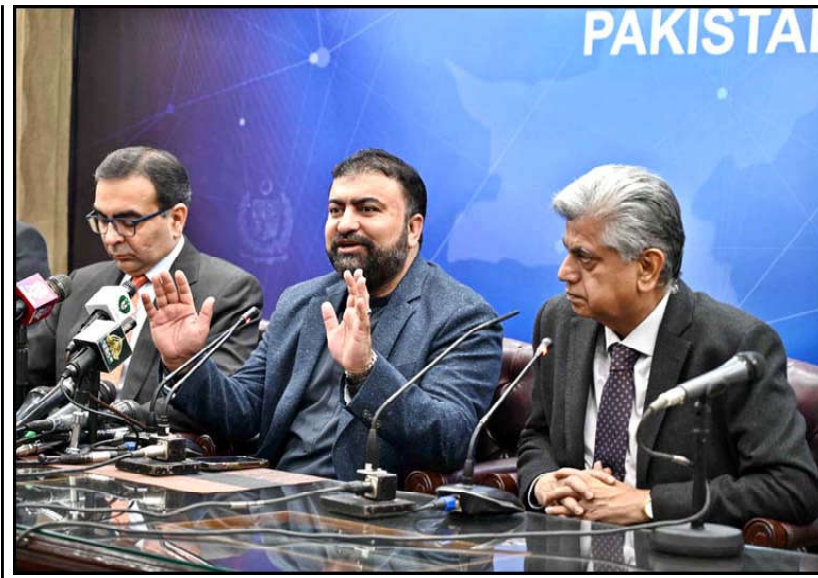
ISLAMABAD: Caretaker Federal Minister for Information and Broadcasting Murtaza Solangi, Caretaker Interior Minister Sarfraz Ahmed Bugti and Caretaker Federal Minister for Petroleum Muhammad Ali addressing a press conference at PID Media Center.

Each province will be given the platform to present its plans and formulate practical strategies to address challenges related to out-of-school children. Madad said that he hopes that the conference successfully fulfils its objective of formulating a uniform national strategy to tackle challenges faced by children outside the school system. The minister was told that Rs. 25 Billion has been allocated to address the out-of-school problem. He was apprised of the out-of-school children crisis, in addition to pivotal updates on education initiatives. IPEMC discussed the establishment of a Challenge Fund of 25 billion for Out of School Children. The conference delved into a detailed progress update on the Performance-Based Grants allocated to provinces, a crucial initiative through ASPIRE. IPEMC also discussed the establishment of a 'Foundational Learning Hub' in the Ministry of Federal Education and Professional Training which will launch a Foundational Literacy Policy in 2024.