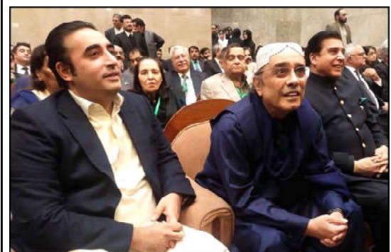
ISLAMABAD: Peoples Party Parliamentarians (PPPP) President, Asif Ali Zardari and PPP Chairman, Bilawal Bhutto Zardari attend live streaming of proceedings on a presidential reference seeking to revisit the controversial death sentence awarded to former Prime Minister Zulfiqar Ali Bhutto, at the Supreme Court building in Islamabad.

He said that we believe that we will get justice. This matter should come before people that Zulfiqar Ali Bhutto was innocent. We want answers of those questions which were raised in Reference.