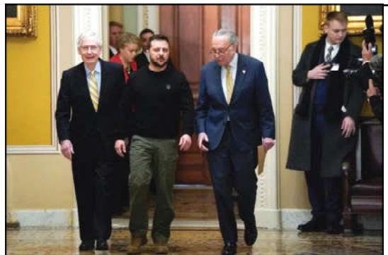
Ukrainian President Volodymyr Zelenskiy walks next to U.S. Senate Majority Leader Chuck Schumer (D-NY) and U.S. Senate Minority Leader Mitch McConnell (R-KY) as he arrives for a meeting with all U.S. senators at the Capitol in Washington, U.S.

Monitoring Desk STRASBOURG: EU lawmakers on Tuesday present a top rights prize to Mahsa Amini, whose death in Iranian custody sparked mass protests, but her family won't attend after being blocked by Tehran. The award—also for the broader "Woman, Life, Freedom" movement—is the latest international recognition for the women challenging Iran's religious government after jailed activist Narges Mohammadi was given the Nobel Peace Prize. Amini's mother, father and brother will miss the ceremony at the European Parliament in the French city of Strasbourg as Iran's authorities confiscated their passports and barred them from flying to collect the EU's Sakharov Prize. Iranian Kurd Amini died on September 16, 2022 at the age of 22 while being held by Iran's religious police for allegedly breaching the Islamic republic's strict dress code for women. Her death triggered major protests in Iran and a global movement known as "Woman, Life, Freedom", calling for the end of the Muslim cleric-led government in Tehran.