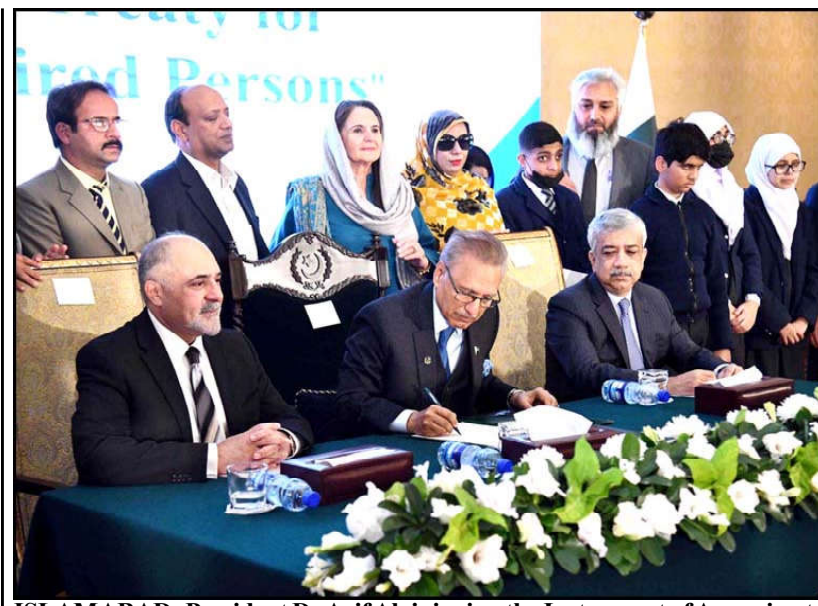
ISLAMABAD: President Dr Arif Alvi signing the Instrument of Accession to the Marrakesh Treaty for the Visually Impaired Persons in a ceremony, at Aiwan-e-Sadr.

The resulting blasts led to the collapse of the building, causing multiple casualties; twenty three brave soldiers embraced Shahadat, while all six terrorists were effectively engaged and sent to hell.