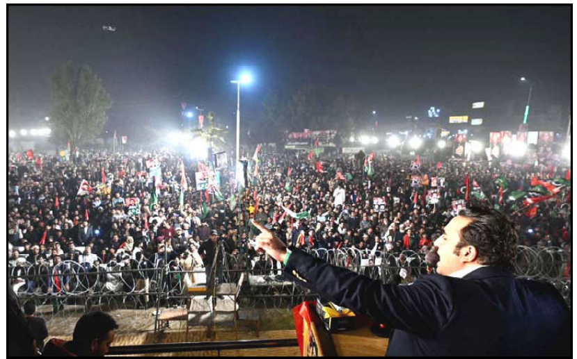
GUJRANWALA: Peoples Party (PPP) Chairman, Bilawal Bhutto Zardari addresses during workers convention held at Ghulam Hussain Park in Gujranwala.

LAHORE (INP): Ameer Jamaat-e-Islami (JI), Sirajul Haq has said that those who fear of being held accountable are forwarding proposals to delay general elections. Talking to media persons at Mansoorah on Tuesday, he argued that even in democratic countries at war, citizens are not deprived of their voting rights. Sirajul Haq dismissed justifications for election delays based on security concerns or adverse weather conditions in less than one percent of the country's area, labeling them as mere excuses to deny voters their right to choose leadership. He emphasized that the continuity of democracy is crucial for establishing peace and prosperity and emphasized the constitutional responsibility of the government to ensure public protection and safety. He linked the weak democracy in the country to feudalism, the police and patwar culture, and dynastic politics. He expressed regret that the dream of transforming Pakistan into a model welfare Islamic state, envisioned by the Quaid-i-Azam upon independence, remains unrealized even after 76 years.