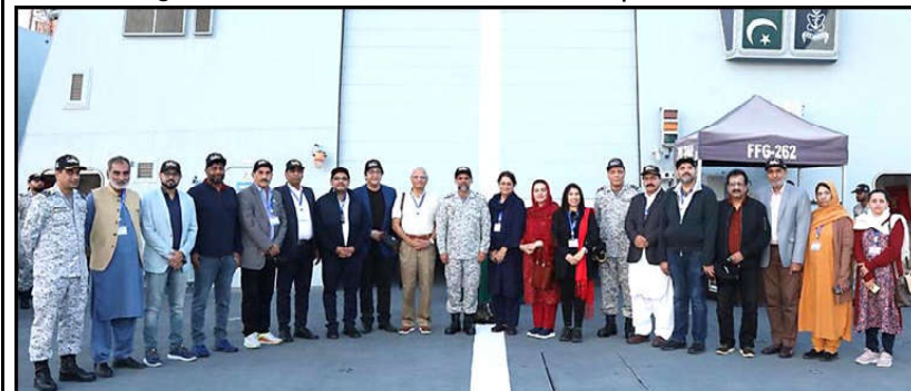
KARACHI: Group photo of 6th Maritime Security Workshop participants onboard PNS TAIMUR during visit.

sights of the supply of essential items, available stock levels and the monitoring of pricing mechanisms. He also urged Deputy Commissioners and Assistant Commissioners to strictly employ the Decision Support System (DSS) App developed by the PBS for price monitoring. He emphasized the critical role of administrative oversight and monitoring for maintaining price stability. Moreover, the meeting delved into the prospective utilization by the provinces of remote sensing technology facilitated by SUPARCO for better monitoring of cropped areas and the likely supply situation of essential food items.