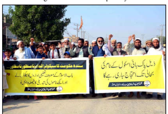
HYDERABAD: Activists of Jamat-e-Islami (JI) are holding protest demonstration against changing name of Zeal Pak High School, outside Zeal Pak in Hyderabad.

of the Public Health Department (PHD), he said that the department shall ensure to supply clean tested drinking water to citizens. He said that the material used to clean potable water shall be used in standard quantity while serial-wise boards shall be installed at all water supply ponds. The Commissioner was dissatisfied for not adding Chlorine to water at the filtration Plant and instructed the PHD to mix Chlorine in the stipulated quantity.