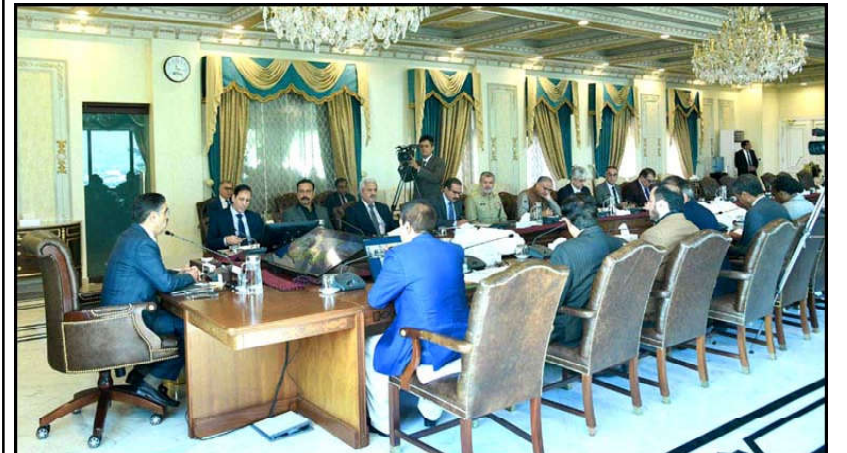
ISLAMABAD: The Caretaker Prime Minister Anwar-ul-Haq Kakar chairs a meeting on Task Force of Polio Eradication.

He said the world at the moment direly needed the approach of love, empathy and forgiveness.