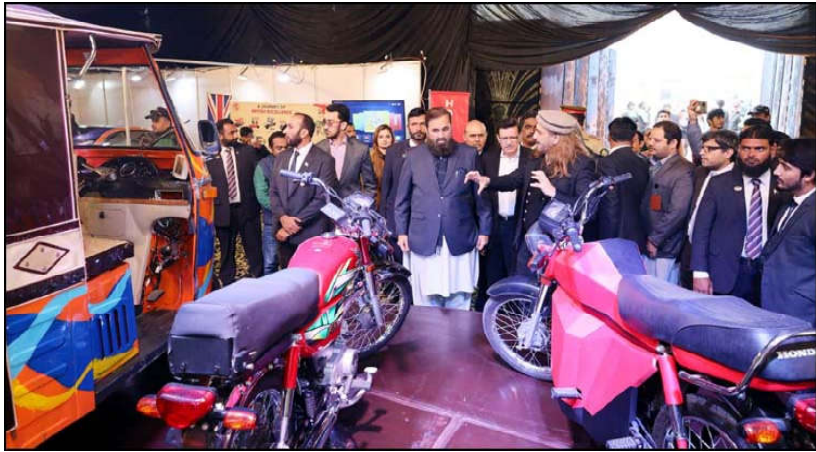
LAHORE: Governor Punjab Muhammad Balighur Rehman inspecting the stall after inauguration of first International Electrical Vehicle Expo 2023 at the University of Lahore.