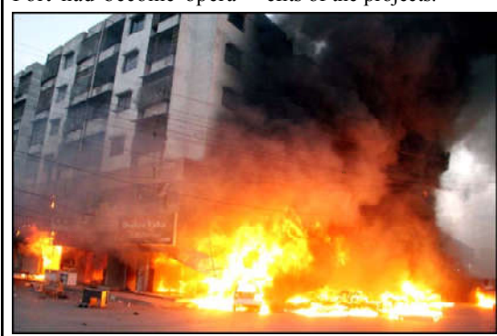
KARACHI: View of site after fire eruption at Furniture Market in a residential building after a fire broken out incident as the fire brigade and rescue officials are busy in extinguishing fire during rescue operation, located nearby Ayesha Manzil in Karachi.

The Consul General said the Havelian-Thakot section of Karakoram Highway, Jakla-DI Khan Motorway, Optical Cable, Eastern Expressway and Orange Line Metro Train Lahore projects were also completed which had started giving fruits to the common men. He said that so far 14 energy projects including the Qasim Port Coal Power plant, Hub Coal power plant and Thar Coal power plant have been completed and the people of Pakistan were reaping the benefits of the projects.