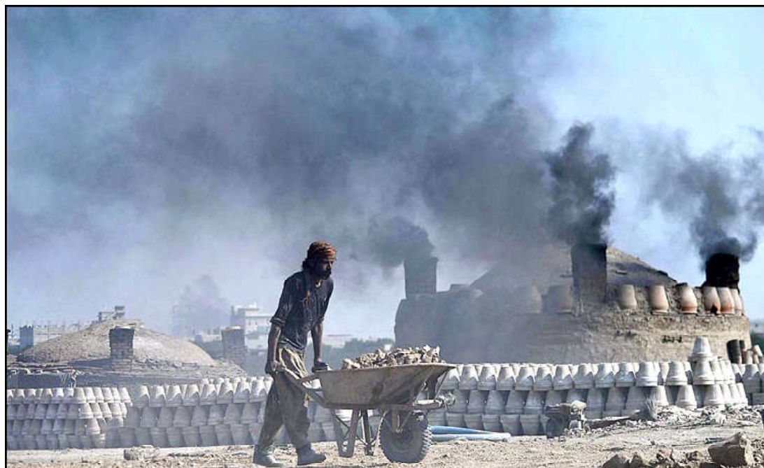
KARACHI: A man drive thru Dust in area of Karachi, according to reports the Karachi Ranked Most Polluted city in the world in term of air quality, The various forms of pollution have increased at Karachi which has caused widespread environmental and health problems.

He said that he is happy to see that international companies in electrical vehicles and artificial intelligence are bringing their expertise and technology to Pakistan, which will help us accelerate the adoption of these technologies in our country and create new opportunities for our citizens. Governor Punjab said that the expo is a testament to the power of innovation and collaboration and shows that when government.