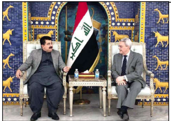
BAGHDAD: Chairman Senate, Muhammad Sadiq Sanjrami of Pakistan being received by Iraqi Deputy Foreign Minister, Mohammed Hussein Mohammed Bahr-Aluloom along with a delegation at state lounge on his arrival at Baghdad.

the government to realize its ambition of achieving economic growth that is sustainable, broad-based, and inclusive. The $300 million policy-based loan would support the initiative's first subprogram, which focuses on laying the foundation for reforms to policies, laws, and institutional capacity that would improve domestic resource mobilization and utilization. The programme is helping to transform tax administration, public expenditure management, and other institutional structures to strengthen resource mobilization including non-debt resources such as private investment and savings.