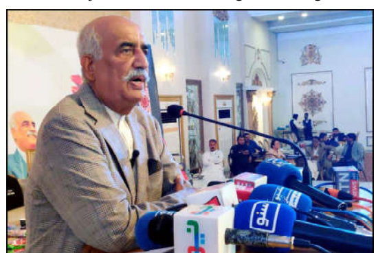
SUKKUR: Peoples Party (PPP) Central senior leader, Party Syed Khurshid Shah addresses to participants during PPP Women Wing Convention, held in Sukkur.