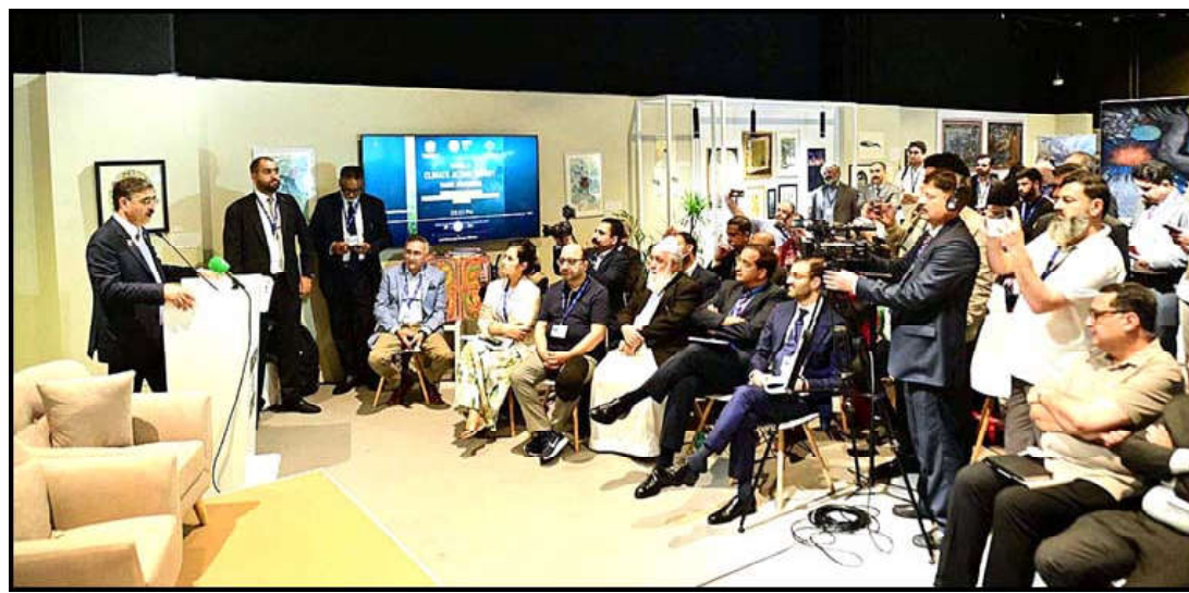
DUBAI: Caretaker Prime Minister Anwaar-ul-Haq Kakar addresses a ceremony on Living Indus Initiative at COP-28 Pakistan Pavilion.

In conclusion, Chairman Bilawal Bhutto Zardari's message on Sindh Culture Day reflects a dedication to preserving and promoting the rich heritage of Pakistan, fostering unity, and presenting a positive narrative of the nation to the world.