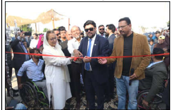
KARACHI: Governor Sindh Mohamed Kamran Khan Tessori cutting the ribbon to inaugurate the event organized for special children.

They further said that Sindh Ajrak and Topi were the identity and glory of the province. The role of Sindh province in the establishment of Pakistan was unforgettable, they said adding that the celebration would help to highlight the civilization and culture of the province.