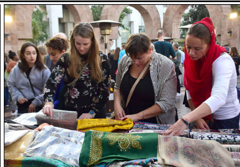
ISLAMABAD: Diplomat women are busy buying clothes in a stall during Annual Christmas Market organized by German Embassy at a local hotel in the Federal Capital.

He said the PFC is fully committed to promoting economic ties and strengthening partnerships.