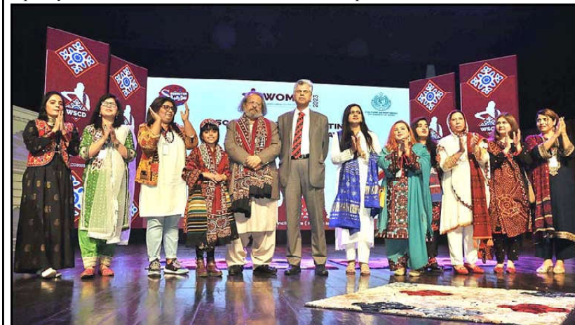
ISLAMABAD: Group photo of Federal Minister Madad Ali Sindh and Caretaker Federal Minister for Information & Broadcasting Murtaza Solangi along with others during the Sindh Cultural Day event organized by Soormiyun at PNCA.

The captivating Soormiyun song resonated through the venue, beautifully encapsulating the spirits of Soormiyun working in Islamabad.