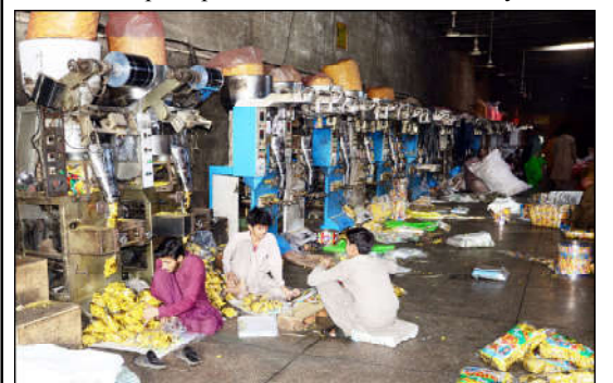
FAISALABAD: Labourers are busy in packing of snacks (Paparr) in a local factory in the city.

This spontaneous interaction showcased strong public relations between the Governor and the local community and business fraternity.