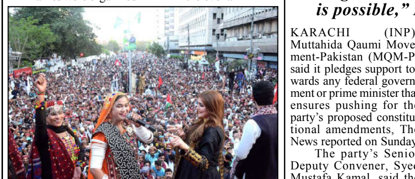
KARACHI: Folk singer performing Sindh song during celebration of Sindh Ajrak Topi Culture Day at Karachi Press Club.

The people with their families also participated in the event.