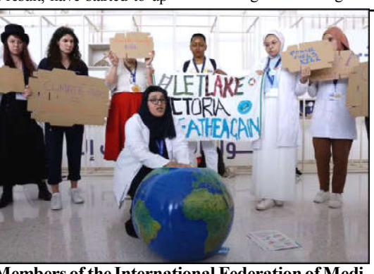
Members of the International Federation of Medical Students Associations hold placards during a protest demanding an end to fossil fuels at COP28 World Climate Summit, in Dubai, United Arab Emirates.

for the consultations on Monday. Scholz was the first foreign leader to visit Lula in Brazil, just weeks after his inauguration. The German Chancellor has been on a quest since taking office in late 2021 to improve ties with the Global South. Germany also considers Brazil a key partner in its bid to diversify its trade, in part to reduce its reliance on China, and plug a gap in skilled labour. Both countries are pushing for a quick trade deal between the European Union and Mercosur, South America's major trading bloc over which Brazil currently presides.