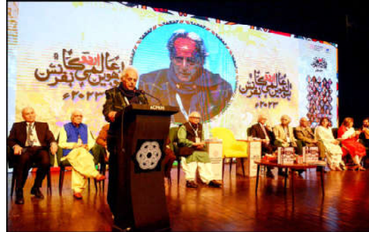
KARACHI: Renowned Writer Mustansar Hussain Tarar addressing during a closing ceremony of 16th Aalmi Urdu Conference at Arts Council.

The conference showcased diversity with a session titled "Pashto Language and Literature Giants," moderated by Gulam Khan. Prominent