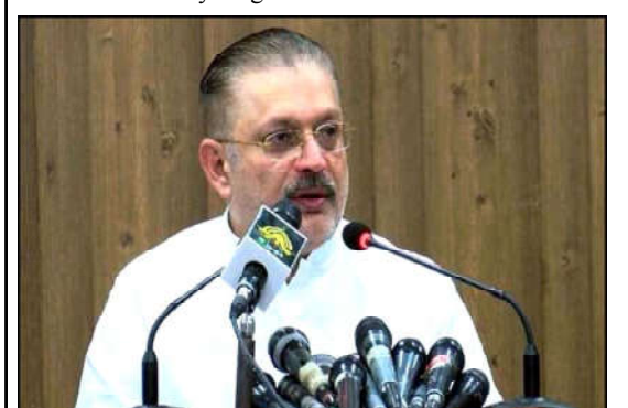
KARACHI: Peoples Party (PPP) Senior Leader, Sharjeel Inam Memon addresses to media persons during press conference, held at PPP Media Cell Bilawal House in Karachi.

The development would pave the way for the announcement of the election schedule, which is expected during the first week of December as announced by the ECP. It had earlier stated that the final list of delimitations would be published on December 15 but it was later revised to November 30.