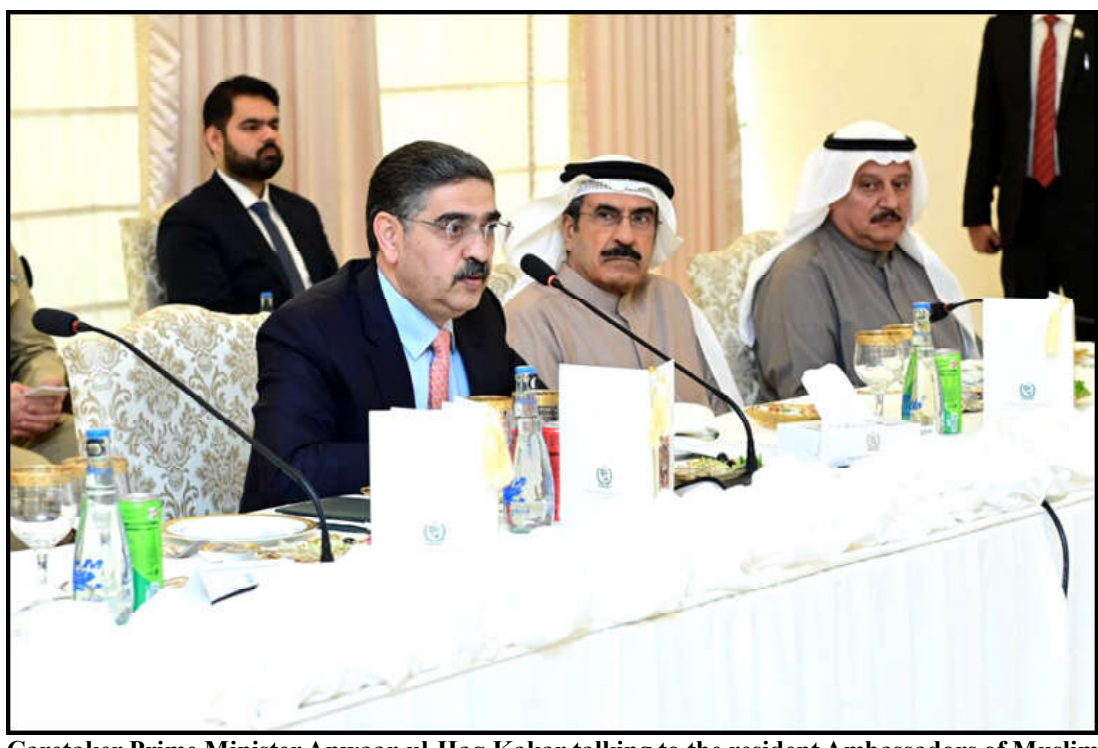
Caretaker Prime Minister Anwaar-ul-Haq Kakar talking to the resident Ambassadors of Muslim countries from the Middle East and North African [MENA] region over lunch in Islamabad.

Vol. XIII No. 355 Reg. mails-B / ID-445 Thursday December 28, 2023, Jamadi-us-Sani 14, 1445 A.H. Ph: 2158688, 2158997 Pages 4: Rs. 12