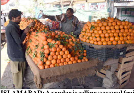
ISLAMABAD: A vendor is selling seasonal fruit Oranges at Khana Bridge to earn daily wages for the livelihood of his family.

This positive trend contributed to an $884 million improvement in the balance of trade for December 2023. According to the data, from July 1s 2023, to December 20 th, 2023, Pakistan's exports soared to $14 billion, showcasing a remarkable year-on-year increase of $709 million, translating to a substantial 5.3 percent improvement. figures during the same period (1 July 2023 to 20 December 2023) dropped to $24.3 billion from $29.2 billion in FY-2022, reflecting a notable year-on-year decrease of $4.9 billion.