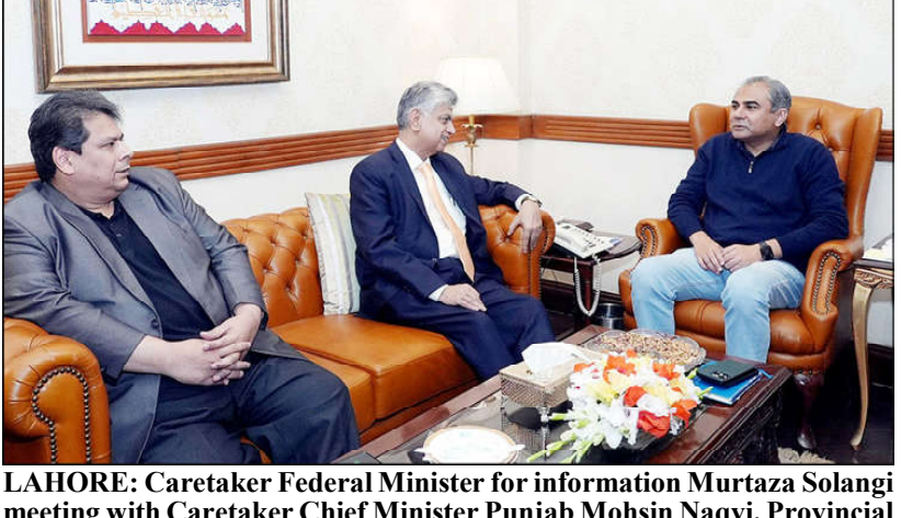
meeting with Caretaker Chief Minister Punjab Mohsin Naqvi. Provincial Minister for information Amir Meer is also present.