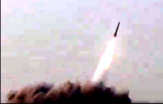
RAWALPINDI: View of conducted successful flight test of Fatah-II, equipped with state of the art avionics, sophisticated navigation system and unique flight trajectory.

Expressing his indignation, Justice Aurangzeb leased due to non-payment asked the SSP operations