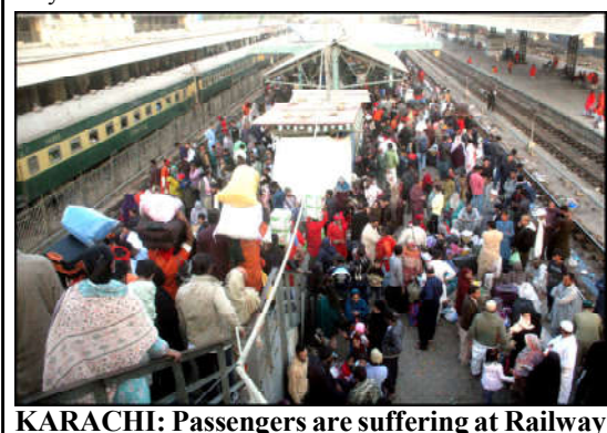
Station due to the delay of the trains because of fog in the different areas of the Country.

Minister Finance Ahmed Rasool Bangash, in his address during the e-Stamping launch, Stamping launch, emphasized that the primary objective behind this initiative is to provide instant access to genuine stamp papers without any hassle and to deter Khyber and the State Bank fraudulent activities.