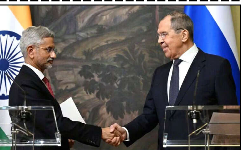
Russia's Foreign Minister Sergei Lavrov shakes hands with India's Foreign Minister Subrahmanyam Jaishankar during a joint press conference following their talks in Moscow, Russia.

Japan and South Korea both scrambled jets to monitor joint flights by Chinese and Russian bombers and fighters near their territories