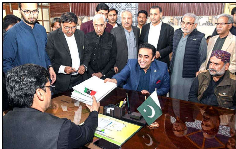
LARKANA: Chairman Pakistan People's Party (PPP) Bilawal Bhutto Zardari submitted his nomination papers for NA 194 (Larkana-1) to returning officer for upcoming General Election 2024.