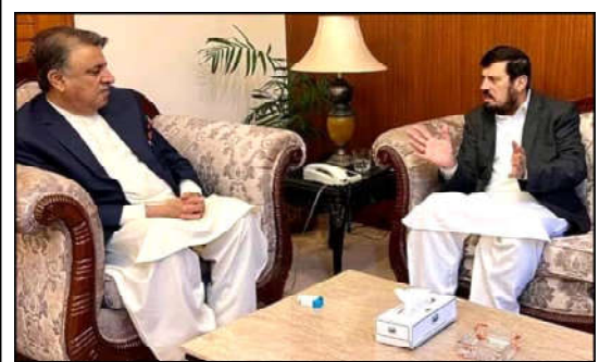
ISLAMABAD: Governor Khyber Pakhtoonkhwa Haji Ghulam Ali meeting with Governor Balochistan Malik Abdul Wali Khan Kakar in Balochistan House

ISLAMABAD (Online): President Dr. Arif Alvi has said that Christmas has a special place in the hearts of our Christian brothers and is an opportunity to celebrate joy, contemplation and joy. He went on that the teachings of love, compassion and peace of Jesus (PBUH) are a beacon for us and guide us. The diversity of religions and cultures is a source of stability for Pakistan. Our Christian community has played a significant role in the social and economic development of the country. President also acknowledge the commendable services rendered by the Christian community for the promotion of peace, tolerance and harmony in the country. On this festive occasion, let us celebrate the spirit of Christmas, promote unity, understanding and goodwill among all communities. Alvi continued that may the Christmas message of love, mercy and hope resonate in our hearts and guide us to a future filled with peace, joy, harmony and prosperity. He said that I am proud to say that minorities have all political, economic and social rights in Pakistan according to the Constitution of Pakistan. Our religion Islam fully recognizes and protects the rights of minorities. Founder of Pakistan, Quaid-e-Azam Muhammad Ali Jinnah, in his historic speech on August 11, 1947, said that everyone will have equal rights, privileges and responsibilities regardless of color, caste and religion, and complete religious freedom will be achieved in the new state of Pakistan, President mentioned.