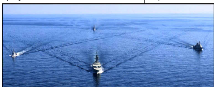
Pakistan Navy - Royal Navy of Oman Bilateral Exercise Thamar Al Tayyib 2023 (TAT - 23) was conducted in Gulf of Oman.