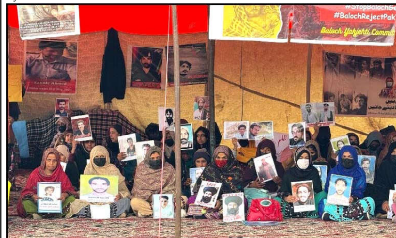
ISLAMABAD: Baloch protesters stage sit-in outside National Press Club