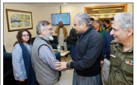
LAHORE: Caretaker Chief Minister of Punjab Mohsin Naqvi talking to people during his visit to driving license center at Police Khidmat Larkaz Liberty.