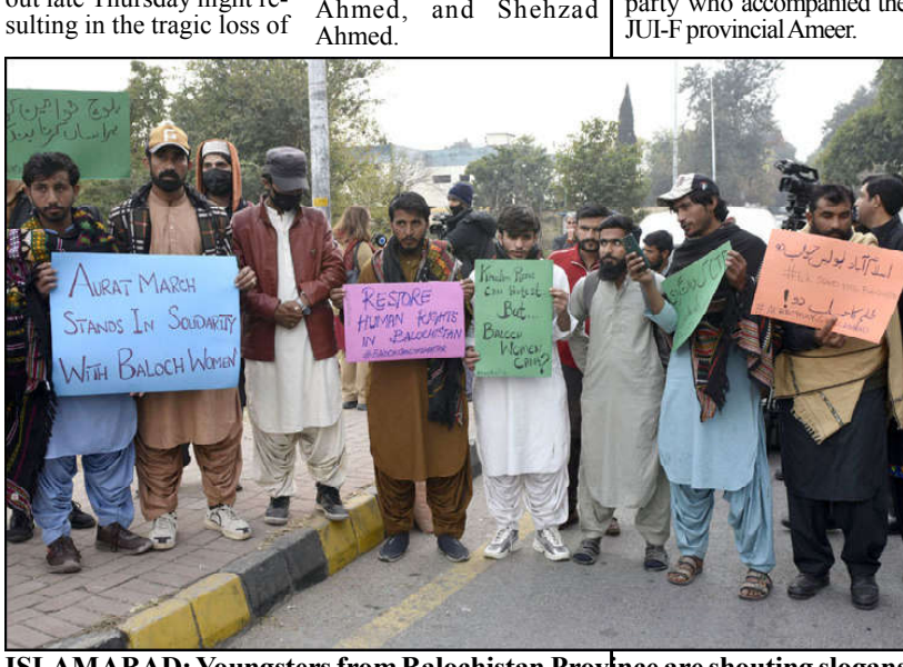
ISLAMABAD: Youngsters from Balochistan Province are shouting slogans during protest in the favor of their demands outside National Press Club in Federal Capital.