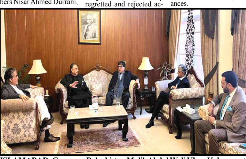
ISLAMABAD: Governor Balochistan Malik Abdul Wali Khan Kakar meeting talking with members of the committee formed led by the caretaker Federal Minister Fawad Hasan Fawad regarding the Baloch Yakjethi March

head. The development came shortly after the PTI held discussions with ECP authorities, prompted by the Supreme Court's directive and Election Act, 2017, and for the ECP to allay PTI's Election Rules, 2017. reservations regarding lack of a leve dated 4th December, 2023 per the PTI, the ECP assured its delegates that it would redress their griev-