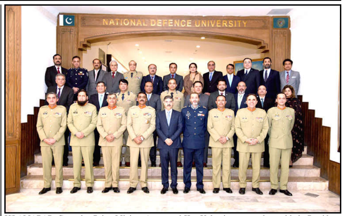
ISLAMABAD: Caretaker Prime Minister Anwaar-ul-Haq Kakar in a group photo with the President, Directing Staff of National Defence University and graduating Civil Service officers of National Security Course-2024.

The prime minister said there was a wave of terrorism in the country and there were forces which wanted to cause disruption in Pakistan and the government would make all efforts to protect the lives of people.