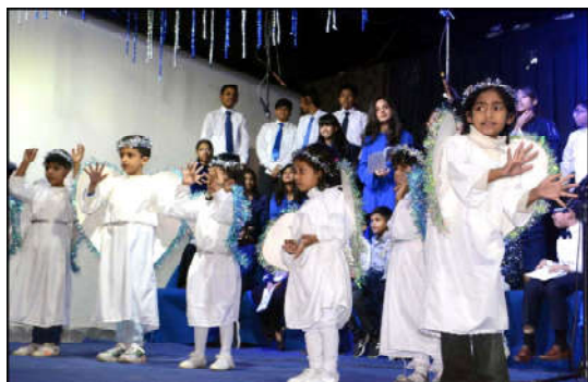
KARACHI: Members of Christian Community are performing tableau on stage during celebration ceremony in connection of Christmas Day Celebrations coming ahead, at St. Anthony's Church in Karachi.

He said that those gifts were the pride of the country and not meant for sale or gaining profit.