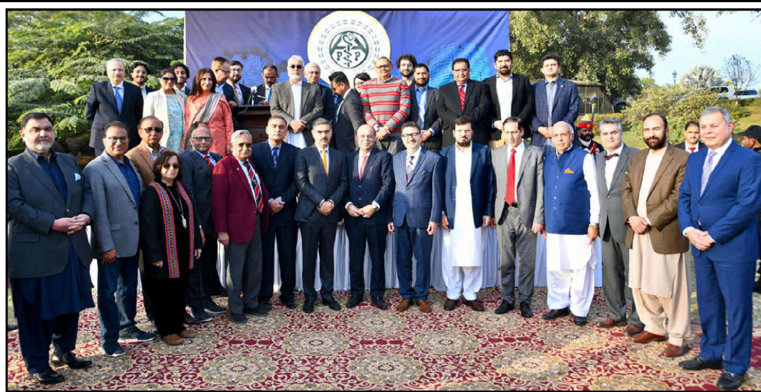
PESHAWAR: Caretaker Prime Minister Anwar ul Haq Kakar in a group photo with senior member doctors of the Association of Physicians of Pakistani Descent of North America (APPNA) at the 46th Winter Khyber Medical College Convention organized in collaboration with APPNA on 20 Dec 2023.

Speaking on the occasion, the caretaker minister termed the project as of high importance and directed amendments to the business model of the board for its financial stability.