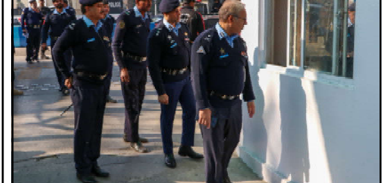
Police Officer (ICCP) Dr. Akbar Nasir Khan conducted a visit to the Diplomatic Enclave to assess security arrangements, monitored safe city cameras and issued directives for enhancing security measures, a public relation officer said.

routes of the diplomatic enclave, the ICCPO stressed the importance of ensuring effective surveillance through the Safe City centralized camera systems. The Islamabad Capital Police remains steadfast in its commitment to maintaining a peaceful environment and ensuring the protection of the lives and property of the citizens within the federal capital. Citizens are urged to cooperate with the police and report any suspicious activities or items by dialing helpline.