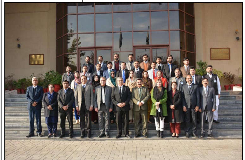
Judicial Assistants of the Supreme Court of Pakistan in a group photo with Mr. Justice Athar Minallah at the Federal Judicial Academy Islamabad.

The World Bank says that Pakistan will have to implement the policy of reforms for stability in the economy, implementation of financial management is necessary for stable growth.