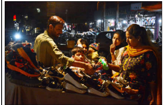
KARACHI: Women with children purchase shoes at a roadside stall ahead of Christmas.