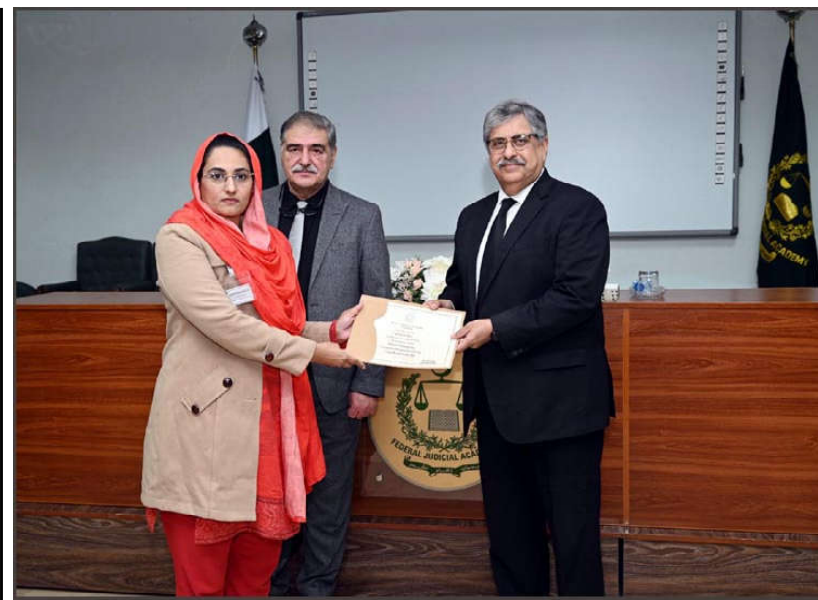
Mr. Justice Athar Minallah awards a certificate to a trainee Judicial Assistant in a certificate awarding ceremony at the conclusion of a three-day Professional Development Training for the Support Staff of the Supreme Court of Pakistan held at the Federal Judicial Academy, Islamabad.

He underscored the need to debunk the disinformation, fake news, and propaganda encircling the CPEC project. "There are two crossing narratives, one from the west led by the United States and the other from China. In the last 10 years, China invested over a trillion dollars in the BRI's 3000 projects, lifting 40 million masses out of poverty in Asia, Africa and Latin America. In the last 20 years, in the so-called war and terror, the United States squandered 6.5 trillion dollars fighting wars in Pakistan and Iraq, Syria, Libya, Somalia and Yemen. These are not my figures but of Brown University in Rhode Island the USA.