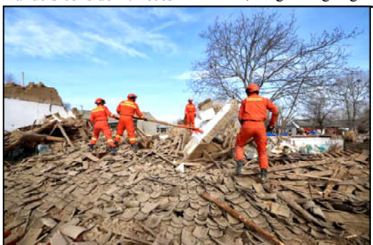
Rescuers work amid the rubble at Shiyuan village following the earthquake in Jishishan county, Gansu province, China.

Shoigu said that 650,000 Russian soldiers have received combat experience in Ukraine, turning the Russian army into "the best prepared and capable army in the world, armed with advanced weapons that have been tested in combat."