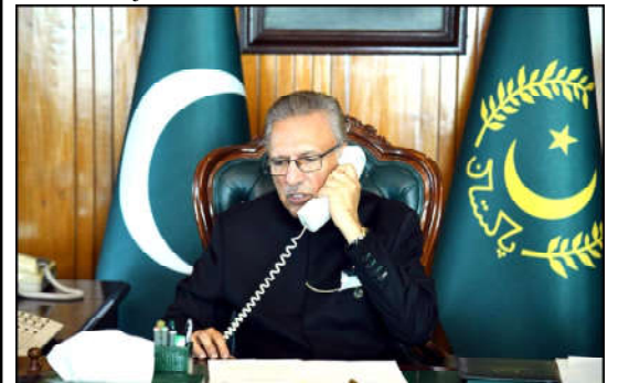
President Dr. Arif Alvi speaks to Iranian President Ebrahim Raisi.

President Alvi reiterated that a just solution to