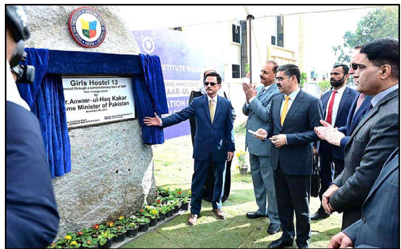
SWABI: Caretaker Prime Minister Anwaar-ul-Haq Kakar inaugurates new building of Girls Hostel at Ghulam Ishaq Khan Institute of Engineering Sciences and Technology.

Speaking on the occasion, the Minister for Information Technology and Telecommunications Dr. Umar Saif said that the