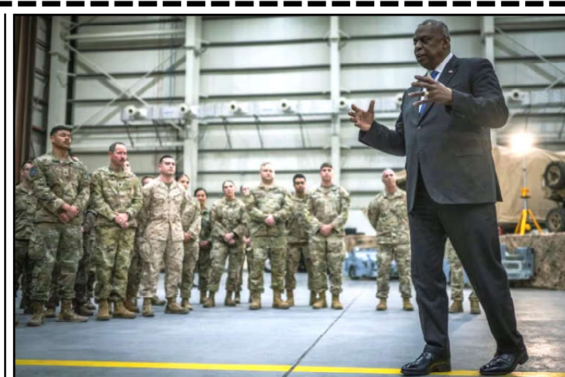
U.S. Secretary of Defense Lloyd Austin speaks with service members stationed at Al Udeid Air Base, Doha, Qatar.

The laws cover screening irregular migrants when they arrive in the European Union, procedures for handling asylum applications, rules on determining which EU country is responsible for handling applications and ways to handle crises. Migrant arrivals in the European Union are way down from the 2015 peak of more than 1 million, but have steadily crept up from a 2020 low to 255,000 in the year to November.