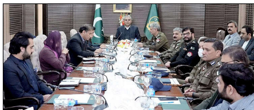
LAHORE: Caretaker Chief Minister Punjab Mohsin Naqvi presides over the meeting regarding Protected U-Turns Project for smooth flow of Traffic.

Communication and Works, Commissioner, Deputy Commissioner, CCPO, CTO, and relevant officials. Meanwhile, Punjab Caretaker Chief Minister Mohsin Naqvi chaired a meeting in which an important decision was made to export high-protein fodder from Punjab to Kuwait. The meeting approved measures to enhance the cultivation of high-protein 'alfalfa' fodder for livestock development, emphasizing the scientific drying and preservation of this nutrient-rich feed.