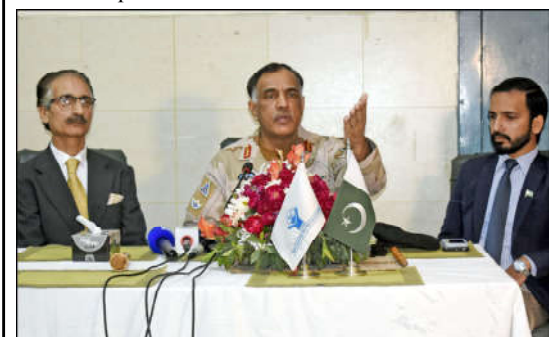
LAHORE: Regional Commander of Anti Narcotics Punjab Brigadier Sikandar Hayat Chaudhry talking to media persons at Drug Advisory Office in provincial Capital.

The Governor listened to their problems and assured cooperation to resolve them and stressed the use of modern technology to tap potential of tribal area.