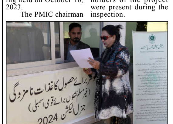
ISLAMABAD: A woman nominee for the National Assembly Seat of Minorities is taking nomination paper from the counter of the Election Commission of Pakistan, in Federal Capital.

According to the performance report of Islamabad Capital Police (Traffic Division) for the year 2023, a total of 854,135 individuals were issued violation tickets amounting to Rs. 370,447,800 for traffic law violations.