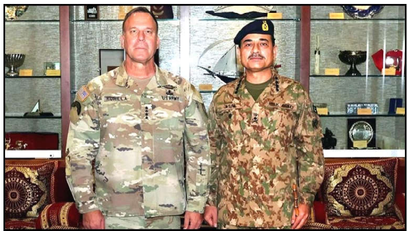
Chief of Army Staff (COAS) Asim Munir meeting with Gen Michael Erik Kurilla, the Commander of the US Central Command (CENTCOM).