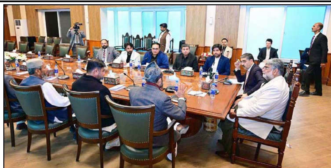
QUETTA: A delegation of the Zamindar Action Committee of Balochistan call on caretaker Prime Minister Anwaar-ul-Haq Kakar.

"Four companies can meet the standards set by the Chinese authorities, our exports can soar.