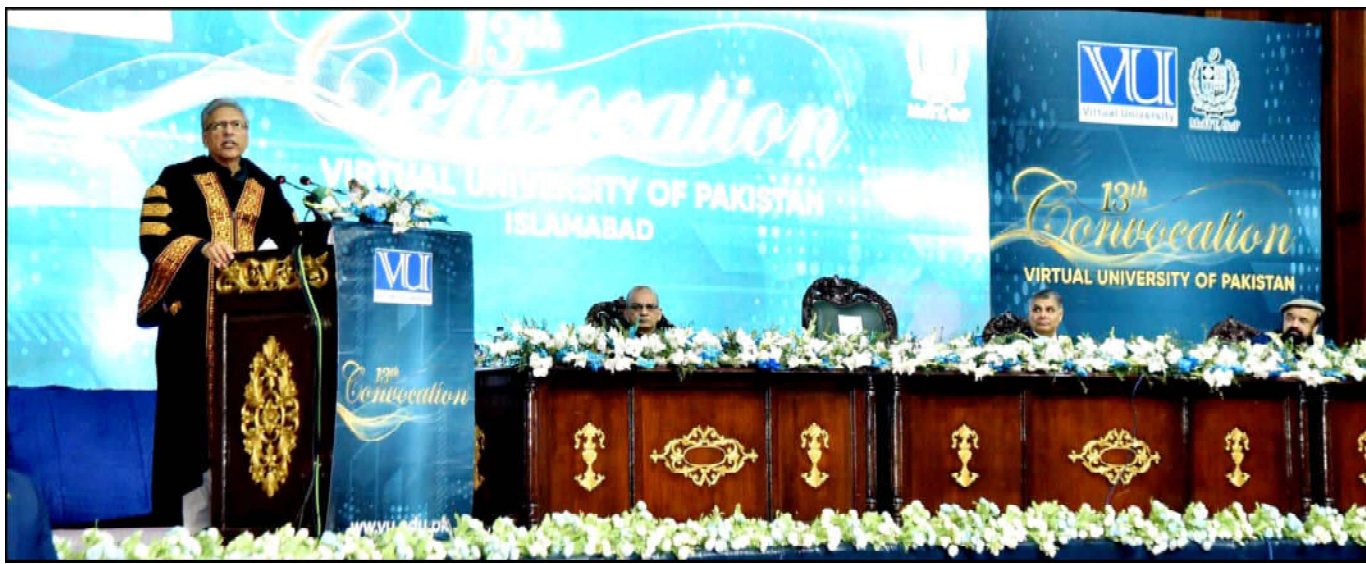
President Dr. Arif Alvi addressing the 13th convocation ceremony of Virtual University in Islamabad