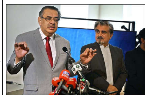
ISLAMABAD: Caretaker Federal Minister for Religious Affairs & Interfaith Harmony Aneeq Ahmed talking to media along with Caretaker Federal Minister for National Heritage and Culture Jamal Shah to inaugurate two-week long "Teaching of Calligraphy to Madrasa Students as a creative segment of Curriculum" at PNCA.