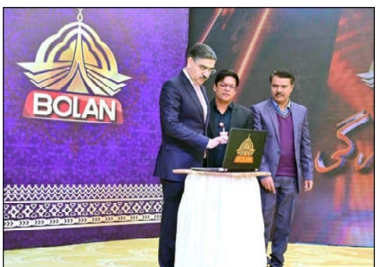
QUETTA: Caretaker Prime Minister Anwaar-ul-Haq Kakar inaugurates the broadcast Hazargi language programmes on PTV Bolan.

While the repatriation exercise is ongoing across Pakistan, Karachi stands out as a city with a historically large irregular population.