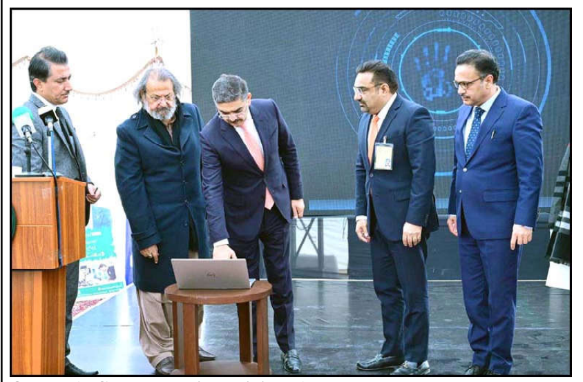
QUETTA: Caretaker Prime Minister Anwaar-ul-Haq Kakar launches the Prime Minister's Youth Skill Development Program.

The portal provides a one-window comprehensive gateway for international students to apply and process applications for study in the Kingdom i.e., Self-financed, Partial Scholarship and Full Scholarship.