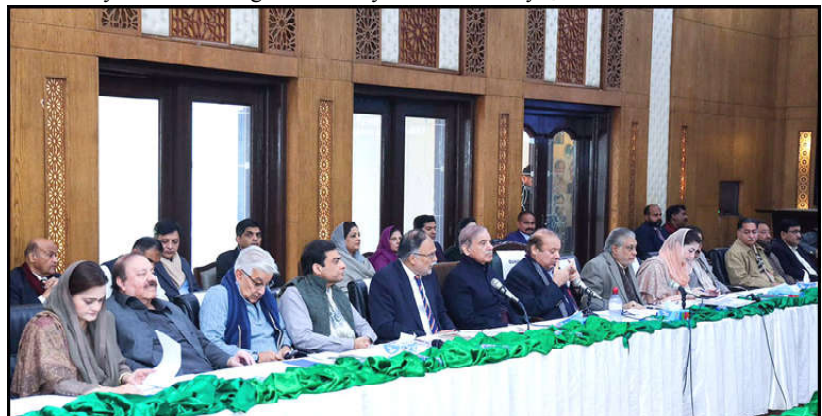
LAHORE: PML (N) Quaid Muhammad Nawaz Sharif and President Shahbaz Sharif presiding over a meeting of Parliamentary Board

cedent against political persecution. Bilawal criticized the trend of personal animosity in Pakistani politics, attributing its rise to the founder of the Pakistan Tehreek-e-Insaf (PTI) party. He challenged the rhetoric of refusing to engage with opponents, questioning the legitimacy of those who once accused others of being "thieves." "Until we make this decision," Bilawal declared, "it doesn't matter who becomes the prime minister. If we continue with the old politics, the country will not run, and we will not overcome our economic problems." His call for a shift in political culture emphasized the need for moving beyond personal attacks and focusing on issues of national concern.