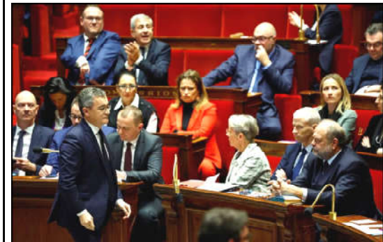
French Interior Minister Gerald Darmanin and members of the French government attend the questions to the government session at the National Assembly ahead of a vote by members of parliament on immigration bill in Paris, France.

"Positive developments we expect both on (procuring US) F-16s and Canada's promises (on lifting its arms embargo) would help our parliament to have a positive approach to Sweden... All of them are linked."