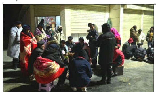
Residents keep warm around fires after an earthquake in Jishishan County, in northwest China's Gansu province.

Local media reported at least five people died in the flooding and accidents related to the rain, which primarily affected the districts of Tuticorin, Tirunelveli, Tenkasi and Kanyakumari. Entire neighbourhoods remained submerged on Tuesday, with houses appearing like lonely islands surrounded by murky, brown water, according to footage from Indian news agency ANI, in which Reuters has a minority stake. Teams were using inflatable rafts to rescue people from houses and temples, and to distribute food packets to those they were unable to move to safety.