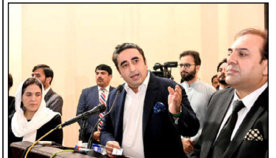
LAHORE: Chairman Pakistan Peoples Party Bilawal Bhutto Zardari addressing lawyers at Lahore High Court Bar

PESHAWAR (Online): Newly elected chairman of Pakistan Tehreek-e-Insaf (PTI), Barrister Gohar Ali Khan, has said that he will not form an alliance with any party in the general elections. If DCs are ROs, they are part of the government which has not been transparent. Speaking to the media after appearing in the Peshawar High Court, PTI Chairman Barrister Gohar Ali Khan said that taking the election symbol from us would be an injustice to the people.