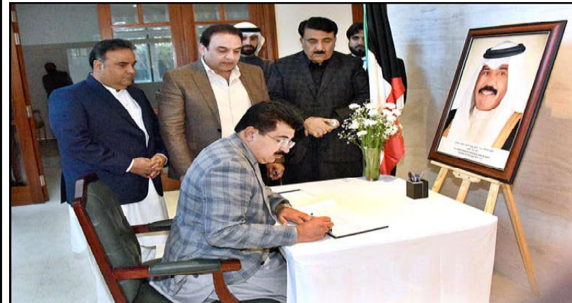
ISLAMABAD: Chairman Senate, Muhammad Sadiq Sanjrani recording his condolence on the demise of AMIR of Kuwait Sheikh Nawaf Al-Ahmad Al-Jaber Al-Sabah in the visitor's book at Embassy of Kuwait.