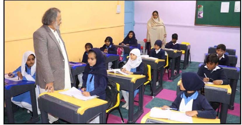
The Federal Minister of Education, Mr. Madad Ali Sindhi paid a visit to F-6/3 School to witness firsthand the remarkable efforts undertaken by the local community to enhance the school's facilities and educational standards in Islamabad.