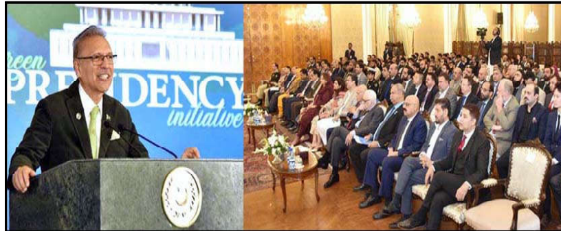
ISLAMABAD: President Dr Arif Alvi addressing the event to celebrate Award Winning Project Green Presidency, at Aiwan-e-Sadr.

EC had filed appeal plea in SC against BHC decision.