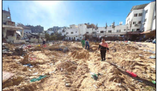
Bulldozer tracks are seen in the area where tents were erected outside the Kamal Adwan Hospital by displaced people. Palestinian authorities have accused Israel of razing the area as people slept.

wark of stability in a volatile region - an argument that has also proved effective with Gulf and Western allies providing financial support to his government. Voting in Egypt was held over three days on Dec. 10-12, with the state and tightly controlled domestic media pushing hard to boost turnout, which the election authority said had reached 66.8% - above the 41% recorded at the last presidential election in 2018. The election featured three other candidates, none of them high profile. The most prominent potential challenger halted his run in October, saying officials and thugs had targeted his supporters.