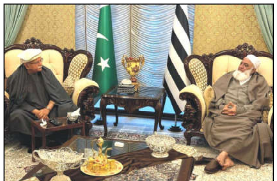
ISLAMABAD: Chairman Paktoonkhwah Milli Awami Party Mahmood Khan Achakzai meeting with Amir Jamiat Ulema-e-Islam Maulana Fazlur Rehman.

He said the Prophet Muhammad (PBUH) had also taught for consuming the natural resources with utmost care by demonstrating the same in his life.