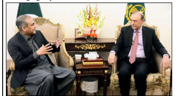
LAHORE: Governor of the State Bank of Pakistan (SBP) Jameel Ahmad called on Punjab Caretaker Chief Minister Mohsin Naqvi.

The CM also highlighted the significance of achieving record cotton production in Punjab, projecting substantial savings of two billion dollars in foreign exchange. The CM pointed out that the rice export from Punjab has exceeded two billion dollars as the provincial government is following a policy of providing comprehensive facilities to investors and industrialists, foreseeing positive ramifications in the form of a thriving stock exchange.