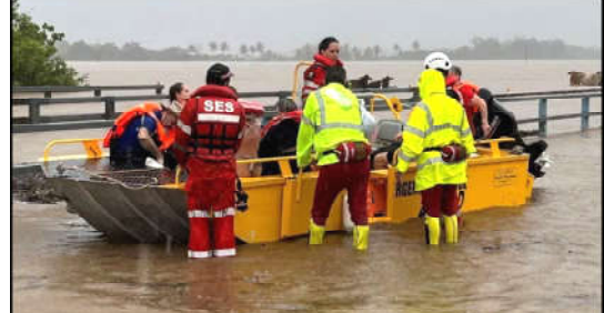
State Emergency Service personnel evacuating people from flood waters in far north Queensland, Australia following heavy rain and flooding from ex-tropical cyclone Jasper.

while warning that temperatures could fluctuate after one of the warmest Octobers in decades. On Monday in Guangdong, where snow is generally limited to the northernmost areas, snowfall blanketed the top of a mountain in a city just 80 km (50 miles) north of the provincial capital Guangzhou by the coast. A low of 8 degrees Celsius (46.4 Fahrenheit) was forecast for Guangzhou, compared to the province's typical early winter temperatures that hover in the double digits.