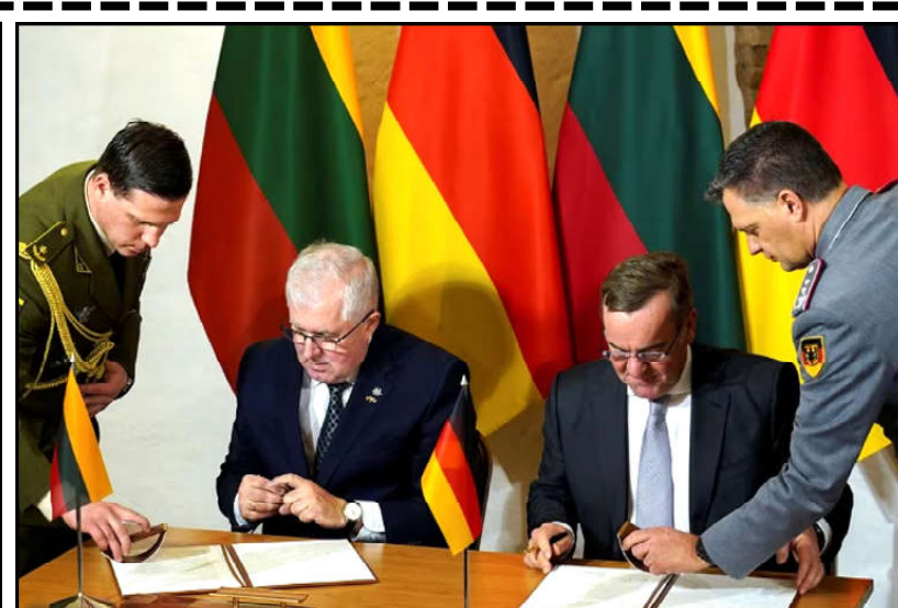
German Defence Minister Boris Pistorius and Lithuanian Defence Minister Arvydas Anuskauskas sign an agreement for further deployment of thousands of German troops to the Baltic country in Vilnius, Lithuania.

remain in north Gaza, after Israeli forces pushed most of the population to the south during the first days of the bombing campaign and ground war that began after the Oct. 7 Hamas attacks on Israel. Gazan health authorities under the Hamas government say that more than 50,000 Palestinians have been injured during the Israeli operation, and 19,000 killed. The WHO said "tens of thousands" of displaced people were using the Al Shifa hospital for shelter, describing severe shortages of safe water and food. Gaza is home to 2.3 million people, most of whom have been displaced from their homes by the offensive.