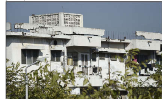
ISLAMABAD: A view of weary condition residential building at sector G-11 in Federal Capital, which may cause any incident any time as needs to attention for concern authority.

robust and growing with sizeable trade in multiple product lines and substantial investments of leading Norwegian companies in Pakistan, including Telenor Group, Scatec ASA and Jotun Paints. Cooperation in the fields of IT & ITES, ship-breaking and ship-recycling has recently emerged with great promise. Pakistan appreciates Norway's steady and generous development assistance in sustainable development including SDGs, climate action and renewable energy and its solidarity during times of natural disasters and calamities. Following last year's floods, Norway provided humanitarian assistance of 227 million NOK to Pakistan. NORPART programme of Norway's development agency Norad has helped advance bilateral academic cooperation with enhanced student mobility and curriculum development programmes.