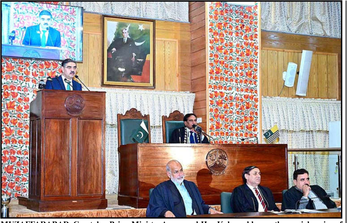
MUZAFFARABAD: Caretaker Prime Minister Anwaar-ul-Haq Kakar addresses the special session of

Vol. XIII No. 345 Reg. mails-B / ID-445 Friday December 15, 2023, Jamadi-us-Sani 01, 1445 A.H. Ph: 2158688, 2158997 Pages 4: Rs. 12