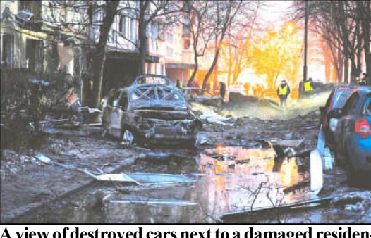
A view of destroyed cars next to a damaged residential building following a Russian missile strike.

The press conference opened with questions about the conflict in Ukraine and highlighted concerns some Russians have about fears of another wave of mobilization. which has proved unpopular. In September 2022 Putin ordered a partial military call-up as he tried to boost citizens have the chance to his forces in Ukraine, sparking protests.