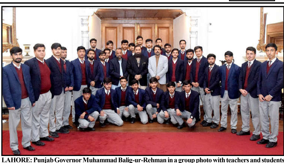
of Balochistan Residential College Loralai.

very important for the development of the