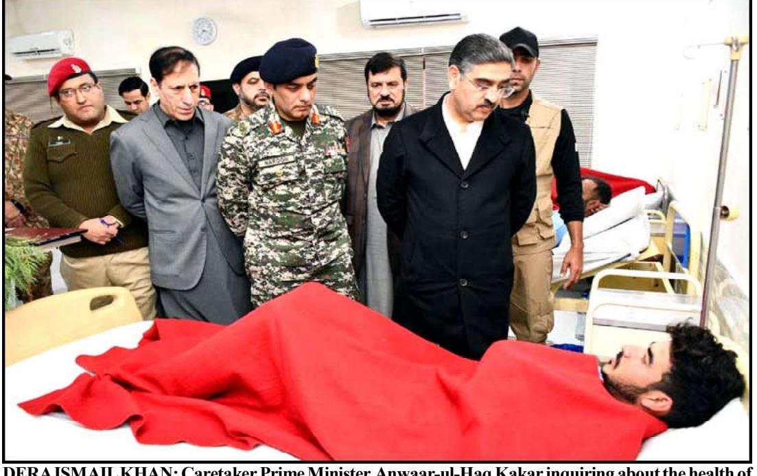
DERA ISMAIL KHAN: Caretaker Prime Minister, Anwaar-ul-Haq Kakar inquiring about the health of those injured in the Dera Ismail Khan blast during his visit of CMH Dera Ismail Khan.

Vol. XIII No. 344 Reg. mails-B / ID-445 Thursday December 14, 2023, Jamadi-ul-Awwal 29, 1445 A.H. Ph: 2158688, 2158997 Pages 4: Rs. 12