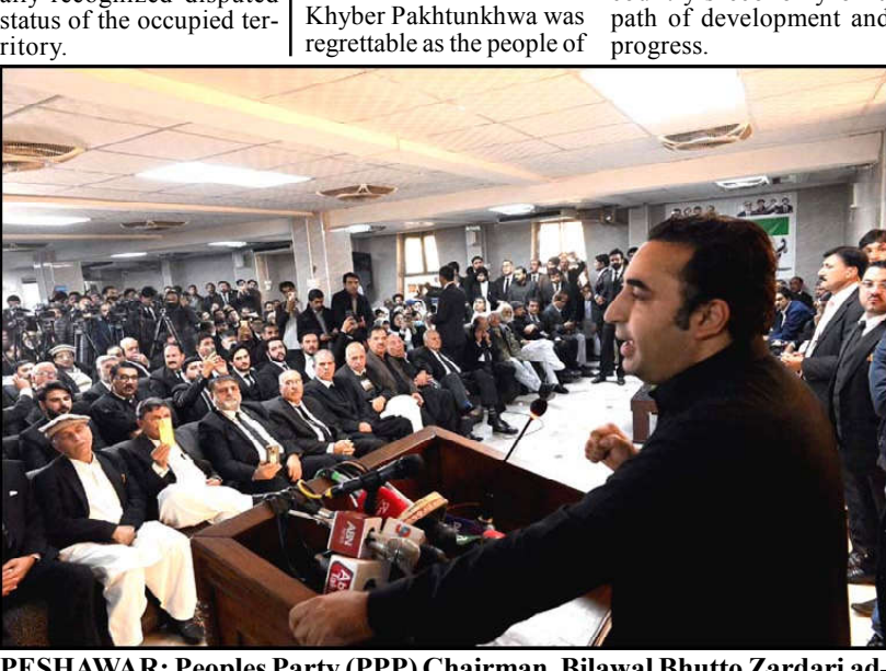
PESHAWAR: Peoples Party (PPP) Chairman, Bilawal Bhutto Zardari addressing to Peshawar High Court Bar Association, in Peshawar.

Meanwhile Bilawal Bhutto Zardari said a vibrant and reinvigorated democratic process was the sole option to put the country's economy on a path of development and progress.