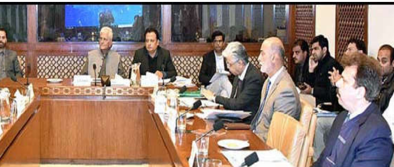
ISLAMABAD: Senator Muhammad Tahir Bizinjo, Chairman Senate Committee on Rules of Procedure and Privileges presiding over a meeting of the committee at Parliament House.