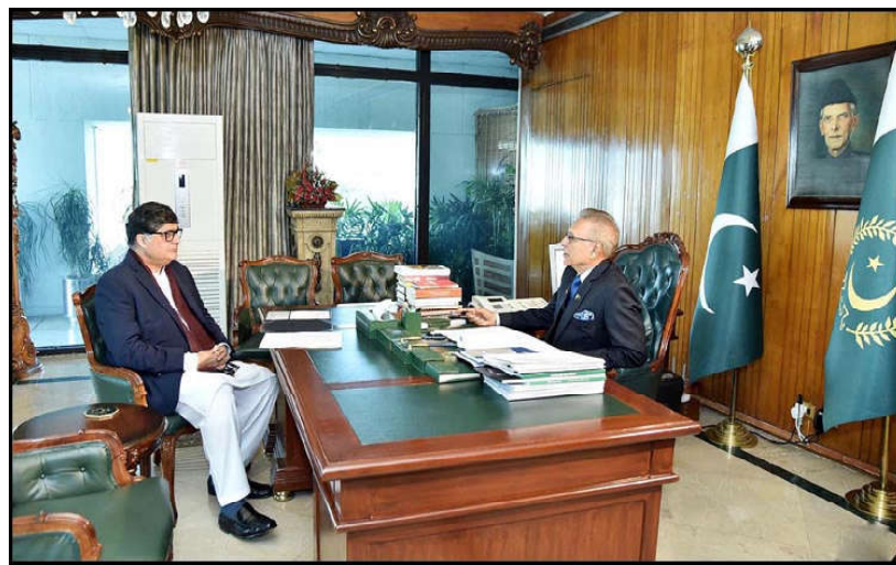
ISLAMABAD: Caretaker Federal Minister for Privatisation, Mr. Fawad Hassan Fawad called on President Dr. Arif Alvi at Aiwan-e-Sadr.