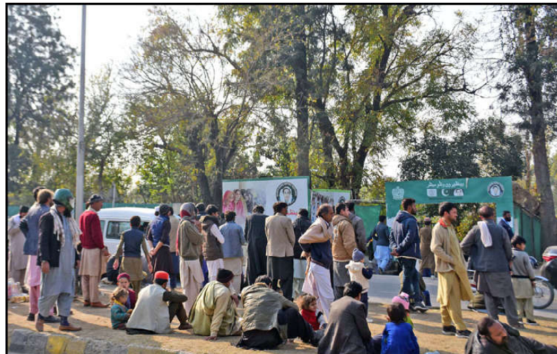
ISLAMABAD: Deserving people gathers outside Benazir Income Support Programme at Sector G-7 as such people are suffering due to lack of any kind of shelter or sitting facility, which is the insult of humanity, needs the attention of concern authority.

ISLAMABAD (APP): Caretaker Minister for Planning, Development and Special Initiatives Muhammad Sami Saeed on Tuesday chaired a meeting of the National Price Monitoring Committee (NPMC). The meeting discussed prices and supply of essential commodities, margin between wholesale and retail prices, and availability of essential items, a news release said. The Chief Statistician of Pakistan Bureau of Statistics (PBS) presented the price movement of 51 essential items collected from the markets of 17 cities. Minister Sami Saeed urged participants to ensure prices' stability across provinces, seeking their oversight of the supply of essential items, available stock levels and the monitoring of pricing mechanisms. He also urged Deputy Commissioners and Assistant Commissioners to strictly employ the Decision Support System (DSS) App developed by the PBS for price monitoring. He emphasized the critical role of administrative oversight and monitoring for maintaining price stability. Moreover, the meeting delved into the prospective utilization by the provinces of remote sensing technology facilitated by SUPARCO for better monitoring of cropped areas and the likely supply situation of essential food items. The minister encouraged the exploration and implementation of remote sensing capabilities to bolster the monitoring and oversight capacities. Sami Saeed emphasized the need for continued vigilance and proactive measures for smoothing supply to address fluctuations in commodity prices.