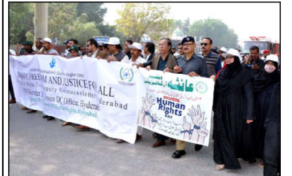
HYDERABAD: Participants are holding awareness walk on the eve of International Human Rights Day organized by Directorate of Human Rights Hyderabad, in Hyderabad.