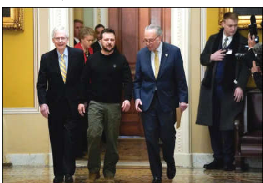
Ukrainian President Volodymyr Zelenskyy walks next to U.S. Senate Majority Leader Chuck Schumer (D-NY) and U.S. Senate Minority Leader Mitch McConnell (R-KY) as he arrives for a meeting with all U.S. senators at the Capitol in Washington, U.S.

The narrow coastal strip has been under a full Israeli blockade since the start of the conflict more than two months ago and the border with Egypt is the only other way out. Most of Gaza's 2.3 million people have been driven from their homes.