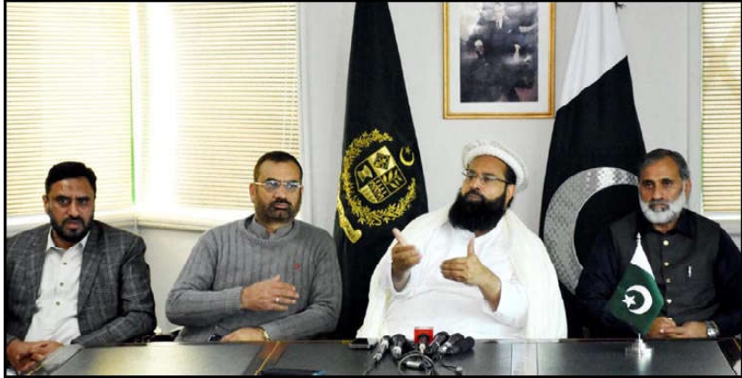
Special Representative to the Prime Minister for Religious Harmony & Islamic Countries and Chairman Pakistan Ulama Council Hafiz Tahir Mahmood Ashrafi addressing a press conference with the representatives of Hajj Operative Association of Pakistan (HOAP) at Islamabad.