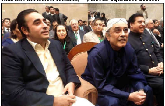
ISLAMABAD: Peoples Party Parliamentarians (PPPP) President, Asif Ali Zardari and PPP Chairman, Bilawal Bhutto Zardari attend live streaming of proceedings on a presidential reference seeking to revisit the controversial death sentence awarded to former Prime Minister Zulfikar Ali Bhutto, at the Supreme Court building in Islamabad.

He said the Marrakesh Treaty would act as an equalizer of opportunity to provide visually challenged persons equitable access.