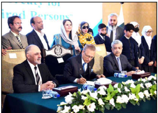
ISLAMABAD: President Dr Arif Alvi signing the Instrument of Accession to the Marrakesh Treaty for the Visually Impaired Persons in a ceremony, at Aiwan-e-Sadr.

He said that the quality of education needs to be improved at all levels including schools, colleges and universities. Madad