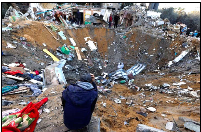
A Palestinian looks on at the site of Israeli strikes on houses amid the ongoing conflict between Israel and the Palestinian Islamist group Hamas, in Rafah in the southern Gaza Strip.