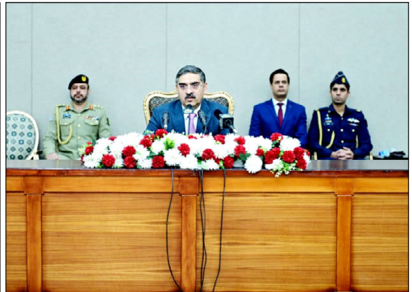
ISLAMABAD: The Caretaker Prime Minister Anwaar-ul-Haq Kakar addresses the 12 th National Balochistan Workshop.

Meanwhile Following the deadly attack that took place in Dera Ismail Khan on Tuesday and claimed by a terrorist group affiliated with the TTP, Pakistan delivered a strong demarche to the Afghan Interim Government calling for the investigation and strict action against the perpetrators.