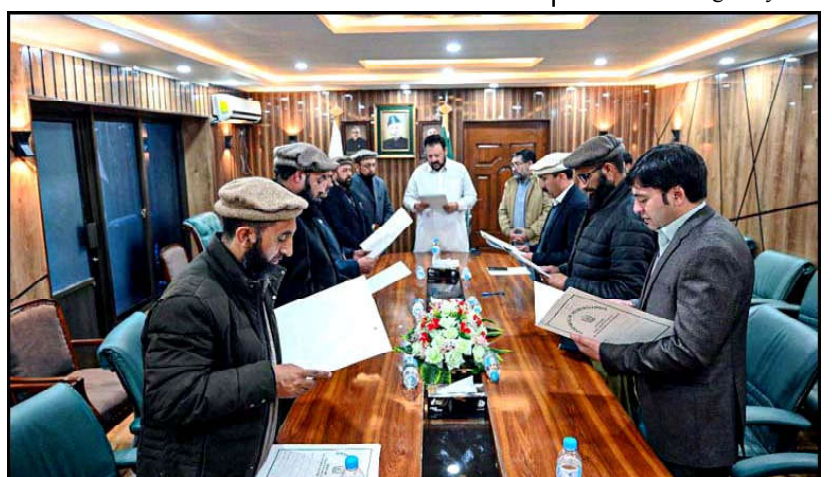
GILGIT: Chief Minister Gilgit-Baltistan Haji Gulber Khan taking oath from the newly elected cabinet members of Professor and Lecturer association at CM Secretariat

ISLAMABAD (INP): Government is considering extending the deadline for submitting Hajj applications under the government scheme as so far, only 28,782 applications have been received. The low turnout of applicants prompted authorities to explore alternative options to encourage more participation. As per data, only 24,446 applications were collected under the official regular scheme on Saturday. The sponsorship scheme, aimed at facilitating pilgrims, received a modest 174 applications on the last day. Ministry of Religious Affairs is considering extending the submission period by 7 to 10 days to boost the number of applications and ensure wider participation in the Hajj pilgrimage. Despite slashing Hajj expenses and introducing short-term Hajj facilities, the number of applications has dropped this year too. The Ministry of Religious Affairs and Interfaith Harmony had to return the quota of almost 20,000 to Saudi Arabia after dropping in Hajj pilgrims last year.