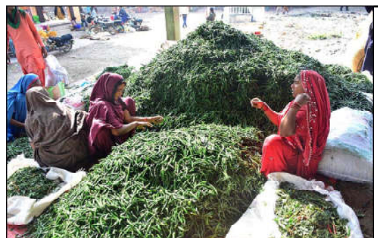
HYDERABAD: Labourer women busy in sorting the good quality green chili at vegetables market.