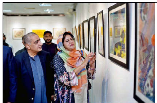
MULTAN: Visitors are taking a keen interest in the calligraphy exhibition on the second day at Punjab Council of Arts.