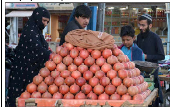
QURTTA: A woman buying seasonal fruit Pomegranate from a roadside vendor.

He said that he sells almonds (without shell) at Rs. 2800 per kg, Walnut (without shell) at Rs. 2200, Pistachio for Rs. 3600, apricot for Rs. 1200, dried figs for Rs. 3200 and Raisin for Rs. 1700, dates Rs. 1200, Afghani Rewari for Rs. 1200 and Cashews for Rs. 3600.