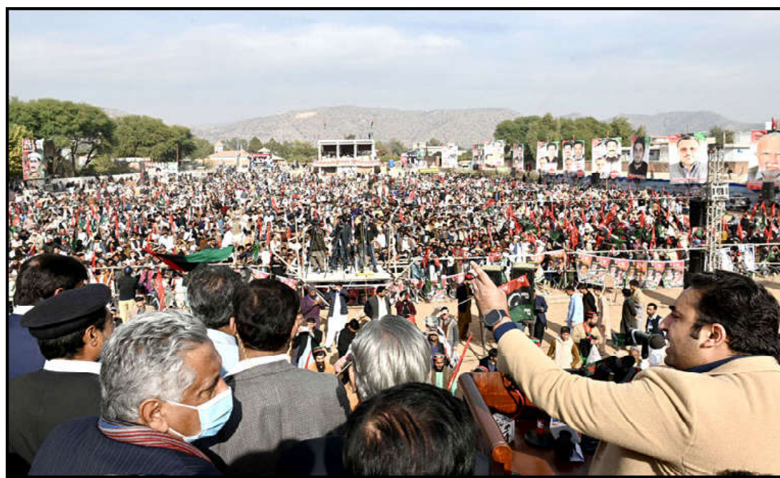
KOHAT: Chairman Pakistan People's Party Bilawal Bhutto Zardari addressing to workers convention at Captain Zahoorul Islam Shaheed Football Stadium Babri Banda.

of KP and Balochistan due to the security situation. Similarly, JUI-F chief Fazlur Rehman also raised questions on the feasibility of holding elections amid a "deteriorating" security situation. Earlier this week, caretaker Interior Minister Sarfraz Ahmed Bugti, while emphasising the government's readiness to ensure peaceful general elections, acknowledged the terrorist threats faced by political leaders in the run-up to the polls, highlighting a general threat to political figures, with a specific alert for the JUI-F chief.