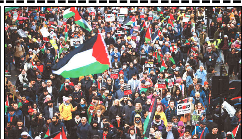
Demonstrators wave flags and carry placards while calling for a ceasefire in Gaza during the 'National March for Palestine' in central London.