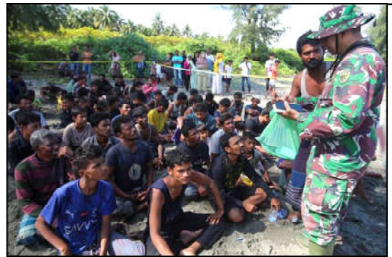
Rohingya Muslim men are inspected by an Indonesian military officer, following their arrival in Blang Raya, Pidie, Aceh province, Indonesia.