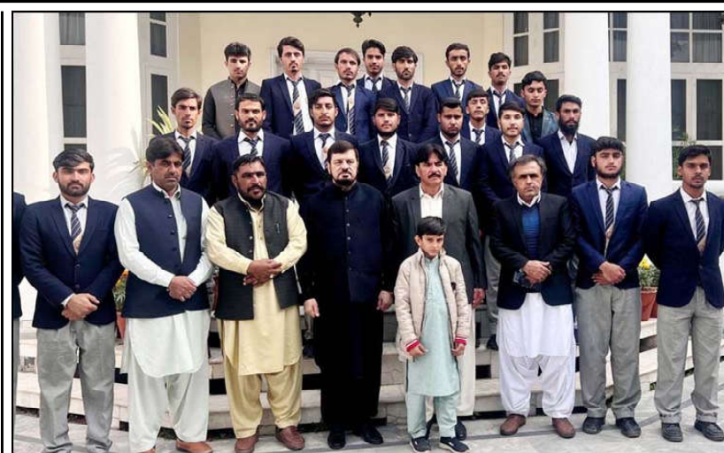
PESHAWAR: A delegation of teachers and students from Balochistan Residential College Zhob in a group photo with Khyber Pakhtunkhwa Governor Haji Ghulam Ali during their study tour.

Ali Zardari] didn't do so, he remarked – a reference to the interview in which the former president had told a private TV channel that his son [the PPP chairman] was inexperienced. These remarks were in complete contrast to the speeches delivered by Bilawal who has been presenting himself as a prime minister material. "We will reply when Mr Zardari speaks up," he told the gathering, adding that Zardari was used to refute Bilawal regularly. He also advised the PPP to contest elections on the basis of its performance and said it destroyed Sindh during the 15-year-long rule in the province.