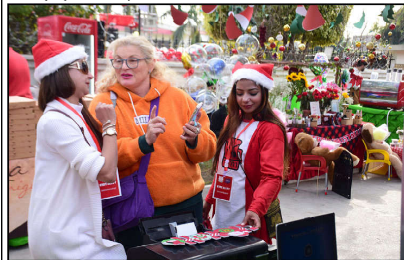
ISLAMABAD: Women are busy buying Christmas decorating items on a stall during Christmas Bazaar in Federal Capital.

The Federal Minister of Education and Professional Training, Madad Ali Sindhi, along with the Ambassador of Saudi Arabia,