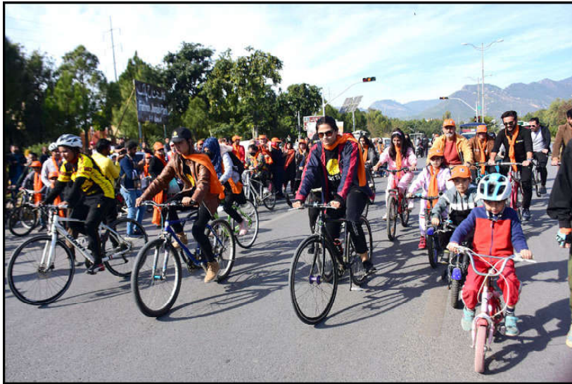
ISLAMABAD: Women take part in a cycle and motorcycle rally at Fatima Jinnah Park in Federal Capital, titled "Run or Walk to Support Campaign Invest to Prevent Violence against Women and Girls."

documentation and extend their full cooperation to on-duty personnel.