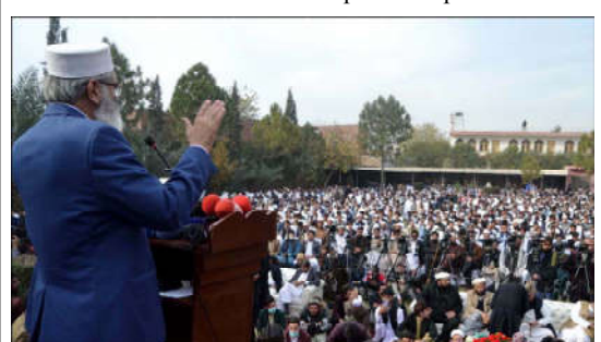
PESHAWAR: Jamaat-e-Islami (JI) Chief, Siraj-ul-Haq addresses to his supporters during public gathering meeting held in Peshawar.

With the will of the Almighty, the elections will take place on Thursday, February 8, 2024," said the minister while talking to a private media channel on a TV talk show. The Election Commission of Pakistan (ECP) would issue the general election schedule, he said, adding all political parties would be given 54 days under the constitution and law for electioneering. To a query, he said the courts were dispensing justice to everyone despite questions raised by a handful of people. Accountability should be done across the board, the minister said. "The history suggests that some of the governments could not complete its democratic terms," he said, adding the case hearing for former prime minister