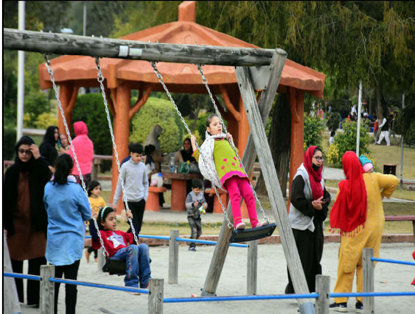
ISLAMABAD: Children's are enjoying Sunday Holiday at Japanese Park in the Federal Capital.