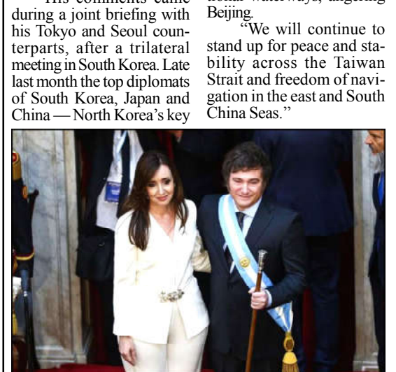
Argentina's new Vice President Victoria Villarruel and Argentina's President Javier Milei embrace during their swearing-in ceremony at the National Congress, in Buenos Aires, Argentina.

ally and Washington's rival — reaffirmed the need to hold a trilateral summit at the "earliest" possible time. The United States and its Western allies have increased "freedom of navigation" crossings by naval vessels in both the Taiwan Strait and the South China Sea, to reinforce that both are international waterways, angering Beijing. "We will continue to stand up for peace and stability across the Taiwan Strait and freedom of navigation in the east and South China Seas."