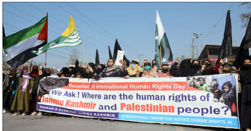
MUZAFFRABAD: Activists of Pasban-e-Hurriyat shouting slogans, to express their solidarity with Palestinians and Kashmir's during a protest rally on the eve of Human Rights Day, at Azadi Chowk.

KP amid security threat alerts. "But [...] our workers say they are neither scared nor they would surrender before terrorism." INP adds: Pakistan People's Party (PPP) Chairman Bilawal Bhutto Zardari has accused the Sharif family of attempting to buy the national airline, Pakistan International Airlines (PIA), instead of selling it. Addressing a public meeting in Lower Dir on Sunday, Bilawal said, "I have come to know that they are trying to buy PIA instead of selling it. I want to tell that we will not let Mian Sahib (Shehbaz Sharif) to buy PIA."