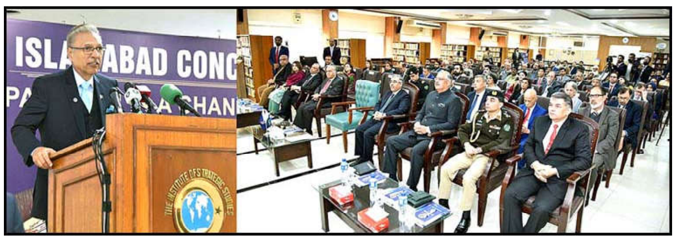
ISLAMABAD: President Dr Arif Alvi addressing the inaugural session of the Islamabad Conclave 2023 titled "Pakistan in a changing world", at the Institute of Strategic Studies.

Vol. XIII No. 338 Reg. mails-B / ID-445 Thursday December 07, 2023, Jamadi-ul-Awwal 22, 1445 A.H. Ph: 2158688, 2158997 Pages 4: Rs. 12