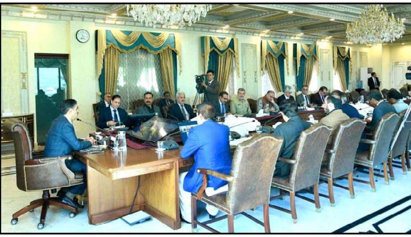
ISLAMABAD: Caretaker Prime Minister Anwaar-ul-Haq Kakar chairs a meeting on Task Force of Polio Eradication.

About the disappearances and resurfacing of PTI leaders, the prime minister said such people went into hiding, fearing arrest for their involvement in attacks on state institu-Imran Khan's popularity tions on May 9.