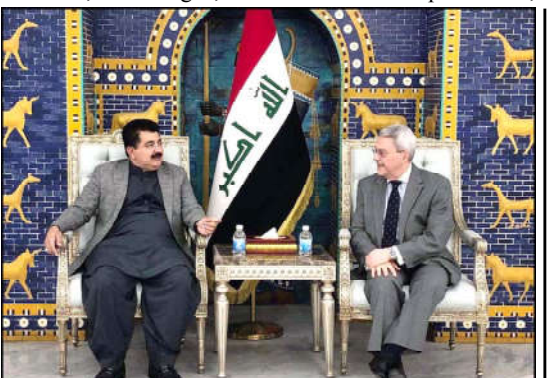
BAGHDAD: Chairman Senate, Muhammad Sadiq Sanjrani of Pakistan being received by Iraqi Deputy Foreign Minister, Mohammed Hussein Mohammed Bahr-Aluloom along with a delegation at state lounge on his arrival at Baghdad.

Labelling the current conflict as a grand defensive Jihad rooted in pure Islam,