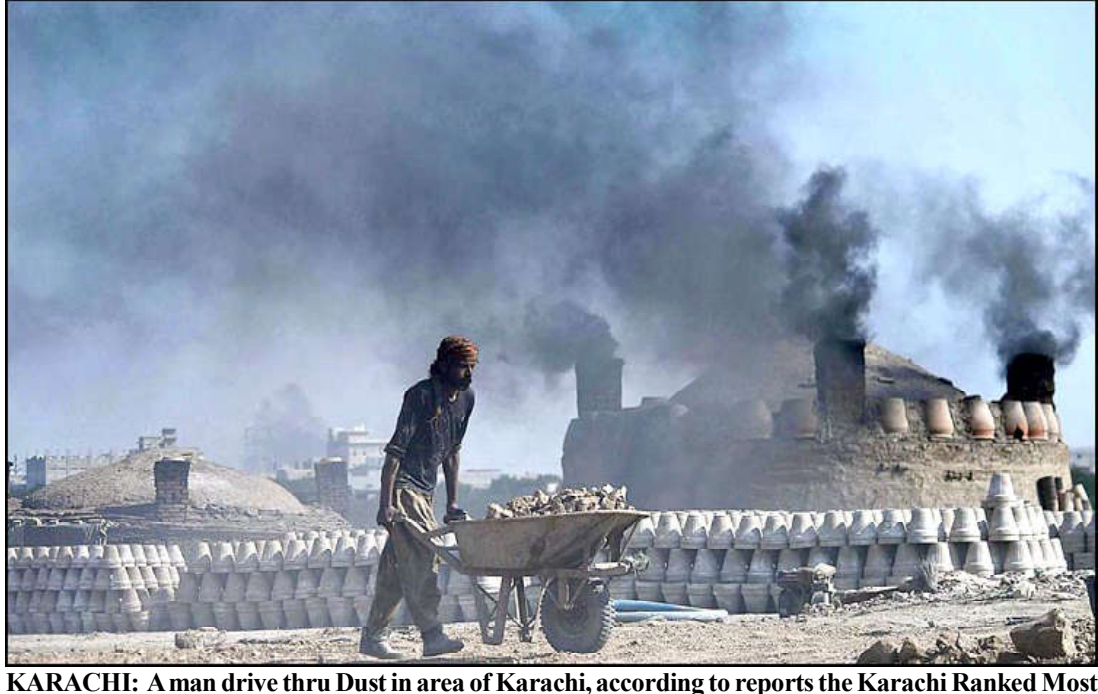
Polluted city in the world in term of air quality, The various forms of pollution have increased at Karachi which has caused widespread environmental and health problems.

institutions on various see that international companies in electrical vehicles and artificial intelligence are bringing their expertise and technology to Pakistan, which will help us accelerate the adoption of these technologies in our country and create new opportunities for our citizens. Governor Punjab said that the expo is a testament to the power of innovation collaboration and shows that when government.