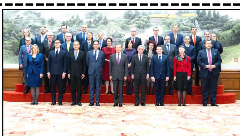
BEIJING: Chinese Foreign Minister Wang Yi in a group photo with Ambassadors of European Union and its member countries.