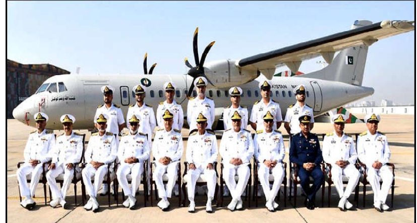
KARACHI: Group photo of Chief of the Naval Staff Admiral Naveed Ashraf with officers of naval aviation at the induction ceremony of 5th ATR 75 in Pakistan Navy Aviation Fleet.

He underlined the significance of strong maritime defence for Pakistan and reiterated that the induction of modern aircraft will enhance Pakistan Navy's capability of safeguarding maritime frontiers.