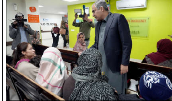
LAHORE: Caretaker Chief Minister Punjab Mohsin Naqvi enquiring about medical facilities from mother of under treatment children at Children Emergency during his visit to Mayo Hospital.

Balighur Rehman said that the government is committed to the promotion of healthy activities. He said that the Walled City of Lahore under the leadership of Director General Walled City of Lahore Authority is doing a good job by promoting cultural activities and tourism in Lahore. Governor Punjab said that public private partnership is a successful model in Pakistan, adding that PHA and other institutions can work on various projects through public-private partnership. Governor Punjab said that flowers are one of the beautiful and priceless gifts of nature.