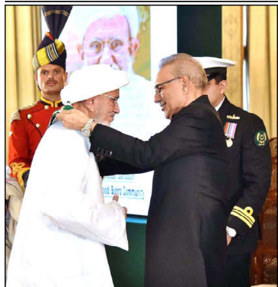
ISLAMABAD: President Dr. Arif Alvi conferring the award of Nishan-i-Pakistan upon Dr. Syedna Mufaddal Saifuddin, Head of the Dawoodi Bohra community at a special investiture ceremony held at Aiwan-e-Sadr.