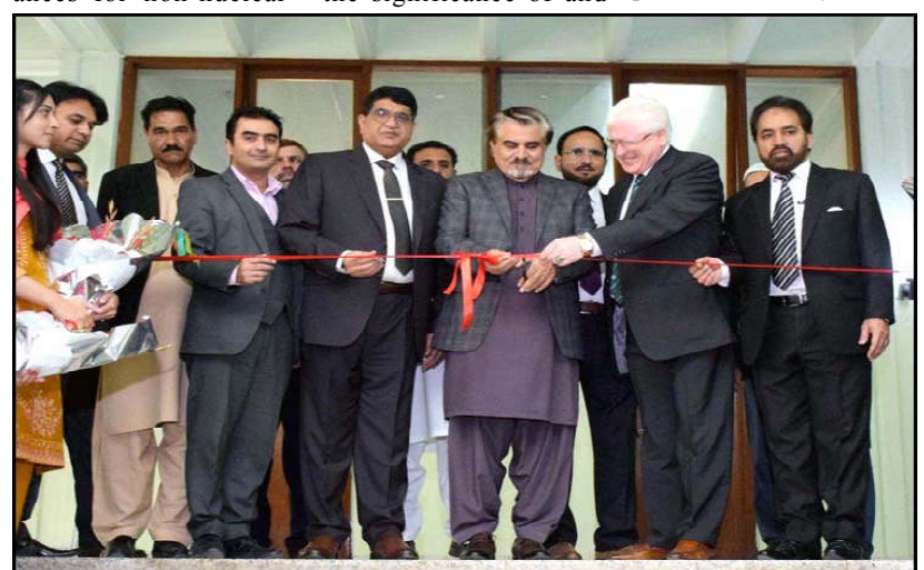
ISLAMABAD: Federal Minister for National Heritage and Culture, Jamal Shah inaugurating International Sirah Exhibition on sideline of Pak-Saudi International Conference on Sirah, Civic Sense and Tolerance at IUI, Faisal Masjid Campus.

Rescue teams rushed to the scene and shifted the