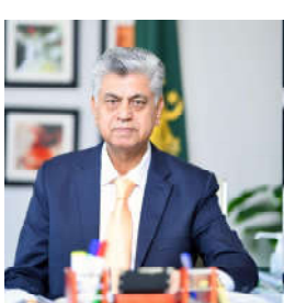
Delivering his speech at an event organised to educate children about the harmful impacts of smoking, he said like environmental destruction, smoking was also a threat to human lives.

ISLAMABAD (APP): Caretaker Federal Minister for Information, Broadcasting and Parliamentary Affairs Murtaza Solangi on Tuesday said tobacco smoking was not an addiction rather it was a death pill and a threat to human lives at the global level.