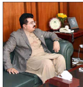
Chairman Sanjrani said that the ties between Pakistan and Iraq were rooted in religion, brotherhood, Islamic culture, and mutual

He said that Pakistan attached great importance to the long-standing brotherly relations with Iraq. In the meeting, there was also a detailed discussion regarding the further enhancement of bilateral trade.