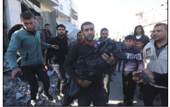
GAZA: A man carrying dead body of a child who martyred during Israeli attack.

Wenbin said on Tuesday when asked if China would now recognise the Taliban government. "We hope that Afghanistan will further respond to the expectations of the international community, build an open and inclusive political structure (and) implement moderate and stable domestic and foreign policies," he said. Wang also said China urged Kabul to "resolutely combat all types of terrorist forces, live in harmony with all countries around the world, especially neighbouring countries, and integrate with the international community at an early date".