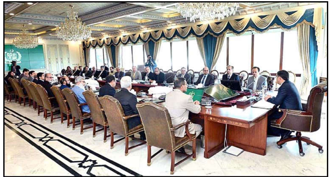
ISLAMABAD: Caretaker Prime Minister Anwaar-ul-Haq Kakar chairs a meeting of the Taskforce for Strategic Reforms in Medical Education and Patient Care

The prime minister was talking to the Spiritual leader of the Dawoodi Bohra community, Dr Syedna Mufaddal Saifuddin who led an eight-member delegation here at the PM House. PM Kakar felicitated Dr Saifuddin on being awarded the Nishan-e-Pakistan in recognition to his services for the country.