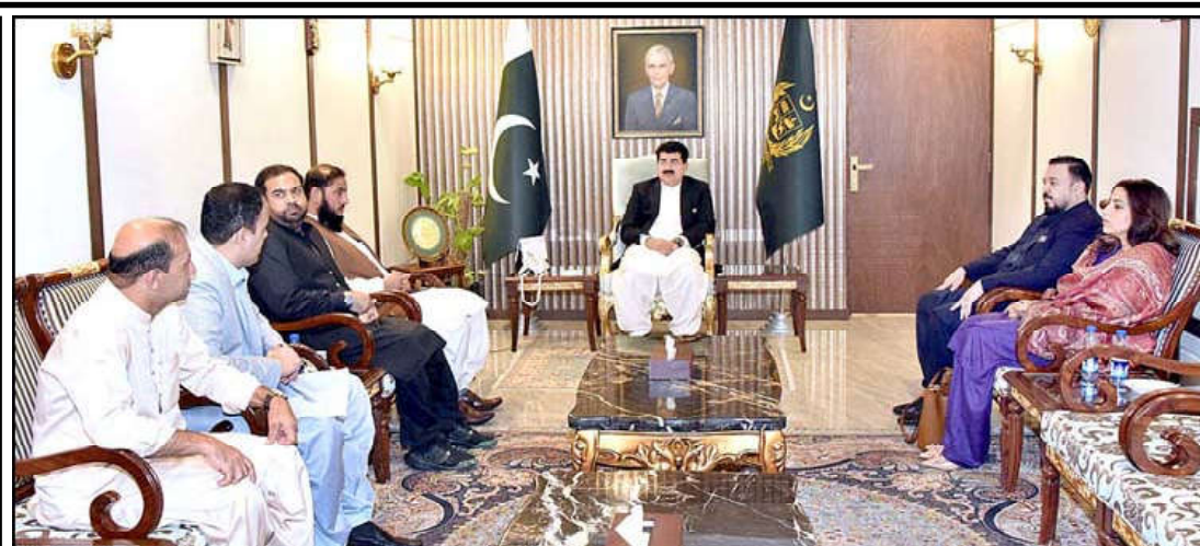
ISLAMABAD: A delegation of Gwadar Chamber of Commerce and Industries (GCC) calling on Chairman Senate, Muhammad Sadiq Sanjrani, at the Parliament House.

increased by 19.57 percent by going up from $2,729 million last year to $3,263 million during the first four months of current fiscal year. Based on the figures, the services' trade deficit increased by 116.66 percent during the period under review by going up from $390 million last year to $847 million this year. Meanwhile, on year on year (YoY) basis, the services' exports from the country increased by 5.63 percent by going up from $621.07 million in October.