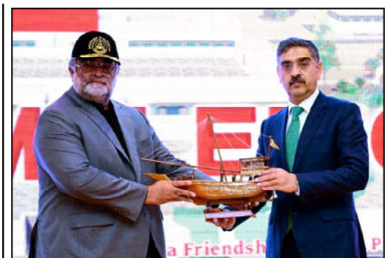
GWADAR: Caretaker Chief Minister Balochistan Mir Ali Mardan Khan Domki presenting souvenir to Caretaker Prime Minister Anwarul Haq Kakar

ISLAMABAD (Online): Supreme Court Justice Mazahar Akbar Naqi has submitted a reply to the notice of Registrar Supreme Court on the matter of complaint in the Supreme Judicial Council. Justice Mazahar Naqi also sent the copy of the reply to the 3-member committee of the Supreme Court, in which it has been said that the registrar should not have the authority to follow the case or not. Registrar's notice has no constitutional or legal status. He said that I had filed two constitutional petitions in the Supreme Court on November 20 and 30 but my petitions have not been numbered so far. Justice Mazahar Naqi said that a miscellaneous application was also filed to set the constitutional petitions early but the case was not filed. Not setting the constitutional petitions is a violation of the Practice and Procedure Law. These constitutional petitions should be placed before a 3-member committee and both my constitutional petitions should be fixed for hearing.