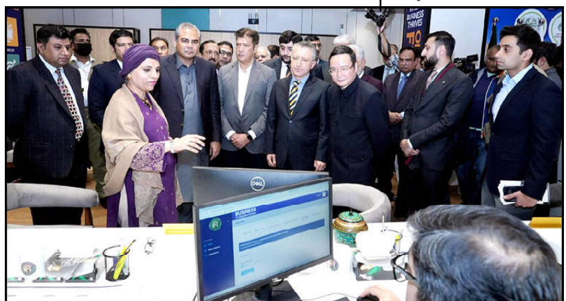
LAHORE: Caretaker Punjab Chief Minister Mohsin Naqvi being briefed after inaugurating a Business Facilitation Center in Lahore for convenience of investors.