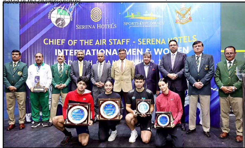
ISLAMABAD: Group photo of winners holding prizes along with the organizers during CAS-Serena Hotels International Squash Championship for Men & Women-2023 organized by Pakistan Squash Federation in collaboration with PAF & Serena Hotels at Mushaf Squash Complex.

A group of 23 world-ranking men and women players from Malaysia, Hong Kong, Egypt and Spain participated in the championship.