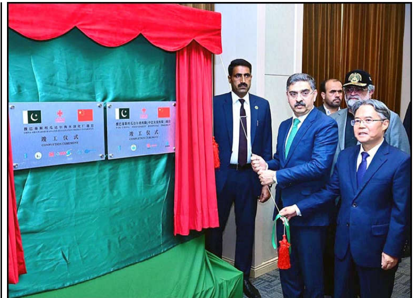
GWADAR: Caretaker Prime Minister Anwaar-ul-Haq Kakar unveils the plaques to inaugurate the completed Pak-China Friendship Hospital Project and the China-Aid Gwadar Seawater Desalination Project.

deployed at polling stations and they are also on patrol. “While the ECP takes all necessary steps to organise an election, [...] it also expects the same commitment from the executive authorities and law enforcement agencies to maintain law and order in the area of the constituencies during the conduct of elections,” the ECP's letter to the interior ministry read. In its bid to prepare for the elections, the ECP had sought a report from all inspector generals of police to determine the availability of police personnel for the polls. Responding to the ECP's request, IGP from all the provinces and the capital said that they did not have enough personnel. During the elections, the security situation is a grave concern for the authorities concerned and to ensure that nothing goes south, law enforcers are