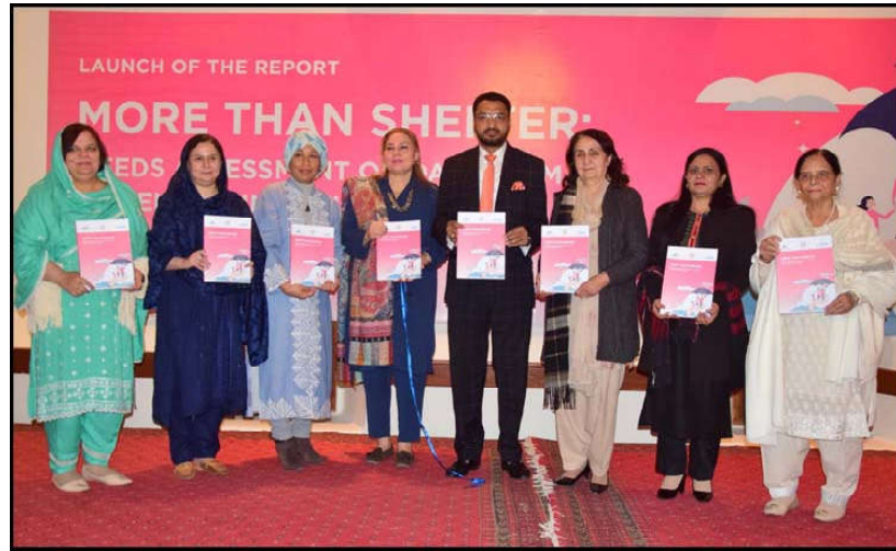
QUETTA: Former Senator Roshan Khurshid Bharucha, Chairperson NCHR Rabia Jaweria Agha showing report on conditions of shelter homes for women from National Commission for Human Rights and UN Women to Caretaker Federal Minister Khalil George.

Parents and teachers are encouraged to collaborate in preventing youth from falling victim to drugs.